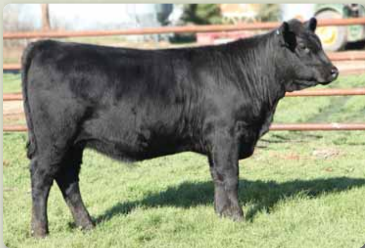
Lot 2 - Nu-Horizon Countess 628D

A powerful broody heifer calf out of our esteemed Duchess line. Stout made, square hipped, loads of hair, a strong footed female that will catch your attention at the sale. Out of a moderate framed GDAR Game Day dam, this female has the power with the maternal numbers to compliment anyone's program.