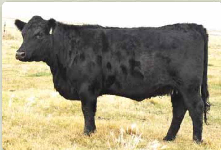
Lot 40 - Midnite Oil Miners Girl 3C

Exposed to Midnite Oil 8808105B April 23rd - August 1st.