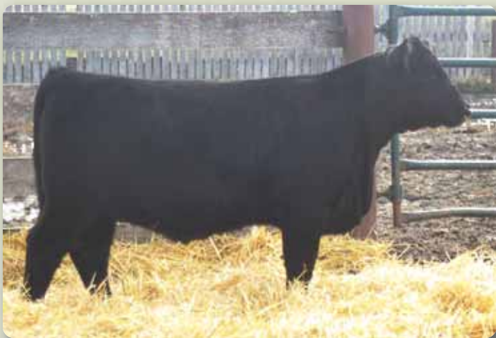
Lot 8 - FRL Bride 627D

If you're looking for femininity, perfect feet, and long bodied, look no further. Another Duchess daughter out of a heavy milking Image Maker cow, and beefed up with performance on her topside from the very well-known Connealy Consensus, this female will grow up to be a great female. The Significant cattle have worked well for us and add a nice combination of performance while maintaining the maternal and calving ease traits that we have focused very heavily on.