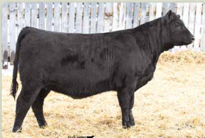
Lot 3 - Nessel Lake Lass 171D

We bought 628D's dam from the Frontline Sale two years ago from Valley Lodge. The mating of her with our South Dakota bull we purchased from Mohnen Angus has proven to be an excellent one. She is a smooth fronted, long spined heifer with a good hair coat and should bring some performance with her excellent EPDs. The South Dakota calves stand with presence in the field right from birth. The Countess family has been one of Valley Lodge's top producing cow families in their herd. When she was selected we felt it was an opportunity to show these females work sold out of the Frontline Sale.