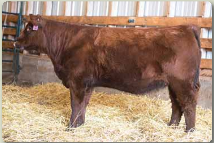
Lot 17 - Red Blake's Ms Stryk 39D

Colossus has really stamped his progeny in their kind, deep red, fancy heifers that make very appealing cows. The dam, a Branded Beef daughter adds to the mix with some power and maternal strength that will make this heifer a no miss.