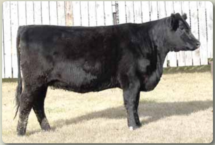
LOT 45 - MFCC Viking Duchess 122C

AI bred to SAV Final Answer 0035 on April 11, 2016. Pasture exposed to Red S – Companion Ribeye 103C from April 25 - June 21, 2016. Ultrasound Favorable to AI. Expected due date January 21, 2017.