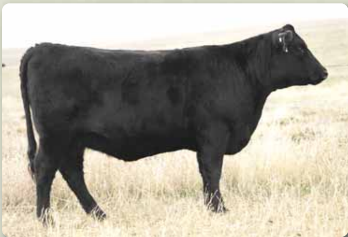
LOT 43 - Sunny Grove Lass 10C

AI bred to HF Progress April 24/2016 - due January 30/2017.