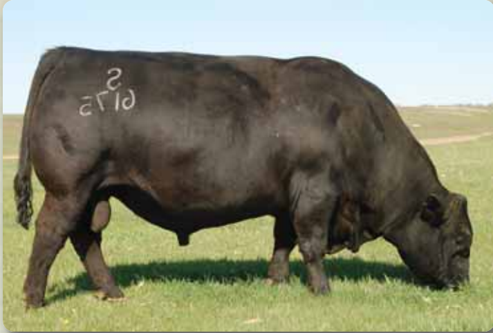
S Chisum 6175

All semen FOB Windy Willows Farms or Southwest Genetics at Swift Current - See Collin for details