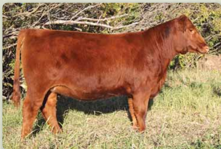
Lot 15 - Red T&amp;S Sage 36D

A dark red, fancy heifer calf who is long bodied and clean fronted with great neck extension. She is off T-K Valentine 20B, a Hamco Packer son, we purchased for his calving ease and exceptional growth which all his calves definitely exhibit. Her dam is an exceptional Chateau 744 daughter that has a great calf every year. We have retained every female she has had in our herd and sold every bull for breeding including the top bull in the pen last year. A grandam was an Elite Dam producing until she was 14, With milk EPD of +23 and BW -4.8 there should be no guess work in this female. Halter broke.