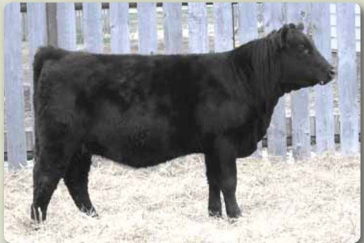
Lot 5 - Triple H Lady Hoover 100D

This late March calf fits right in with our February calves. Lots of rib and tons of style. A unique pedigree (Upward x Hoover Dam) and her dam is a tank! Expect good things from this female.