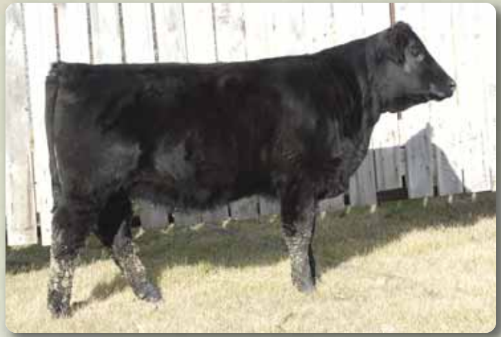
Lot 4 - MFCC Zen Master Ruby 15D

If you are looking for a sweet, fancy well put together heifer with a quiet disposition, look no further. This calf would make a competitive show heifer and an excellent replacement heifer. She is a very deep, wide and structurally sound calf and based on her performance so far and her pedigree we are expecting her to become a great cow. This is our only Belvin Zen Master daughter we have on offer this year and it was not an easy decision to let her go.