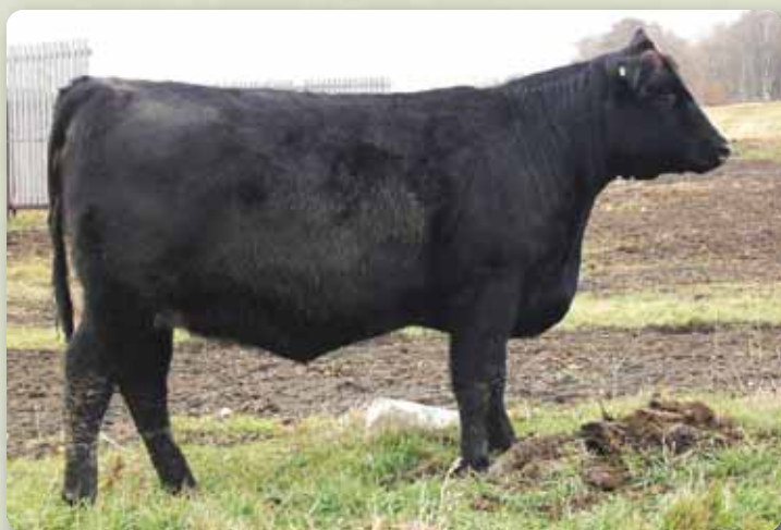
Lot 25 - Valley Lodge Countess 27C

Exposed to Peak Dot Easy Decision 114C from April 15 to August 10.