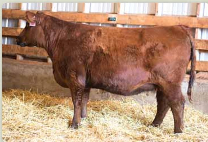
Lot 35 - Red Blake's Ms Advance 101C

Exposed to Red Howe Tempt 24B April 5th- July 17th. Ultrasound calls them due mid February.