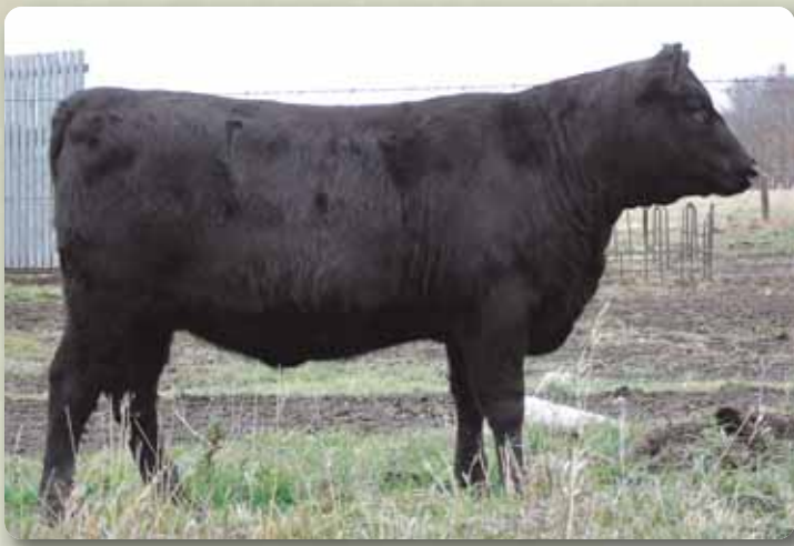
Lot 7 - Lodge Duchess 14D