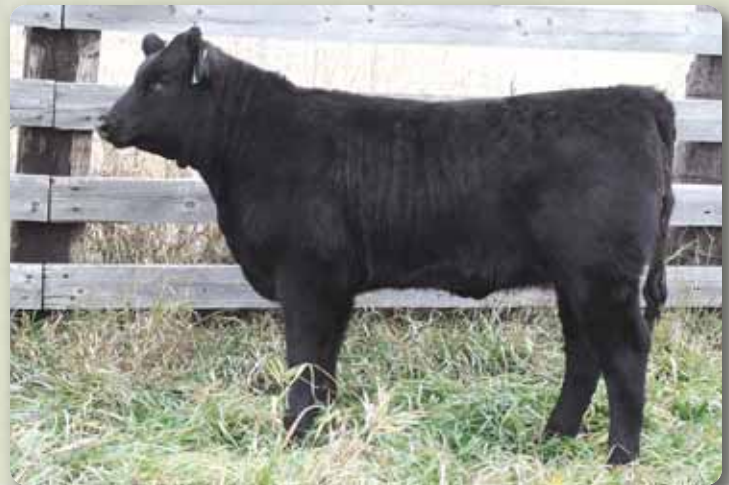
Lot 22 - Bronyx Pride 25D

25D is only an April calf. She is very correct & feminine. The Butler calves have lots of natural thickness, muscle & style. Lots of big producing cows in this pedigree.