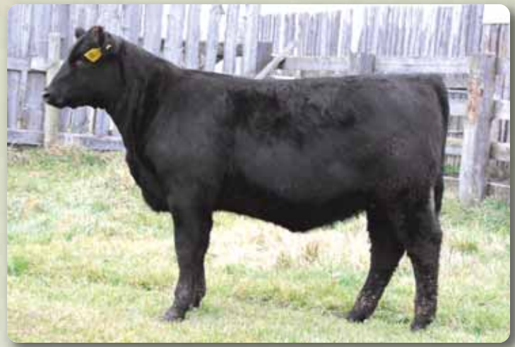
Lot 21 - Lodge Countess 13D

This was our first year trying out EXAR Western, an outcross line for us that brought nice depth of rib, great hair coat, clean fronted cattle with a bit more performance than we often find in maternal AI sires. A half-sister to the second high-selling bull at the 2016 Triple A Bull sale that went to Doug Mackie at Chaplin.