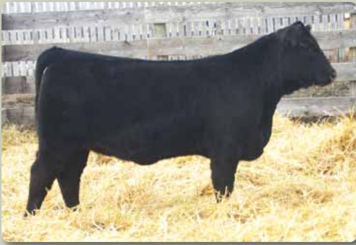
Lot 18 - FRL Judy 648D

This is our first set of calves out of the Addiction bull and we are very, very excited. They are deep bodied tanks, that have lots of style and great structure. We are counting on great things in the future from this sire line. The Missie cow line which we admired a lot at Geis Angus Farm and the dam hasn't let us down on little bit. Bred to be very maternal with Superevent and Kodiak on the bottom side of this paperwork totally compliments this fancy, stout heifer.