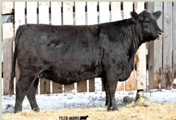
Lot 27 - Nesset Lake Lass 107C

Preg tested at 145 days on September 16/2016 (safe to AI date)