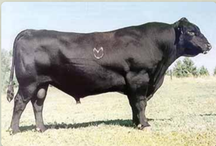
B/R New Design 036

Here is another rare opportunity! Gladiator daughters are without equal and were largely responsible for the record setting Soo Line Red dispersal a few years ago. Gladiator will also add marbling and he can be used as a calving ease sire on heifers. Selling 2 lots of 5 doses each.