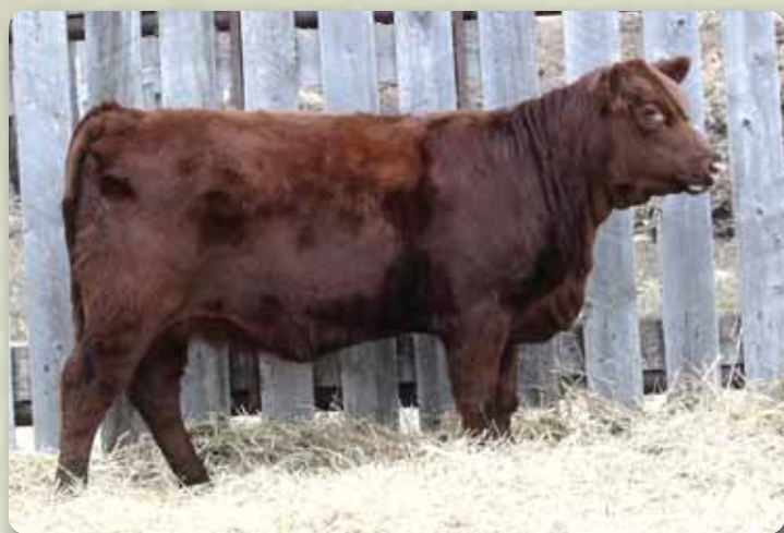
Lot 13 - Red Triple H Hanna 40D

Smooth fronted with a great phenotype, Hanna 40D is the right kind. Her sire, Governor 75Z, goes back to Warden 144W and Mulberry 26P. Her Dam is a "no miss" cow that consistently produces quality offspring.