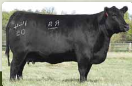
Remington Lady Lawn 144R Grandam of Lot 6

BW: 84 205D: 658 BLACK EPDs ▶ BW: +2.3 WW: +26 YW: +40 Milk: +11 TM: +23