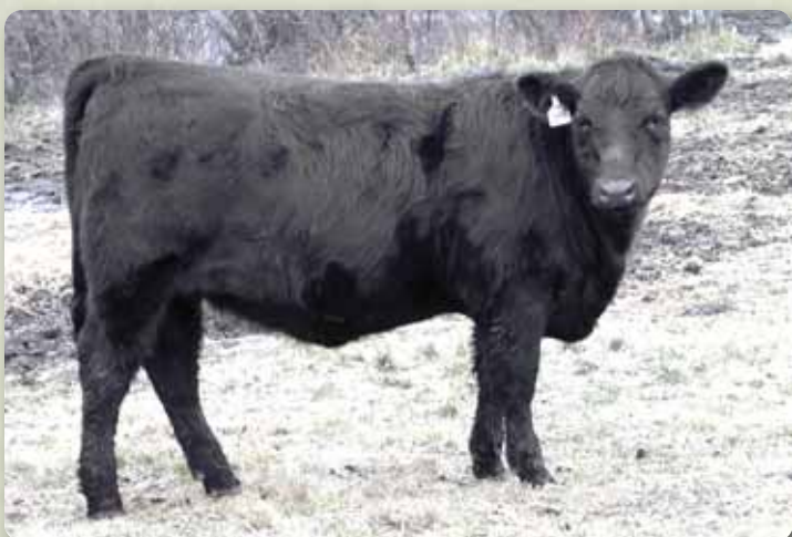
Lot 9 - J.D. Blackcap 605D

A very nice female we are offering out of our outcross sensation Lookout Zorro 80Z! He has done nothing but impress us all along, his sons have averaged over $8000, admired for their low birth and strong growth with a lot of hair. We have calved his first set of daughters this spring and we are more than impressed. Don't worry about the +13 Milk number they milk well!