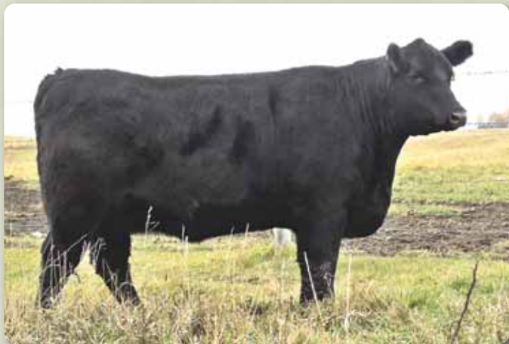
LOT 49 - Lodge Duchess 25C

We have a heifer that put together a foundation cow family for us a couple of times, HA Beletta 0219 made her mark in the breed with her many sons that have bred well throughout Western Canada. Beletta's son Centennial which was purchased through the Masterpiece Sale and left a tremendous set of daughters, they are always keepers. Visa was purchased from Merit and left strong performance in his calves with hair and style, our top selling son the last two bull sales have been out of Visa. Exposed to SFL Real McCoy 533 April 18th - June 3rd.