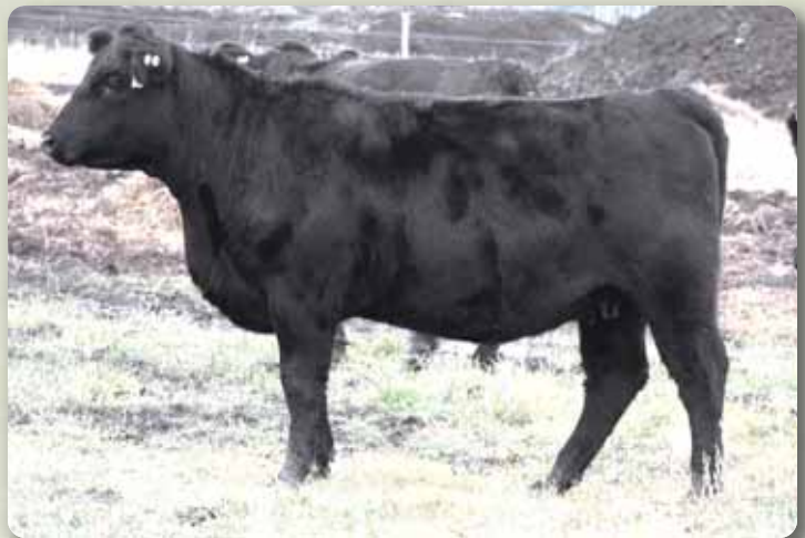
Lot 47 - Midnite Oil Oletta 63C

I think that this late March heifer is bred royally, Net Worth twice, Widespread and Bismarck combines highly maternal sires that are bulletproof. The Oletta cow family is one of the oldest cow families that was one of the major cow families at the Post Office herd. Exposed to Midnite Oil 8808105B April 23rd - August 1st.