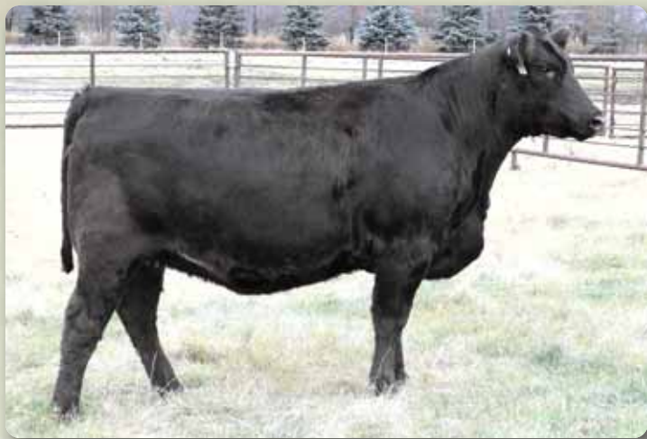
Lot 24 - HiLow Black Lucy 21C