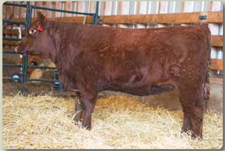
Lot 16 - Red Blake's Copper Classic 100D

A dark red daughter out of our Colossus bull that is long, stylish, powerful and dark red! 100D carries a pedigree that is deep in quality, Finest Tradition is another herdbull that has served our herd very well leaving us with a set of daughters that are balanced, attractive and have excellent udders. Our first time to town at the Frontline sale and we opened up the pen to bring the top end to sell!