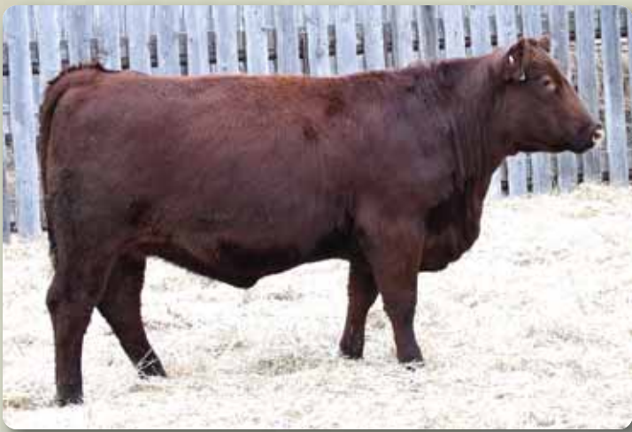
Lot 30 - Red Triple H Sue 17C