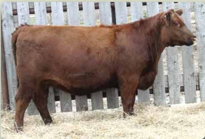
Lot 31 - Red Triple H Divine Lanna 55C

A powerful dark red female with lots of shape and style. Sired by Red T-K Governor 75Z (Warden x Mulberry) and going back to one of the most consistent cow families in our herd, she is a balanced mix of maternal traits and performance. AI'd to Red Soo Line Power Eye 161x on May 7. Pasture exposed to Red Pasquia Hustle 12B (Lazy MC Hustle 18T son) on May 13. Favourable to AI.