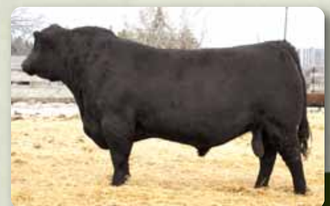
Lookout Zorro 80Z Sire of Lot 44

The Zorro females are excellent and turning out exactly how we hoped they would with excellent udder confirmation, dispositions and brought in good calves this fall. We have experienced a lot of success in marketing the sons of Zorro over the last couple of years. The dam of 538C is typical of the Dynasty daughters, moderate and productive. Outcross pedigree at it's finest! Exposed to SFL Real McCoy 533 April 18th - June 3rd.