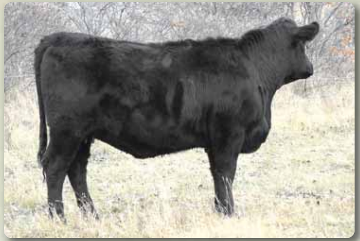
Lot 51 - Midnite Oil Georgina 40C

Our second Eliminator daughter we are selling and she is just like her sister, big ribbed and fancy to see. Coming out of a good Georgina female we purchased from Freyburn, those Georgina's are great females. Black Magic and Alliance round things off on the bottom side! Predictable pedigree. Exposed to Midnite Oil 8808105B April 23rd - August 1st.