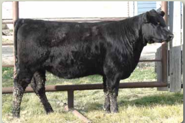
Lot 11 - MFCC Double Vision Kyma 19D

Here is a fancy little heifer that we are proud to offer. Her dam is a great looking moderate framed cow, with a beautiful udder and great feet and has done a fabulous job of raising this heifer. She is a very sweet fronted, long bodied heifer that is structurally correct. All of this combined with her maternal strength will make her a great brood cow.