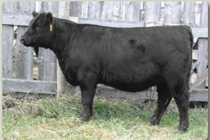
Lot 12 - Valley Lodge Countess 11D

We were fortunate enough to purchase a semen package from Double F Angus from Parkside on Merit Big Dawg and after seeing the calves this spring, immediately tried to buy more semen for the 2016 breeding season but were out of luck due to an injury to the bull which prevented further collection. This will be the only heifer we will offer as we intend to put the rest of her siblings into our herd. Out of Megan's top show female, this calf's dam was a favourite in the stall at Agribition, while her sire was named Reserve Intermediate Champion Angus bull at CWA in 2014. A desirable prospective show female for sure and a limited opportunity to acquire a direct daughter of Big Dawg.