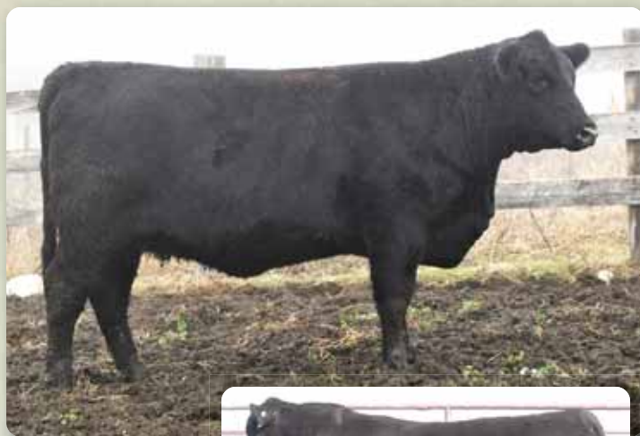
Lot 39 - WWF FP Blackbird 13C

Service: Bred AI on May 8 to Schiefelbein Effective 61, a calving ease sire from Genex with exceptional muscling, capacity and quality. Examined safe by ultrasound.