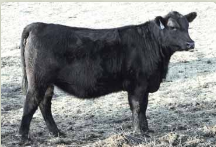
Lot 20 - J.D. Bonnie Lassie 607D

A direct daughter of KMK Alliance, it has been a number of years since there's been a direct daughter for sale out of this bull, semen is almost non existent. Fancy, deep bodied with a great attitude is synonymous with the qualities that he left in his top end producing females. To continue this exciting pedigree we have Final Answer and Rito 616 who have both left their mark on the breed with their breed leading performance and daughters who will anchor a cow herd. Powerful pedigree.