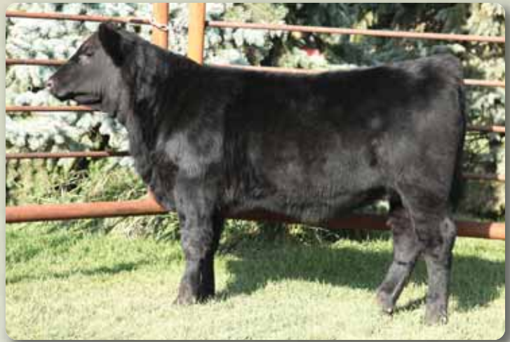
Lot 10 - Nu-Horizon Blossom 672D

This is a well-balanced complete heifer. She has length, style, spring of rib and tons of hair! Our Jock females are uniform and will make great cows. Her dam was purchased from HiLow Angus as a bred heifer. She has been a great cow for us as we have retained two of her calves in our herd and this one was selected for this sale. A granddaughter of hers is selling this year in the Power and Perfection Sale. The longer it took to picture this heifer the less and less we wanted to sell her. Don't miss this chance to purchase a female from this cow!