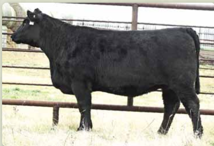
Lot 28 - HiLow Miss Vonda 52C

Exposed to Peak Dot Easy Decision 114C from April 15 to August 10.