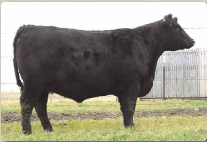
Lot 42 - Valley Lodge Countess 22C