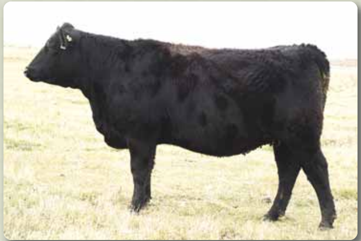
Lot 46 - Midnite Oil Black erica 39C

A daughter of the exciting herdsire we purchased from Blairs.Ag, an Eliminator son out of the great Lady of Peak Dot 566N. Fresh genetics for our herd that are solid and predictable. With a blend of Alliance and Stockman for good measure makes this pedigree rock solid. Exposed to Midnite Oil 8808105B April 23rd - August 1st.