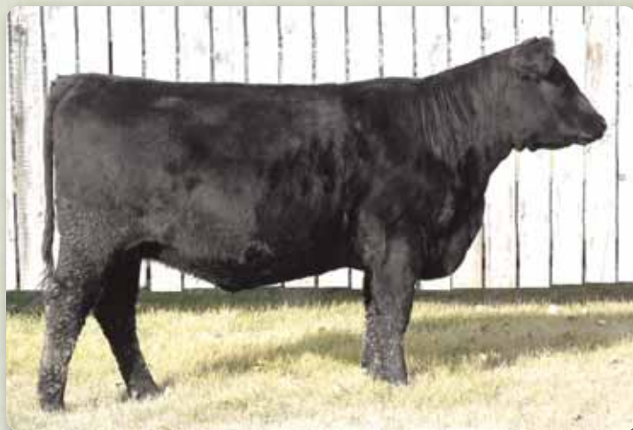
Lot 41 - MFCC Apollo Ruby 108C

Ultrasound Favorable to AI. Expected due date January 21, 2017.