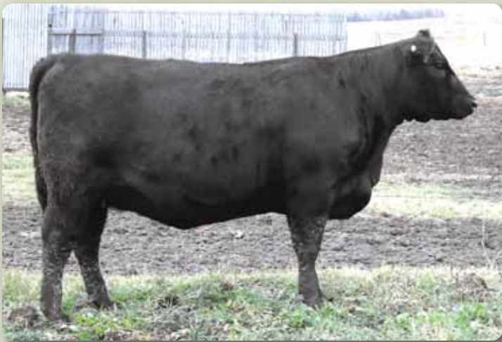
Lot 37 - Lodge Quality Lass 14C

Pasture exposed to Triple H Intuition 14B on May 3. Preg checked to be 4 months along on Oct. 3.