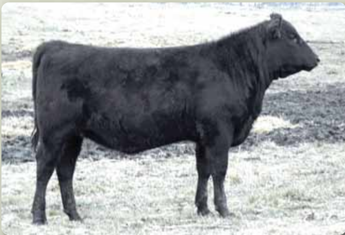
Lot 19 - J.D. Pride 601D

A direct daughter of the HF Tiger 5T bull who has left his mark in a hurry on the Angus breed. Few sires have left the short gestation that he has along with very quiet females and best of all they make tremendous females. The dam's side also traces back to our Lot 9 female, Pendleton and Ultravox are also two sires that have left their footprint in their day as high performing Angus bulls.