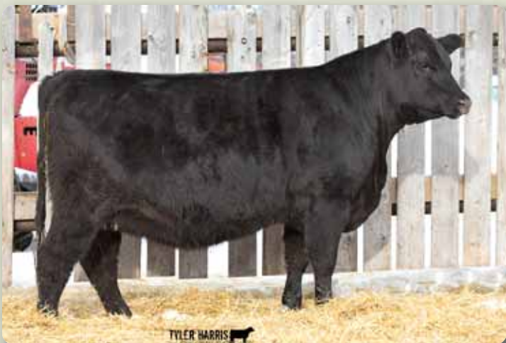
Lot 38 - Nessel Lake Prideta 98C

Bred to our new herd sire Wilbar Foundation 771C May 19/2016 - due February 12/2017.