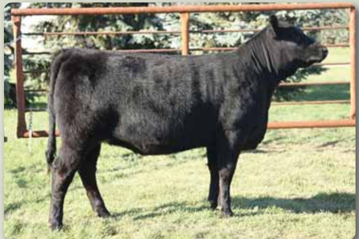
Lot 6 - Sunny Grove Lady Lawn 21D

DLR 21D is a deep bodied attractive heifer with a unique Canadian pedigree combining greats including Dynasty, Tom Boy, Jumbo, and Lady Lawn.