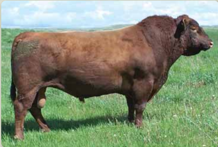
Red Dwajo Gladiator 32L

Chisum has done an outstanding breeding job here in Canada with sale toppers at Windy Willows, Crescent Creek and many others. His sons are correct, beefy and masculine bulls and his daughters have loads of volume. His semen is very rare in Canada, so we have decided to offer our last 7 doses.