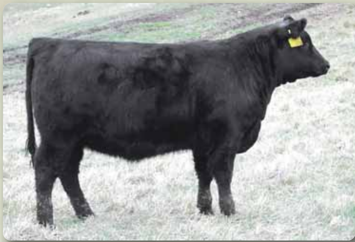
Lot 1 - Valley Lodge Duchess 27D