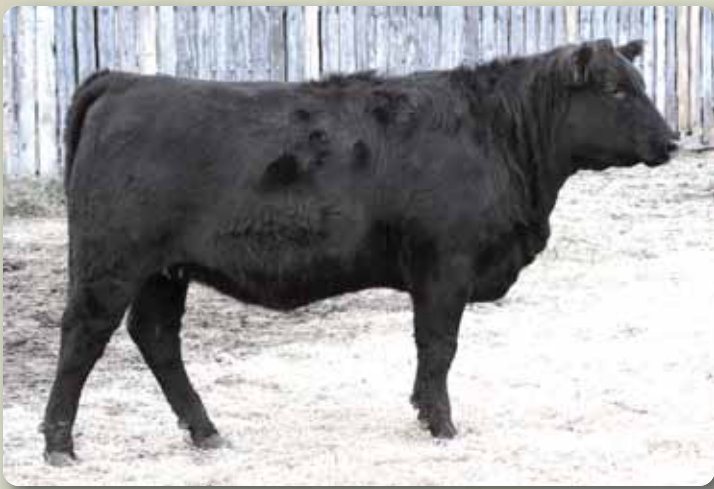
Lot 36 - Triple H Pride 90C