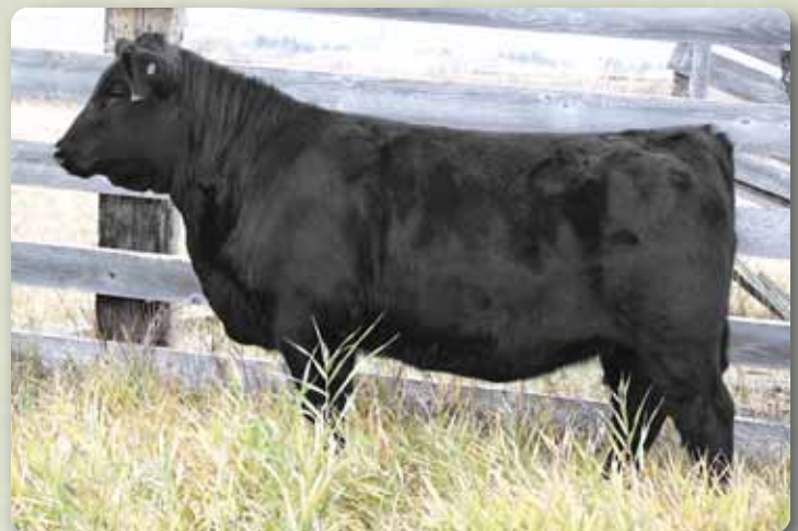
Lot 23 - Bronyx Countess 41D

41D is a powerful cow in the making. Her dam 41X is a long, deep power cow. Her sire Chisum 12Z who we purchased from Crescent Creek Angus consistently sires calves with lots of growth & volume.