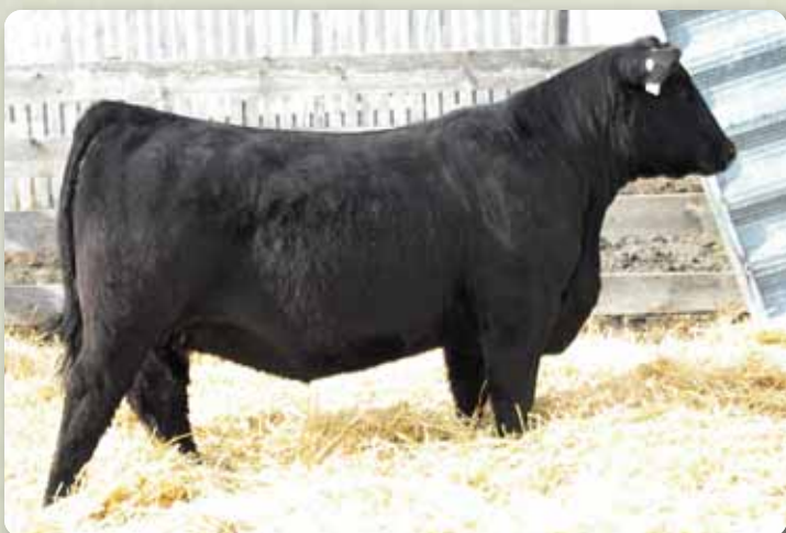
Lot 44 - FRL Countess 538C

AI service is to the exciting calving ease specialist Eathington Sub Zero on April 21st (checked safe) then exposed to HF Tiger 98X May 23 to July 17th.