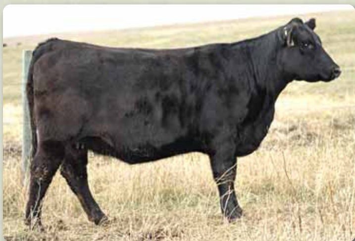
Lot 26 - Sunny Grove Rosebud 2C

A heifer with a very similar package to her 3/4 sister VLCC 22C (Lot 42), this female offers the power in a larger size. Deep fronted, smooth shouldered, and structurally sound. This is a thick female, extreme depth of rib and complementary femininity; keep your eyes out for this one. Note the service to KG Solution. We registered the first KG Solution calves in Canada this year and have plans to use him extensively in 2017 – a very reliable outcross calving ease bull with loads of power. Watch for 2 of his sons at the April 2017 AAA sale in Moose Jaw that we are very excited about. All bred to KG Solution 0018 April 24/2016 - due January 30/2017.