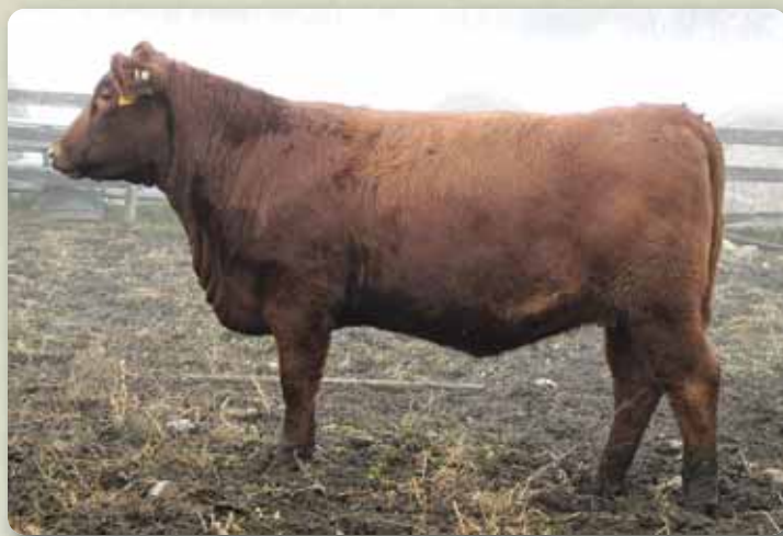
Lot 33 - Red WWF Daisy 113C

Service: Bred AI on May 2 to the very popular calving ease sire, Red Lazy MC CC Detour 2W. Examined safe by ultrasound.