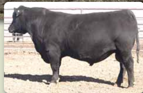
Sire of Lot 39 KG Focal Point 2013