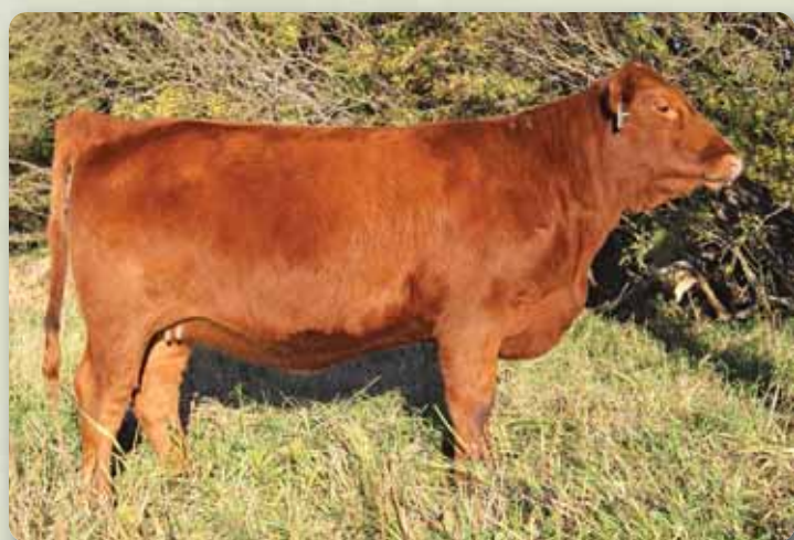
Lot 14 - Red T&amp;S Boom 23D

A fancy, deep bodied, wide topped Ribeye daughter from the top of our pen. Off a never miss All Star female who has only had bull calves that have always been in the top end of the pen. This is her first heifer calf which made it tough to let her go. With the power and predictability of Ribeye combined with All Star this heifer has unlimited potential. Halter broke.