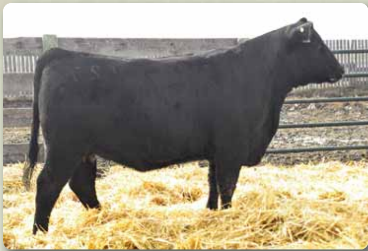
Lot 48 - FRL Beletta 527C