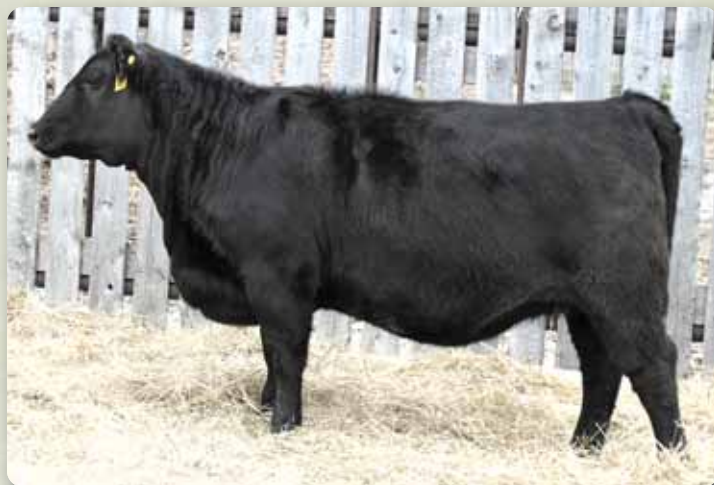
Lot 29 - Triple H Mustang Annie 33C

AI'd to PA Fortitude 2500 on May 7. Pasture exposed to Triple H Intuition 14B on May 13. Favourable to AI.