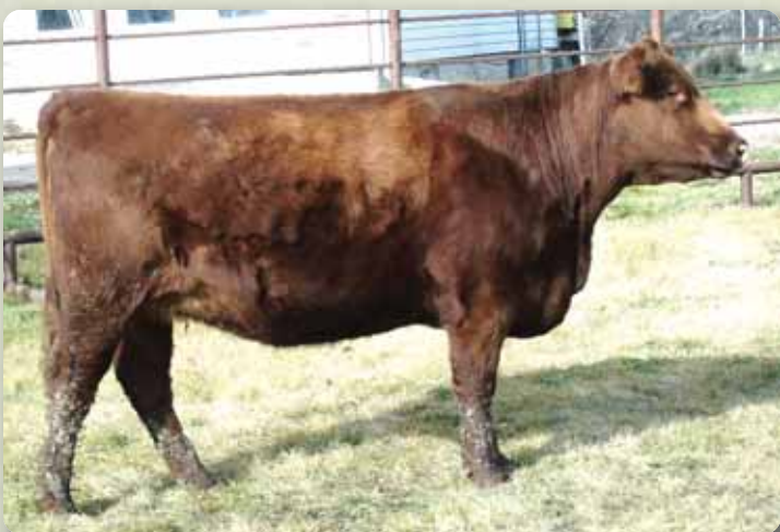
Lot 32 - Red MFCC Big Sky Princess 2C

Our first Governor 75Z x Fully Loaded 88X female, this heifer is a mixture of great maternal presence and pure performance. 55C has a very feminine appeal and a great disposition. AI'd to Red Soo Line Power Eye 161X on May 7. Pasture exposed to Red OLE Moonshine 453B(Moonshine 8081U son) on May 13. Favourable to AI.