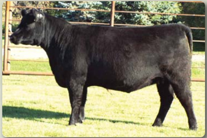
Lot 14 - MFCC Pioneer Ruby 124B

Ultrasound favourable to AI. Expected due date is January 28, 2016.