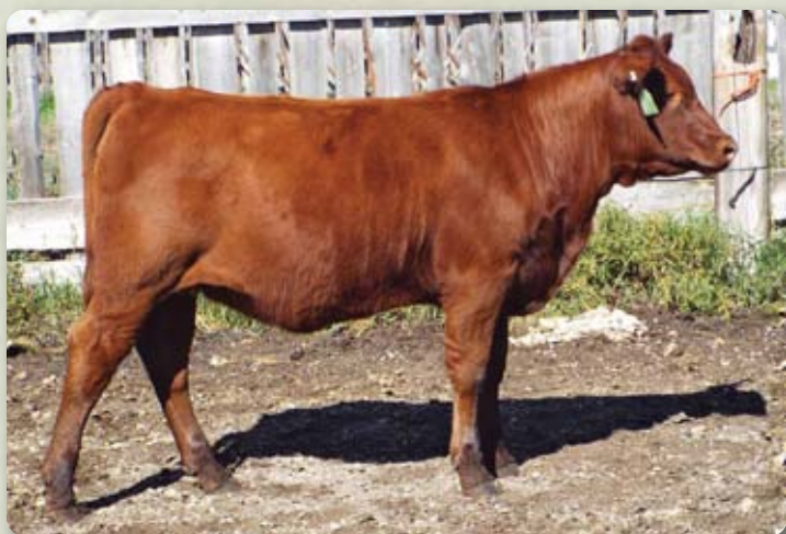
Lot 8 - Red Nu-Horizon Patsy 574C

A deep, tanky, thick made, moderate heifer with lots of rib shape and hip. The Ribeye bull adds calving ease, great temperament that have matured into productive females. Her dam, 34Y is a hard working All Star daughter - they have top quality udders and are great mothers. Halter broke.