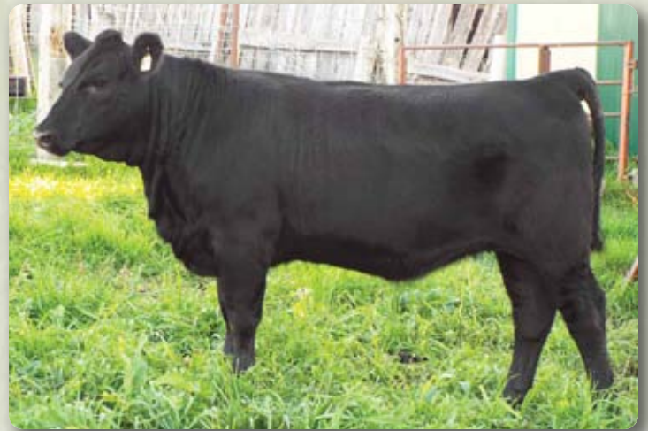
Lot 11 - Queen Blackcap 512C

Another 210 daughter. This is my pick of the heifer calves for 2015. The mother of 512C is a Connealy Lead On daughter 13X. We showed 13X and she did very well.