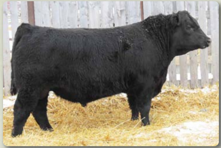
JL Bullet 2014 - Sire of Lot 25