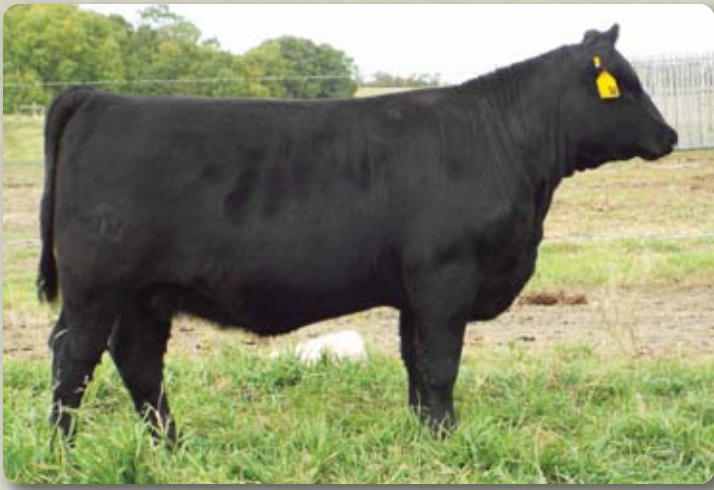
Lot 1 - Valley Lodge Countess 16C