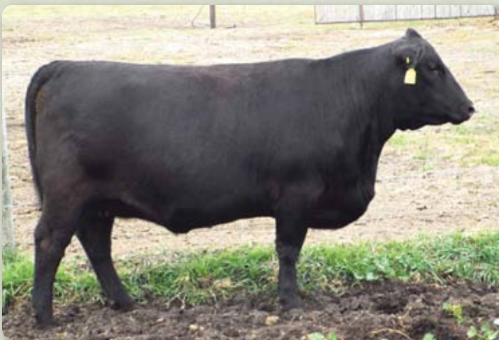
Lot 19 - Valley Lodge Countess 5B

Service: Bred AI on May 14 to S Tittlest 1145 and exposed from June 1 to July 11 to Isla Bank Bismarck 1302.