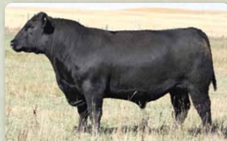
MICH Wheatland SC Lut 35B - Service Sire to Lot 40

Please be our guests for lunch prior to the sale