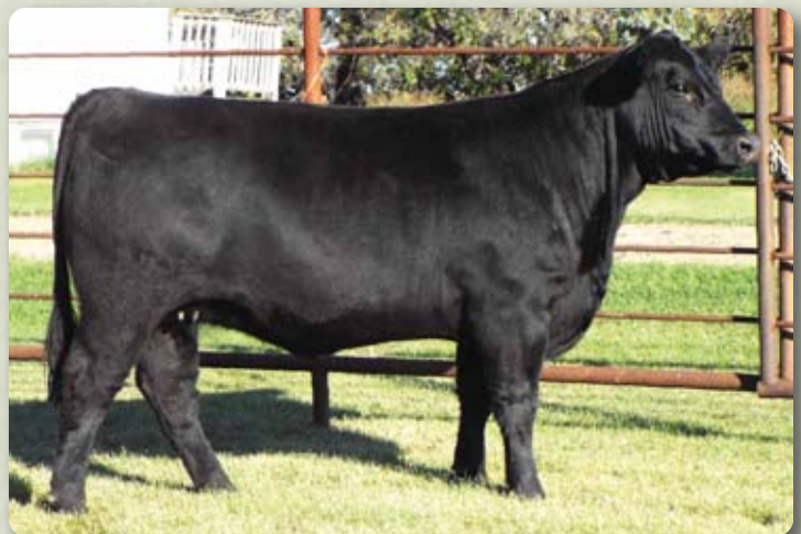
Lot 22 - MFCC Zen Master Ruby Doll 33B

Ultrasound favourable to AI. Expected due date is February 6, 2016.