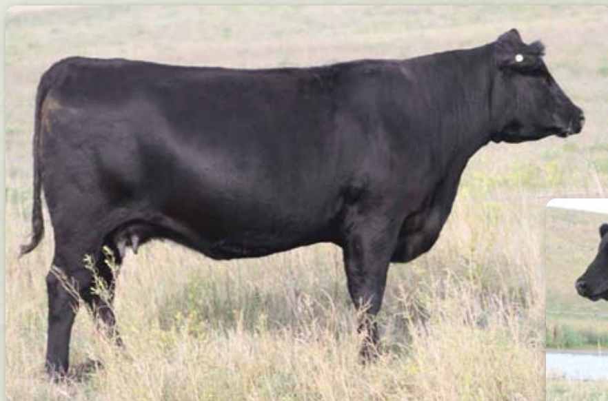
Lot 40 - Sunny Grove Daisy 11A

Exposed to Hilow Excitement 19B May 4th to August 1st.