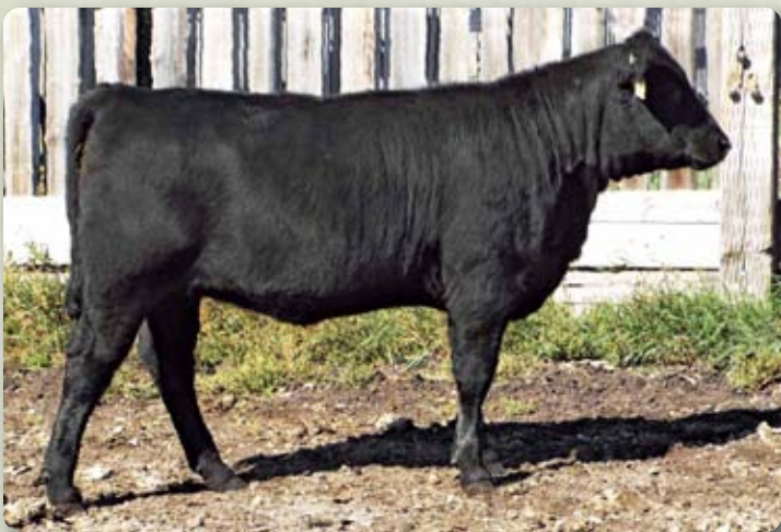
Lot 3 - Nu-Horizon Jestress 504C

Our first crop of calves out of our choice of Rito 9969 sons from Lewis Farms and we are extremely happy with the set of calves he has left us. With that we opened up the whole crop of heifer calves for the sale and here is the best heifer born at the farm this year and maybe for a long time. She's a rip, powerful in her makeup yet carries the femininity that is important. Check this power heifer out. Weighed 823 lbs. on Sept. 22nd.