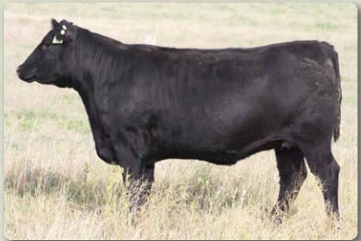
Lot 28 - Sunny Grove Rosebud 5B