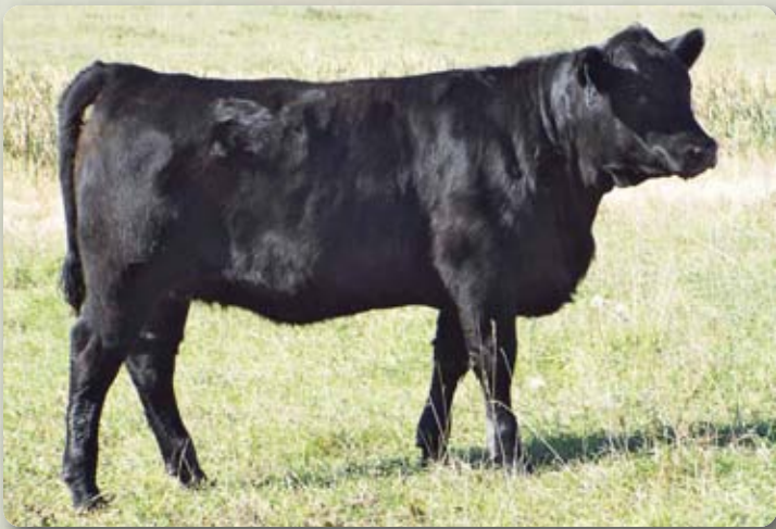
Lot 2 - Black Ridge Barbara 2C

This Long Distance heifer will catch your eye right away. Very fancy made, deep bodied heifer with a very interesting pedigree. The first calf off of an embryo transfer, Bismarck cow who is also extremely deep ribbed with lots of top and a picture perfect udder. This might be our strongest offering in the sale and would make a great junior project. Will be halter broke at sale time.