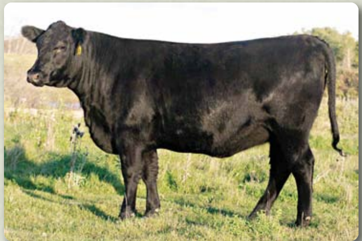
Lot 29 - Black Ridge Ida 14B

Exposed May 7-September 1 to TJF 91Z Knockout 25B.