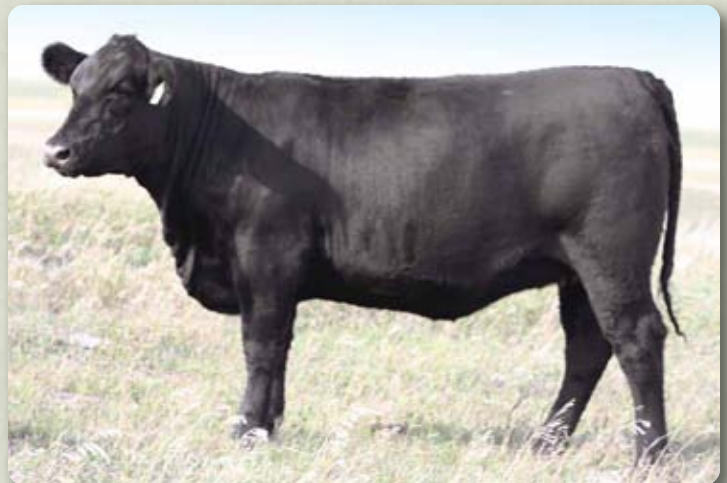
Lot 16 - Sunny Grove Atlanta 54B