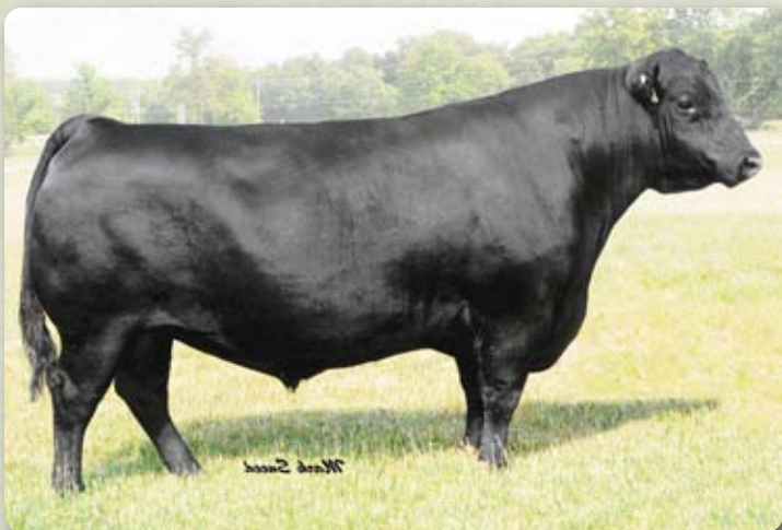
Basin Excitement - Sire of Lot 38

Observed bred June 7 to Lodge Front Range 22B and preg checked safe to this date. Due March 16, 2016.