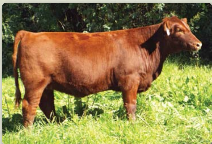
Lot 9 - Red T&S Miss High Top 38C

Here is a calf we are proud to offer. A brood cow from the ground up with this Barnabas heifer calf. 574C carries a great pattern with a great front end, structurally balanced and backed by an excellent cow family.