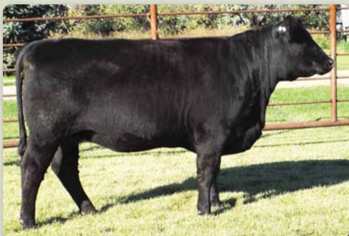
Lot 32 - MFCC Viking Ruby 10B

Exposed to Hilow Excitement 19B May 4th to August 1st.