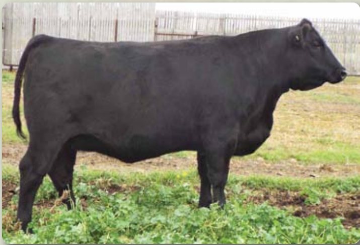
Lot 37 - Lodge Countess 21B

Pasture exposed to Nu Horizon Ribeye May 15 - June 6 and Lodge Front Range June 6 - July 31. Due Jan. 31, 2016