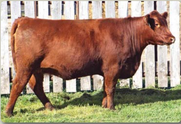
Lot 23 - Red Triple H Dorren 31B