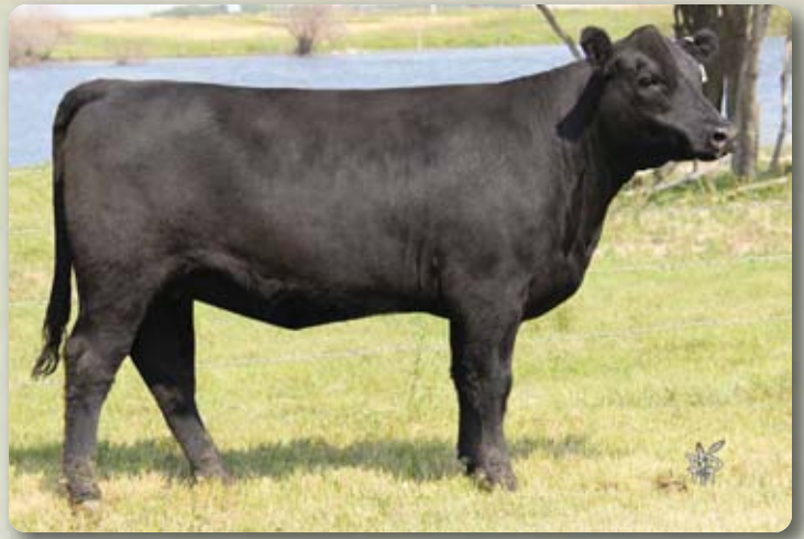
Lot 33 - HiLow Idelette 16B

Service: May 20th A.I. to Cole Creek Cedar Ridge 1V. June 7th exposed to GGA Upward 23B.