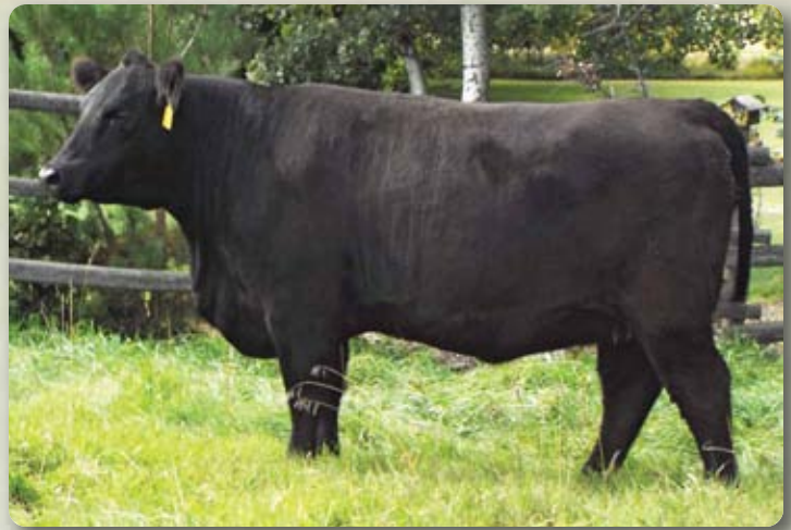
Lot 20 - Lodge Quality Lass 7B

AI bred to KG Solution April 24th and pasture exposed to Nu Horizon Ribeye May 15 - June 6 and June 6 - July 31 to Lodge Front Range 22B. Vet could not determine if caught to AI date or first natural exposure but we did not see this heifer cycle back and expect her to be caught to the AI date and due Jan. 31, 2016.