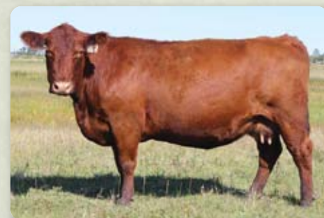
Red T&S Miss High Top 72U Dam of Lot 9

If you like them super sweet fronted, dark red heifer with incredible style making her an excellent option for a competitive show heifer. This fancy heifer carries all the breed greats, Mulberry and Patriot meaning this heifer will make a brood cow. Expect a great udder on this heifer to go with a great set of feet and maternal strength to be a great cow. Halter broke.