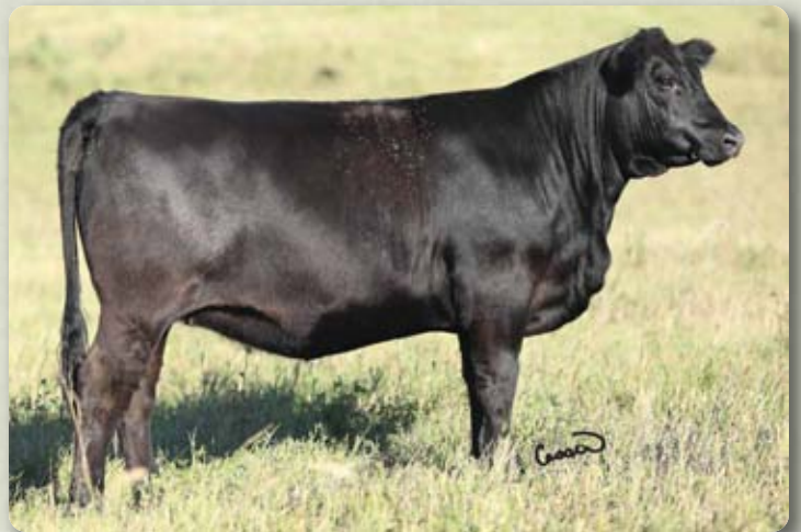
Lot 35 - WWF Upper Cut Sally 153B

Exposed June 1-July 11 to Isla Bank Bismarck 1302. July 21-Aug 31 to KG Focal Point 2013 (lead off bull in 2014 KG Ranch Bull Sale).