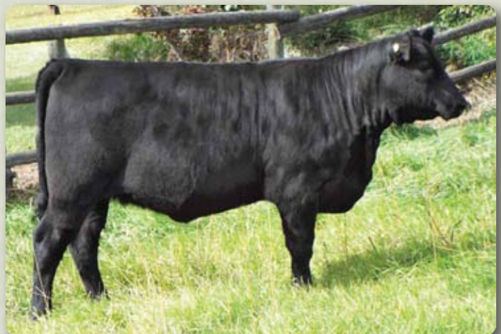
Lot 6 - Lodge Duchess 24C

The first Nu Horizon Ribeye heifer we have offered for sale. Great temperament with lots of performance in this sweet, long-bodied heifer. Her dam, SS Objective sired, was a 4-H project back in the day and we could definitely see this heifer following in her footsteps. Will also be halter broke on sale day.