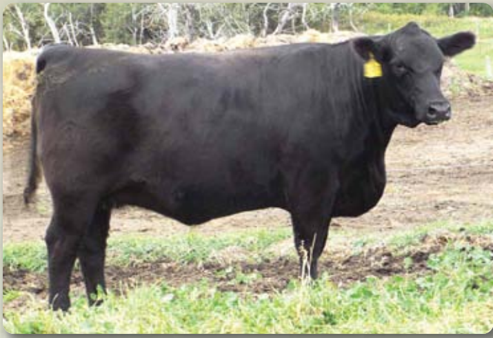
Lot 36 - Lodge Duchess 3B