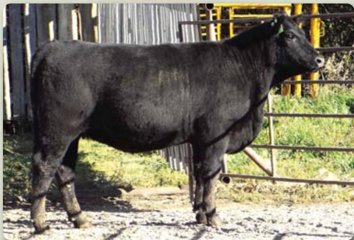
Lot 31 - Midnite Oil Miners Girl 62B

Ultrasound Favourable to AI. Expected due date is January 29, 2016