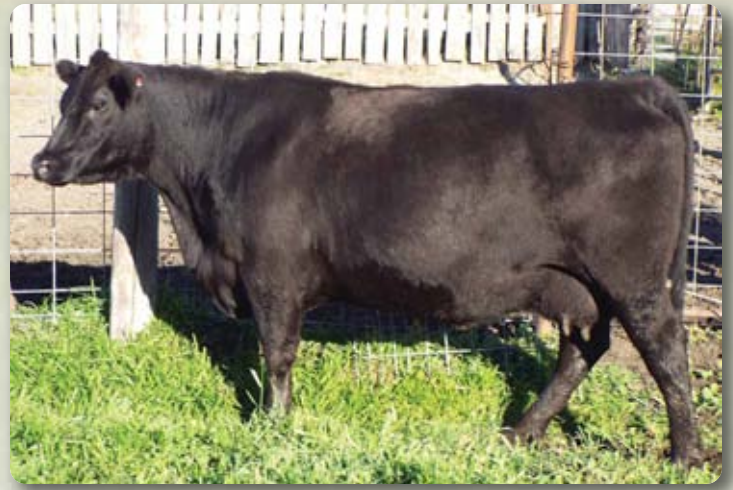
Lot 43 - J.D. Pride Dolly 310A

This cow lost her calf this summer when it got stepped on and broke its back. A pedigree that has a lot of names from the past. QAS Traveler 23-4, Saratoga, 1137, and her father Connealy Thunder. A good young cow. Exposed to J.D. Tiger 210Z June 6th on.