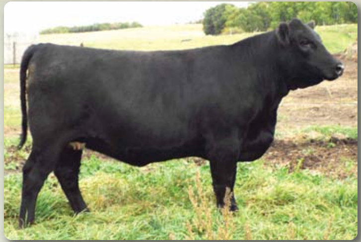
Lot 27 - Lodge Lady McHenry 27B

Observed bred May 27 to Nu Horizon Ribeye and preg checked safe to this date. Pasture exposed May 15 - June 6 to Nu Horizon Ribeye and June 6 - July 31 to Lodge Front Range 22B. Due March 5, 2016