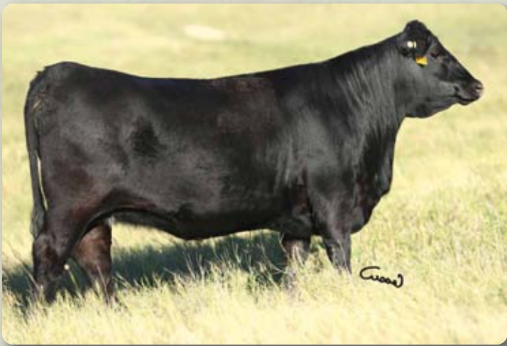
Lot 18 - WWF Upward Blackbird 44B

Service: May 20th AI'ed to Cole Creek Cedar Ridge 1V. June 7th exposed to GGA Upward 23B.