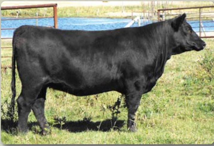
Lot 17 - HiLow Eston Anne 93B