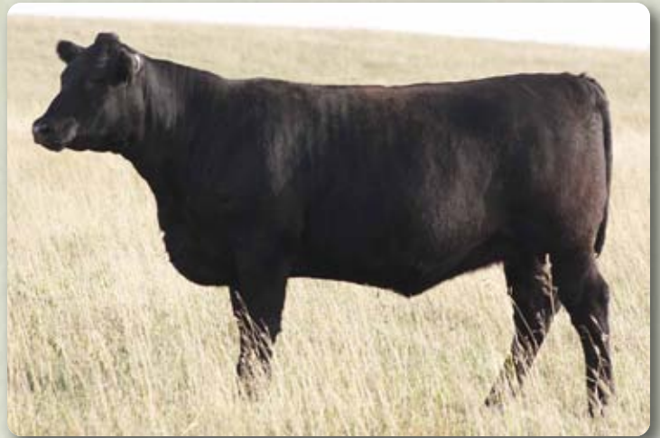
Lot 34 - Sunny Grove Beulah 45B

A.I. April 22 to Sub Zero. Exposed May 24-July 10 to Lazy JB Barcardi's Legacy. Ultrasound July 14, 45 days safe to exposure.