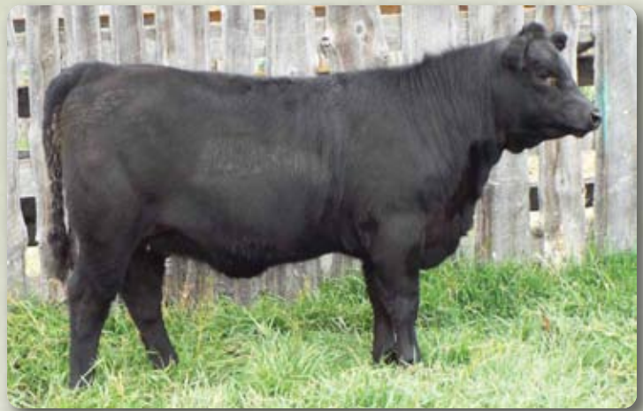
Lot 41A - Z-Bar Barbie 20C

Exposed to Z Bar Eric 246A June 3rd-Aug 27th.