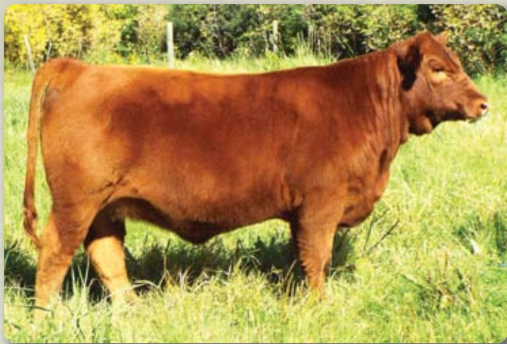
Lot 7 - Red T&S Hart 56C