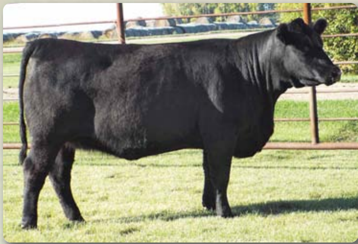
Lot 30 - MFCC Prism Ruby 54B