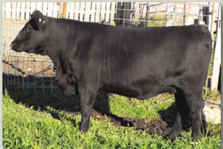
Lot 21 - J.D. Barbara 406B

This heifer became available because we are starting to use 0245 again. 406B will catch your eye. A very correct animal with a different pedigree. Barbara 406B was AI bred to Final Answer (due date Mar 11/16) and exposed to J.D. Tiger 210Z.