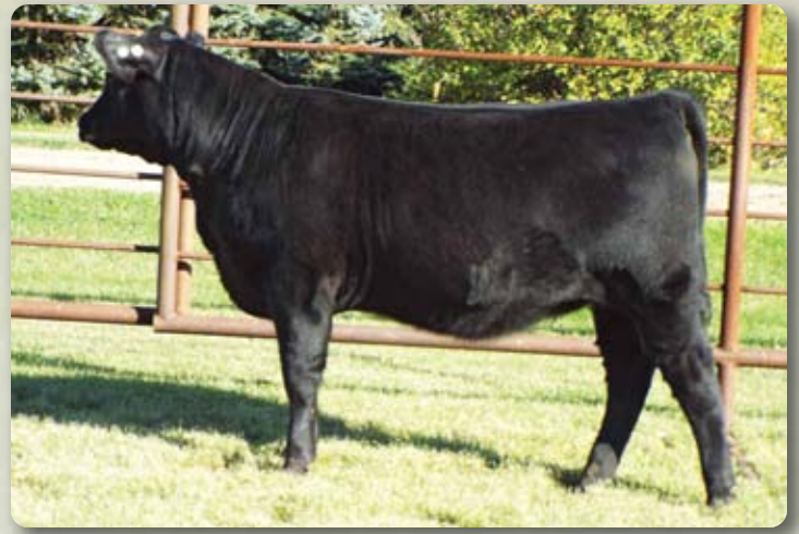
Lot 10 - MFCC Viking Queenanne 46C

This is a fancy heifer with a lot of power and performance in her pedigree. She is a deep, wide and powerful calf with lots of potential. Her dam is a larger framed, deep solid cow with a great udder. With her style, completeness and power she is a hard one to miss.