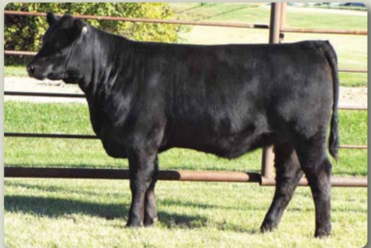
Lot 5 - MFCC Zen Master Ruby 17C

This sweet little heifer calf is a half sister to 10B, one of the bred heifers we have on offer. She is a very wide, long and powerful heifer that has shown a lot of promise for performance. Her dam is a very complete and well put together moderate framed cow with a great udder, feet and legs. She would make an excellent 4-H heifer.