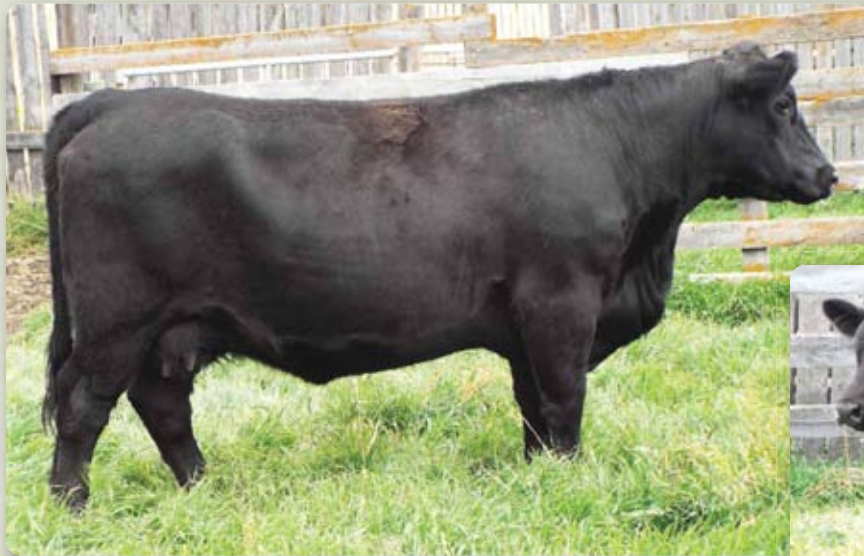
Lot 42 - Z-Bar Queen Mother 230A

BW: 92 BLACK EPDs ▶ BW: +2.7 WW: +44 YW: +70 Milk: +17 TM: +38