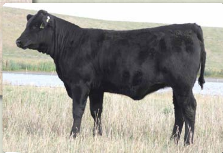
Lot 40A - Sunny Grove Daisy 37C