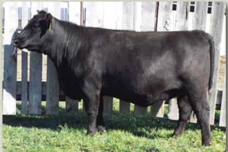
Lot 15 - Triple H Queen 25B