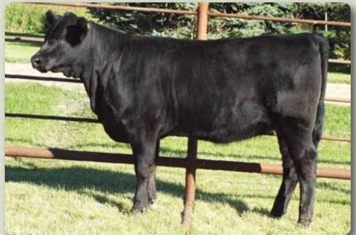
Lot 12 - MFCC Viking Duchess 122C

This heifer is a very well muscled, clean fronted, long bodied and attractive calf out of Steven and Tami-Lynn's herd. Her dam is a very deep, solid and powerful cow with a great udder with small teats. We are very excited to see how this heifer turns out for you.