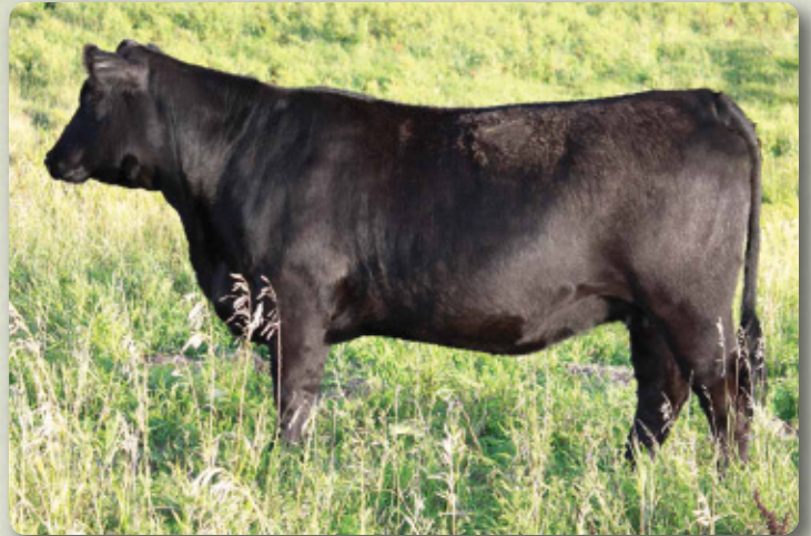
Lot 41 - Sunny Grove Baress 43A