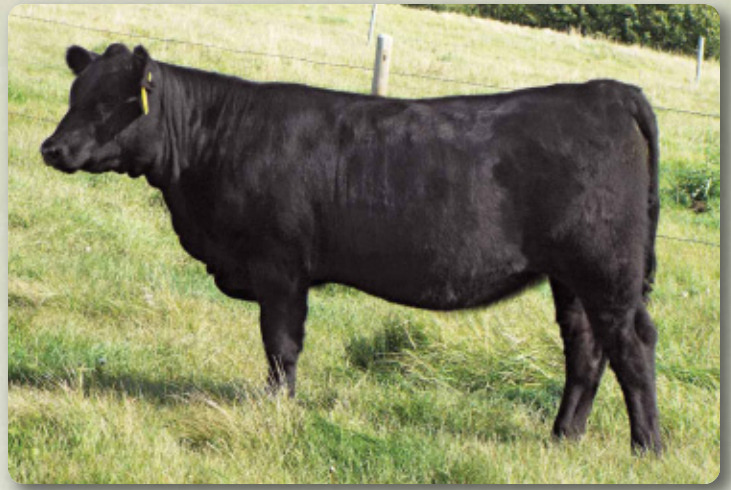
Lot 4 - Valley Lodge Countess 12B

A tough decision for Megan but we really wanted to bring some frontline females this year and this little sweetheart will fit right in anywhere. A Bismarck daughter out of her Freightliner cow that will make an excellent foundation prospect. Very moderate framed as you would expect with this type of pedigree with lots of maternal and calving ease strength.