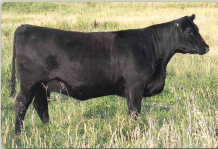
Lot 43 - Sunny Grove Lady 3A