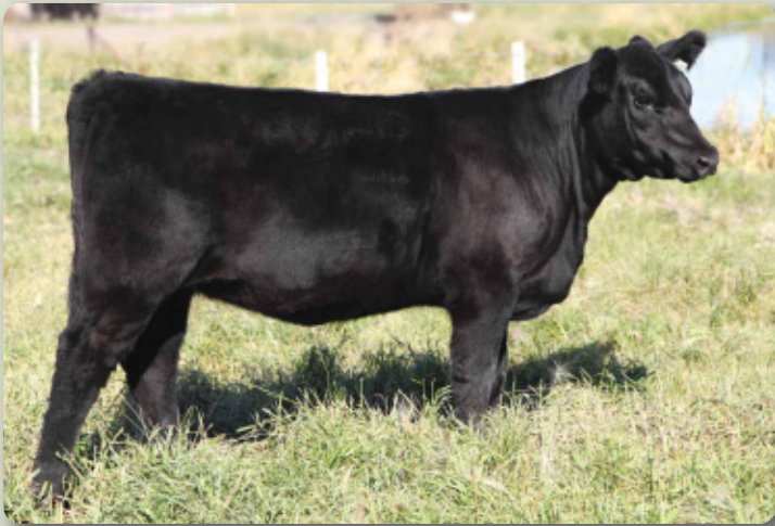
Lot 2 - CSI Anne 67B

The Dam is A Game Day daughter, purchased from the Mountain View Farms Dispersal. This girl has EPDs to back her up top 10% Milk, Yearling Weight and REA.