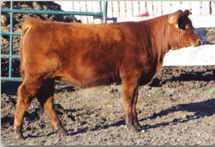
Lot 10 - Red Nu-Horizon Lakota 464B