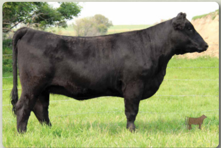
Lot 23 - HiLow Pride 39A

Exposed after June 2nd to Hi Low Tiger 1A, a son of our 2012 Triple A high selling bull Hi Low Tiger 12Y.