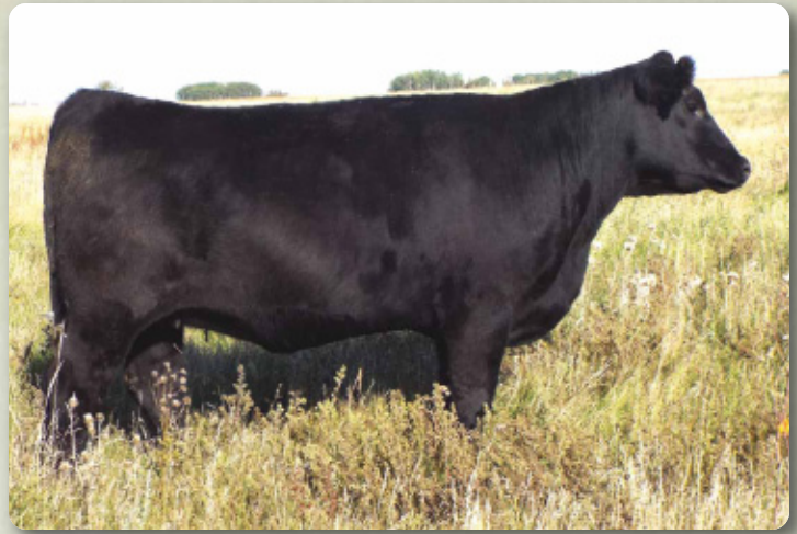
Lot 27 - Nu-Horizon Mollie 3101A

Exposed to Brooking Ransom 228 May 9, 2014.