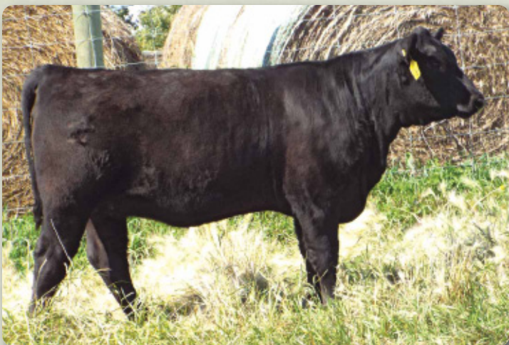
Lot 3 - Lodge Baress 11B

A feminine March calf built on a moderate frame.