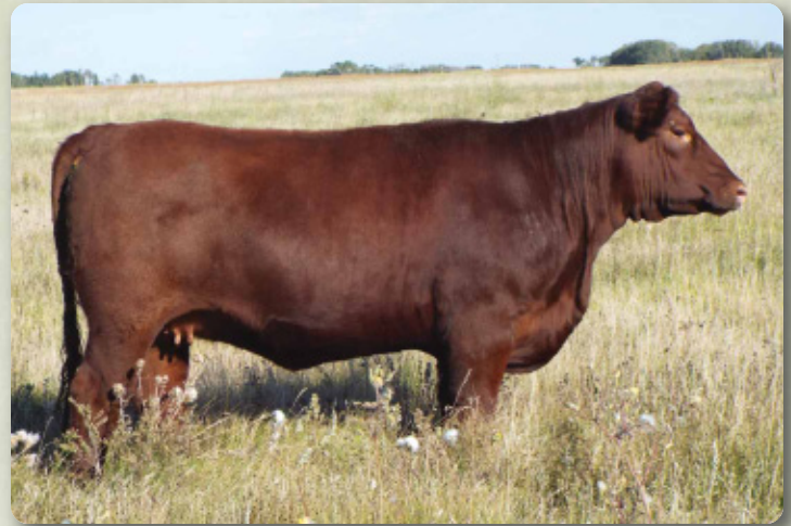
Lot 34 - Red Nu-Horizon Rebecca 331A

This is a dark cherry red heifer with a moderate frame. She should milk well and have strong maternal traits. Her dam has a fantastic temperament and was shown as a calf. Favourable to her AI service to Brown JYJ Redemption Y1334 on April 20, 2014. Due date Jan. 27, 2015. Exposed to Red U-2 Mission 366Z -1679913- May 9, 2014.