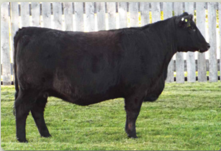
Lot 25 - MFCC Final Answer Lady 16A

Here is a large framed heifer with lots of style and class. This heifer, with her combined femininity, larger frame, ease of movement and genetics will add size, stature, and calving ease to her calves, as well as be able to walk the pastures for many years to come. Her sire was purchased from Michelson Land and Cattle and he has brought power and performance into our herd, which shows in this powerful, broody heifer. Pasture exposed from May 12 - July 3 to a home raised bull, MFCC Panic Switch Apollo 3A (TJF 3A). He is a son of Belvin Panic Switch 2'11 and 3A's dam is a granddaughter to Elliot Patricia 13L who was purchased from Elliot Angus. On September 2 she was confirmed 80-90 days pregnant making her due to calve in March of 2015.