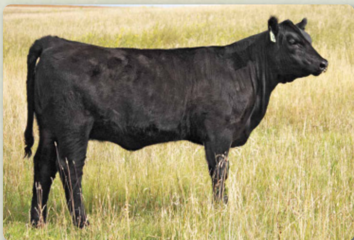
Lot 14 - Sunny Grove Erica Rose 41B

This is a heifer with a little different pedigree, the 4612. I think I was the only one to use him in Canada. 4612 is a 112 son and that goes back to 616 and the great cow GAR Precision 2536. On the bottom is BT Ultravox, probably one of the best AI sires we used. The 412P goes back to Elban Entense 0245 a bull we bought from Fairview Ranch in Montana. Dig a little deeper and you will see 39E again. All these heifers have 0245 and 39E in the them and all are very quiet.