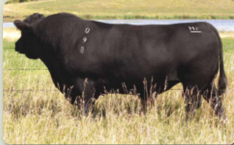
HF Tiger 98X