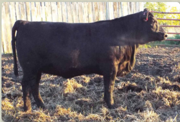
Lot 13 - J.D.Pride 401B