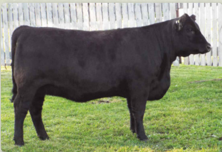
Lot 26 - MFCC Prism Ruby 46A

Confirmed pregnant on September 2, favourable to AI.