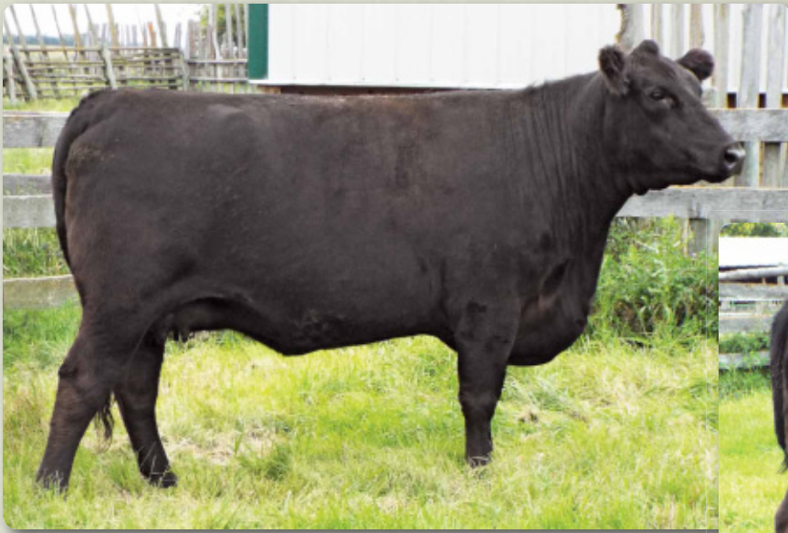
Lot 16 - Wilmo Duchess 13Y