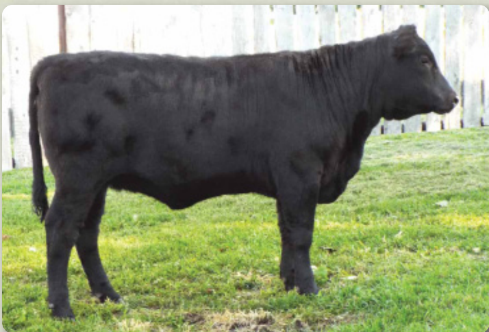
Lot 9 - MFCC Old Post Ruby 11B

Lulu 56B is a deep bodied, good haired, square hipped heifer. Her dam Lucy 84U is a heavy milking cow that traces back to the Deer Range Lucy cow family. Her sire, Fully Loaded 88X is the most consistent bull I have ever used. This year, 14 out of 14 bull calves have the potential to be in the bull pen and 2 heifers will be taken to sales (Red Roundup and Frontline). The rest of the heifers will be kept as replacements. Fully Loaded 88X is a combination of Fully Loaded 540R, Smash 41N and Gold Bar King. We have 88X daughters in the herd milking and doing an excellent job. Check out Lulu 56B on sale day, she will make an excellent cow.