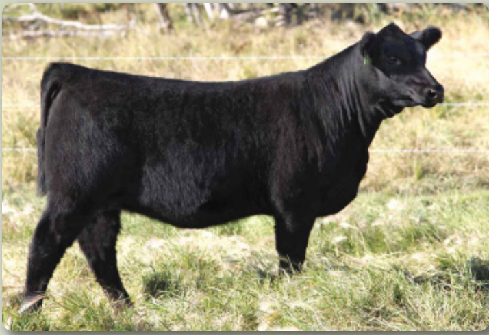
Lot 1 - CSI Tip Top 39B