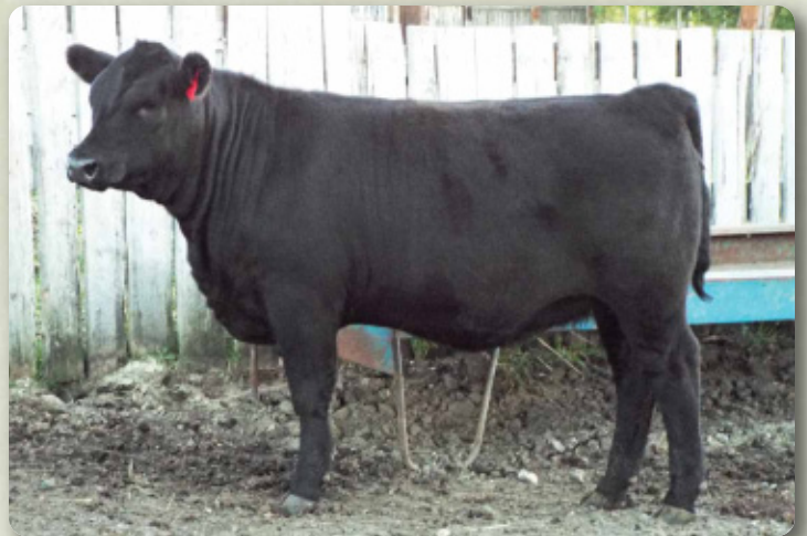
Lot 11 - J.D.Pride 405B

I have a big soft spot in my heart for this heifer, sweet from the day she was born. A Mytty in Focus daughter which give you the 73 lb. birth weight. Tiger on the bottom side. I can't say enough about the Tiger calves and here is 730T again and her dam 39E. 39E was a cow we started our herd with, she lasted till she was 14 years. At 14 she was 1,800 lbs., never broke down. I wish I had 20 just like her.