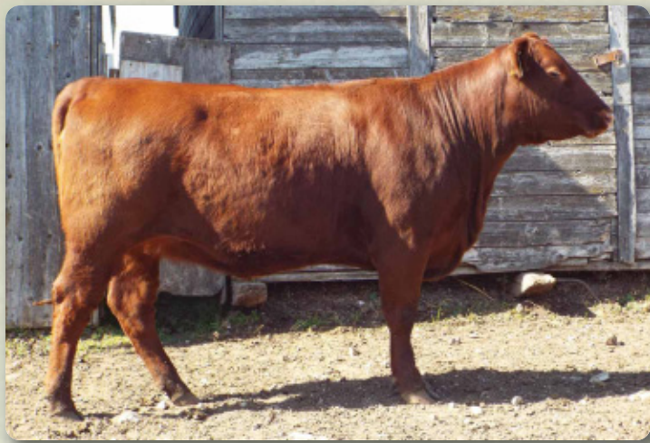
Lot 36 - Red Triple H Kina 18A