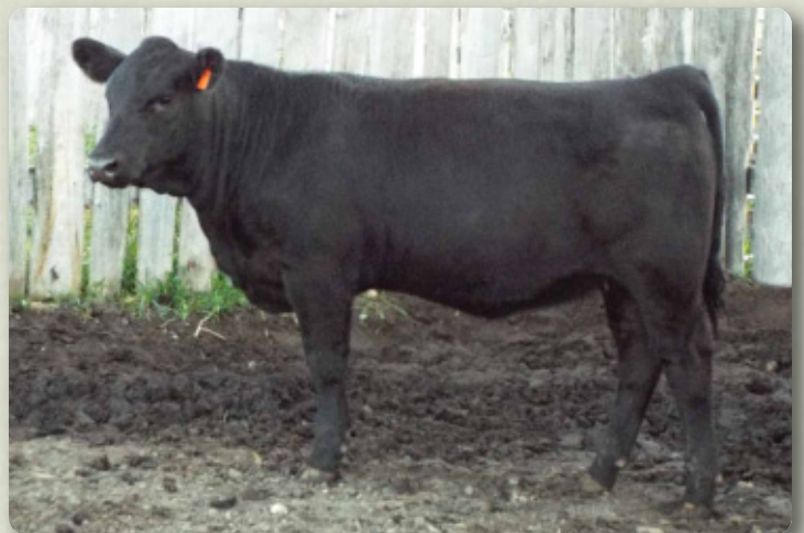
Lot 12 - J.D.Pride 409B

This heifer's pedigree is full of stars, a who's who in the Angus world. Tiger, Kodiak, CC&7, Forever Lady, J.D. Pride 730T, the leader of my herd. 409B is a long heifer full of potential, this 730 line never misses. She will fit into any herd.