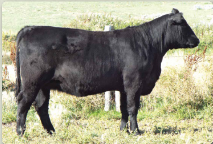
Lot 51 - WWF Kodiak Belle 164A

Exposed June 5 - July 31 to Isla Bank Bismarck 1302.