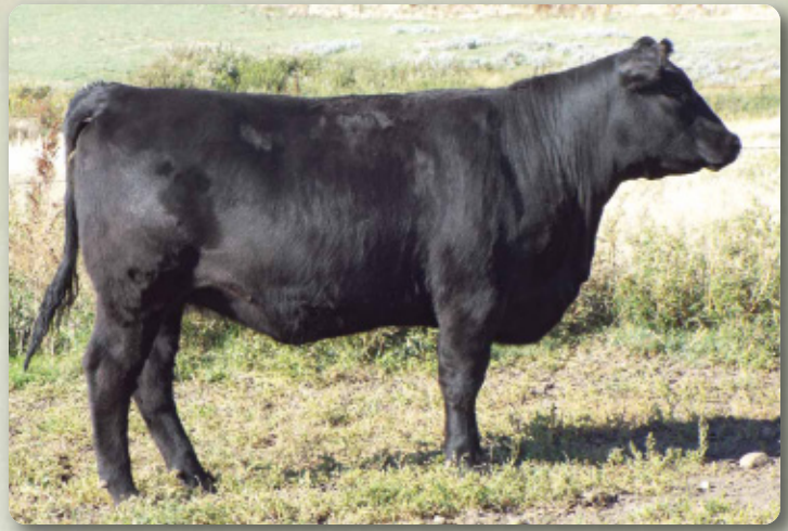
Lot 53 - WWF FA Blackbird 11A

Blackbird 11A is an own daughter of the great Final Answer. We used him for 6 years for his calving ease and his daughters are proving his real worth as they become some of the top cows in the WWF herd. This good heifer descends from Blackbird 100R, the dam of our Upper Cut 44Y bull who has seen heavy service in the Windy Willows herd. Exposed June 5 - July 31 to Isla Bank Bismarck 1302.