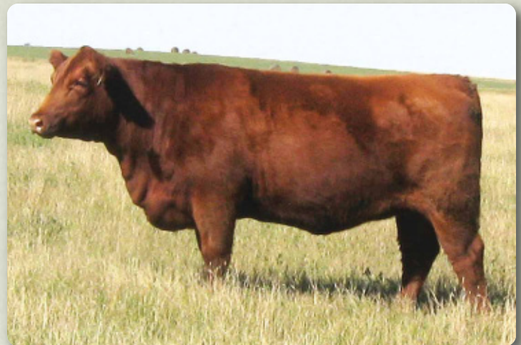
Lot 35 - Red S- Bayberry Alibi 135A

A deep, thick Bayberry female. These Bayberry dams are a favourite here at S- Red Angus. Her sire Red Cockburn Ribeye 411W has some of Cockburn's best females in his tabulation. AI bred to Red Brylor Toast 30T April 21, 2014. Exposed to Red Pasquia Toast 10A April 23 - June 20. Ultra sound favourable to the AI date.