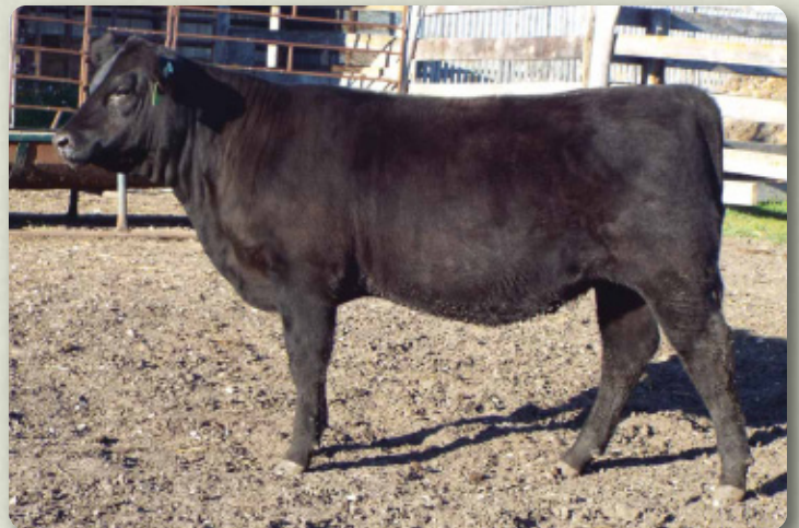
Lot 6 - Nu-Horizon Lucy 403B

The dam of this calf was purchased out of the Masterpiece Sale as a calf. Her sire Brooking Ransom 228 was purchased for the notorious Beauty 6R, hoping to get some females. We are not disappointed as his first calf crop was this spring and they are flashy, long spined and well put together. This heifer has a clean front and deep body with a moderate frame. She has been a favorite in the pasture. Take a good look at her!