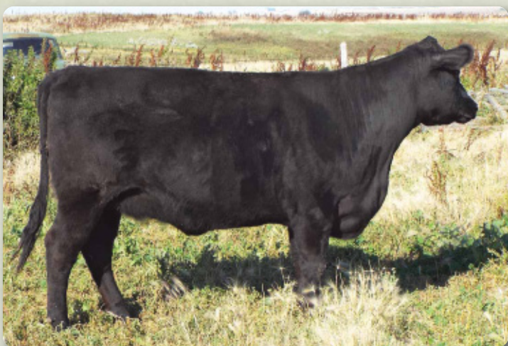
Lot 58 - WWF Right Time Blackwood 131A

Exposed June 5 - July 31 to Isla Bank Bismarck 1302.