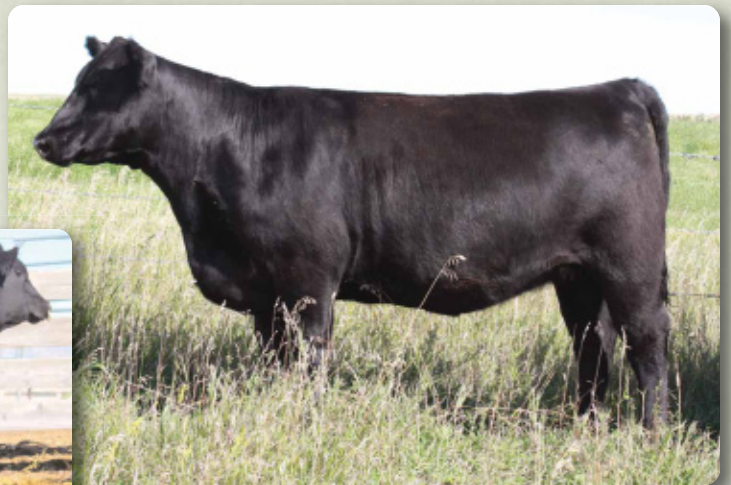
Lot 42 - Sunny Grove Sheila 25A