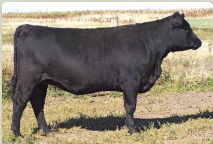
Lot 52 - WWF Cedar Ridge Pride 6A

Exposed June 5 - July 31 to Isla Bank Bismarck 1302.