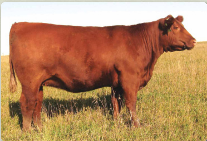
Lot 32 - Red S- Sue Abbey 119A

A long spined daughter of Red LCB Lancer 1202S. AI bred to Red Brylor Toast 30T April 21, 2014. Exposed to Red Pasquia Toast 10A April 23 - June 20. Ultra sound favourable to the AI date.