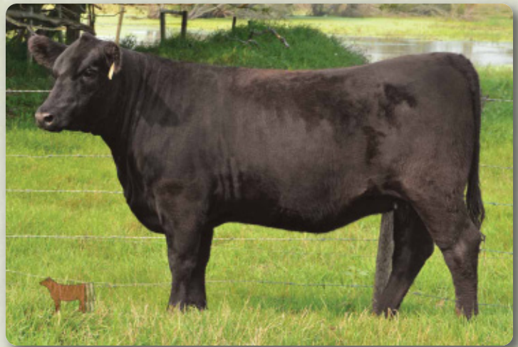
Lot 22 - HiLow Lassie 71A

Exposed after June 2nd to Hi Low Ideal 43A, a son of Crescent Creek Ideal 28.