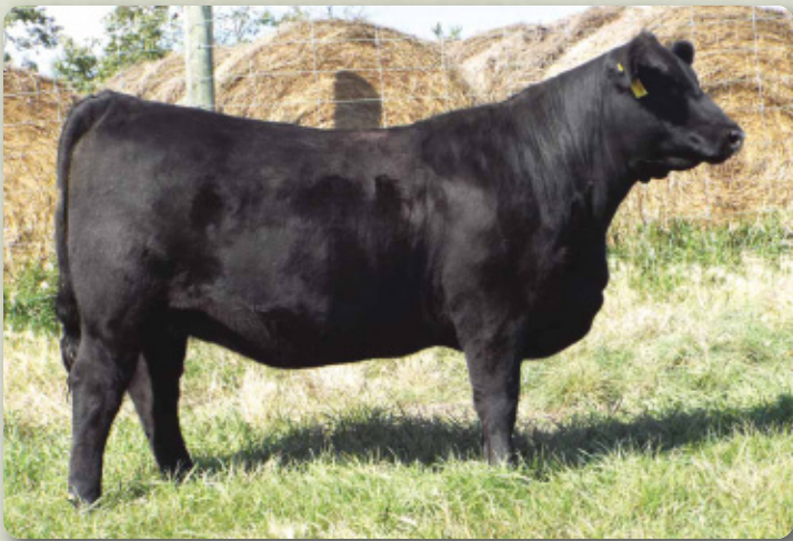
Lot 19 - Lodge Quality Lass 12A

Exposed to Northern View Pioneer 103Z July 13 - Sept 1.