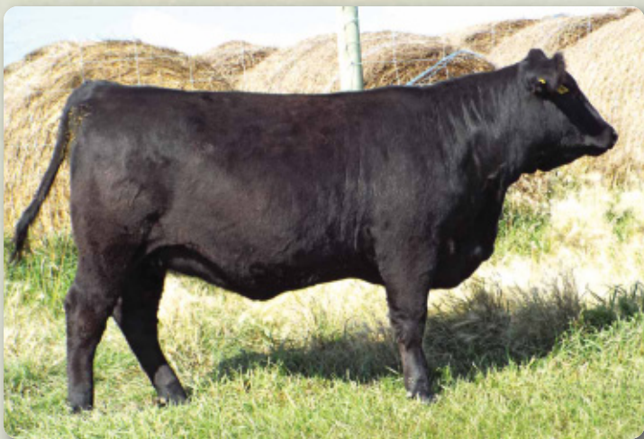
Lot 44 - Lodge Lady McHenry 23A

DLR 3A is a heifer sired by Final Product, who is popular for his style and performance with an outcross pedigree to many programs. 3A's dam is a very good cow going back to the popular Lady Fanny cow family. A.I to Connealy Right Answer April 18. Exposed May 6th - Sept. 1st to Lazy JB Bacardi's Legacy. Vet estimated due end of Jan to A.I.