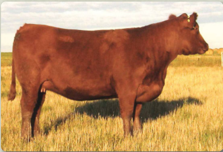
Lot 31 - Red S- Blacklass Apple 109A

This heifer's dam is a tank, with great feet and legs. Exposed April 18 - June 20 to Red Pasquia Toast 10A. Observed bred May 23, 2014. Ultra sound to this date.