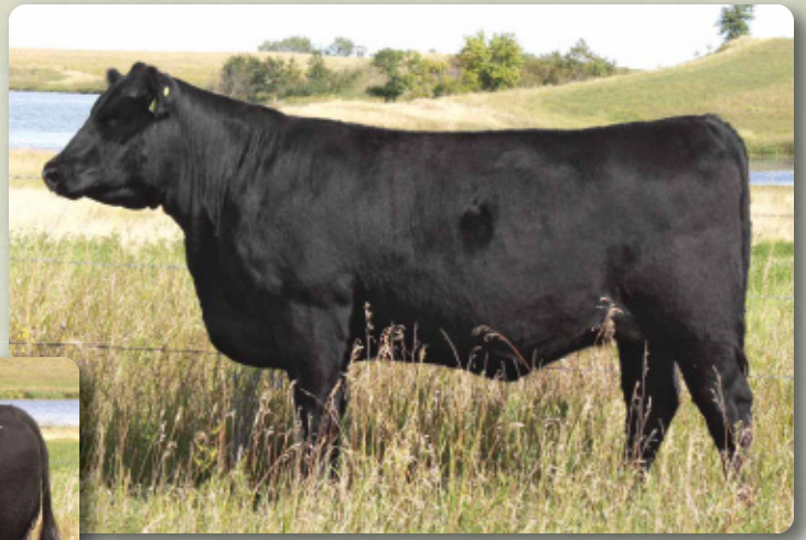
Lot 40 - Sunny Grove Ruby 7A