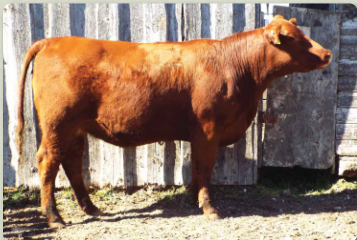
Lot 39 - Red Triple H Blu Misha 104A