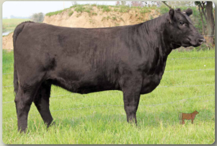
Lot 21 - HiLow Eston Anne 74A

Exposed after June 2nd to Hi Low Ideal 43A, a son of Crescent Creek Ideal 28X our selection from Wes and Kim's lead off pen in their 2011 bull sale.