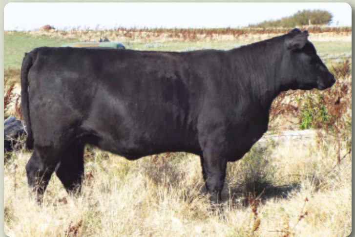
Lot 55 - WWF Upward Pride 61A

Upward has done a bang up job of siring high growth, eye appealing cattle for us and his daughters are very productive females. Pride 181P is one of our top Ambush daughters with 4 sons selling through our bull sale. Pride 61A is a smooth made, long and feminine heifer that should make a very productive cow. Exposed June 5 - July 31 to Isla Bank Bismarck 1302.