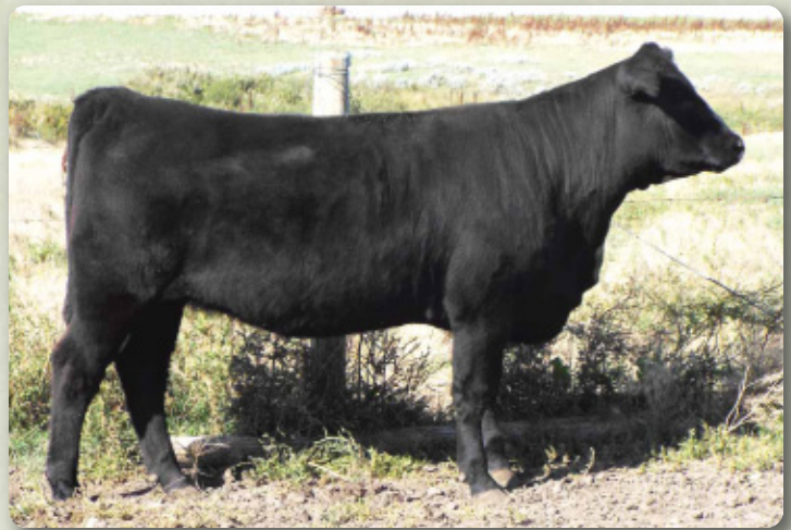
Lot 54 - WWF Ambush Tiptop 49A