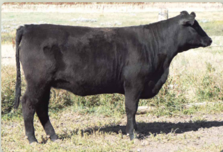
Lot 57 - WWF Right Time Bride 117A

Exposed June 5 - July 31 to Isla Bank Bismarck 1302.