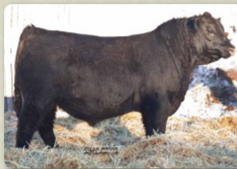
Isla Bank Bismarck 1302

Examined by ultrasound on September 2 safe to AI service.