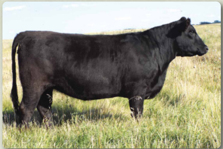
Lot 28 - Nu-Horizon Rosebud 314A

Exposed to Brooking Ransom 228 May 9, 2014.