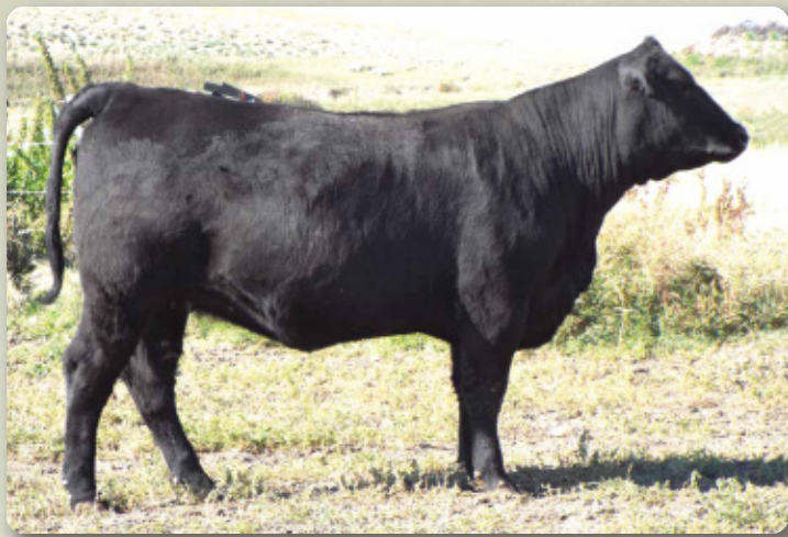
Lot 50 - WWF Kodiak Eileen Bar 1A