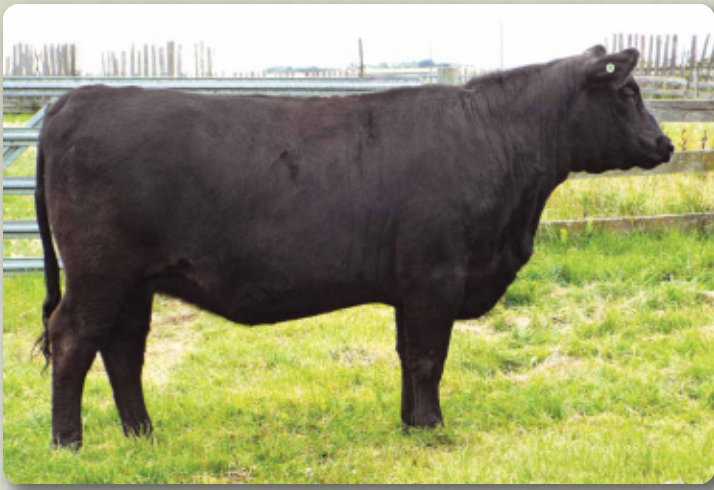
Lot 18 - Wilmo Black Lucy 8A