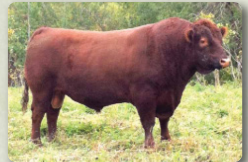
Red Vikse Da Fully Loaded 88X

Pasture exposed June 1, 2014 to HRA 23Z, a red grandson of the famous black bull SAV Net Worth 4200.