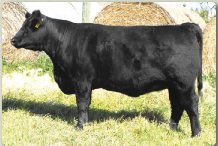
Lot 29 - Valley Lodge Countess 17A

Preg checked favorable to AI date - due Feb. 12, 2015.