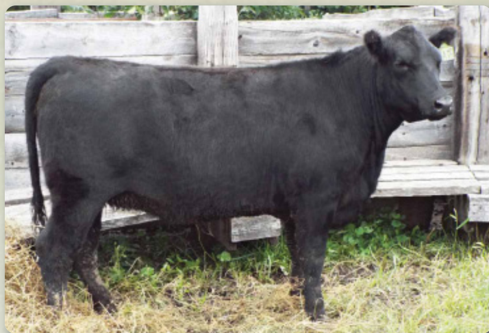
Lot 46 - Midnite Oil CS Pride 8A

The Thunder cattle have been extremely well accepted as the females are turning into top producers. Udders are very good and with that right amount of milk to raise a good calf. Howe Magic 28R was Hi Low's pick out of the Howe Dispersal along side his dam. In turn when he sold as a yearling bull he was the High Seller at the 2006 Triple A Bull Sale. Exposed to Wilbar Tomcat 209A April 28 -Sept. 1.