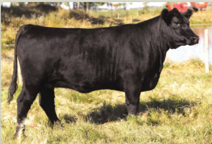
Lot 20 - CSI Madonna Rose 62A

Preg checked favorable to AI date - due Feb. 13, 2015.