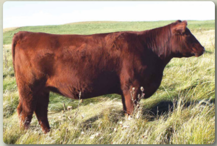
Lot 33 - Red Nu-Horizon Lady 341A

This is a well balanced bred heifer for both power and growth. Her dam has a perfectly shaped udder with small teats. Her sire is a very stout bull with lots of natural muscle. Favourable to her AI service to Brown JYJ Redemption Y1334 on May 3, 2014. Due date Feb. 9, 2015. Exposed to Red U-2 Mission 366Z -1679913- May 9, 2014.