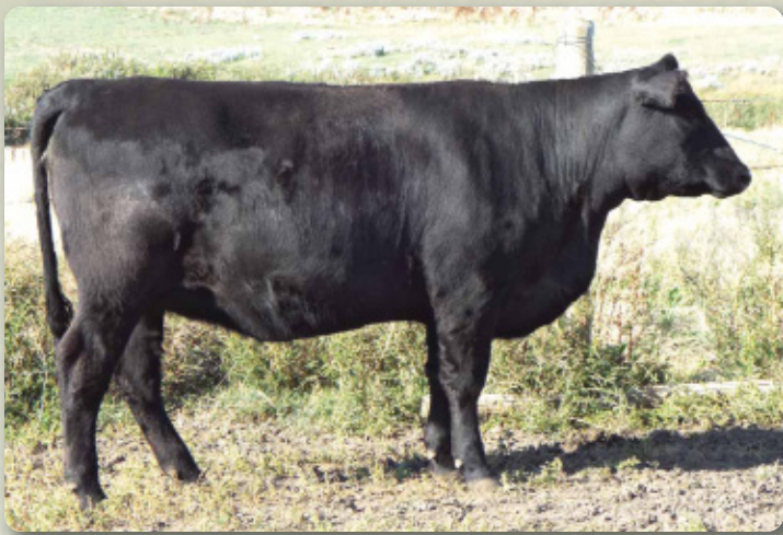
Lot 56 - WWF Upward Atalanta 69A