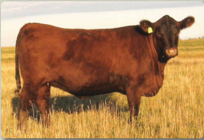
Lot 30 - Red S- Lass Azalea 138A