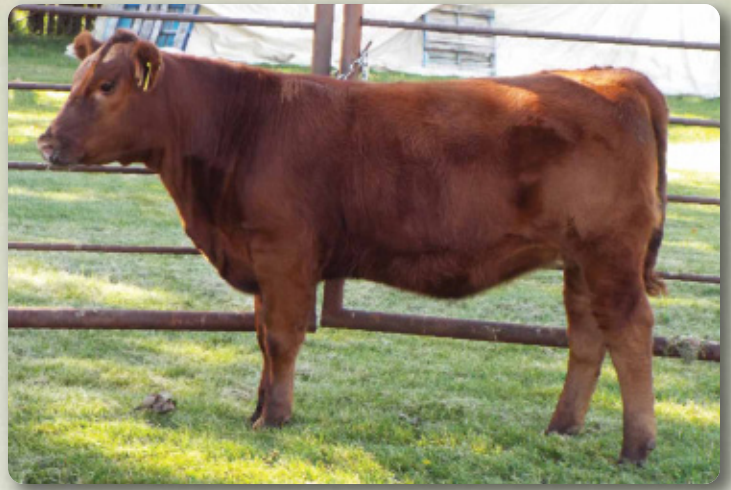
Lot 10 - Red MFCC Cash Princess 3B