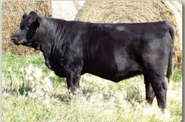
Lot 5 - Lodge Lady McHenry 25B

A Jock daughter with loads of performance and a very kind temperament. Lots of rib and top on this one with the makings of an excellent brood cow. The combination of Jock and Game Day will provide some added eye appeal and muscling as this calf grows out.