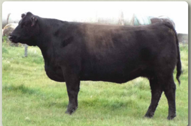
Lot 17 - HiLow Lady Ann 86X