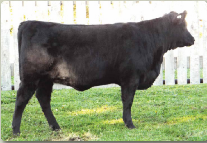
Lot 24 - MFCC Steel Petal 60A