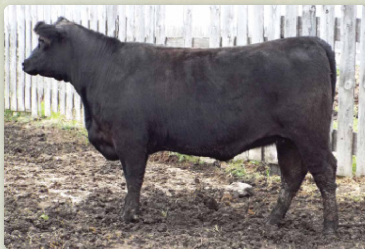
Lot 47 - Midnite Oil Miss Vonda 34A

A strong Net Worth daughter out of the top of our replacement pen. We are extremely confident that she will do well for her new owners as there is only one reason why the Vonda cow family has lasted so long at our place, the production has been there consistently. Exposed to Wilbar Tomcat 209A April 28 -Sept. 1.