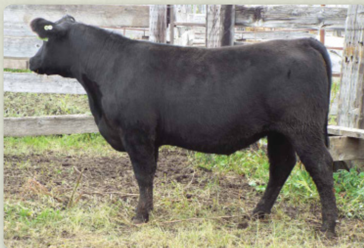
Lot 48 - Midnite Oil Highness 84A

We purchased the dam to the sire of this heifer at the MVF Dispersal as they have always worked well here, we haven't been disappointed and we know you won't be either. Net Worth, Widespread, Stockman and Ribeye all have been very influential. 84A was her dam's last calf. You don't keep a cow around until they are 11 unless they produce. Buy with confidence. Exposed to Wilbar Tomcat 209A April 28 -Sept. 1.