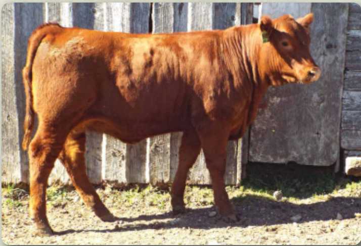
Lot 8 - Red Triple H Lulu 56B

This is a dark cherry red heifer that is very fancy in the front end, and is very well muscled with a good hip. Her dam has a beautiful udder and milks well. Her sire was a very complete bull we purchased from Badlands Angus that added extra punch to our calves. Many of his calves will be in our bull pen or heifer pen this fall.