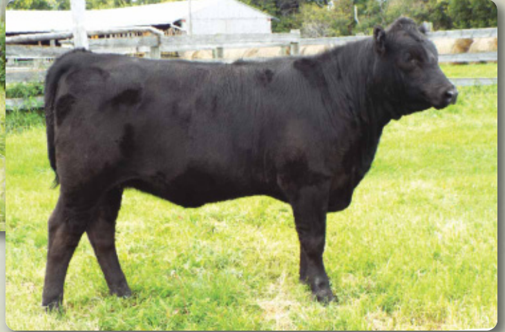
Lot 16A - Wilmo Duchess 1B

A very nice 2nd calver from TC Stout out of a Traveler 23-4, Right Time bred dam. She is in the prime of her life and has an udder that's impeccable and a heifer calf beside her that shows this cow's production. Exposed to Northern View Pioneer 103Z May 18 - Sept 1.