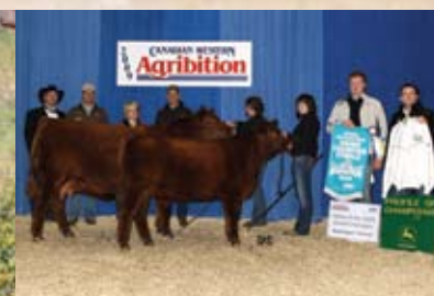
Red Six Mile Bayberry 256T CWA 2009 - Champion Female Maternal Sister to Lot 5

This stunning young female is a maternal sister to the World Angus Forum Grand Champion Female, Red Six Mile Bayberry 256T. Their dam, 120N is a designated ELITE DAM. We are keeping her first daughter to replace her and the bull calf she has at foot is slated for our show string. If you want to add a future donor cow that you can build a herd around - then do not miss out on this member of the prolific Bayberry cow family.