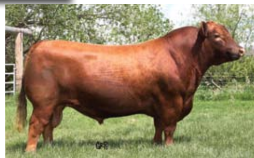
Red Six Mile Sakic 832S - Maternal Grand Sire of Lot 50

Exposed to Red Six Mile Ripped 206X from April 20 to August 19