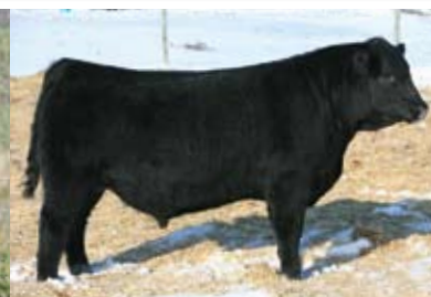
Anderson Tiger 1105Y Service Sire to Breed Creek Heifers