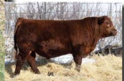
Red Six Mile Quest 117Y Service Sire of Lot 33 & 34

Exposed May 15 - July 15 Red Six Mile Quest 117Y