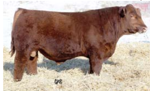
Red Six Mile Ripped 206X - Service Sire of Lot 50