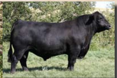
SAV Preference 9184 Sire of Lots 56, 57 & 63

Proven performance and pedigree all rolled into one outstanding female. This is, without a doubt, our favorite replacement heifer. Her dam is a front pasture kind of female. If we did not still have 349Y's dam and a maternal sister we would not be so gracious in offering her here today. Preference is really working well in our herd, adding frame and performance while still maintaining the maternal superiority we demand. This heifer is mated to the high selling bull from our 2011 Bull Sale, Six Mile Trademark 9X. His calves have really impressed us with a son of his in our show pen this fall.