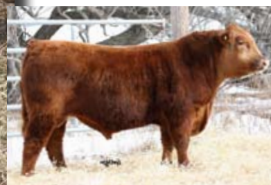
Red Six Mile Aviation 712S Sire of Lot 41

Ms Extra is a long bodied, powerhouse female. She is sired by Sakic's pen mate and paternal brother, the $ 27,000, Red Six Mile Aviation 712S. He now roams the pastures at Breed Creek Angus and Box X Ranch. Lot 40 and 41 both possess a little added fame and length of spine giving them a performance edge.