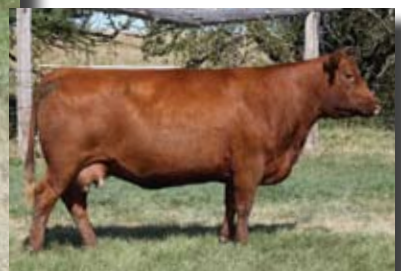
Red Bar-E-L Diamond 111T Dam of Lot 19

Bred May 21 Red Six Mile Sakic 832S Exposed June 3 – July 10 Red Six Mile Timberline 880W