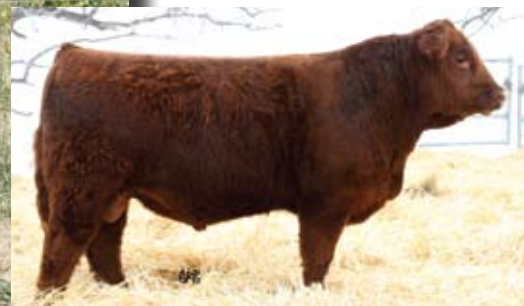
Red Six Mile Wellington 720W - Sire of Lot 50