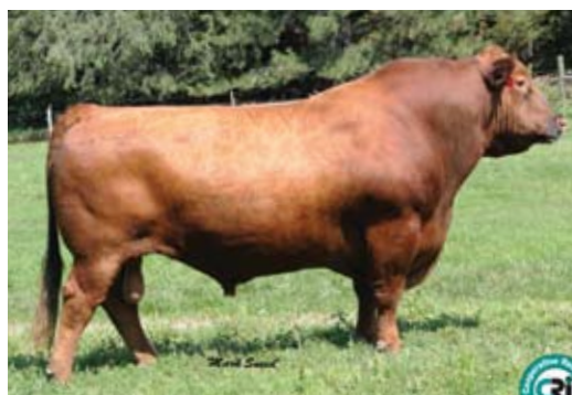
LJC Mission Statement P27 - Service Sire of Lot 16

RED CROWFOOT OLE'S OSCAR 2042M OSF MAF RED SSS GOLD EDGE 603P RED SSS ZIP 435N RED SSS LARKABELLE 727L RED MLK CRK CUB 722 OSF MAF RED THAT'LL DO KIT 35A RED SSS YUKON 440K RED SSS FLOWER 617K