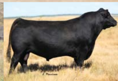
Soo Line Motive 9016 Service Sire to Breed Creek Heifers

Bred AI April 29 to Soo Line Motive 9016 Exposed May 8 to August 18 Six Mile Trademark 9X Due mid February to Six Mile Trademark 9X