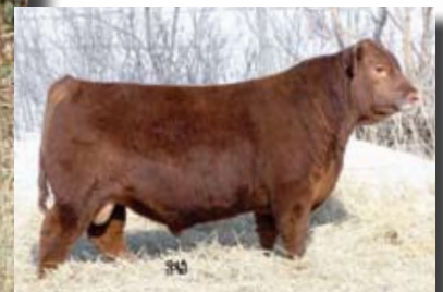
Red Six Mile Intrigue 348X Sire of Lot 41

Athena Jo is a great representation of what the outcross sire, Red Six Mile Intrigue 348X is doing for our herd. This exceptional heifer calf is loaded with capacity and natural thickness. Her two year old dam was purchased as a heifer calf from Triple L Angus, where her sire, Northline Rev 341R is excelling maternally. The EPD's poster are pedigree estimates.