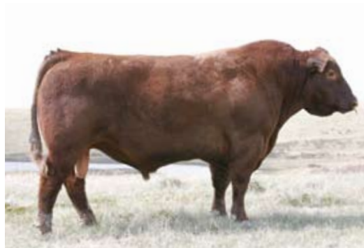
Red Towaw Indeed 104H - Service Sire of Lot 17

Bred May 22 Red Towaw Indeed 104H Exposed June 5 - July 10 Red Six Mile Timberline 880W