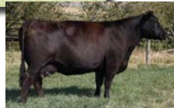
Stewart Miss Pathy 350N Dam of Lot 28

A unique outcross heifer sired by Predominant 135S. Both of her parents are black, making her a complete outcross. Her stunning phenotype adds to her already rich maternal heritage. Just an end of March heifer, this is one we will surely be watching in the future.