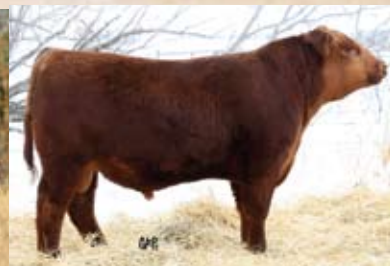
Red Six Mile Wind Chill 828W Sire of Lots 36 & 37

Stunning profile and loaded with class. The Syringa cow family has been an important building block at Six Mile. This first of March female is sired by the Wind Chill bull that we own in partnership with Lodoen Cattle Co., ND. Wind Chill sired the Reserve National Champion Red Angus Bull at Denver 2012 – Red Six Mile Smokin Gun 133Y, he also sired the Champion Junior Heifer Calf Champion at that same show, Red Six Mile Marta 300Y.