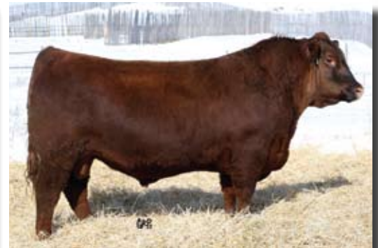
Red VGW Game Plan 816 - Sire of Lot 17