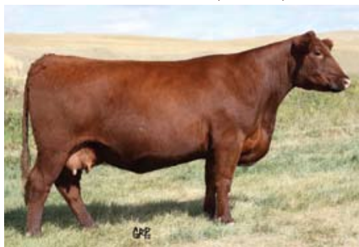
Red Six Mile Enid 878W - Dam of Lot 3