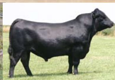
Connealy Impression Sire of Lot 54

Duchess has all the splash and style you could want in a heifer calf. Her dam, 415S always gets it done for us. Her son, Six Mile Gear Grinder 275Y, sold in our spring bull sale as our second high selling Black Angus bull to Gilbert Cattle Co., SK. We used the Connealy Impression bull to do exactly this – give us females you can build a herd around.