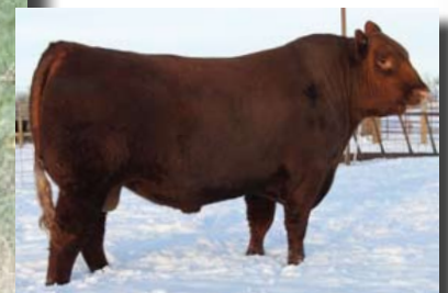
Red Badlands Net Worth 23U Sire of Lot 21

Bred May 19 Red VGW Game Plan 816 Exposed May 20 - July 10 Red VGW Game Plan 816