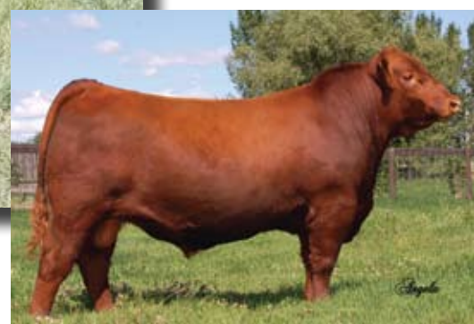
Red Lazy MC Cowboy Cut - Sire of Lot 13

Bred May 15 to Red Six Mile Game Face 164Y Exposed May 30 – July 10 to Red VGW Game Plan 816