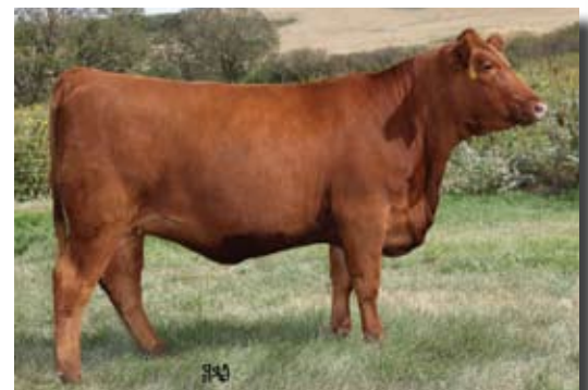
Red Six Mile Duruba 129Y - Lot 17