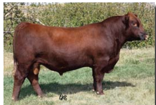
Red MRLA New Era 87Y - Service Sire of Lot 9