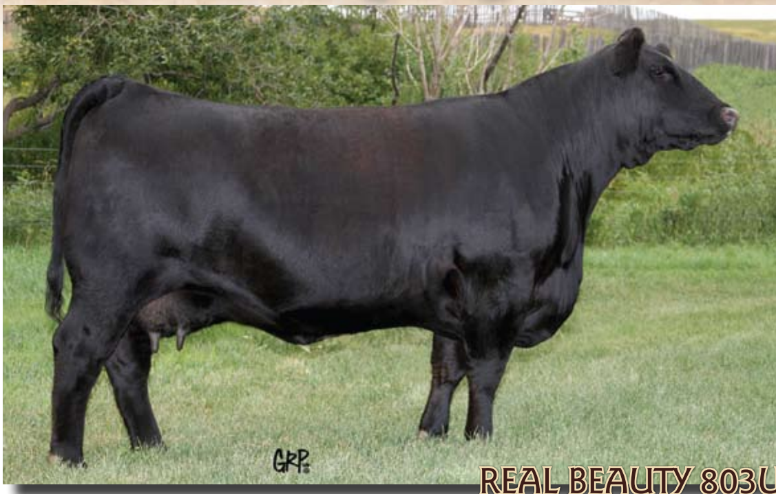
REAL BEAUTY 803U