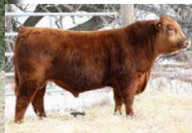
Red Six Mile Aviation $27,000 son for Patsy 256P