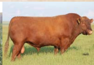
Red RMJ Redman 1T Sire of Lot 49 Embryos