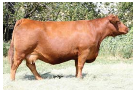
Red RSL Miss Selma 384F Dam of Lot 13 & Lot 11