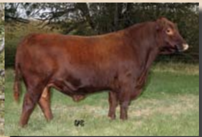
Red Six Mile Timberline 880W Service Sire of Lot 18

A sale attraction with an impeccable EPD profile. We have used Norseman King in our highly maternal herd with a great amount of success. Perhaps our best known Norsemen King daughter is Shawnee 116T who is the dam of the Genex sire, Win-Chester 745W and the Accelerated sire, Ruger 221X. Raised by a two year old, Lot 18 earned a weaning ratio of 112 and a yearling ratio of 105 making her a performance leader.