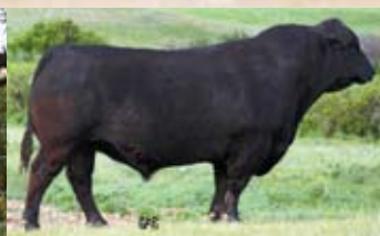
Peak Dot Predominant 135S Sire of Lot 28