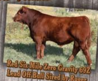
Red Six Mile Zero Gravity 69Z Lead Off Bull Sired by Ruger