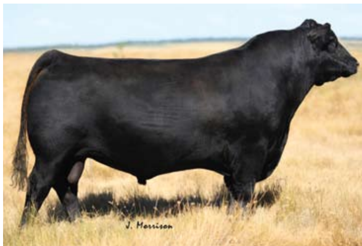
Soo Line Motive 9016 - Sire of Lot 58

All embryos are located at Davis Rairdan Embryo Facility in Alberta. Guaranteeing one pregnancy if implanted by a licensed and accredited embryo technician.