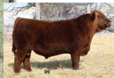
Red Six Mile Game Face 164Y Service Sire of Lot 31

Bred May 31 Red Six Mile Game Face 164Y Exposed June 10 – July 10 Red VGW Game Plan 816