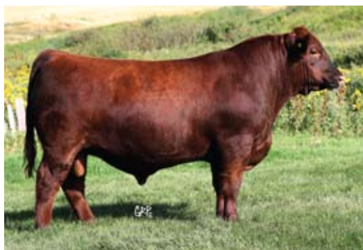
Red Benchmark Better Beef - Sire of Lot 3