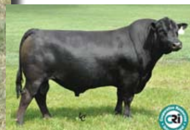
Benfield Substance 8506 Sire of Lot 55

This precious gem really hits the mark. Her dam is a big bodied, sound uddered female that we were lucky enough to source from Dwajo Angus. We used her sire, Benefield Substance after being impressed with his progeny in the Ellingson herd in North Dakota. Every day I think this heifer calf gets better and she will be missed in the heifer pen for sure, but will be a welcomed addition to yours.