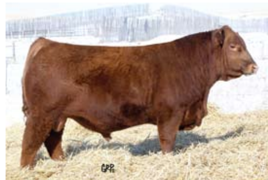
Red Six Mile Travelocity 318X - Sire of Lot 7 Owned with Lodoen Cattle Co., ND

Lady Zena 182Z is the third outstanding heifer calf in a row for the super cow, 589R, who is offered as a choice here today. Every previous heifer calf out of 589R has made our show pen, and 182Z could run with the best of them. This sweetheart represents the first calf crop out of our $27,000 high selling bull, Red Six Mile Travelocity 318X who is working in the Lodoen Cattle Co. herd in North Dakota.