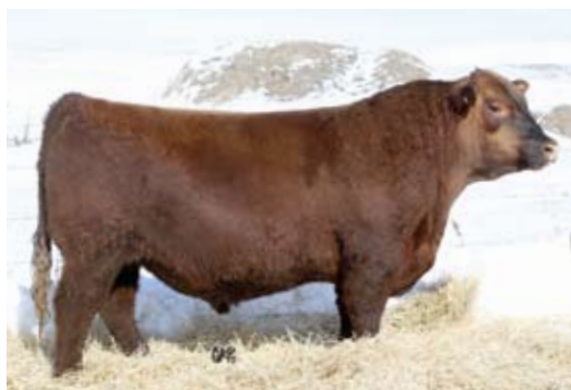
Red SSS Bucc 30U - Sire of Lot 16