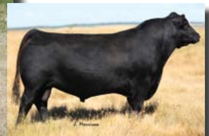
Soo Line Motive 9016 Service Sire of Lot 57

Bred May 18 Soo Line Motive 9016 Exposed June 1 – July 15 Connealy Complete 8454