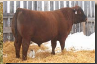
Red Six Mile Gamer 224X Sire of Lot 40

Empress is truly a phenomenal show prospect with the EPD profile to complement her deep red, sweet fronted phenotype. If there was one heifer calf that you should see in person then, Lot 42 is it. We have loved this heifer calf since birth and it was a hard decision to offer her here. Her two year old mother has done a superb job and adds maternal merit to this future herd builder.