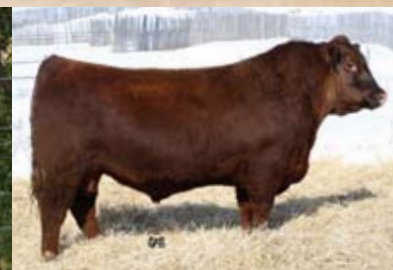
Red VGW Game Plan 816 Service Sire of Lot 30

An excellent brood cow in the making. Lassie 244Y earned a 109 wean index at the side of her stylish dam. This cow family is known for their solid foot structure and productivity.