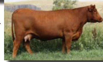
Red Six Mile Flower 713S Granddam of Lot 29

Flower 295Y is a deep bodied, attractive female who profiles much like her prolific grandma, 713S. Lot 29 represents the same cow family that produced the SEMEX sire, Red Six Mile Timberline 880W. Watch for her maternal brother in our 2013 Bull Sale - he will impress.