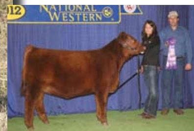
Red Six Mile Marta 300Y U.S. National Champion Junior Heifer Calf at Denver 2012

Attention Junior members – this classy heifer is an elegant show heifer prospect. Her sire, Wind Chill, is known for siring females with this kind of presence and style. Then after she is done showing, she has the maternal merit to make a future donor cow. Her maternal brother was selected out of our 2012 bull sale by Peacock Red Angus, TX.