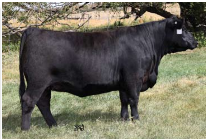
Six Mile Beyond Beauty 124Y - Full Sibling to Lot 59 Embryos

These embryos will be full siblings to the high selling heifer calf in last year's female sale, Six Mile Beauty 124Y who brought $15,500 for a half interest, selling to Blairs.Ag Cattle Co. This full sibling, Beauty 124Y posted a 126 wean index and a 103 yearling index making her a performance leader teamed with incredible maternal merit. As a heifer calf, Beauty 124Y won many banners and accolades. She stood at her mother's side as she was crowned the National Champion Black Angus Female and was named to the prestigious Top Ten at Agribition's RBC Beef Supreme Challenge.