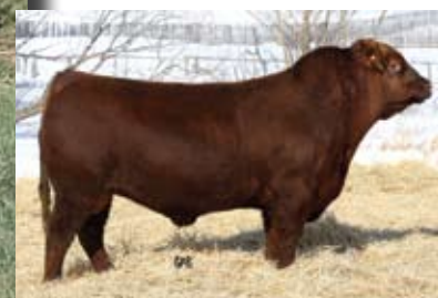
Red Brylor Redwood 50U Service Sire to Lot 6

Bred May 11 Red Six Mile Game Face 164Y Exposed May 25- July 10 Red Brylor Redwood 50U