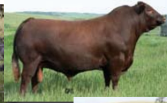
Red Six Mile Timberlake 180T Sire of Lot 29