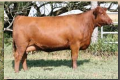
Red Six Mile Lassie 377P Dam of Lots 20 & 21

The genetic combination of Lassie 377P and Reload is as predictable as they come. Class, style, moderation and exceptional production potential. We have a full sister to Lot 20 producing in our herd and she is raising a big bull calf while maintaining excellent body condition. The dam of both Lot 20 and 21 is the show stopping female, Red Six Mile Lassie 377P who holds the title of high selling female at the historic Red Roundup sale. Note the exciting mating to the $20,000 Red Six Mile Hired Gun 137Y who sold to Circle 7 Angus and Sodergren Ranches.