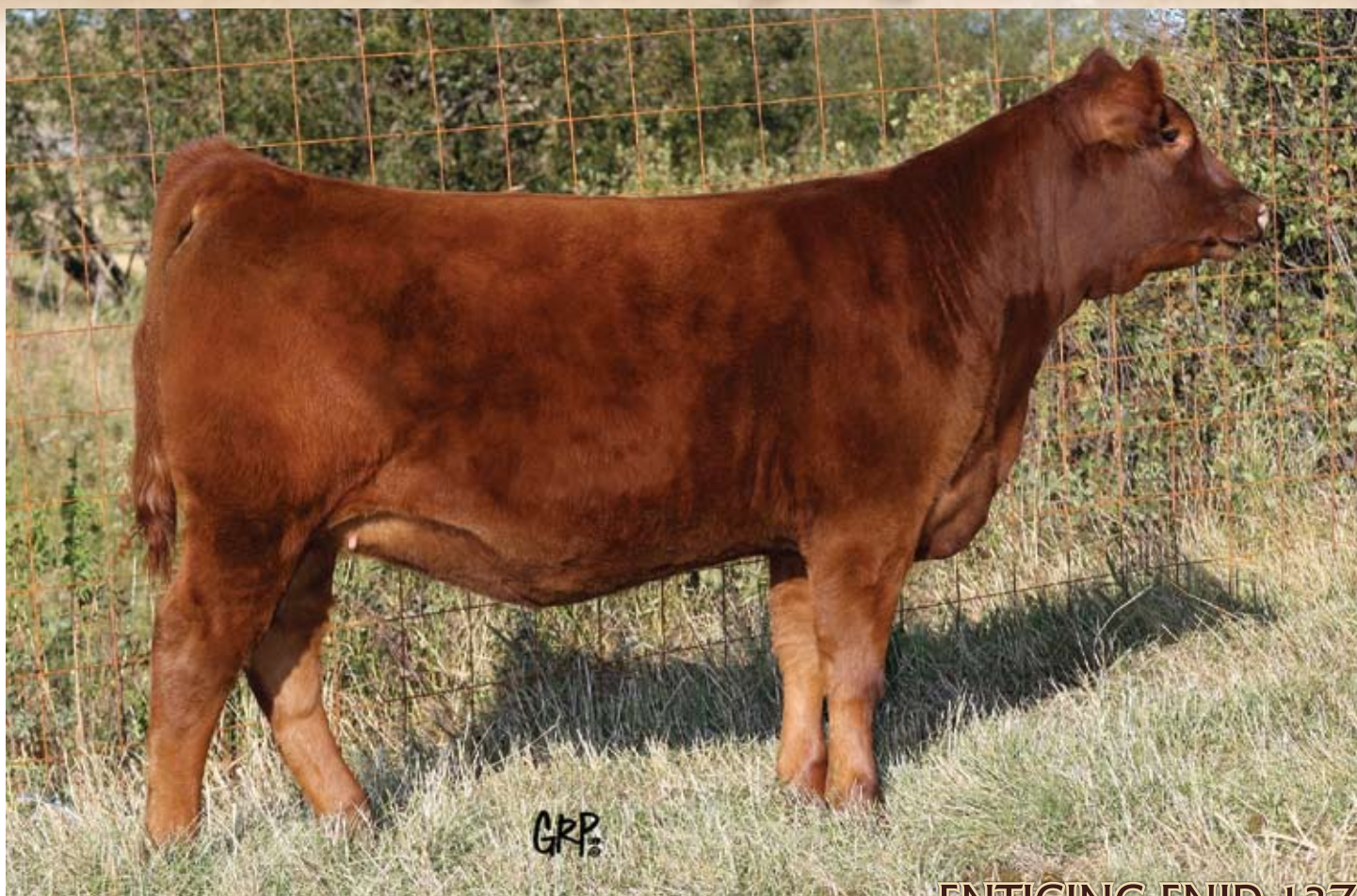
ENTICING ENID 13Z