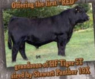
Grandsons of HF Tiger ST sired by Stewart Panther 19X