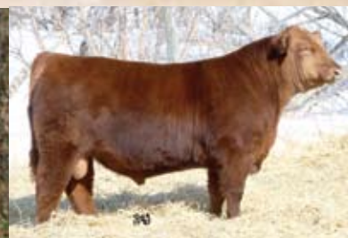
Red Six Mile Ruger 221X Sire of Lot 40

This class act is sired by the Accelerated sire, Red Six Mile Ruger 221X. Ruger... remember that name – because after his first sons sell next year in our bull sale, you will want to be a part of this gene pool! Another March show prospect whose dam posted a wean index of 117 on her first calf!