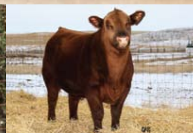
Red Six Mile Game Face 164Y Maternal Brother to Lot 39