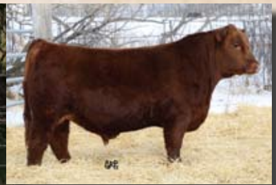
Red Six Mile Hired Gun 137Y Service Sire of Lot 32

Striking femininity are adequate words to describe this female. The Lakota cow family gives Lot 32 a rich maternal heritage. Her service to the $20,000 Hired Gun adds to her future earning potential.