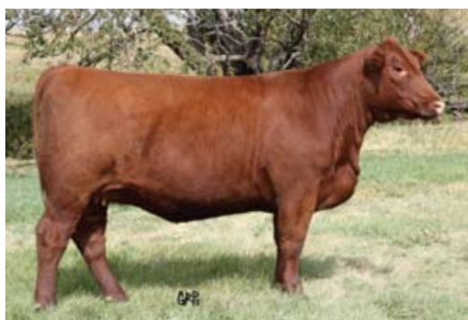
Red Six Mile Flower 146Y - Lot 16