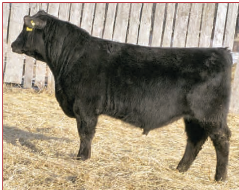
OAKWOOD RIGHT TIME 3Y - LOT 3Y