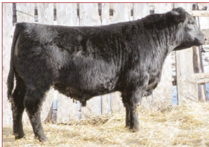
EASTONDALE DURATION 21'11 - LOT 21Y