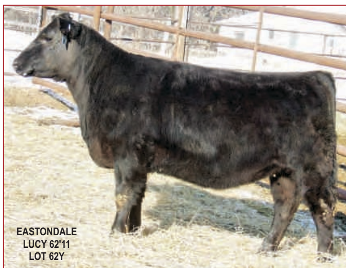
EASTONDALE LUCY 62'11 LOT 62Y