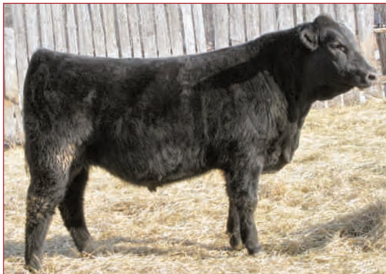
OAKWOOD RIGHT TIME 1Y - LOT 1Y