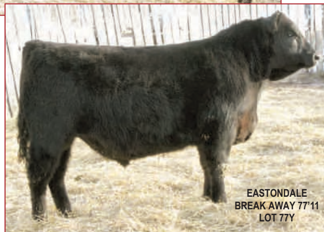
EASTONDALE BREAK AWAY 77'11 LOT 77Y