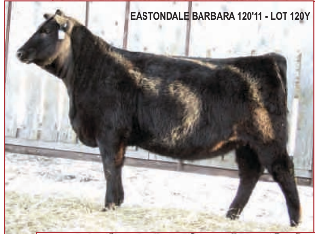
EASTONDALE BARBARA 120'11 - LOT 120Y