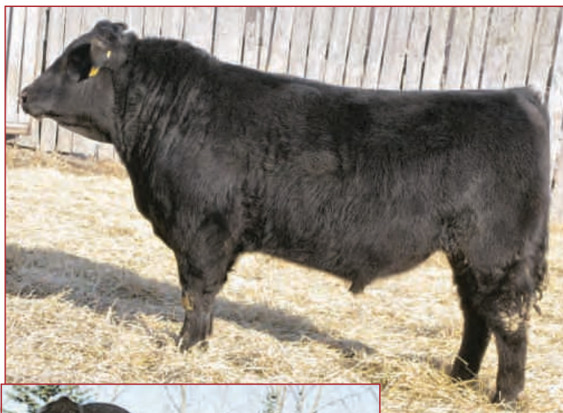
EASTONDALE ROAR 20'11 LOT 20Y