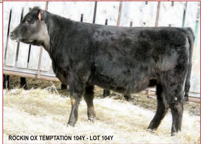
ROCKIN OX TEMPTATION 104Y - LOT 104Y