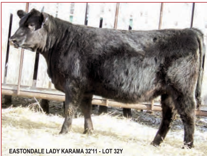
EASTONDALE LADY KARAMA 32'11 - LOT 32Y