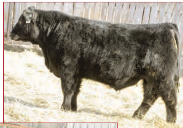
EASTONDALE TRADITION 92'11 LOT 92Y