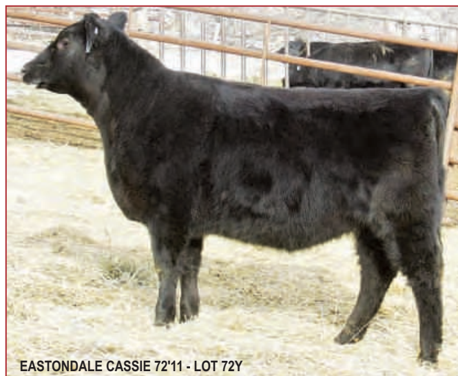
EASTONDALE CASSIE 72'11 - LOT 72Y