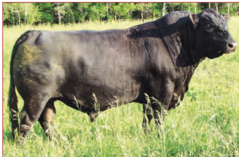
B HILLS FRL DURATION 606