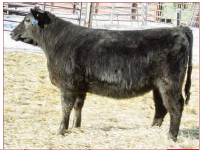
EASTONDALE SANDA ROSE 96'11 LOT 96Y