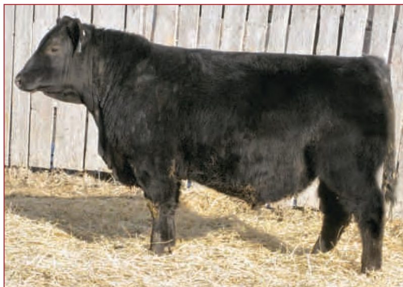
EASTONDALE VALUE 54'11 - LOT 54Y