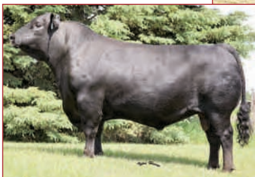
EASTONDALE BREAK AWAY 32'07 - SIRE OF LOT 103Y