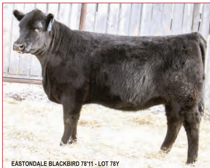
EASTONDALE BLACKBIRD 78'11 - LOT 78Y