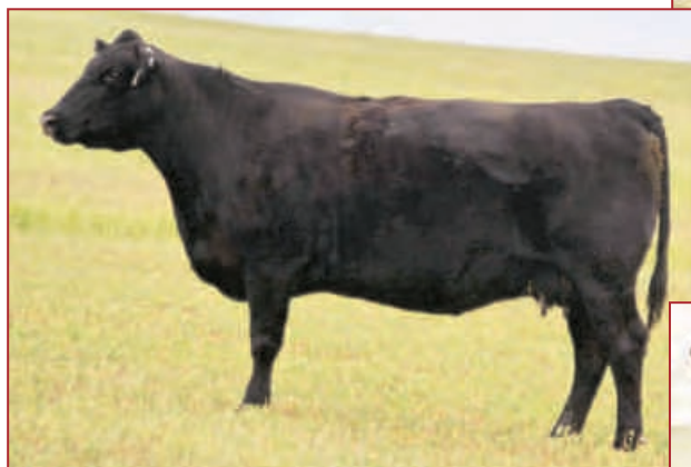
EASTONDALE ENCHANTRESS 54'05 DAM OF LOT 68Y