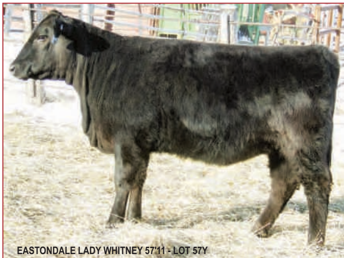
EASTONDALE LADY WHITNEY 57'11 - LOT 57Y