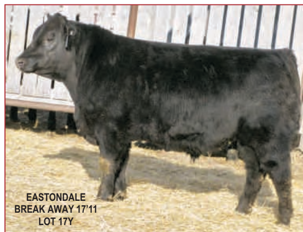
EASTONDALE BREAK AWAY 17'11 LOT 17Y

- Sired by the Reserve World Champion Bull at the World Forum, Eastondale Break Away 32'07