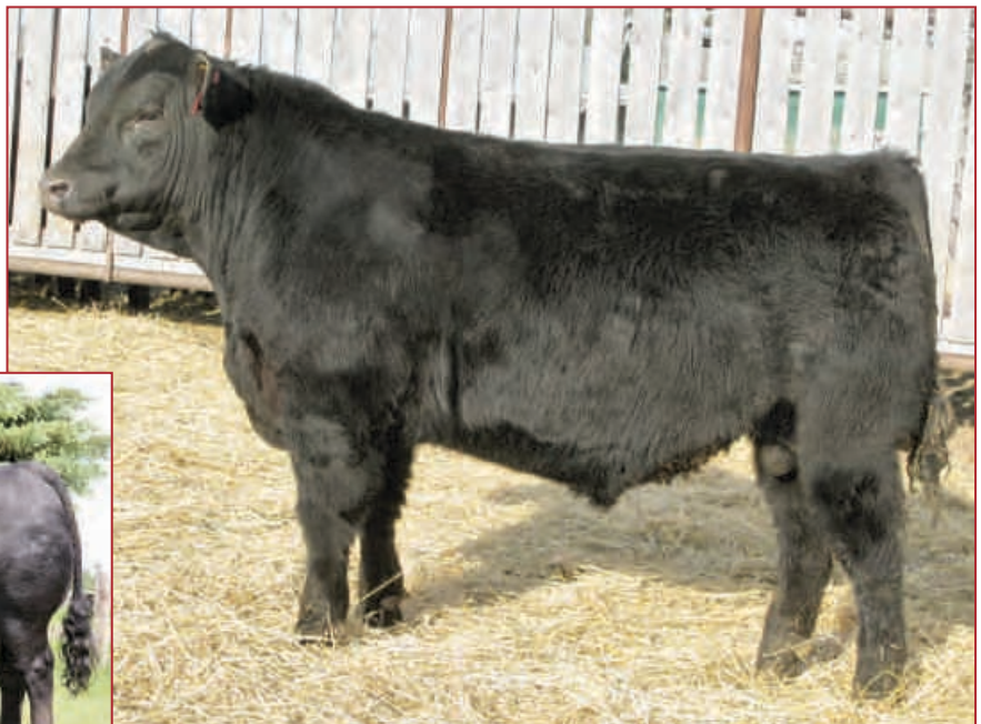
ROCKIN OX SNEEKY PETE 103Y - LOT 103Y