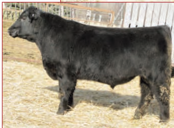
EASTONDALE TRADITION 112'11 LOT 112Y