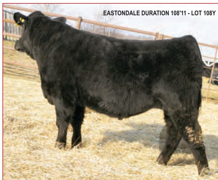
EASTONDALE DURATION 108'11 - LOT 108Y