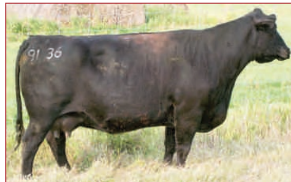
GDAR FOREVER LADY 9136 - DAM OF LOTS 20Y & 51Y