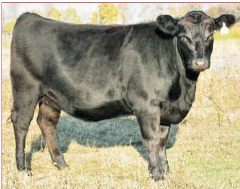
TYPICAL EASTONDALE RIGHT TIME 62'03 DAUGHTER