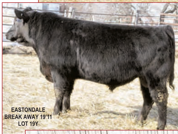
EASTONDALE BREAK AWAY 19'11 LOT 19Y