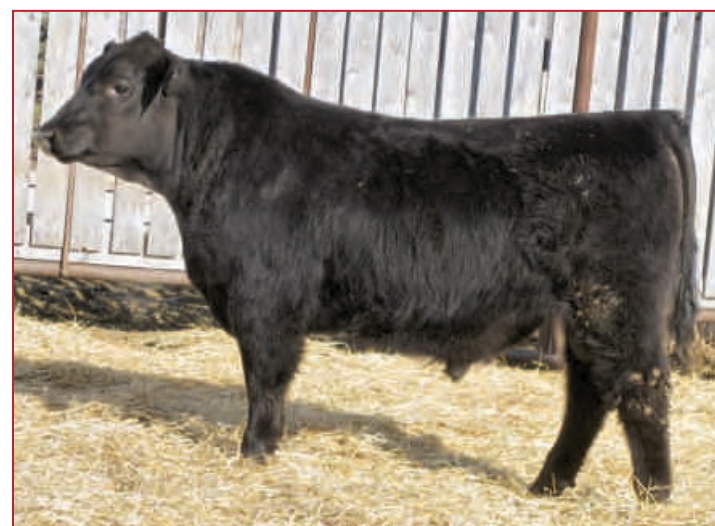
EASTONDALE DURATION 27'11 - LOT 27Y