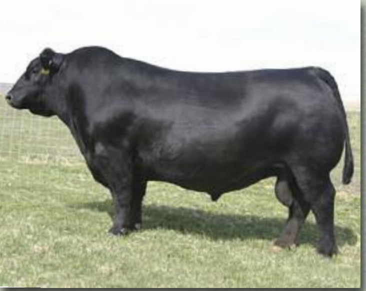
S A V Net Worth 4200 - Sire of Lot #37 - Gillco Pride 5A

Sells open, haltered and vaccinated with Triangle 4.