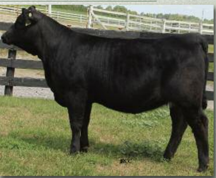
Lot #21 - Curraghdale Patricia 3A - HEIFER CALF