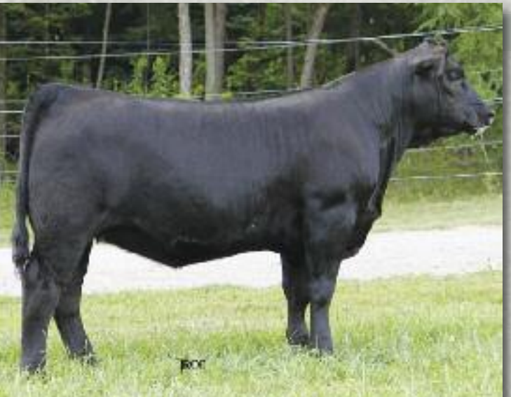
Lot #27 - Worth-More Shakura 3A

Don't miss this mid February sweetheart on Sale Day!