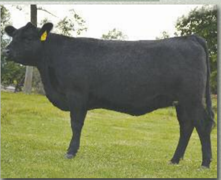
Lot #55 - Cedarhill Zephyr 213Z

She A.I.'ed to breed legend, "BR New Frontier 095", and pasture exposed to the 2012 RAWF Reserve Bull Calf Champion, "Cedar Hill Serj Tankian 111Z".