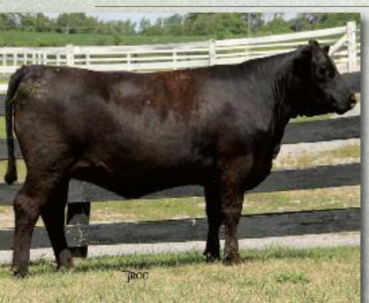
Lot #7 - Curraghdale Scarra 27Z

Lot #6 sells bred to SAV Thunderbird. LLB purchased a bred heifer carrying service to this bull and she went on to produce their top selling bull calf in last fall's sale for $80,000 1/2 interest.