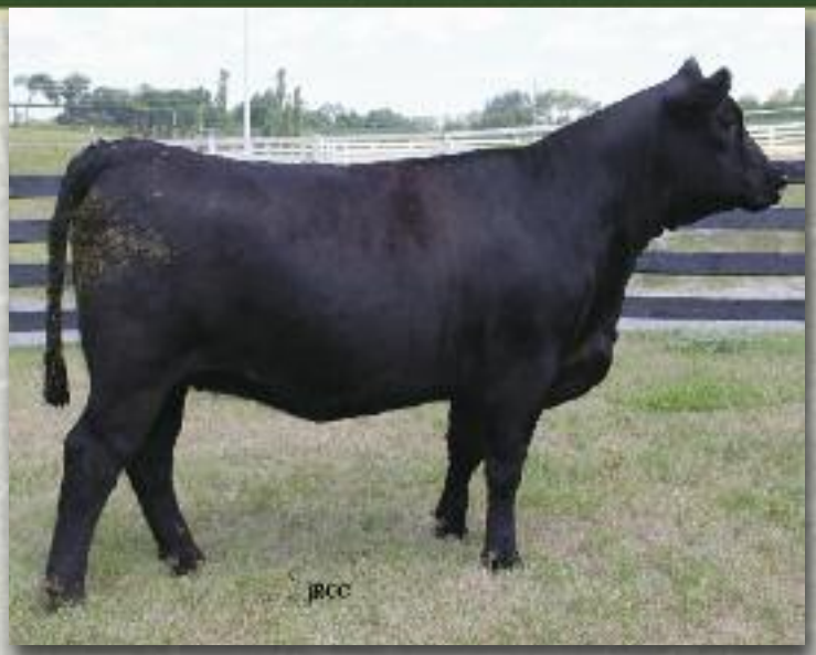
Lot #5 - Curraghdale Rachel 19Z

CONSIGNED BY CURRAGHDALE CATTLE CORP. - 905-852-4632 CURRAGHDALE RACHEL 19Z