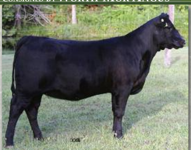
Lot #26 - Worth-More Erroline 7A

CONSIGNED BY WORTH-MOR ANGUS - 705-653-4597 WORTH-MOR ERROLINE 7A