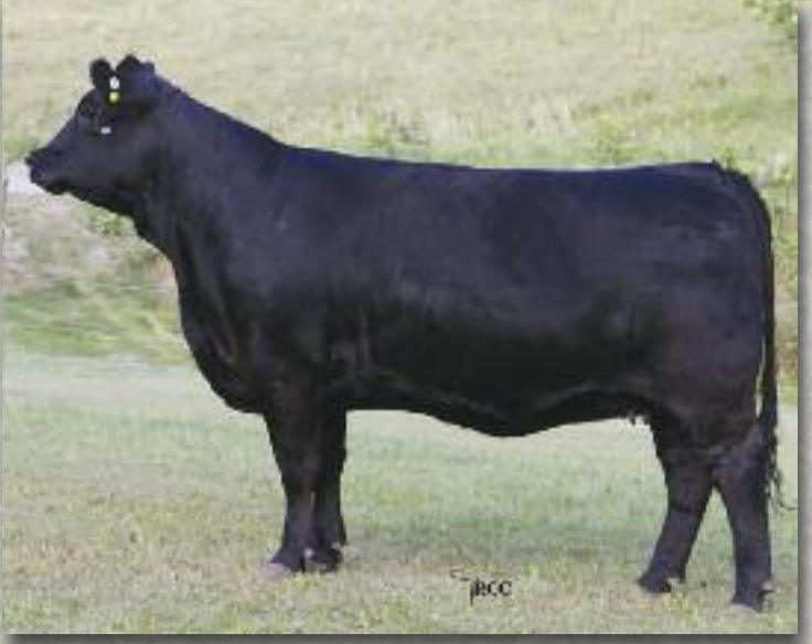
Lot #29 - WMC Suzy 14Z

"New Attraction" out of a "Final Answer" with "095" grandam - what a pedigree! Tonnes of performance in this young heifer who comes bred to the upcoming Semex Sire, "Vin Mar Oreilly Factor", who had lots of great looking calves on display in Denver this spring!