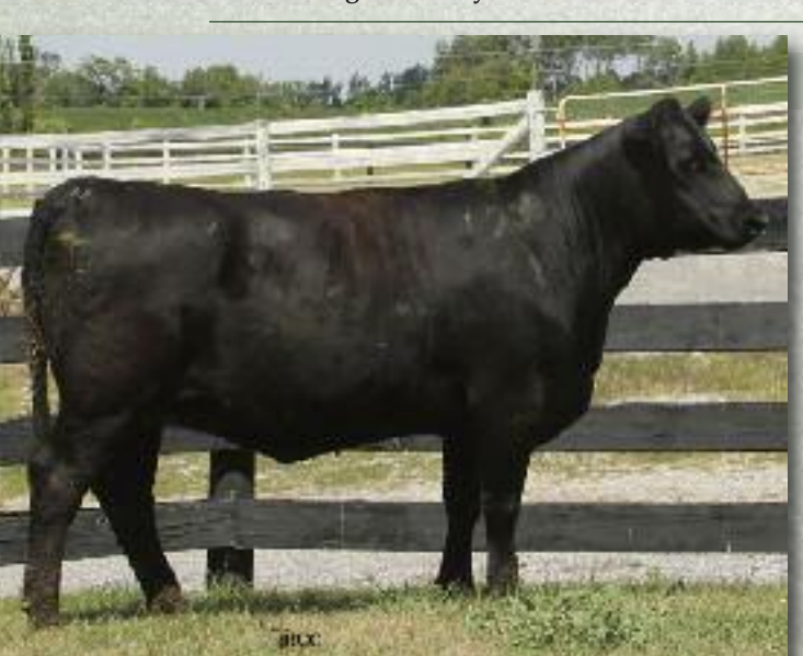
Lot #12 - Curraghdale Eileen 31Z

We have a group of "Providence" daughters to offer in this sale. This female goes back to one of the herd's foundation cows from Stalburn Farms in New Liskeard.