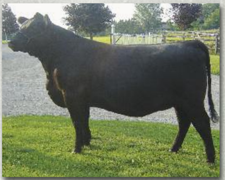
Lot #36 - Gilco Pride 7Z

Sells haltered and vaccinated with Triangle 4