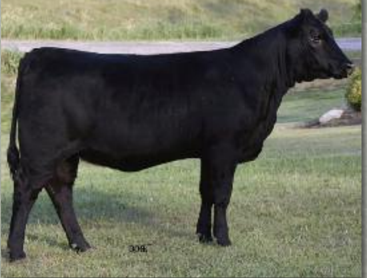
Lot #28- Worth-More Ladybess 1A

BW: +2.4 WW: +40 YW: +76 Milk: +25 TM: +44