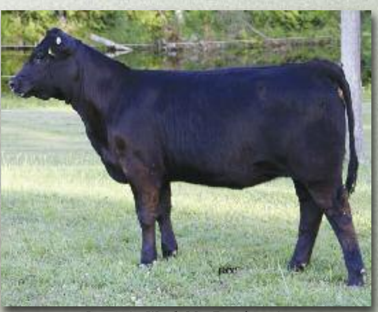
Lot #30A - Worth-Mor Favorite 15A

This very stylish "New Attraction" heifer calf will be sure to catch your eye on Sale Day! She will make a great Jr. Yearling 4-H project for next year or a great cow to add to your herd!