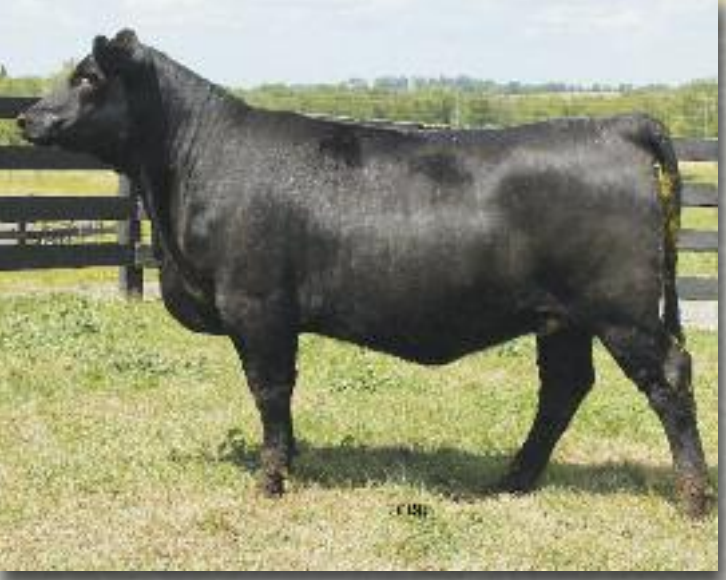
Lot #19 - Curraghdale Queen 63Z

9W out of a "Density" daughter that is also in this sale. A big volume heifer with a ton of rib – she should make a great cow!