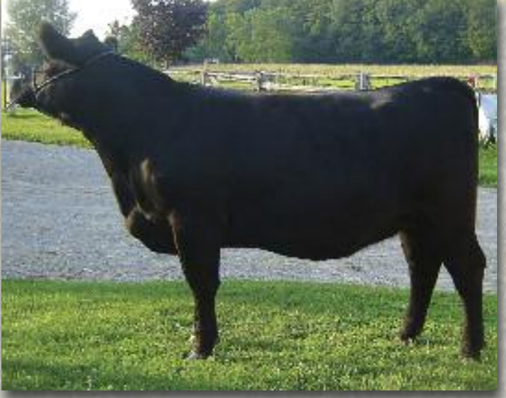
Lot #35 - Gillco Pride 3Z

Sells haltered and vaccinated with Triangle 4