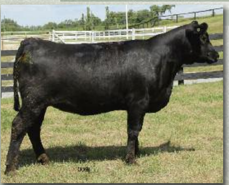
Lot #18 - Curraghdale Lucy 60Z

Another "9W" daughter out of a great producing Geis cow and she's bred for a January calf by "Thunderbird".