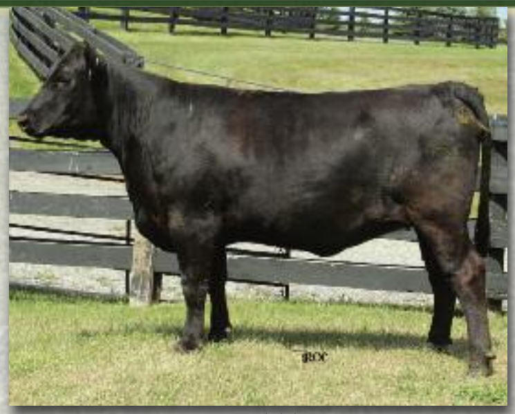
Lot #13 - Curraghdale Lucy 3Z

A "Predominant" heifer out of the old "Widespread" cow here at Curraghdale. The old "MSU 8401" cow was one of the best to come to Curraghdale.