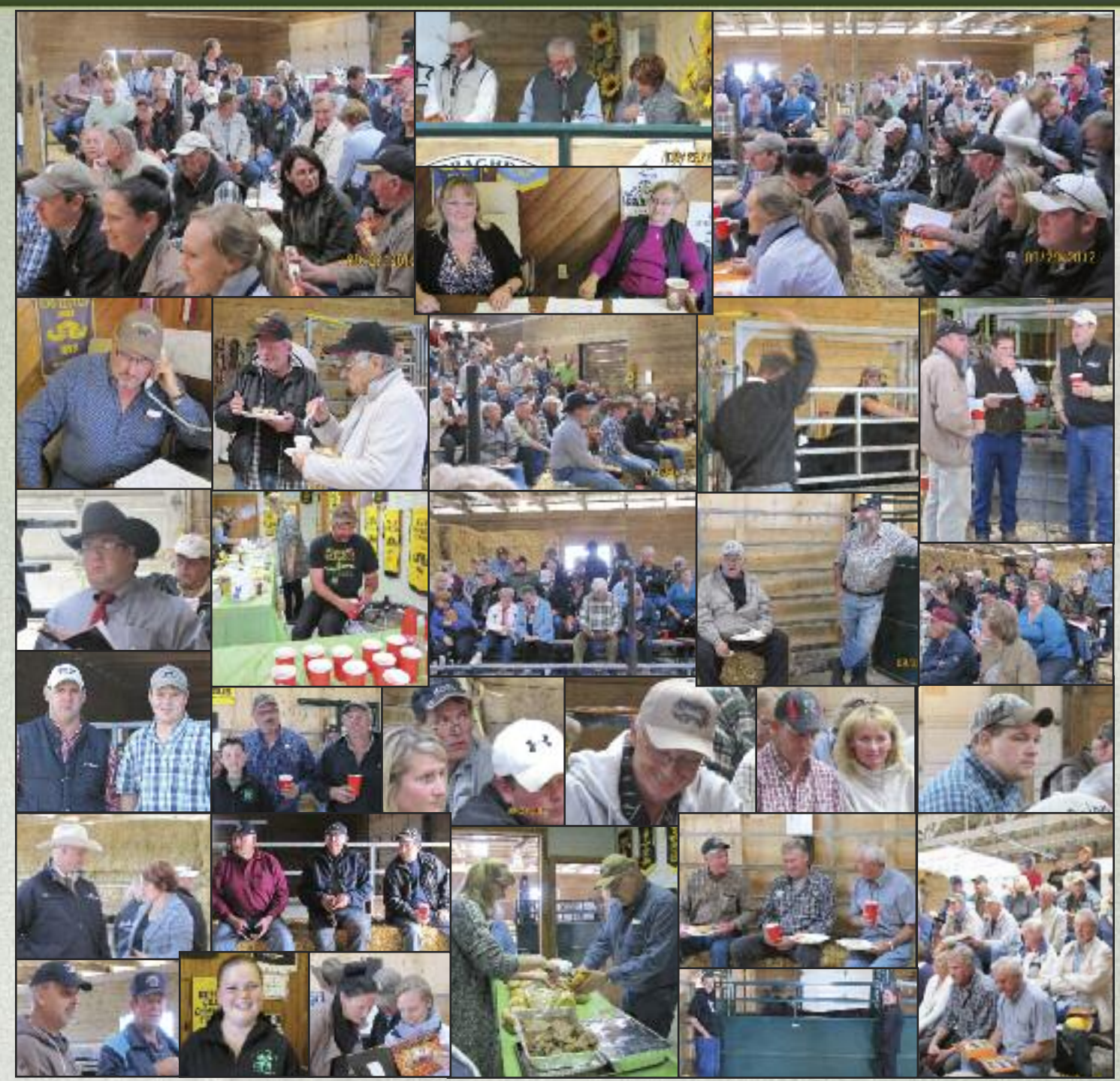
TERMS & CONDITIONS OF SALE - EASTERN EXTRAVAGANZA 2013!!