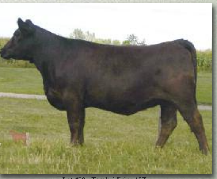
Lot #50 - Tambri Erica 18Z

"18Z" was bred on March 26, 2013 to the Semex calving ease sire, "Vin Mar O'Reilly Factor", a "Final Answer" son, and exposed to our herd bull sired by "Hoover Dam". Checked pregnant to Al date so expect a New Year baby!