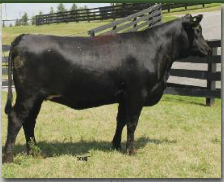
Lot #16 - Curraghdale Agnes 54Z

CONSIGNED BY CURRAGHDALE CATTLE CORP. - 905-852-4632 CURRAGHDALE AGNES 54Z