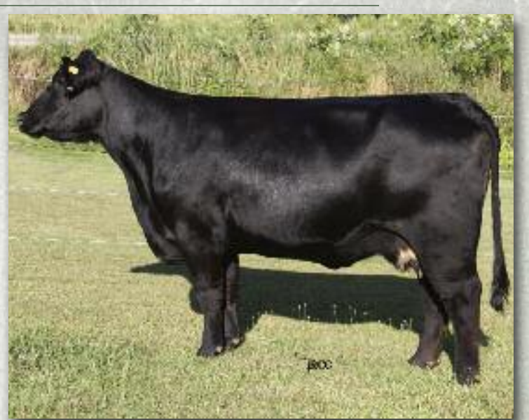
Lot #30 - WMC Favorite 1)

This cow has fertility written all over her - she calved the start of April, came right back around in heat a few days later so we bred her and she is confirmed safe for the end of January to "SAV Heritage".