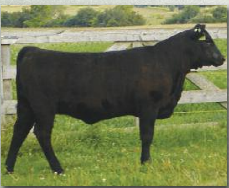
Lot #34A - Gillco Lady 8A

BW: +2.8 WW: +28 YW: +56 Milk: +17 TM: +31