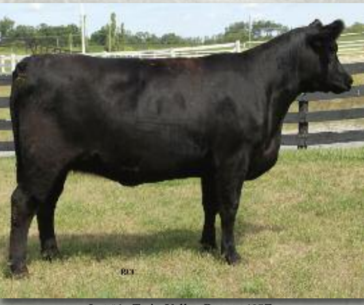
Lot #6 - Twin Valley Beauty 125Z

CONSIGNED BY CURRAGHDALE CATTLE CORP. - 905-852-4632 TWIN VALLEY BEAUTY 125Z