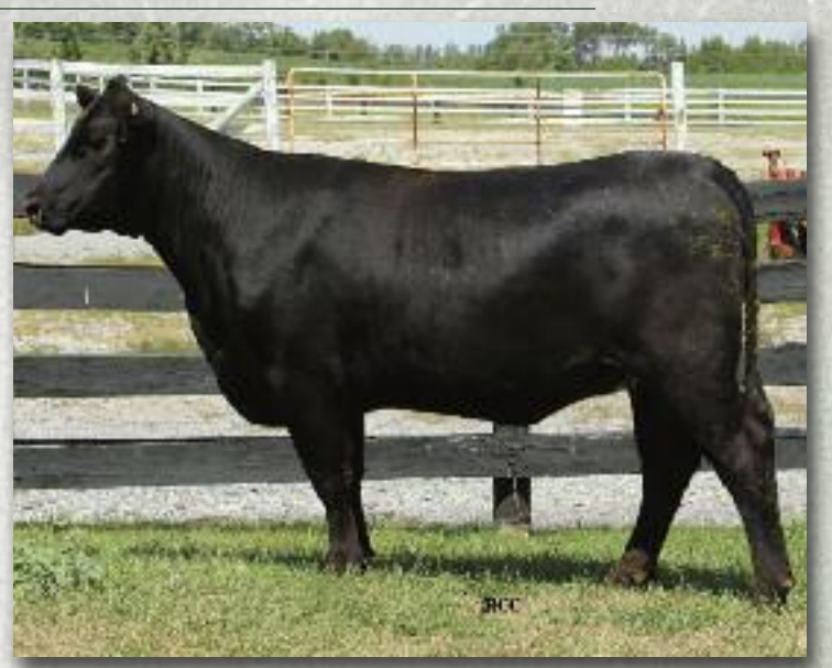
Lot #14 - Curraghdale Ginger 29Z

A "Final Answer" / "Density" female that is bred early to the "Cole Creek Cedar Ridge" bull. Best of all, this sweetheart is a "Barbara" and they have been a great cow family, not only here, but wherever you find them. Great cow family!