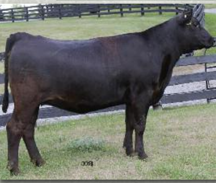
Lot #11 - Curraghdale Mayflower 44Z

Same cow family as Lot #8. We have several daughters of our "416" son in the sale. The maternal traits of "416" breed are very true and I'm sure he will pass these traits on to these females.