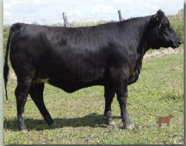
Lot #44 - Tullamore Middlebrook 16Z

6Z's dam is an outstanding "Pine Drive Big Sky" cow.