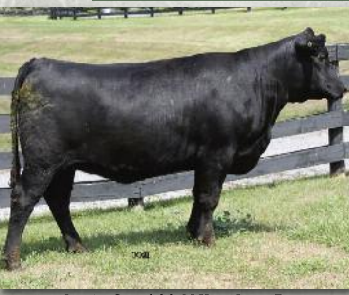
Lot #17 - Curraghdale McHenry Lass 51Z

All of the "9W" daughters are similar patterned. "54Z" is out of a big volume "095" daughter and is bred to a son of "Final Answer".