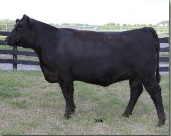
Lot #15 - Curraghdale Zara 47Z

A February daughter of our "416" herd bull. These "Traveler 9W" daughters are going to make great cows. Lots of volume and capacity in these heifers.