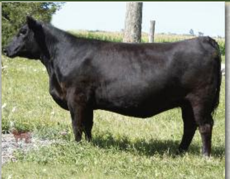
Lot #48 - Tambri Tibbie 3Z

"3Z" is bred to "BC Lookout" who is deceased, therefore this semen is hard to get. Expect a very thick correct New Year's baby!