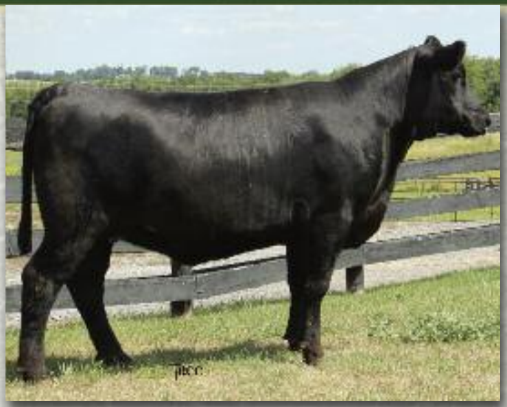
Lot #10 - Curraghdale Barbara 40Z

CONSIGNED BY CURRAGHDALE CATTLE CORP. - 905-852-4632 CURRAGHDALE BARBARA 40Z