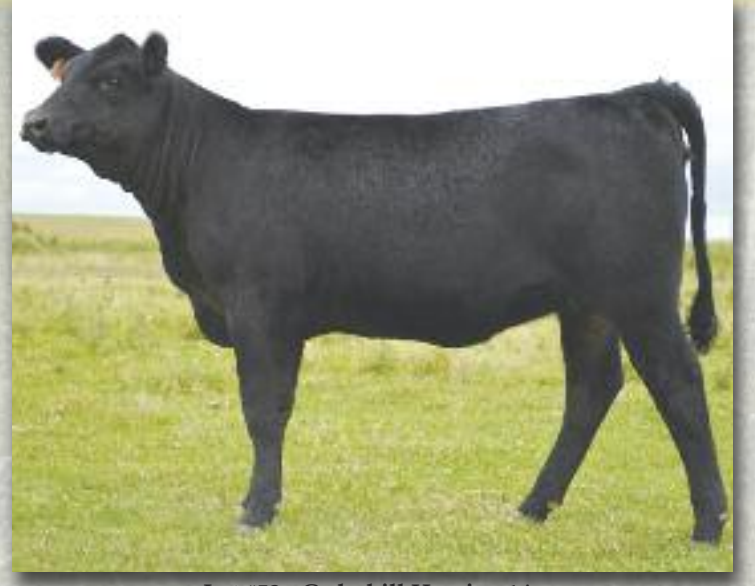
Lot #53 - Cedarhill Heroine 1A

"Heroine 1A" is sired by the great "Soo Line Motive 9016" and is a genetic package with a bright future ahead of her.