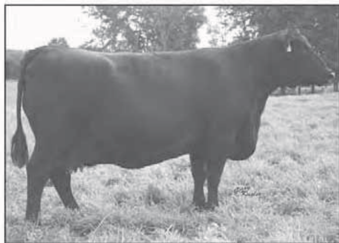
ROYAL PERSEPHONE DRCC 4151P