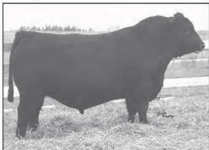
ROYAL HELIOS DRCC 8063U