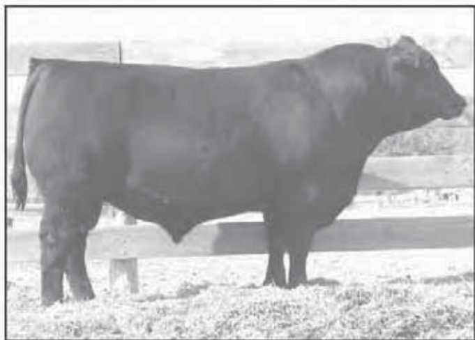
ROYAL ON TIME DRCC 6059S