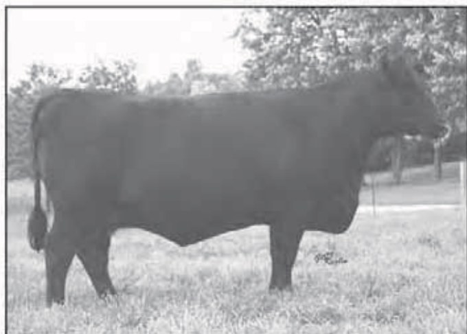
SH PRIDE 235 5115 Dam of Lot 7