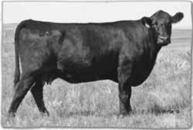
LOT 93 - DOUBLE AA ELENA 460'05