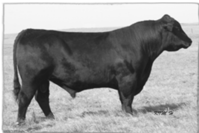
REFERENCE SIRE B - DOUBLE AA BARDOLIER 47'06

EPDs: BW: I+3.9 5% WW: I+31 5% YW: I+59 5% Milk: I+13 5% TM: I+28 YG: I+28 5%