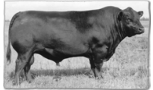
Bardolene of Old Post 5

20 Vials - These vials should be used to transplant some cows, this old bull had that special something when he clicked with a mating the calves were sensational.