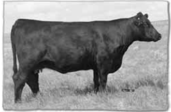
LOT 56 - DOUBLE AA ANNIE K 226'06