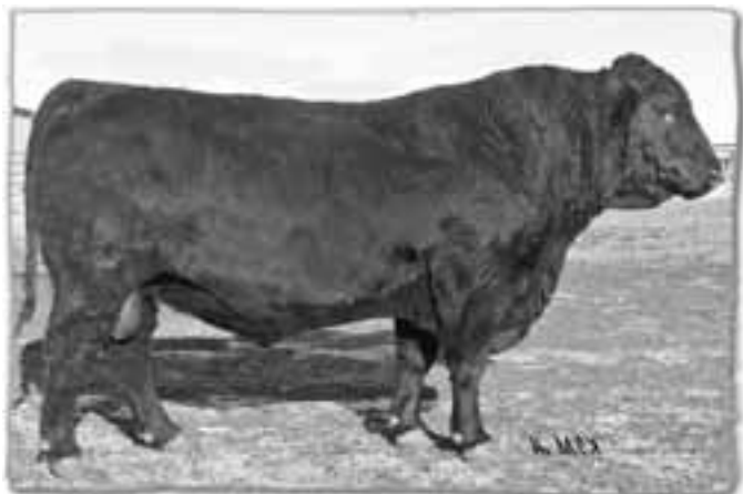
DOUBLE AA BARDOLINE 422'03 - Sire of Lots 216 to 220 Co-owned with Remington Land & Cattle