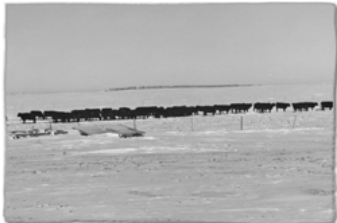
DOUBLE AA COW HERD