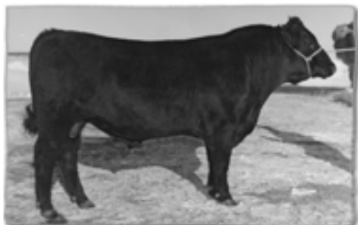
Double AA Bardolene 606'78