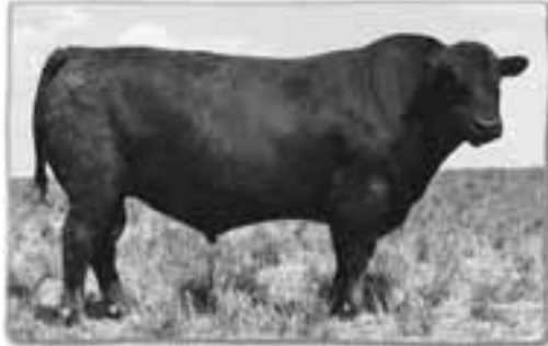
Angus Acres Bandy 96X

233 Vials - Great bull, correct, clean, stylish. Use on any good females, sires good cows and bulls.