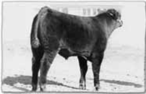
Larkspur Bar Lad 1J