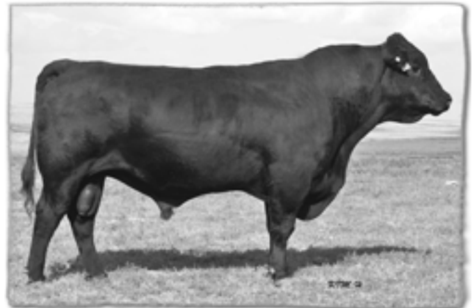
SASKALTA BARDOLIER 136R