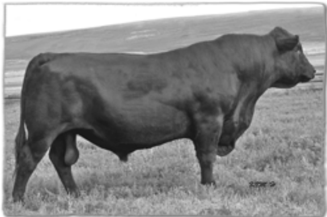
DOUBLE AA BARDOLENE 223'05 - Sire of Lots 294 and 295