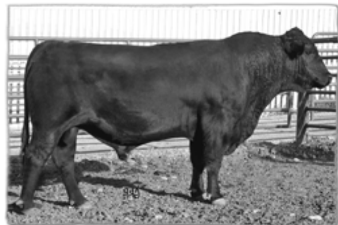
DOUBLE AA BARDOLIER 610'06 Co-owned with Remington Land & Cattle

EPDs: BW: I+2.9 5% WW: I+35 5% YW: I+64 5% Milk: I+9 5% TM: I+26 YG: I+29 5%