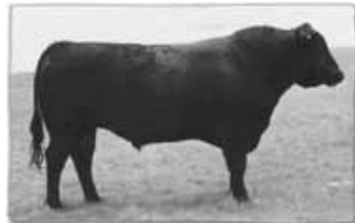
Northern Prospector 725

125 Vials - Want something a little different? Can use him on any type of female.