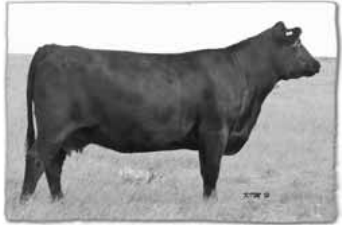
LOT 92 - DOUBLE AA ANNIE K 625'05