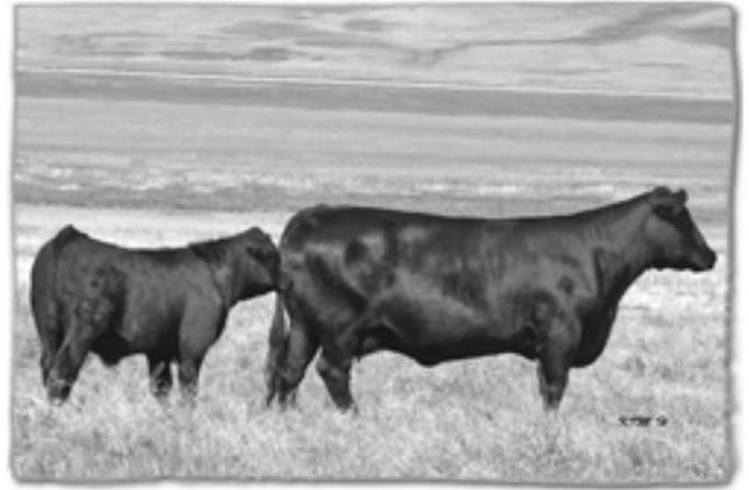
LOT 142 - DOUBLE AA ANNIE K 79'04 & 2009 BULL CALF

147A Female Double AA Ruby 17'09 RCE 17W 1520688 March 29, 2009 BW: 83 lbs. Sire: Double AA Bardolene 47'04 -1218674-