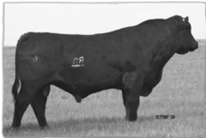
REFERENCE SIRE C - DOUBLE AA HICK HOP 47'07

EPDs: BW: I+4.9 5% WW: I+43 5% YW: I+80 5% Milk: I+13 5% TM: I+35 YG: I+37 5%