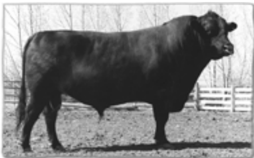
Bardolene of Peak Dot 204R

200 Vials - Started our Bardolier line. If you want stretch and scale use this bull, good milkers.