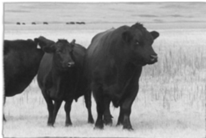
204R AS A THREE-YEAR-OLD