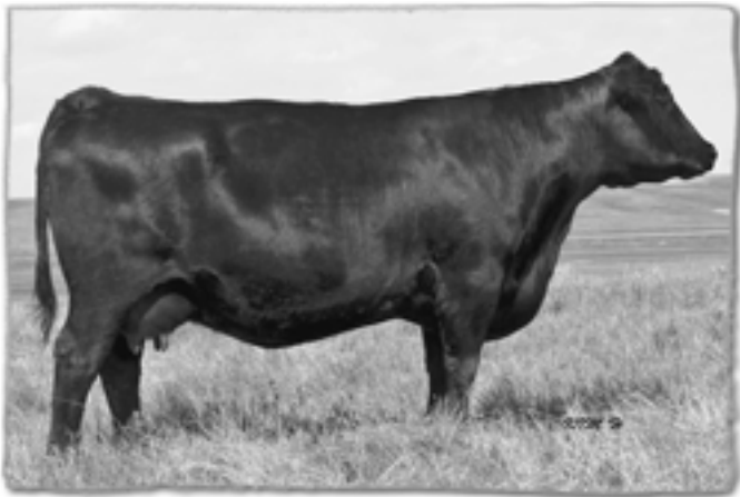
LOT 151 - DOUBLE AA OAKLEAF 49'02