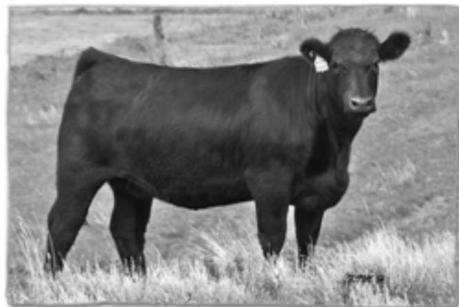
LOT 243 - SASKALTA ANNIE K 716U