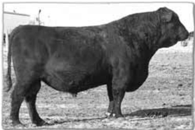
SASKALTA FAME 369P - Sire of Lots 261 to 270