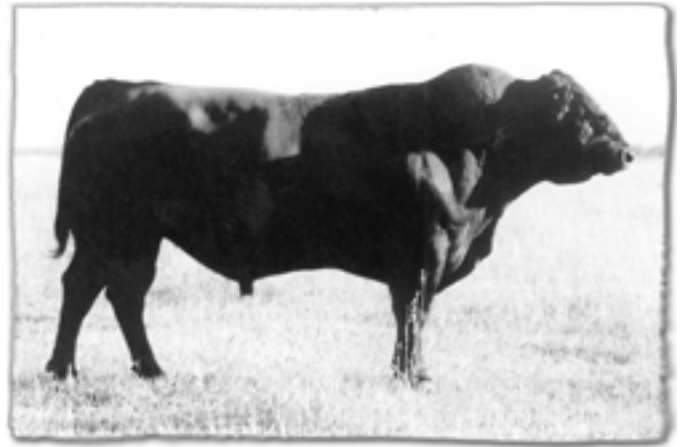
DOUBLE AA RITO 286'99 Sire of Lots 45 & 46

Exposed: May 5, 2009 to August 1, 2009 to Remington Bandy 236S -1367900-