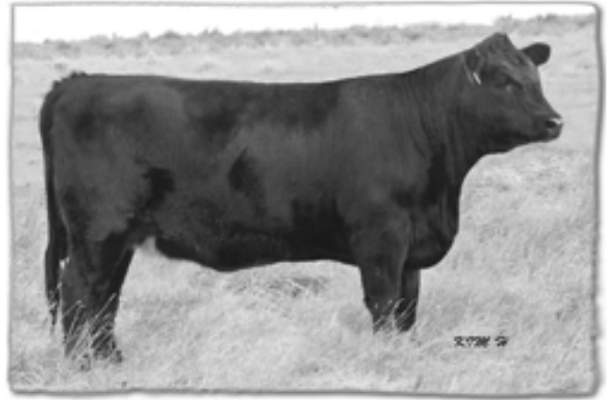
LOT 126 - DOUBLE AA ANNIE K 42'08

Exposed: May 5 to May 20, 2009 to Double AA Bardolene 260'04 -1218483- Exposed: May 24 to August 1, 2009 to Double AA Freightliner 89'08 -1471818-