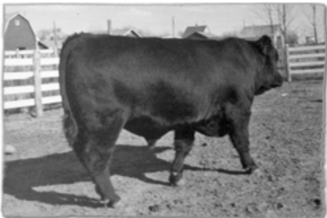
DOUBLE AA BARDOLENE 500'76 An Old Post son to Tom Robertson, Saskalta Farms Sold through the 1978 Cross Country Sale

EPDs: BW: +5.1 44% WW: +25 31% YW: +37 22% Milk: +15 15% TM: +28 YG: +12 22%