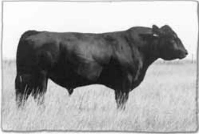
DOUBLE AA BARDOLIER 322'03