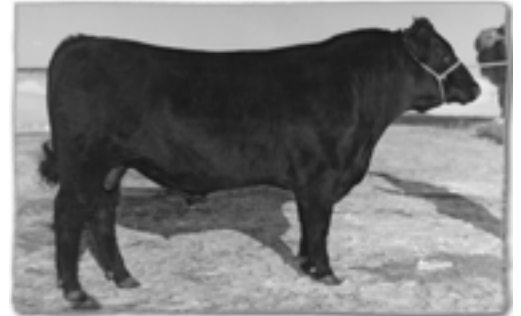
Double AA Bardolene 606'78

125 Vials - Want great producing females? Use 606, his calves are stylish. Correct cows great milkers, remember he sired the original Tibbie cow.