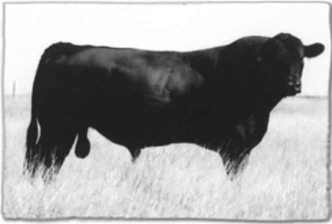
SASKALTA BARDOLENE 28M Sire of Lots 15 to 23