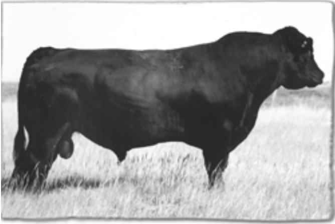
DOUBLE AA RITO 21'03 Sire of Lots 36 to 44