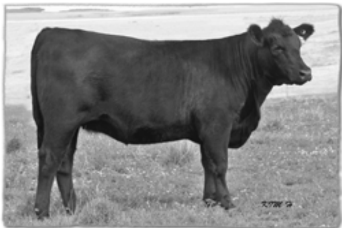
LOT 240 - SASKALTA ANNIE K 708U