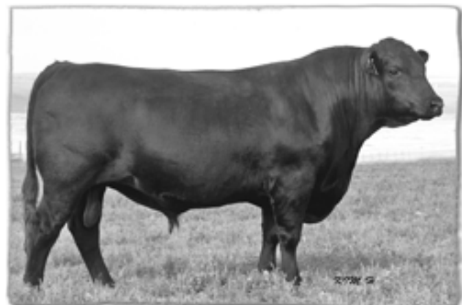
SASKALTA WINSTON 64T

An intense line bred Winston, going back to the $10,000 Angus Acres Winston 249B, three times in three generations of powerful genetics.