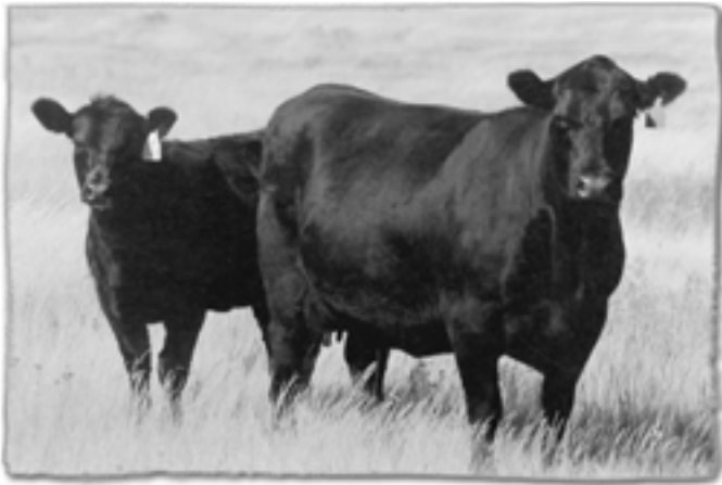
GOOD HEIFERS MAKE GREAT COWS