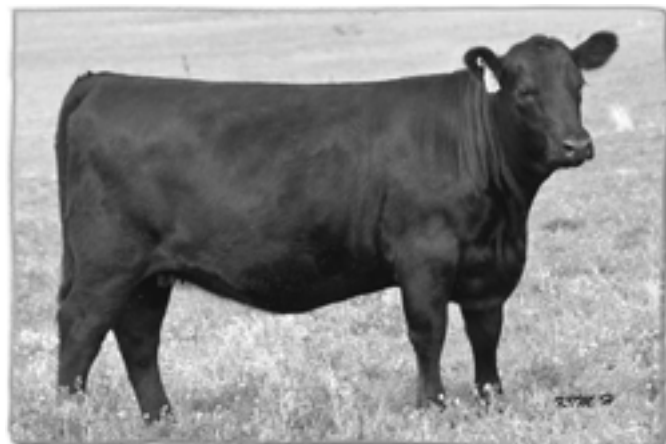
LOT 276 - SASKALTA ANNIE K 742U

Exposed: April 20 to June 20, 2009 to Saskalta Winston 64T -1420918-