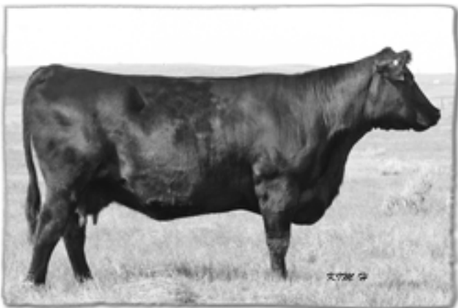
LOT 155 - DOUBLE AA ANNIE K 807'00

February 21, 2009 BW: 89 lbs. Sire: Double AA Bardolene 47'04-1218674-