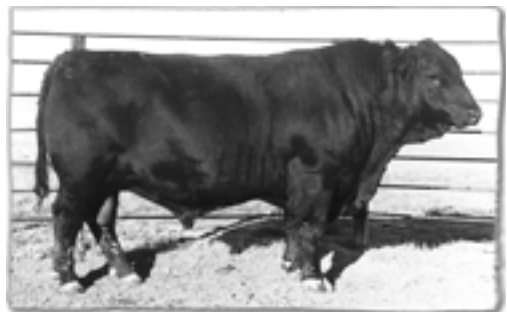
Double AA Bardolene 500'74