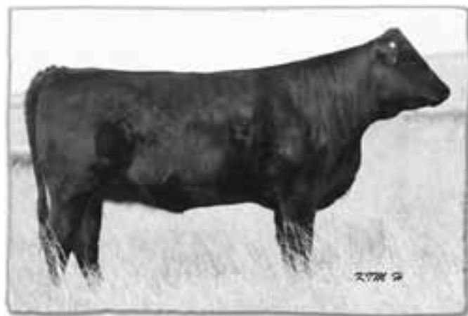
LOT 101 - DOUBLE AA ANNIE K 21'08

Exposed: May 24 to August 1, 2009 to Double AA Freightliner 89'08 -1471818-