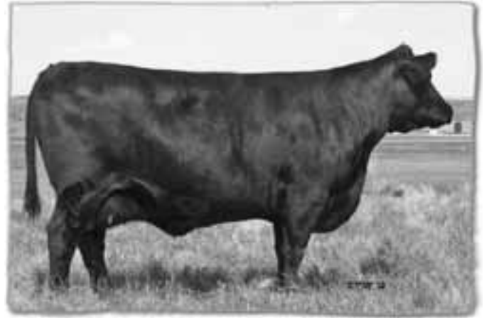
LOT 97 - DOUBLE AA LADY 68'05