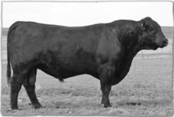
DOUBLE AA BARDOLIER 237'05