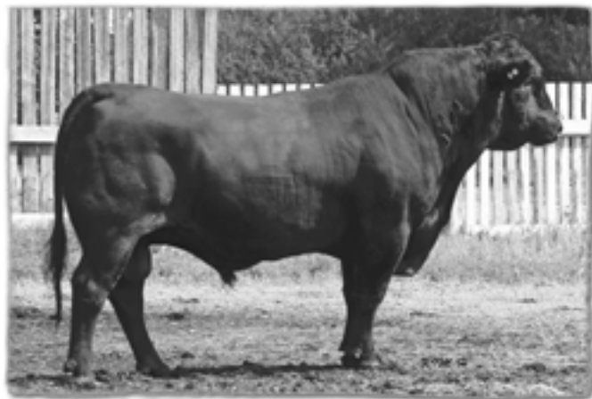
REFERENCE SIRE A - DOUBLE AA BARDOLENE 803'07

EPDs: BW: I+5.2 5% WW: I+38 5% YW: I+61 5% Milk: I+11 5% TM: I+30 YG: I+23 5%