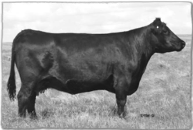
LOT 154 - DOUBLE AA ANNIE K 802'01

Exposed: May 5, 2009 to August 1, 2009 to Double AA Bardolier 47'06 -1329580-