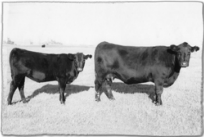
ANNIE K COW & HEIFER CALF They've looked the same for 40 years!

Exposed: May 10 to August 1, 2009 to Double AA Bardolene 108'08 -1465143-