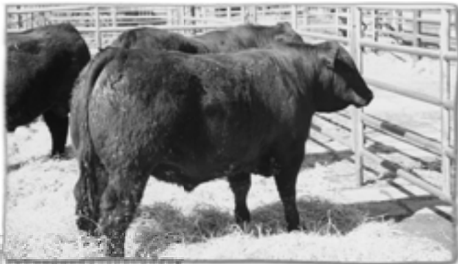
The kind of yearling bulls the Double AA herd produces