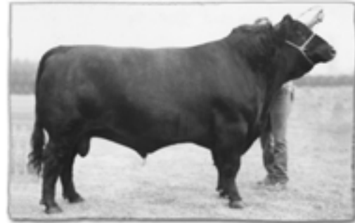
Bardolene's Lad 500'74

30 Vials - Use this bull on any good female, he has lots of size and style. Remember he was Champion at 26 shows.