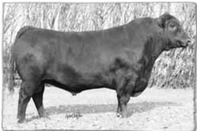
FV 20K KING 308M - Sire of Service Sire FV 308M King 445T