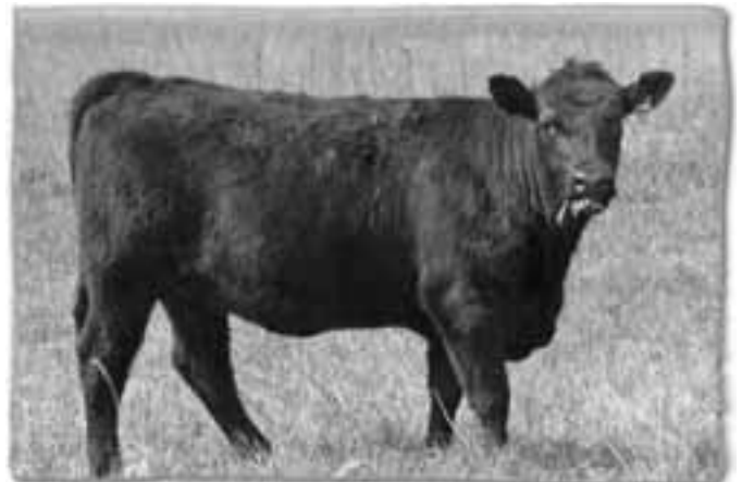
ANNIE K HEIFER CALF

92A Female Double AA Annie K 69'09 RCE 69W 1520132 March 19, 2009 BW: 85 lbs. Sire: Black Wheel Hick Hop 49R -1266560-