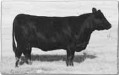
An Annie K cow

I will tell our story through the cattle and bulls we have used. This will also give you an insight into the genetics in this offspring.