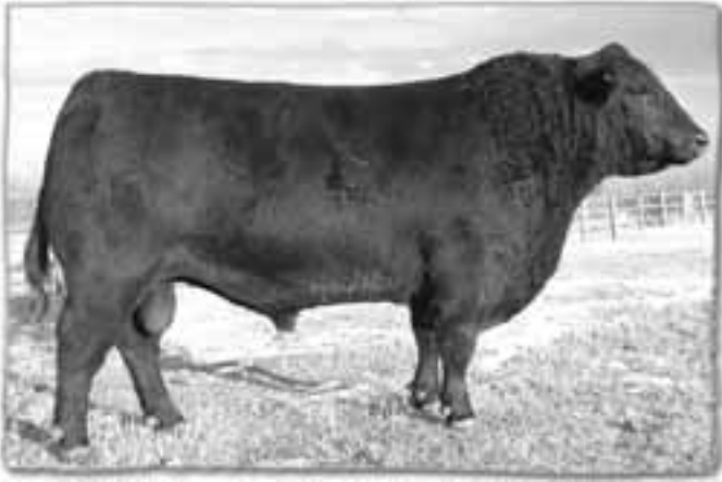
DOUBLE AA OLD POST BANDOLIER Owned by Remington Land & Cattle & LLB Angus