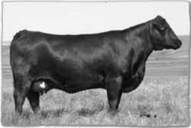
LOT 90 - DOUBLE AA ANNIE K 369'05