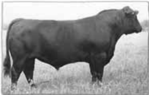
Angus Acres Winston 249B

50 Vials - Great breeding bull, can't beat his cows. Sires extra long bodied bulls and cows. 96X was a big bull scaling 3000 lbs., but we had no calving problems.