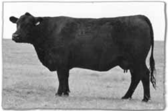
TYPICAL ANNIE K FEMALE

Exposed: May 5, 2009 to August 1, 2009 to Remington Bandy 236S -1367900-