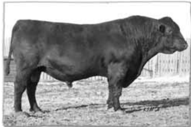
SASKALTA WINSTON 283N - Sire of Lots 298, 302, 303 & 304