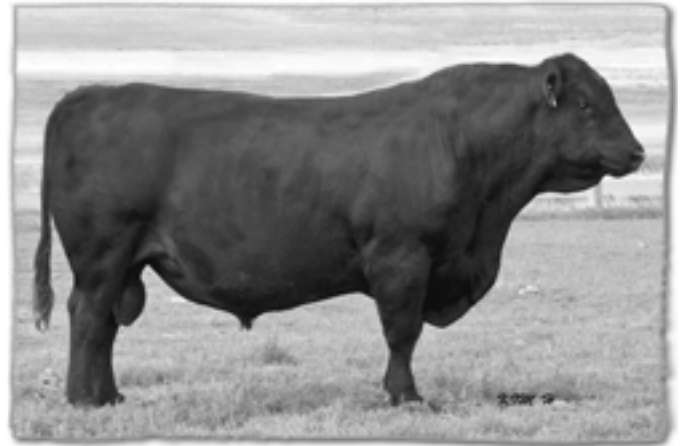
SASKALTA FAME 369P