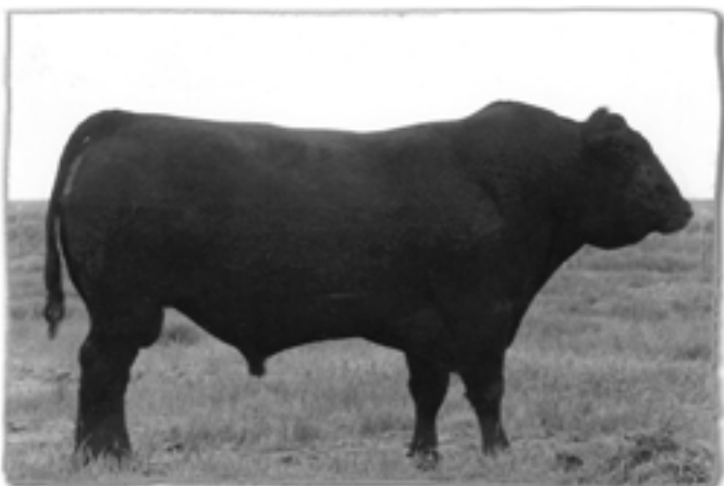
JOHNSTON 2100 BARDOLENE 554Y Sire of the Double AA Rito line out of an Annie K cow