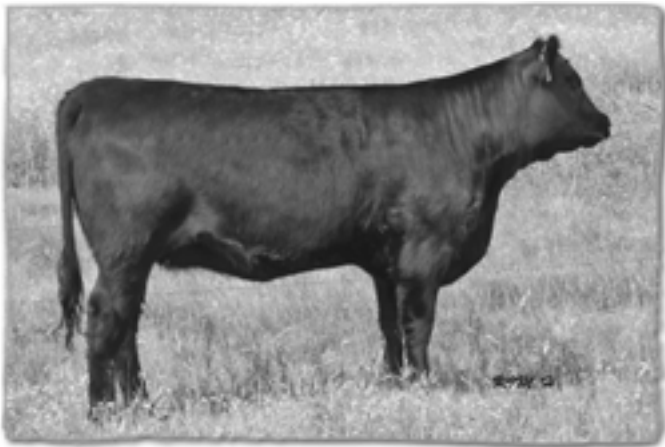
LOT 141 - DOUBLE AA ANNIE K 812'08