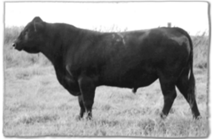
DOUBLE AA BARDOLENE 333'03 Sire of Lots 25 to 30

Exposed: May 5, 2009 to August 1, 2009 to Double AA Bardolier 47'06 -1329580-