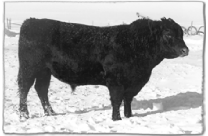
PEAK DOT NEW TREND 42M Sire of Lots 77, 78 & 79

82A Female Double AA Annie K 15'09 RCE 15W 1520696 March 1, 2009 BW: 75 lbs. Sire: Double AA Bardolene 387'06 -1329429-