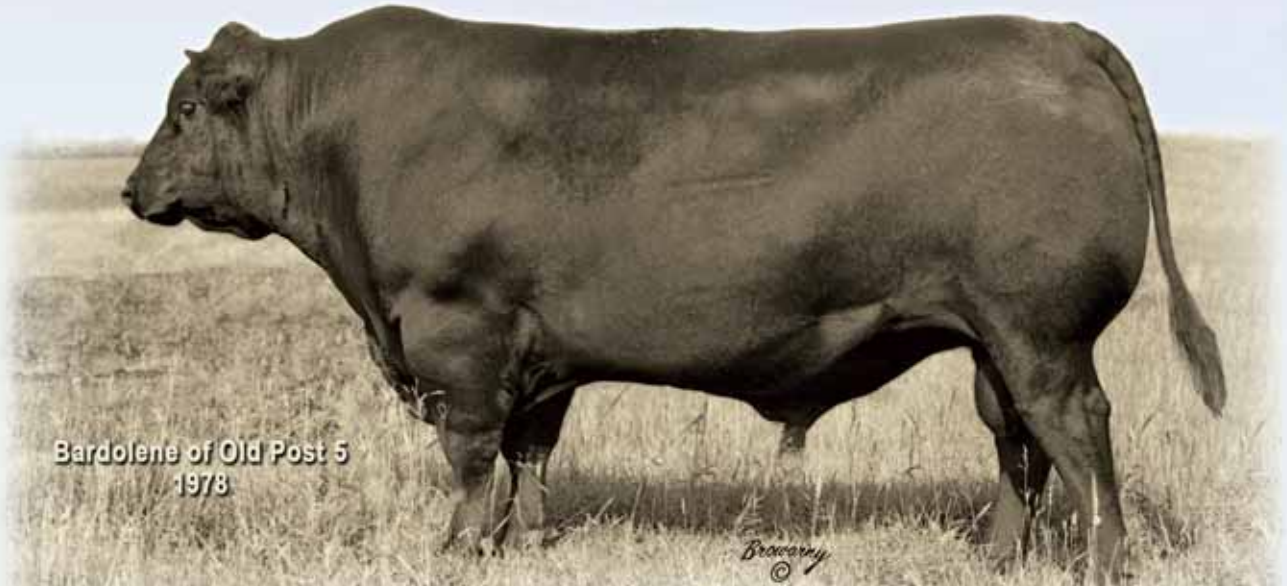
Bardolene of Old Post 5 1978