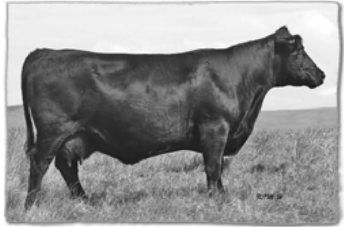
LOT 156 - DOUBLE AA ANNIE K 806'00

Exposed: May 5, 2009 to August 1, 2009 Double AA Bardolene 803'07 -1389668-