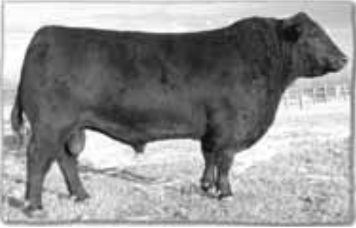
Double AA Old Post Bardolier Owned by Remington Land & Cattle & LLB Angus

From the Old Post and Annie K's we developed the Bardolier 15, 505, 322, a great young bull working at the Fleury Cattle Co. and many other bulls. 15 always had some of the top selling bulls in the Rancher's Choice Sales.