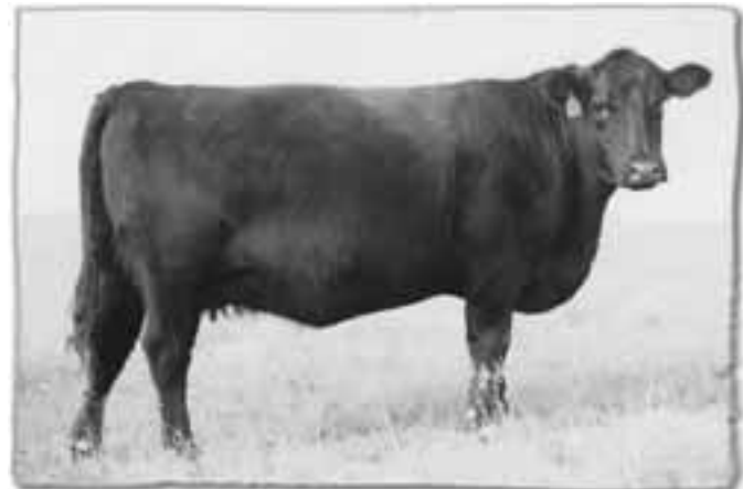
A TYPICAL DOUBLE AA FEMALE

94A Female Double AA Elena 34'09 RCE 34W 1520701 March 10, 2009 BW: 86 lbs. Sire: Double AA Bardolene 387'06 -1520701- February 27, 2009 Sire: Double AA Bardolene 47'04 -1218674