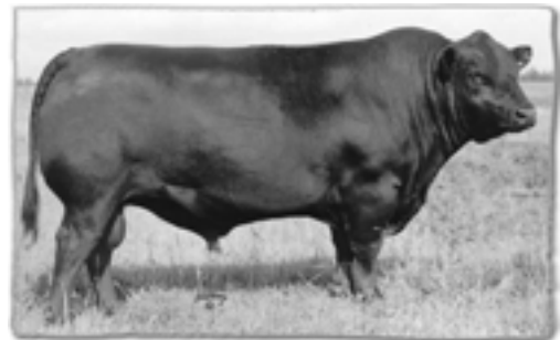
Bardolene of Old Post 5