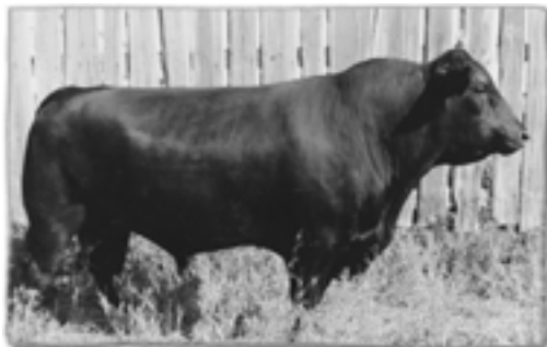
Double AA Bardolier 15 - a son of Flintstone

200 Vials - Winston sires great females, they are thick good milkers. 249B was stylish and correct, just a great bull. He broke his front leg as we didn't AI at our place. That is the only reason we don't have more offspring by him.