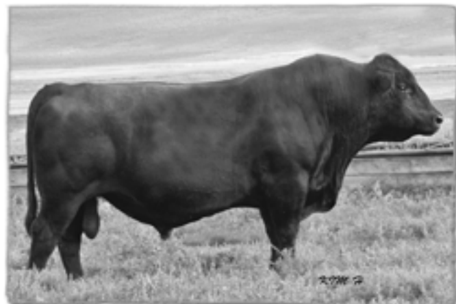
SASKALTA BANDY 98N - Service sire to Lots 320 & 321

Exposed: April 20 to June 20, 2009 to F V 308M King 445T -1410945-