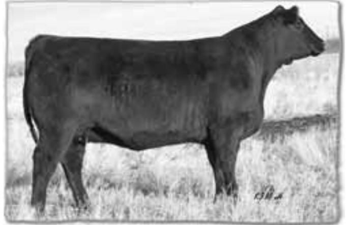
SASKALTA ANNIE K 713T Purchased at Masterpiece Sale, Agribition 2008 by Remington