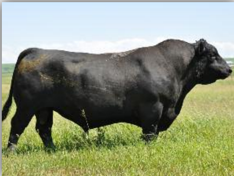
Reference Sire H - Crowfoot Equation 5793R