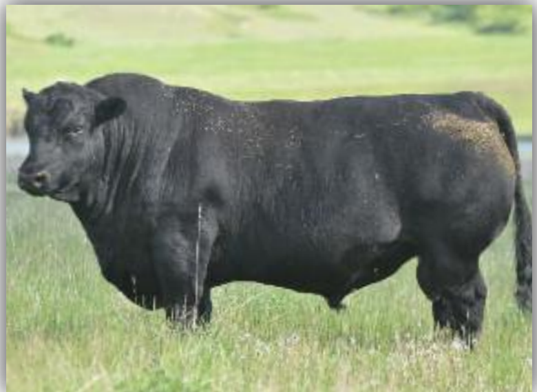
Reference Sire K - 6758S

We liked the over all result of 4438 so we kept a son by him out a very good N Bar Impact x AAR Optima bred cow. 6758S calves are born lively and strong. They have nice style and most all of them have minus birth weight EPD which is much below breed average with near average growth and performance. The daughters of 6758S they doing a very nice job. Nice udders good mothering and easy to look at!