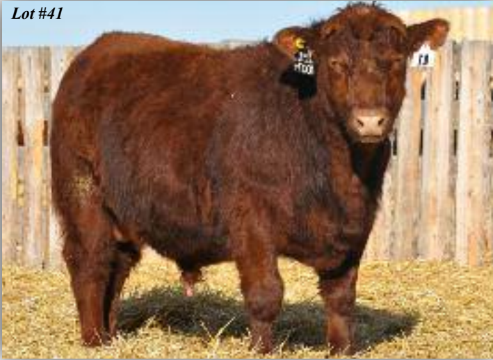
41 RED CROWFOOT MOONSHINE 1007Y Male CFCC 1007Y February 04 2011 #1646194

CROWFOOT 6004S CROWFOOT MAX 1743L RED CROWFOOT MOONSHINE 8081U (1456117) CROWFOOT BLACKCAP 4935P RED CROWFOOT BRNDINA 6359S RED CROWFOOT BIG DADDY 2058M RED CROWFOOT BRNDINA 1065L RED CROWFOOT OLE'S OSCAR 2042M OSF MAF RED MLK CRK CUB 722 OSF MAF RED CROWFOOT LACE 6014S (1315898) RED CROWFOOT OMEGA 9179J RED CROWFOOT LACE 4133P RED CROWFOOT SHARPSHOOTER 2012 RED CROWFOOT LACE 1179L