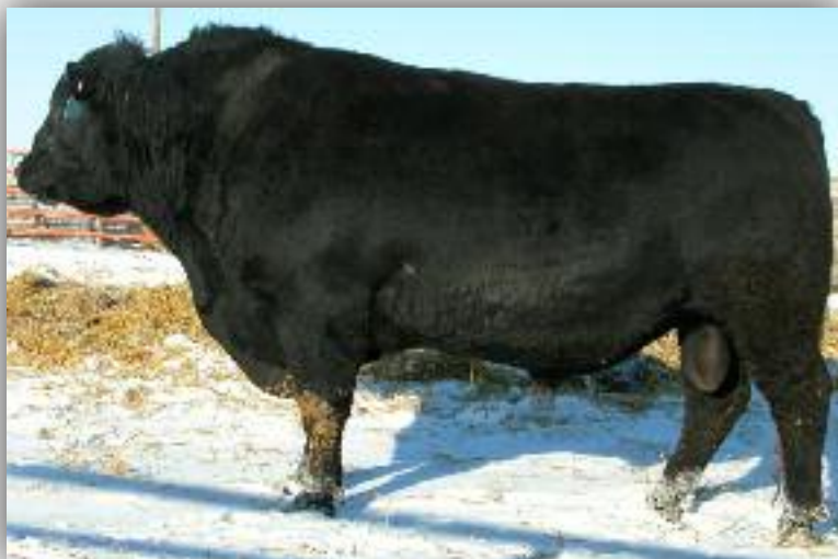
Reference Sire E - Max 1743L

At Crowfoot, 47 progeny have a Birth Weight Ratio of 96, a Weaning Weight Ratio of 101 and Yearling Weight Ratio of 102. They exhibit exceptional fleshing ability and very good feet.