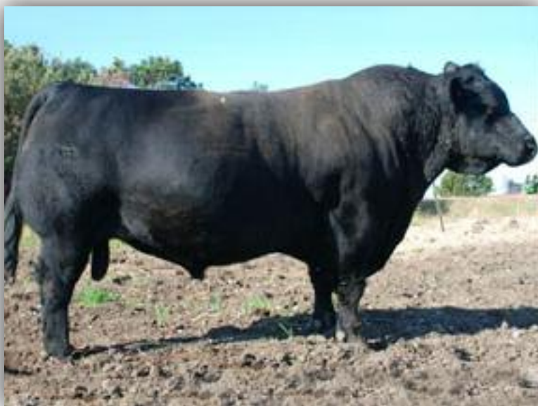
Reference Sire G - O C C Legend 616L

We chose 61P for his outstanding phenotype, strong Angus maternal values, tremendous scrotal development and semen quality, outstanding disposition, and perfect feet. He serviced 61 cows here then jumped the fence to work on our neighbor's herd. He posted a 98 Ratio on birth weight.