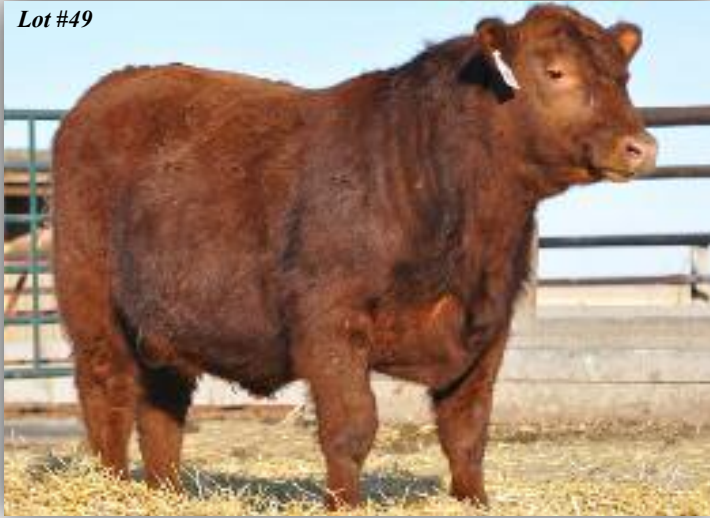
49 RED XO CROWFOOT MOONSHINE 1480 Male XO 1480Y February 19 2011 #1646483

CROWFOOT 6004S CROWFOOT MAX 1743L RED CROWFOOT MOONSHINE 8081U (1456117) CROWFOOT BLACKCAP 4935P RED CROWFOOT BRNDINA 6359S RED CROWFOOT BIG DADDY 2058M RED CROWFOOT BRNDINA 1065L RED CROWFOOT RAMBLER 1038L RED VGW RAMBLER 1000 OSF RED CROWFOOT JAYNE 6593S (1316408) CROWFOOT VERNICE 907J RED CROWFOOT JAYNE 1067L RED MABES RAMBO TUO RED WVA JAYNE 10H