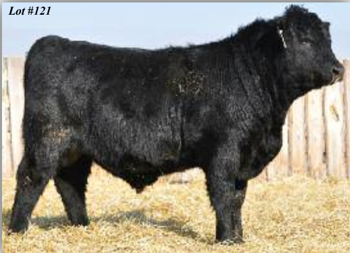
121 XO CROWFOOT HUNTER 1489Y Male XO 1489Y February 21 2011 #1646488

CROWFOOT 5456R CROWFOOT 9118W (1504703) CROWFOOT MERLE 2717M O C C HUNTER 928H CROWFOOT WJ BLACKLADY 1528L SITZ ALLIANCE 6595 AMF NHF C H MERLE 8361 CROWFOOT EQUATION 5793R XO CROWFOOT BLACKBIRD 8810U (1456275) CFCC 620K O C C LEGACY 839L CROWFOOT FORKS 755K SITZ ALLIANCE 6595 AMF NHF C H BLACKBIRD 8645