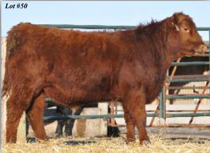
50 RED CROWFOOT MOONSHINE 1114Y Male CFCC 1114Y February 20 2011 #1646278

CROWFOOT 6004S CROWFOOT MAX 1743L RED CROWFOOT MOONSHINE 8081U (1456117) CROWFOOT BLACKCAP 4935P RED CROWFOOT BRNDINA 6359S RED CROWFOOT BIG DADDY 2058M RED CROWFOOT BRNDINA 1065L B.B.A.R. NUGGET 4778 JOHNSTON NUGGET 370E RED CROWFOOT PRINCESS 6285S (1316125) VALLEYHILLS BLACKCAP ELVA 178D CROWFOOT PRINCESS 3075N O C C HONESTY 962H RED CROWFOOT PRINCESS 8126H