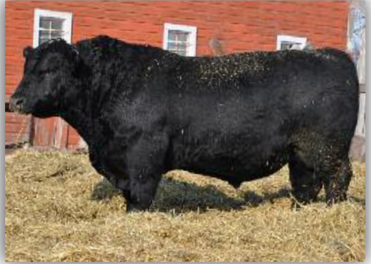
Reference Sire P - 324U