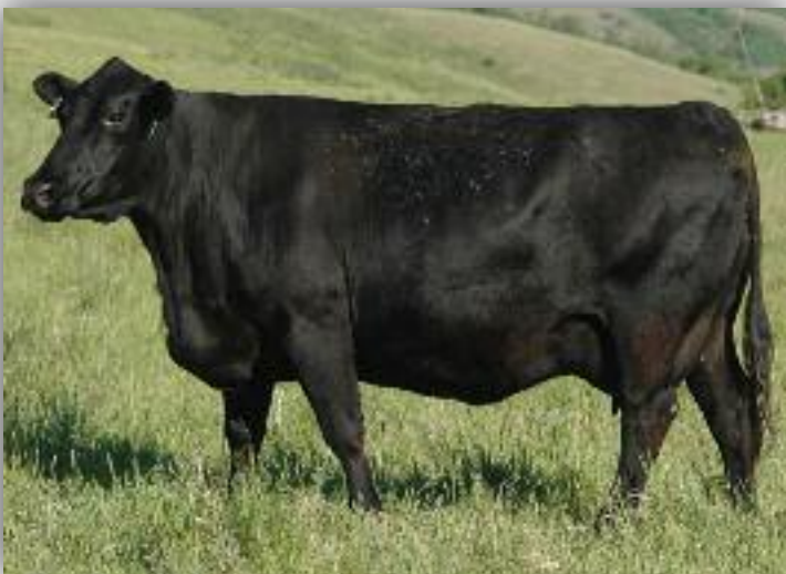
2717M - Dam of Crowfoot 9118W & Lot #24 in this sale

His dam, 2717M, is also the dam of Lot #24 in this sale.