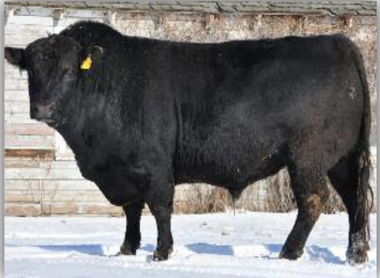
Reference Sire I - Mechanic 5789R

Dam, Blackbird 1687L, is also the dam of Crowfoot 8022U and grandam of Crowfoot 8141U, both of whom have made their mark in the Crowfoot herd.