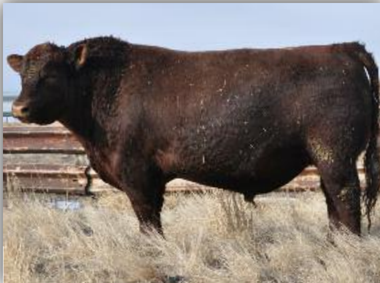
Reference Sire C - Oly 22U

22U comes with a little extra birth weight but his performance follows suit!