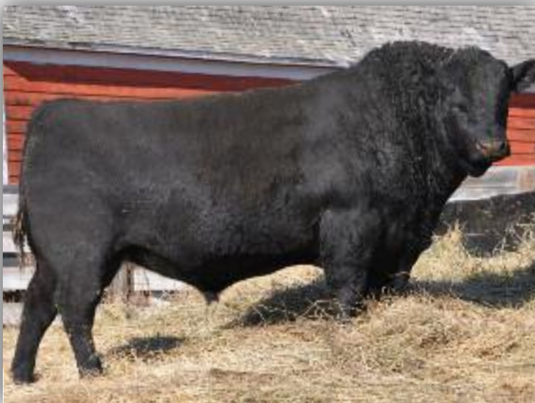
Reference Sire N - 8141U

Joker 8814U, an example of highly efficient forage genetics, is thick with lots of muscle. He will add scrotal size and early maturity. With his dam being a Shoeshone Pied Piper 7105 granddaughter, the 8814U daughters should make beautiful cows and perfect grass cattle. The first Joker daughters calving this spring are very impressive - these are kind that grass based operations will enjoy.