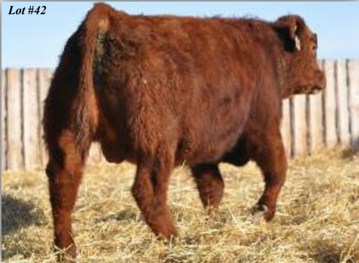
42 RED CROWFOOT MOONSHINE 1008Y Male CFCC 1008Y February 04 2011 #1646195

CROWFOOT 6004S CROWFOOT MAX 1743L RED CROWFOOT MOONSHINE 8081U (1456117) CROWFOOT BLACKCAP 4935P RED CROWFOOT BRNDINA 6359S RED CROWFOOT BIG DADDY 2058M RED CROWFOOT BRNDINA 1065L RED YY HEAT 902J RED YY RED KNIGHT 640F OSF RED CROWFOOT COVERGIRL 6530S (1316349) RED LINDA DEVOLANE 2X RED CROWFOOT CJ COVERGIRL 9203 RED CROWFOOT DYNAMO 616F RED CROWFOOT COVERGIRL 722G