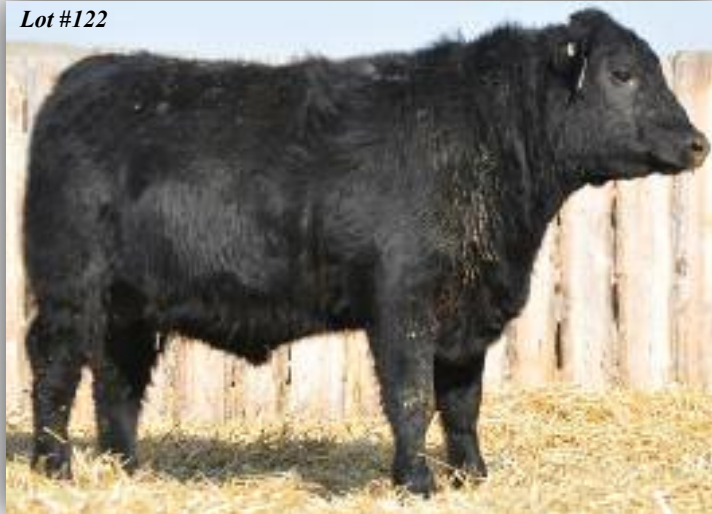
122 XO CROWFOOT HUNTER 1507Y Male XO 1507Y February 24 2011 #1646500

CROWFOOT 5456R CROWFOOT 9118W (1504703) CROWFOOT MERLE 2717M O C C HUNTER 928H CROWFOOT WJ BLACKLADY 1528L SITZ ALLIANCE 6595 AMF NHF C H MERLE 8361 O C C LEGACY 839L XO CROWFOOT BLACK MAX 845U (1470581) CROWFOOT BLACK MAX 6337S O C C ECHELON 857E O C C DIXIE ERICA 960E CROWFOOT 3199N BAR-X BLACK MAX 223L