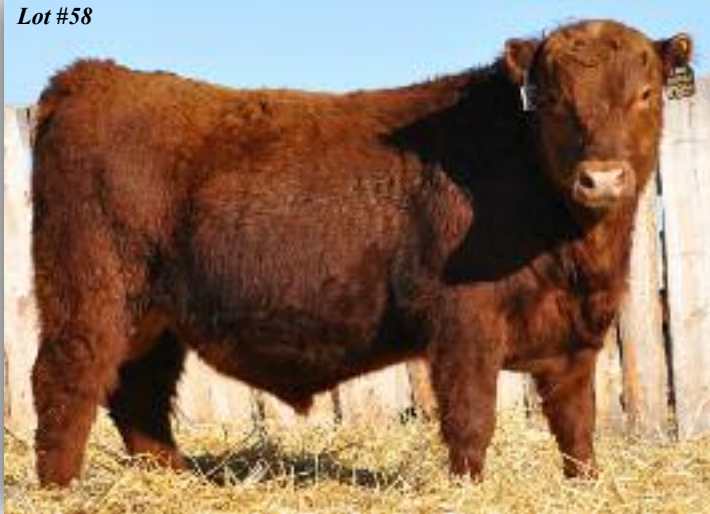
58 RED CROWFOOT RUMBLER 1085Y Male CFCC 1085Y February 16 2011 #1646255

RED CROWFOOT RAMBLER 1024L RED CBR RUMBLER 2362-8586 (1542007) RED CBR LADY EXT 2362-98H RED VGW RAMBLER 1000 OSF RED CROWFOOT SHAWNEE 9124J RED SODAK EXT 7420-97 RED SHHM RED LICORICE 98H RED CROWFOOT 6253S CROWFOOT PEARLE 8092U (1456127) CROWFOOT PEARLE 6306S CROWFOOT MAX 1743L CROWFOOT PIED PIPER 3859N CROWFOOT 4232P CROWFOOT PEARL 4861P