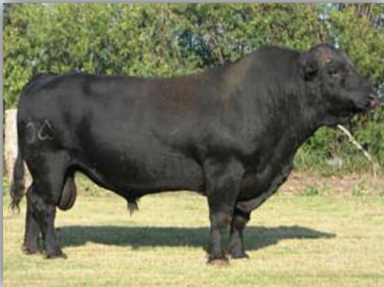
Reference Sire F - TK Quantum Physical 61P