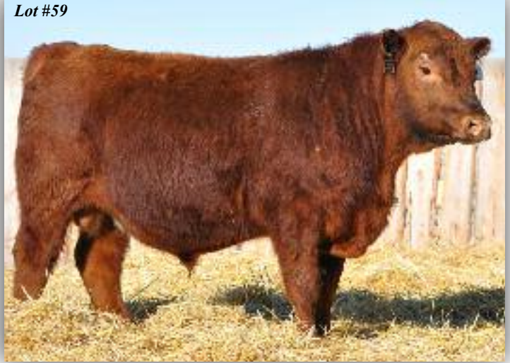
59 RED CROWFOOT RUMBLER 1087Y Male CFCC 1087Y February 16 2011 #1646257

RED CROWFOOT RAMBLER 1024L RED CBR RUMBLER 2362-8586 (1542007) RED CBR LADY EXT 2362-98H RED VGW RAMBLER 1000 OSF RED CROWFOOT SHAWNEE 9124J RED SODAK EXT 7420-97 RED SHHM RED LICORICE 98H RED SSS OLE 746P RED CROWFOOT LADY 6484S (1316306) RED CROWFOOT LADY 3027N RED CROWFOOT OLE'S OSCAR 2042M OSF MAF RED SSS REBELLO 237M RED BJR JR 105 RED CROWFOOT LADY 1033L