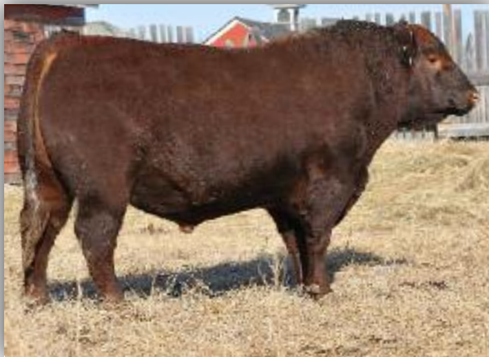
Reference Sire B - Rumbler 2362-8586