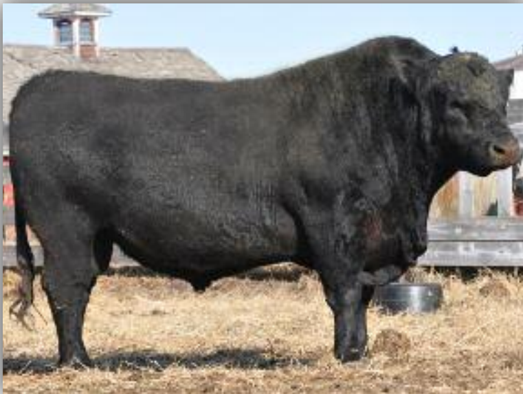
Reference Sire M - Joker 8814U

Crowfoot Joker 6228S is a son of our high selling cow, Crowfoot Bardolene 1040L, from our mature cow herd dispersal of 2006. His grandam, Crowfoot Bardolene 9133J, was the second high selling cow. As a matter of fact, 9133J and her down line brought in close to $70,00 dollars that day. Joker 6228S is a calving ease bull with a - 2.3 BW EPD which is much lower than breed average. Daughters make gorgeous cows with the real Angus look and lots of milk with well put together udders.