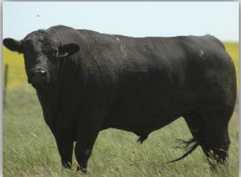
Reference Sire J - Crowfoot 9052W

9052 was a stand out from the day of birth. His dam, a beautiful OCC Honesty daughter out of an EXT bred cow is as good as they come. His bw of 72 lbs was also very encouraging. Most of all though we were impressed with the amount of thickness and muscle shape he possessed. As a calf he posted a 114 wean index and 110 year index. He naturally sired 55 calves born here in 2011 with an average 78 lb bw, 97 wean index and 103 year index. 9052 measured 38 cm scrotal at one year.