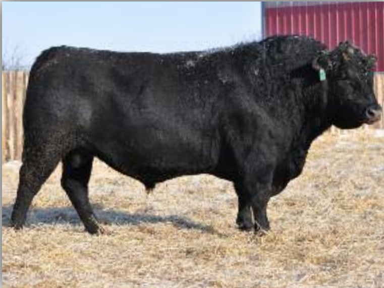
Reference Sire L - Joker 6228S