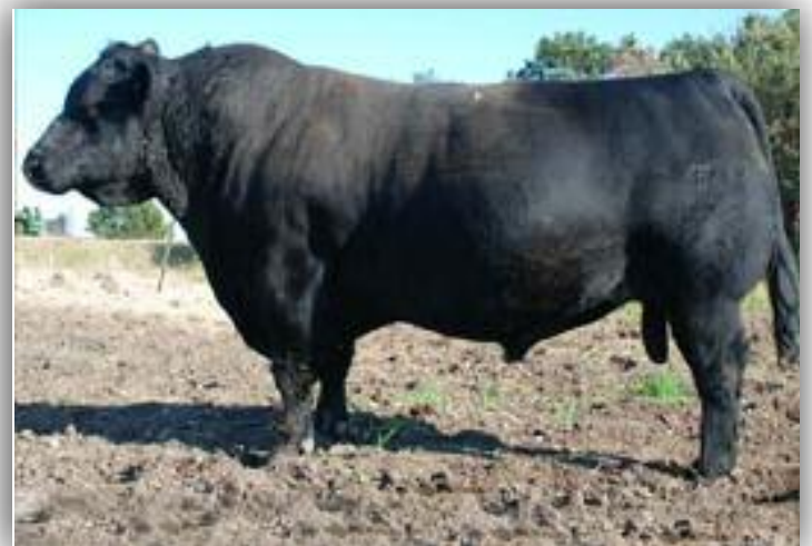
O C C Legend 616L - Grandsire to SVR Lookout 324U

You will like the sons we have on offer. They exhibit lots of mass with good scrotal development