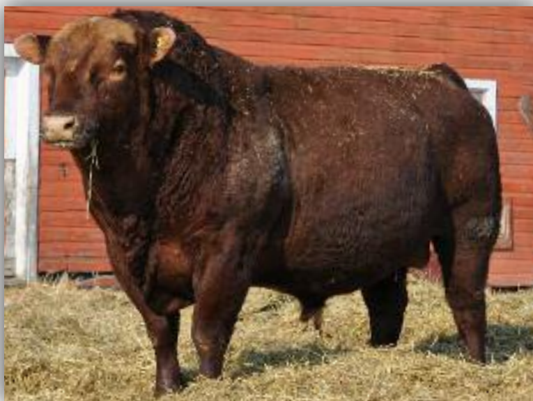
Reference Sire D - Cowboy 7206T

At the recent Chapman Cattle Co. sale, five Cowboy sired two year olds averaged $5500 dollars.