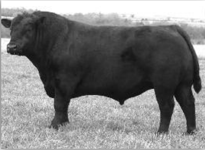
OCC Hunter 928H - Paternal Grandsire of 9118W