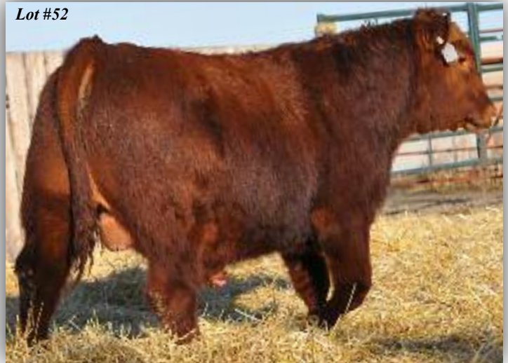
52 RED CROWFOOT MOONSHINE 1139Y Male CFCC 1139Y February 25 2011 #1646290

CROWFOOT 6004S CROWFOOT MAX 1743L RED CROWFOOT MOONSHINE 8081U (1456117) CROWFOOT BLACKCAP 4935P RED CROWFOOT BRNDINA 6359S RED CROWFOOT BIG DADDY 2058M RED CROWFOOT BRNDINA 1065L RED 5L NORSEMAN KING 2291 OSF MAF RED VGW KING OF THE WEST OSF MAF RED CROWFOOT LARKABA 8113U (1456154) RED NORSEMAN 1312 PJM RED CROWFOOT LARKABA 6308S RED SSS OLE 746P RED CROWFOOT LARKABA 3012N