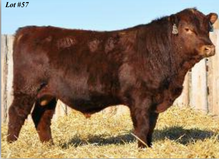
57 RED XO CROWFOOT RUMBLER 1446Y Male XO 1446Y February 13 2011 #1646464

RED CROWFOOT RAMBLER 1024L RED CBR RUMBLER 2362-8586 (1542007) RED CBR LADY EXT 2362-98H RED VGW RAMBLER 1000 OSF RED CROWFOOT SHAWNEE 9124J RED SODAK EXT 7420-97 RED SHHM RED LICORICE 98H RED 5L NORSEMAN KING 2291 OSF MAF RED CROWFOOT SQUIRRELL 5089R (1254681) RED CROWFOOT SQUIRRELL 1074L RED VGW KING OF THE WEST OSF MAF RED NORSEMAN 1312 PJM RED OH BOOMER 552E RED CROWFOOT SQUIRREL 18A