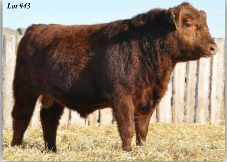
43 RED CROWFOOT MOONSHINE 1036Y Male CFCC 1036Y February 10 2011 #1646215

CROWFOOT 6004S CROWFOOT MAX 1743L RED CROWFOOT MOONSHINE 8081U (1456117) CROWFOOT BLACKCAP 4935P RED CROWFOOT BRNDINA 6359S RED CROWFOOT BIG DADDY 2058M RED CROWFOOT BRNDINA 1065L RED 5L NORSEMAN KING 2291 OSF MAF RED VGW KING OF THE WEST OSF MAF RED CROWFOOT BRNDINA 6199S (1316052) RED NORSEMAN 1312 PJM RED CFCC 177K RED GLACIER LOGAN OSF MAF RED SSS BRNDINA 333X