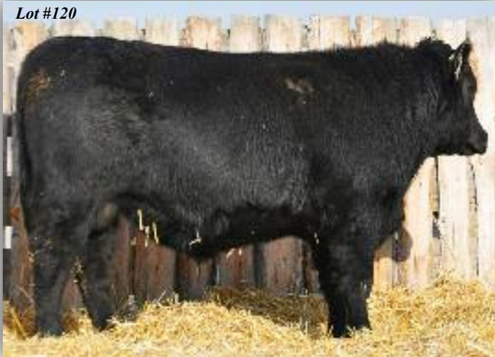
120 XO CROWFOOT HUNTER 1483Y Male XO 1483Y February 20 2011 #1646486

CROWFOOT 5456R CROWFOOT 9118W (1504703) CROWFOOT MERLE 2717M O C C HUNTER 928H CROWFOOT WJ BLACKLADY 1528L SITZ ALLIANCE 6595 AMF NHF C H MERLE 8361 CROWFOOT 6228S XO CROWFOOT MERLE 854U (1470607) CROWFOOT MERLE 6338S O C C JOKER 620J CROWFOOT BARDOLINE 1040L O C C LEGACY 839L C H MERLE 9701