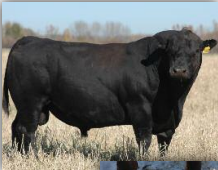
Above - Moonshine 740M - Paternal Great-Grandsire to Ref Sire J

We called him Moonshine because he most resembles his paternal grandsire, OCC Moonshine 740M.