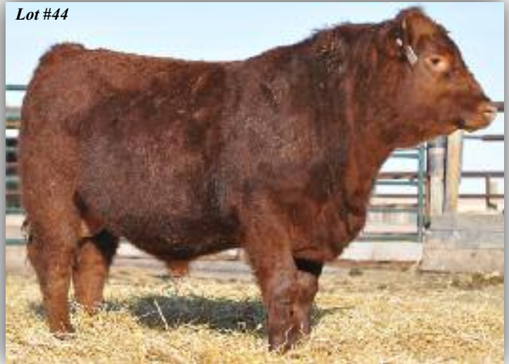
44 RED CROWFOOT MOONSHINE 1055Y Male CFCC 1055Y February 13 2011 #1646232

CROWFOOT 6004S CROWFOOT MAX 1743L RED CROWFOOT MOONSHINE 8081U (1456117) CROWFOOT BLACKCAP 4935P RED CROWFOOT BRNDINA 6359S RED CROWFOOT BIG DADDY 2058M RED CROWFOOT BRNDINA 1065L RED MABES RAMBO TUO RED FCC RAMBO 502 OSF RED CROWFOOT BRNDINA 2067M (1096444) RED MABES TUO TUO RED CROWFOOT BRNDINA 869H RED BIEBER CHIEFTON 3080 RED CROWFOOT BRNDINA 42A