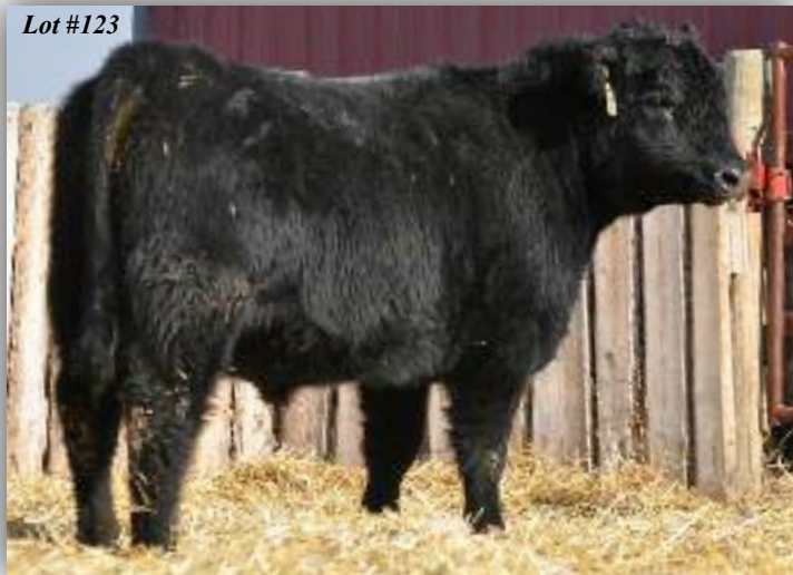
123 CROWFOOT LOOKOUT 1129Y Male CFCC 1129Y February 23 2011 #1646284

B C LOOKOUT 7024 AMF CAF NHF SVR LOOKOUT 324U (1451908) SVR ANNIE 337S O C C LEGEND 616L AMF CAF NHF OSF GIBBET HILL MIGNONNE E37 SVR CONNECTION 221P SVR ANNIE 247N WHITNEY CREEK MAXIMUS 24 CROWFOOT PRIDE 6069S (1315944) CROWFOOT B PRIDE 4773P BASIN MAX 602C AMF CAF NHF RYGS PAIGES QUEEN 423 O C C HONESTY 962H CROWFOOT FORKS 685K