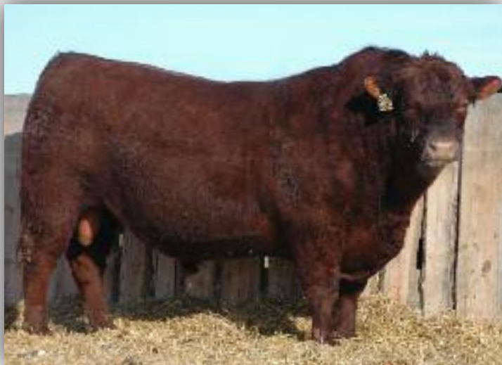
Reference Sire A - Moonshine 8081U