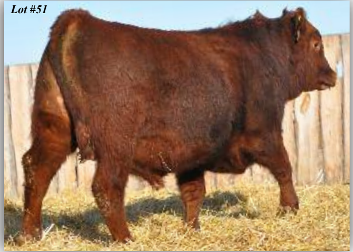
51 RED CROWFOOT MOONSHINE 1138Y Male CFCC 1138Y February 25 2011 #1646289

CROWFOOT 6004S CROWFOOT MAX 1743L RED CROWFOOT MOONSHINE 8081U (1456117) CROWFOOT BLACKCAP 4935P RED CROWFOOT BRNDINA 6359S RED CROWFOOT BIG DADDY 2058M RED CROWFOOT BRNDINA 1065L RED CROWFOOT OLE'S OSCAR 2042M OSF MAF RED MLK CRK CUB 722 OSF MAF RED CROWFOOT DIXIE 8112U (1470944) RED CROWFOOT OMEGA 9179J RED CROWFOOT DIXIE 6137S RED YY RAMBLER 322N RED CROWFOOT DIXIE 2092M