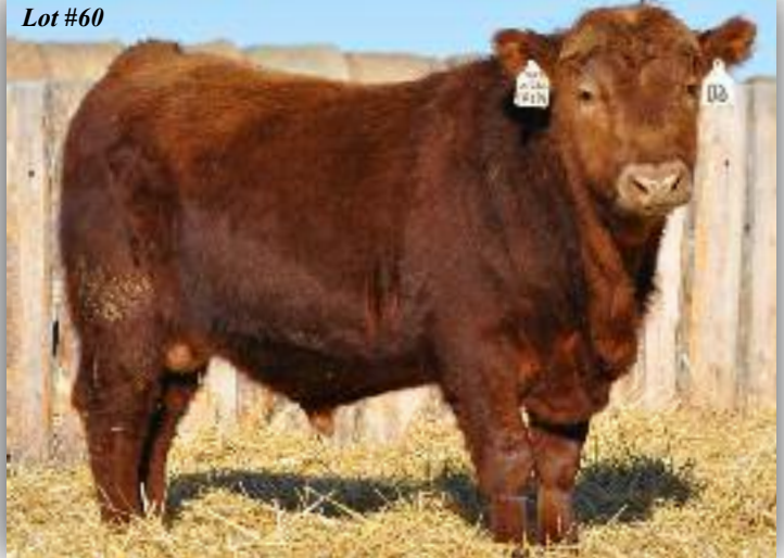
60 RED XO CROWFOOT RUMBLER 1474Y Male XO 1474Y February 19 2011 #1646480

RED CROWFOOT RAMBLER 1024L RED CBR RUMBLER 2362-8586 (1542007) RED CBR LADY EXT 2362-98H RED VGW RAMBLER 1000 OSF RED CROWFOOT SHAWNEE 9124J RED SODAK EXT 7420-97 RED SHHM RED LICORICE 98H CROWFOOT LOGIC 4019P CROWFOOT ENCHANTRESS 6261S (1316105) CFCC 130K O C C LEGACY 839L RED CROWFOOT KARUBA 2019M RED FORSTER CHIEF 7182ET STEVENSON ENCHANTRESS 5787