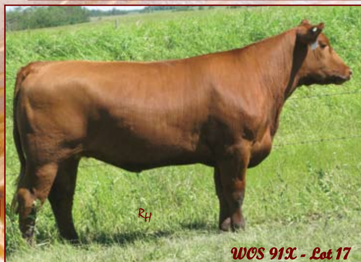
WOS 91X - Lot 17