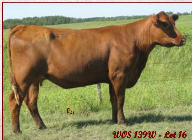
WOS 139W - Lot 16