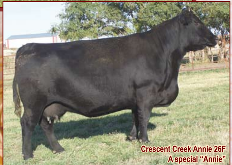
Crescent Creek Annie 26F A special "Annie"