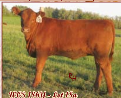
WCS 186Y - Lot 18a