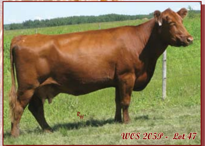
WOS 205P - Lot 47