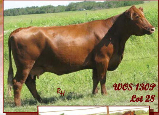
WOS 130P Lot 28