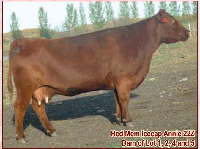
Red Mem Icecap Annie 22Z Dam of Lot 1, 2, 4 and 5

Carcass EPD's: REA: +0.19 Marb: -0.14 Fat: -0.010 Y Grade: -0.18 Carcass Wt: +14