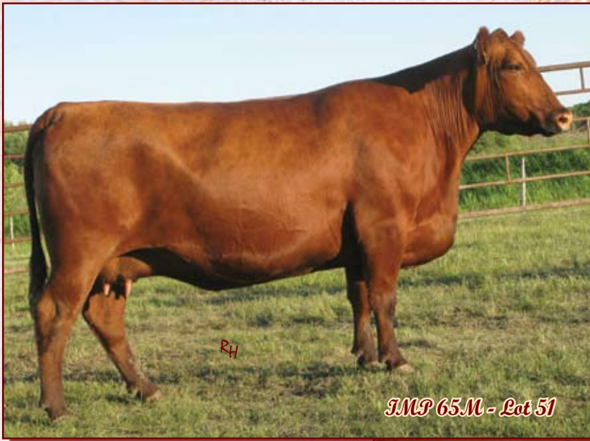
IMP 65M - Lot 51

AI'd May 11 Red PBC D0202 6M H0904. PE May 13 to July 5 Red D-Bar Pathfinder 36P.