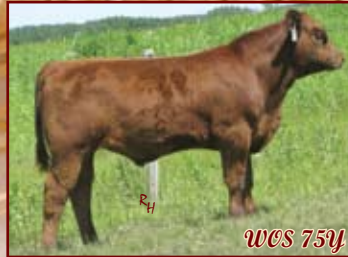
2011 Bull calf of Lot 9