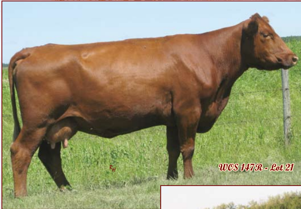
WCS 147R - Lot 21

AI'd May 11 Red Crescent Creek Baron 39L. PE May 20 to August 1 Red Crescent Creek Image 18X.