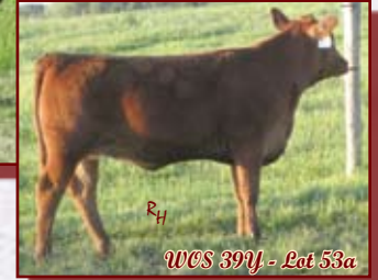
WOS 39Y - Lot 53a