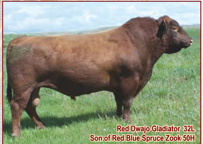
Red Dwajo Gladiator 32L Son of Red Blue Spruce Zook 50H