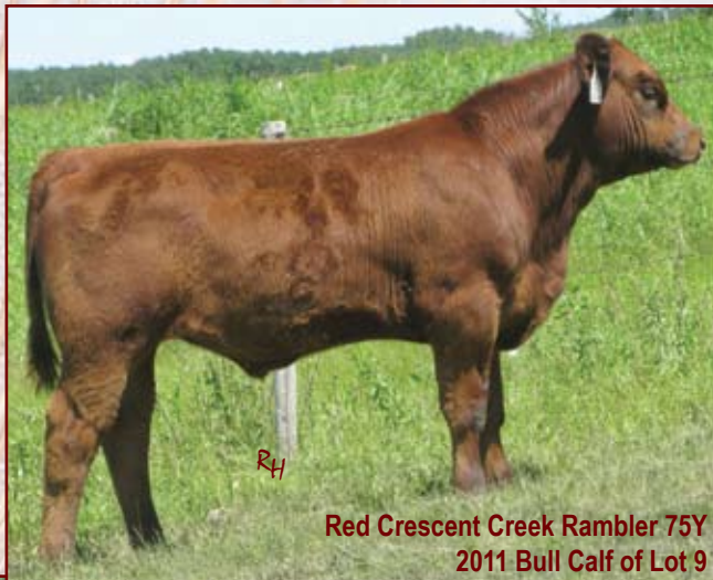
Red Crescent Creek Rambler 75Y 2011 Bull Calf of Lot 9

Carcass EPD's: REA: +0.34 Marb: -0.07 Fat: -0.020 Y Grade: -0.19 Carcass Wt: +33