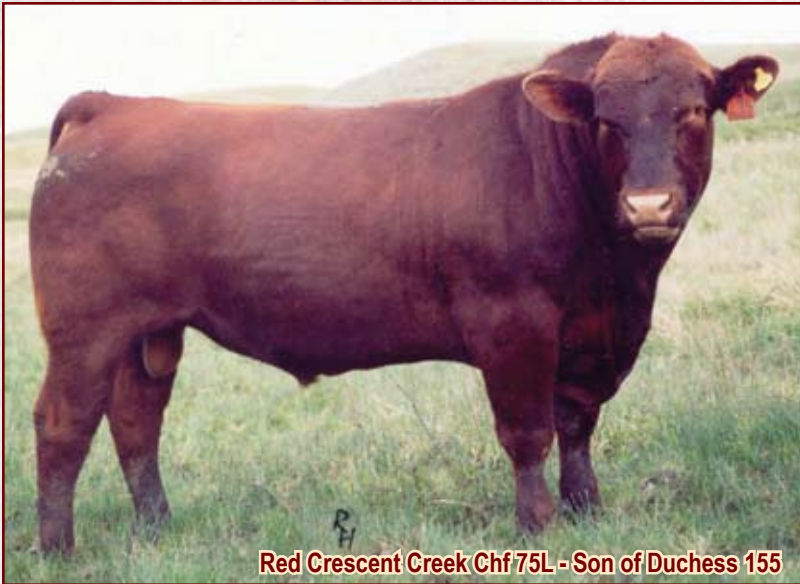
Red Crescent Creek Chf 75L - Son of Duchess 155