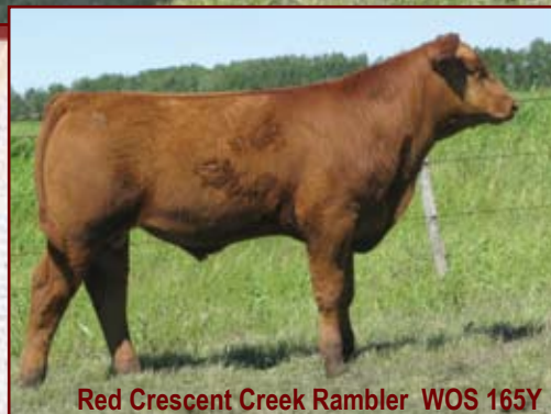
Red Crescent Creek Rambler WOS 165Y 2011 Bull calf of Lot 15

AP'd April 28 Red Crescent Creek Baron 39L. PE May 13 to July 5 Red D-Bar Pathfinder 36P.