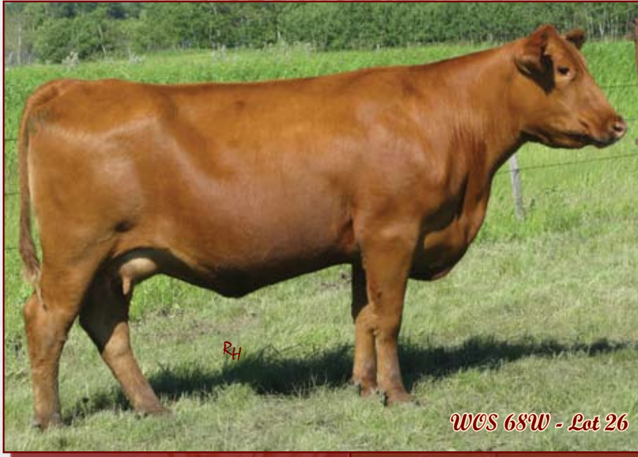
WOS 68W - Lot 26

AP'd May 11 Red Crescent Creek Baron 39L. PE May 13 to July 5 Red D-Bar Pathfinder 36P.