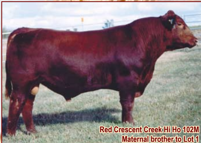
Red Crescent Creek Hi Ho 102M Maternal brother to Lot 1