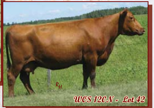
WOS 120N - Lot 42