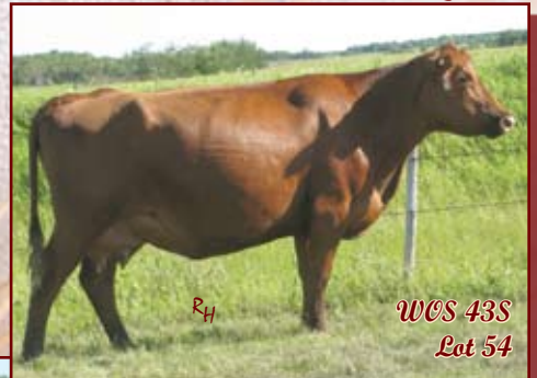
WOS 43S Lot 54

PE May 13 to July 5 Red D-Bar Pathfinder 36P. Observed May 14.