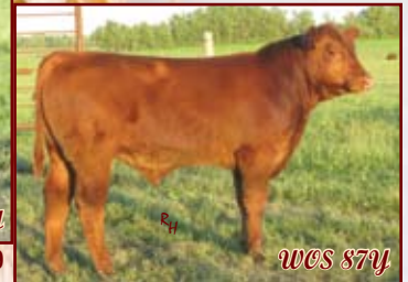
2011 Bull calf of Lot 36