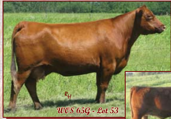
WOS 65G - Lot 53