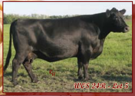
WOS 24R - Lot 5