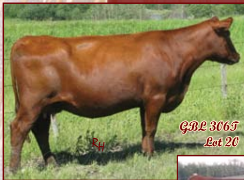
GBL 306F Lot 20