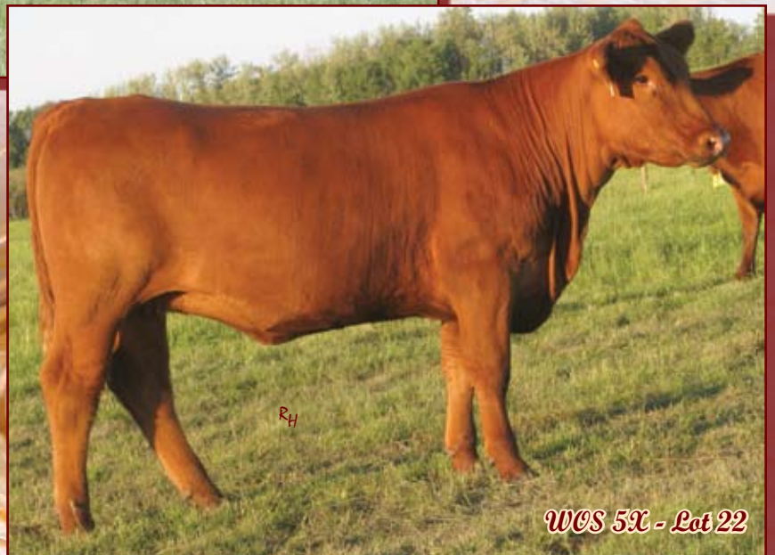
WCS 5X - Lot 22

AI'd May 11 Red Crescent Creek H0904 52K. PE May 20 to August 1 Red Crescent Creek Image 18X.