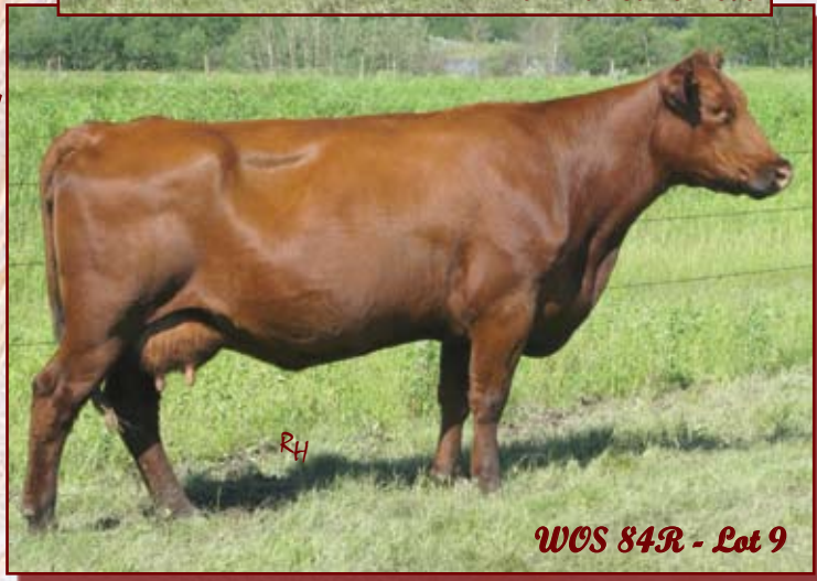
WCS 84R - Lot 9

AP'd May 5 Red MEM Iceberg 4W. PE May 13 to July 5 Red D-Bar Pathfinder 36P.