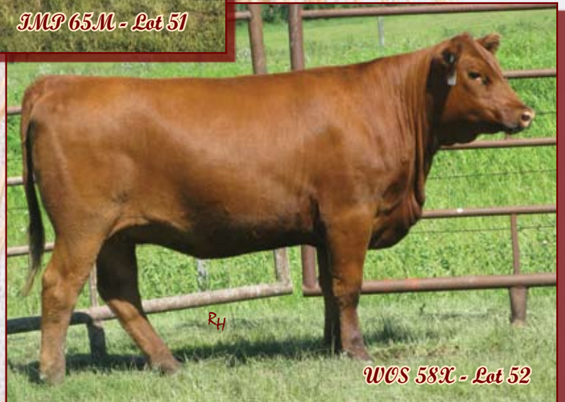
WOS 58X - Lot 52

AI'd May 15 Red Crescent Creek H0904 52K. PE May 20 to August 1 Red Crescent Creek Image 18X.