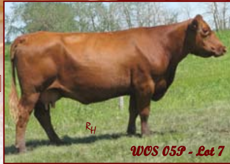
WOS 05P - Lot 7