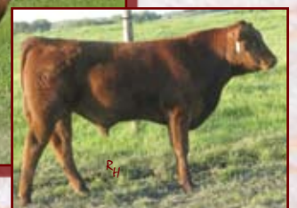
Red Crescent Creek Rambler 86Y 2011 Bull calf of Lot 49