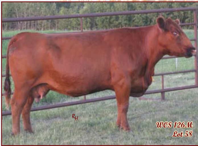
WOS 126M Lot 58

Bred May 19 to Red Crescent Creek Red Baron 39L