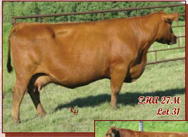
ZHA 27M Lot 31