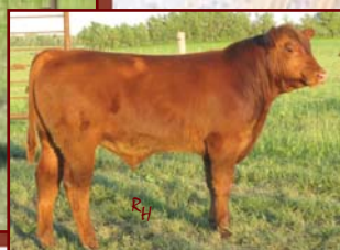
Red Crescent Creek H0904 87Y 2011 Bull calf of Lot 35