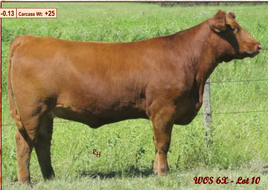
WCS 6X - Lot 10

PE May 25 to July 5 Red D-Bar Pathfinder 36P.