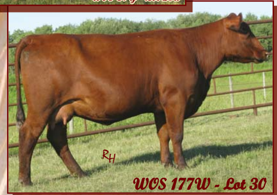
WOS 177W - Lot 30