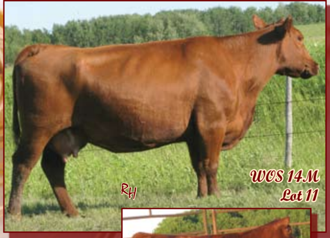
WOS 14M Lot 11