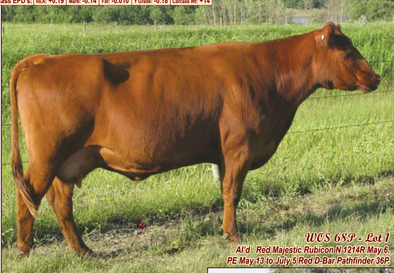
WOS 68P - Lot 1 AI'd Red Majestic Rubicon N 1214R May 6. PE May 13 to July 5 Red D-Bar Pathfinder 36P.

Carcass EPD's: REA: +0.19 Marb: -0.14 Fat: -0.010 Y Grade: -0.18 Carcass Wt: +14