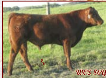
2011 Bull calf of Lot 49