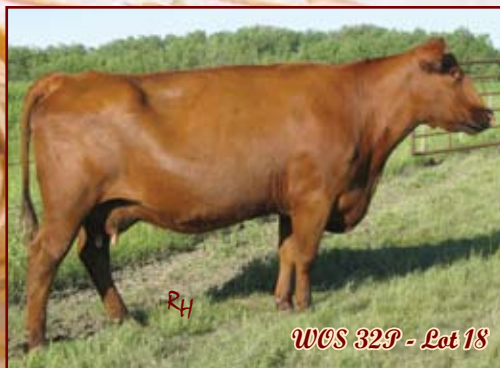
WCS 32P - Lot 18