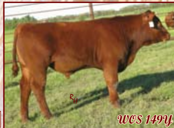
2011 Bull calf of Lot 55