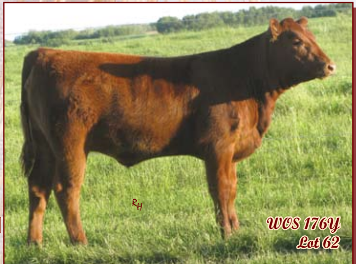
WCS 176Y Lot 62