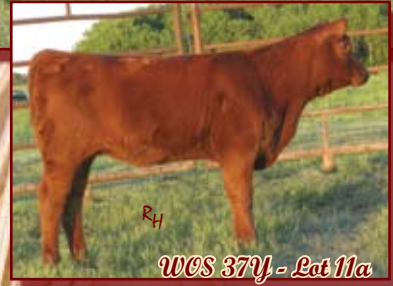
WOS 37Y - Lot 11a