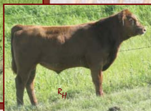
Red Crescent Creek Cherokee 27Y 2011 Bull calf of Lot 37