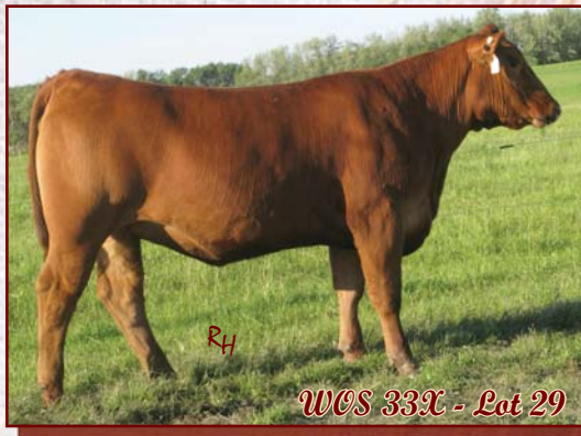
WOS 33X - Lot 29