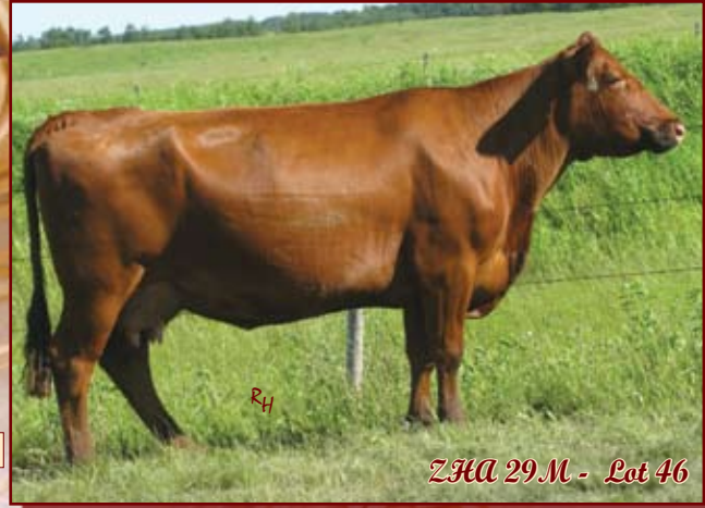
ZHA 29M - Lot 46