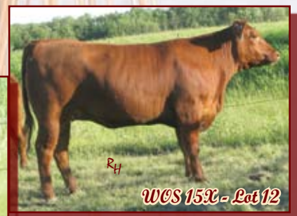
WOS 15X - Lot 12

Perhaps the lead off heifer in the bred heifer section. Stout sums her up, but yet an excellent front end. Another great "Annie". APd May 5 Red Crescent Creek H0904 52K. PE May 20 to August 1 Red Crescent Creek Image 18X.