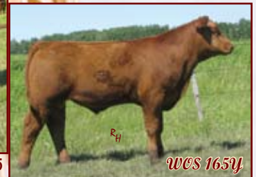
2011 Bull calf of Lot 15