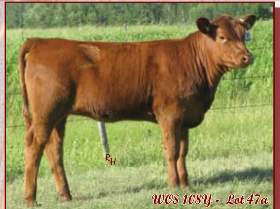
WOS 108Y - Lot 47a