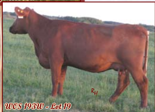
WCS 193W - Lot 19

PE May 13 to July 5 Red D-Bar Pathfinder 36P. Observed May 19.