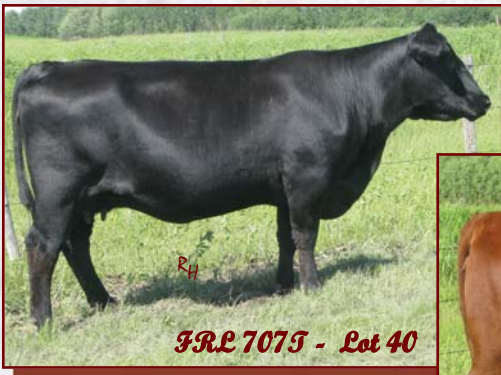
FRL 707J - Lot 40

An exciting young Image daughter out of one of the best 155H daughters. PE May 20 to August 1 Red Crescent Creek Image 18X.