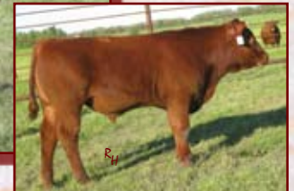
Red Crescent Creek Prafire 149Y 2011 Bull calf of Lot 55