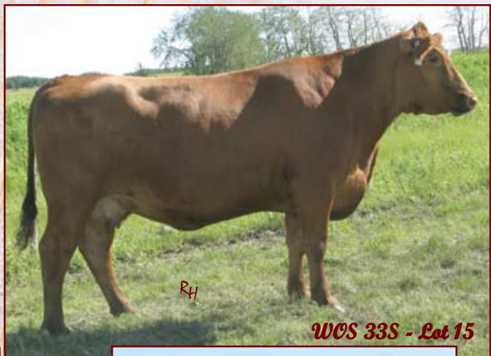
WOS 33S - Lot 15