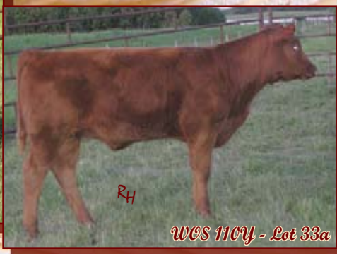
WOS 110Y - Lot 33a