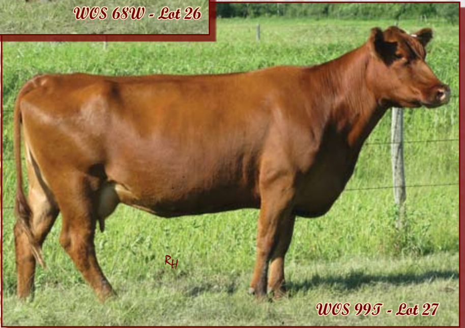
WOS 99T - Lot 27