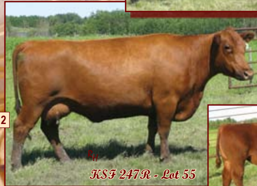
KSF 247R - Lot 55

APd April 26 Red Crescent Creek HI Ho 102M. PE May 13 to July 5 Red D-Bar Pathfinder 36P.