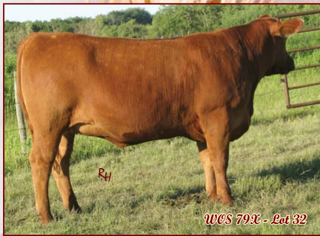
WOS 79X - Lot 32