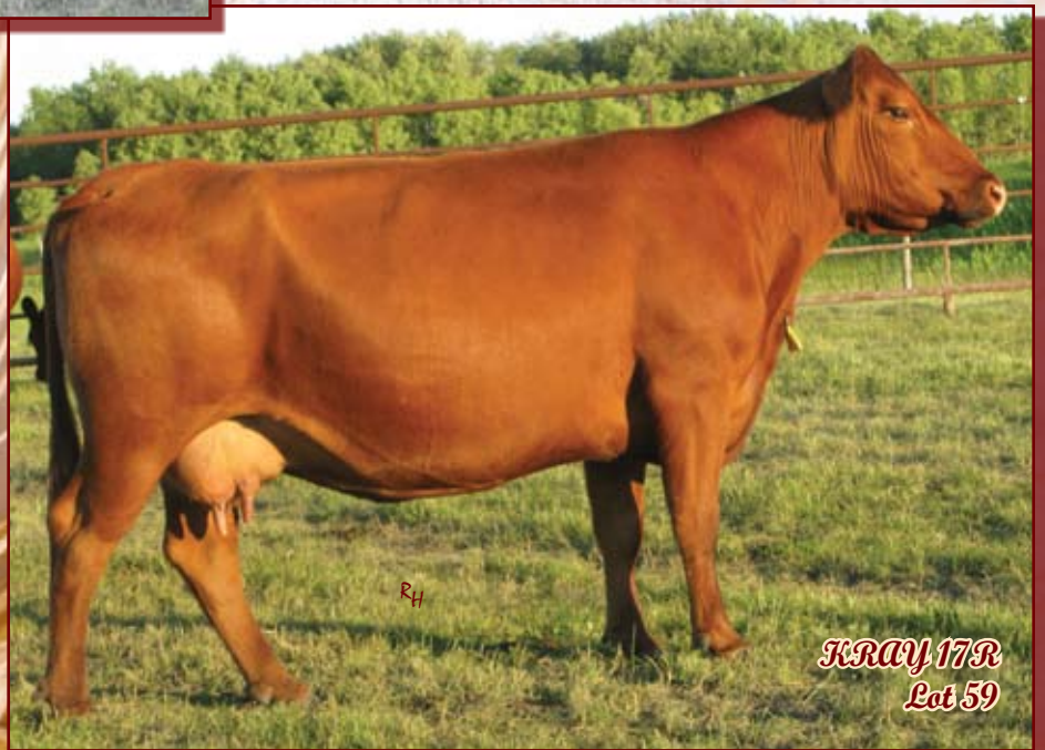
KRAY 17R Lot 59

Bred May 11 to Red Crescent Creek Hi Ho 102M.