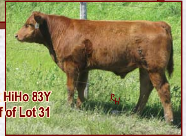
Red Crescent Creek HiHo 83Y 2011 Bull calf of Lot 31

Carcass EPD's: REA: -0.01 Marb: -0.06 Fat: -0.030 Y Grade: -0.21 Carcass Wt: +5