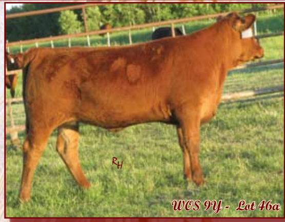
WOS 9Y - Lot 46a