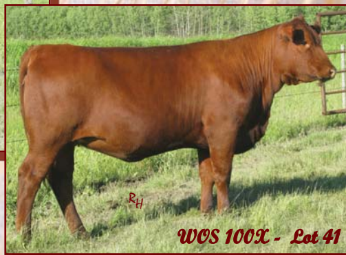
WOS 100X - Lot 41