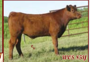
2011 Bull calf of Lot 25