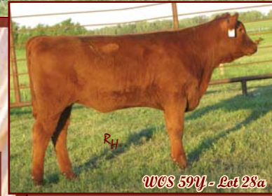
WOS 59Y - Lot 28a