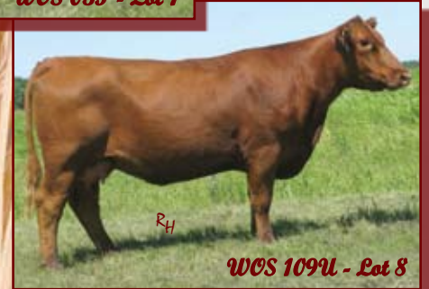
WOS 109U - Lot 8