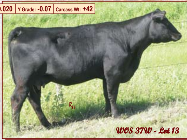
WOS 37W - Lot 13

An exciting young Emblazon 58T daughter whose females look like they will make excellent cows. Bull calf 18Y. PE May 13 to July 5 Red D-Bar Pathfinder 36P.