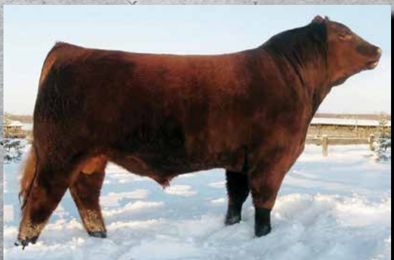
Red Northline Fat Tony 605U - Sire of Lots 3, 4, 24, 41 and 53