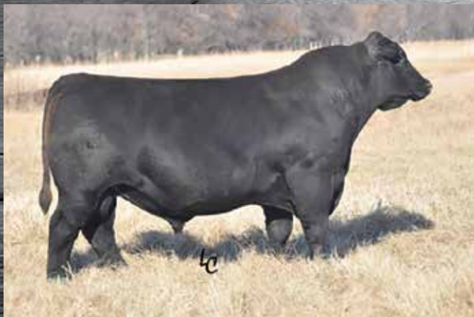
Vin-Mar Focus In 8847 - Sire of Lots 29, 37, 43 and 44.