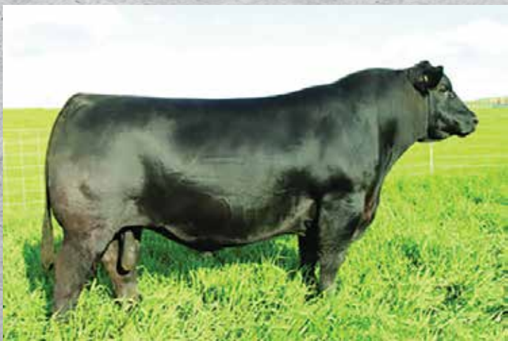
SA V Harvestor 0338 - Sire of Lot 38