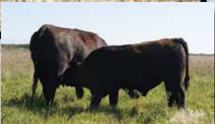
22A with his dam this past summer