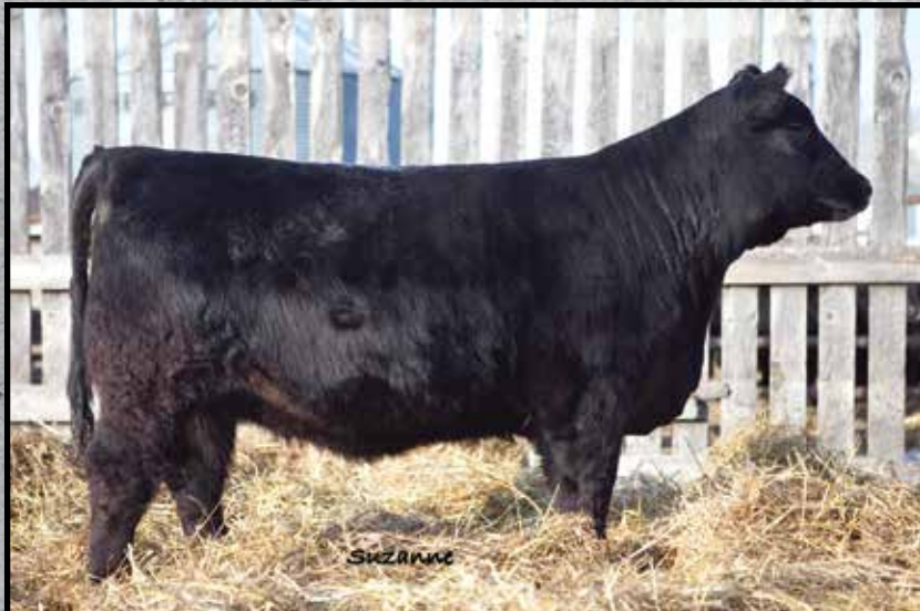
Ramrod Erica 309A - Sired by Ramrod No Fear 921W

BW: 88 lbs Sept 20, 2013 Actual Weaning WT: 622 lbs