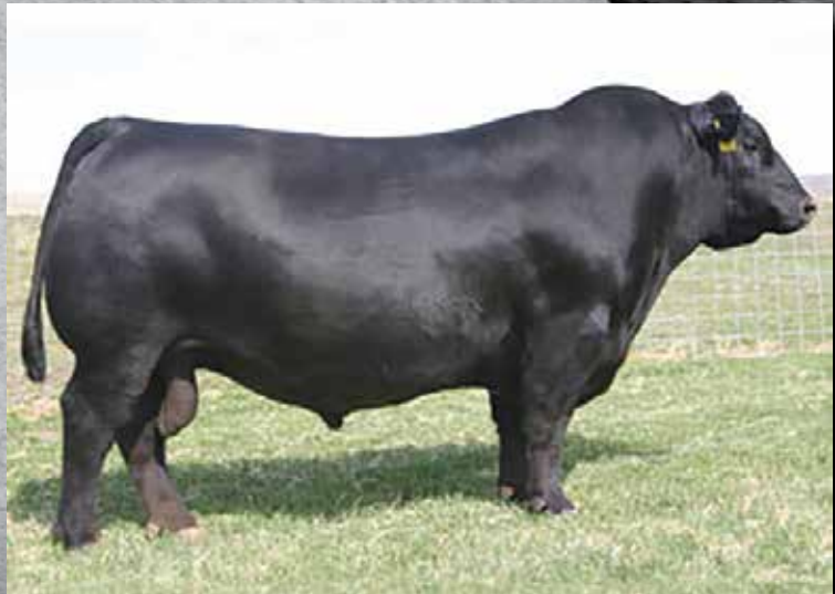
S A V Net Worth 4200 - Sire of Ramrod No Fear 921W