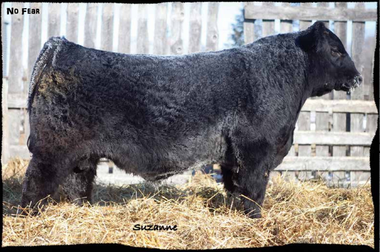
Bull calf champion and overall reserve champion bull at the 2013 Manitoba Angus Gold Show.