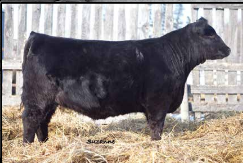
Ramrod Faith 330A - Sired by Ramrod Marquee 160L