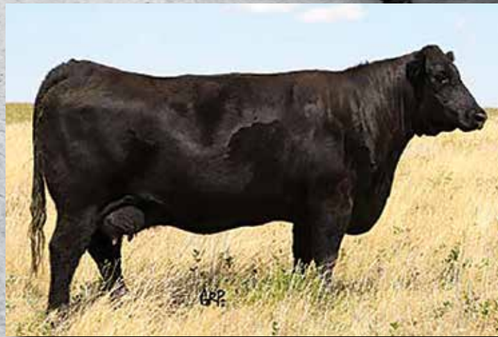
HF Miss Blackcap 160T- Dam of Lot 38