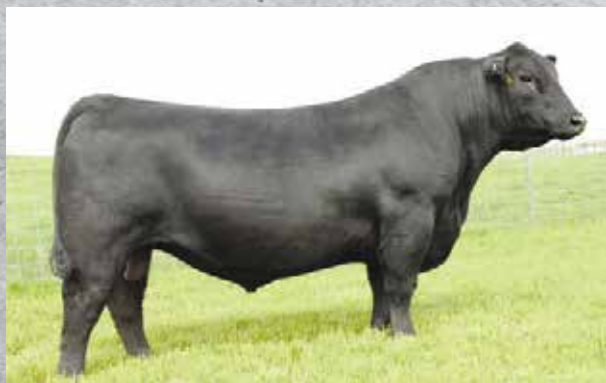
S A V Brand name 9115 - Sire to Lots 32 and 50

50K - lighter birth weight, increased weaning weight, more docile