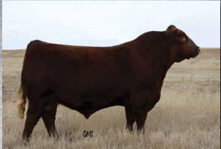
Red Howe Bold Edition 80T - Sire of Lot 57