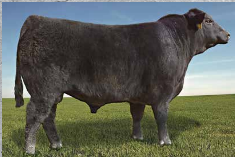
RA F Wide World 920 - Sire of Lots 13, 20, 23, 26, 28, 30, 39, 45 and 48