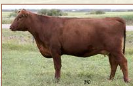
Dam: Serebl 63W

M 16 RED UBAR SEQUOIA 202 OSF TM 47 RED BRYLOR SEQUOIA 212X CE 4.3 RED XXX LAKME 70M MAF OSF RED DIMLER INDEED 105R RED WRAZ SEREBL 63W RED KMAC SEREBL 95N