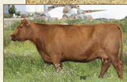
Dam: SBB 23U