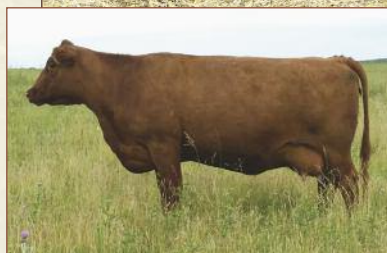
Dam: LMP 3X

PERFORMANCE HEIFER BULL BY YY HITCH 23X! This bull will have that extra performance many are looking for while maintaining that all important calving ease. There are many Hitch 23X sons out breeding heifers to date and the common theme in the feedback among them all is calving ease with very consistent low birth weights. Hitch 23X was our go to calving ease specialist until we had to part with him this fall after an injury. The Hitch progeny will be a little slower to mature but good things take time and the proof is in the females. His daughters are proving to be great uddered milking machines that can really produce! The dam behind this Hitch son will only add to the strength behind this breeding machine as your next herd sire. LMP 3X has everything you are searching for as the dam behind your next herdsire. She is real hard to pick a hole in! This bull is right at the top of the quality list for calving ease with extra performance. We were unable to get a video of this guy but it has nothing to do with his quality, we just simply ran out of time!