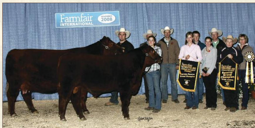
Dam of Lot 49: NVG 21P

Check out this April born son of our go to calving ease sire Hitch 23X. There won't be many more of these Hitch sons since we lost him to an injury this past summer. We don't put many April born bulls in our sale but this one is pretty much keeping up with the older bulls and he is showing great testicle development. He is one of the most powerful Hitch sons in the offering born April 2 and weighing 632 lb. on Oct 10 so his WPDA will be pretty darn good. This guy's dam is a graduate of the mighty Red Round Up a few years back where she was one of the top selling bred heifers at $9250. Lynn 21P was Supreme Reserve Champion female at Farm Fair 2008. She was a donor female for Vikse Family Farm and Clay Enterprises and