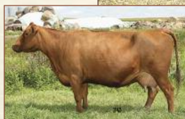
KMAC 95N, Granddam of Lots 30, 53 and