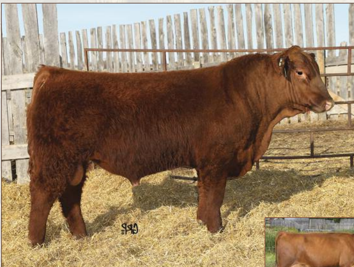
Dam: WRAZ 57X

Here is one to keep all the females! His dam Serebl 57X by Tycoon 2T has a tremendously beautiful udder like all the Tycoons do and the way these Ghost Rider females are milking, the daughters will be outstanding. This guy has a good solid set of numbers and the goods to back them up. Granddam Serebl 760T is a top producing CAA Premiere dam with another son in the sale this year and great granddam Serebl 95N is still here with another one at side and she will soon be set up to be flushed again. I cannot say enough good about this Serebl cow family. Just git-er-done! Please check out the video on our website www.wraz.ca