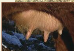
Dam CPRA 293X's udder a day after calving

RED FINE LINE MULBERRY 26P OSF AMF MAF DDF RED BRYLOR JKC GHOST RIDER108Y DDF RED BRYLOR CHEROK 22L RED SIX MILE TYPHOON 289T RED DOUBLE C ROXIE 293X RED DOUBLE C ROXIE 823T