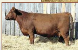
Dam: CPRA 301X