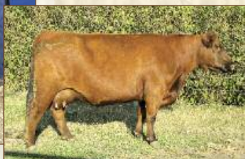
Dam of Smack 31U

Now that SMACK's daughters are milking there is no question his claim to fame will be his females. They have beautiful shaped udders and teats with an abundance of milk. His sons and daughters are born easily and he passes on his very dark red hide and a black foot. SMACK progeny will calve with moderate birth weight, adequate muscle and growth.