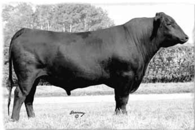
REMINGTON RIGHT TIME 156R