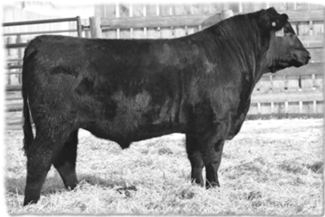
LOT 34 - CCL PENDELTON 6X