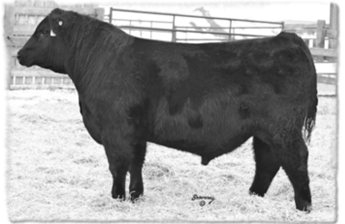
LOT 14 - KSC RACHIS 72X

BW: 92 lbs. Adj. 205D: 765 lbs. Adj. 365D: 1199 lbs. EPDs: BW: +4.4 35% WW: +60 25% YW: +111 16% Milk: +24 15% TM: +54