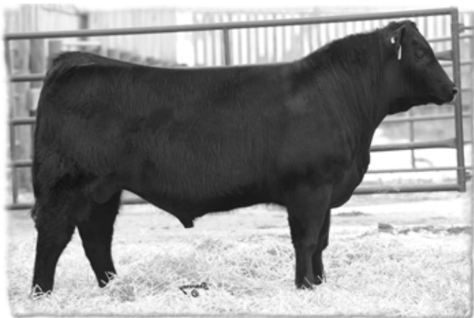
LOT 7 - CCL RACHIS 47X