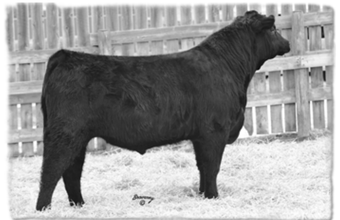
LOT 2 - CCL RACHIS 11X

BW: 99 lbs. Adj. 205D: 619 lbs. Adj. 365D: 1022 lbs. EPDs: BW: +4.7 35% WW: +42 24% YW: +84 16% Milk: +17 14% TM: +38