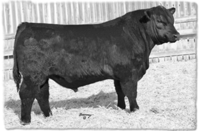
LOT 13 - CCL RACHIS 64X