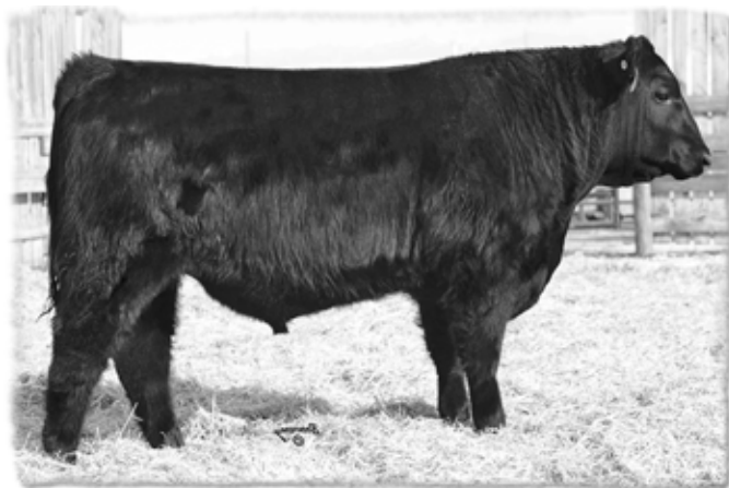
LOT 9 - CCL RACHIS 53X