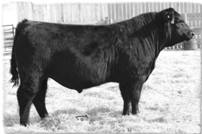
LOT 4 - CCL RACHIS 36X

REMITALL H RACHIS 21R AMF NHF OSF 1274555 REMITALL NIGHTHAWK 37N HENDERSON MISSIE 32'02 CCL MISSIE 4T 1391627 MVF GRAND DESIGN 56R CCL MISSIE 18R BW: 93 lbs. Adj. 205D: 751 lbs. Adj. 365D: 1271 lbs. EPDs: BW: +4.1 35% WW: +57 25% YW: +108 17% Milk: +18 13% TM: +47