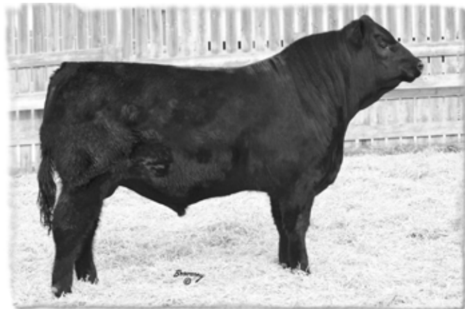
LOT 6 - CCL RACHIS 40X