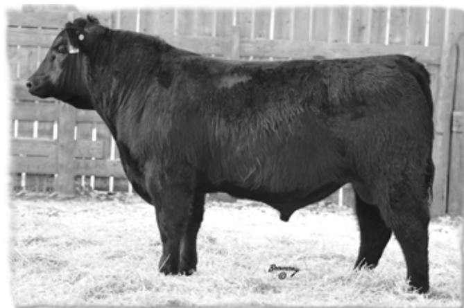
LOT 27 - CCL TOTAL 27X