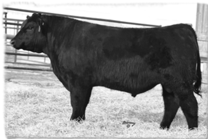
LOT 5 - CCL RACHIS 37X