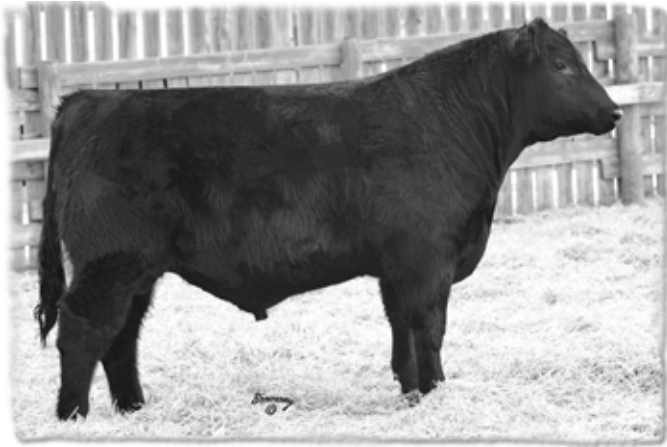
LOT 12 - KSC RACHIS 61X