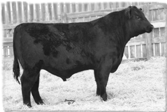
LOT 3 - HJD RACHIS 12X