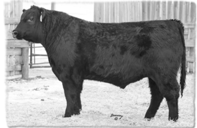
LOT 16 - CCL RACHIS 78X

BW: 90 lbs. Adj. 205D: 688 lbs. Adj. 365D: 1202 lbs. EPDs: BW: +3.9 33% WW: +52 23% YW: +102 15% Milk: +16 12% TM: +42