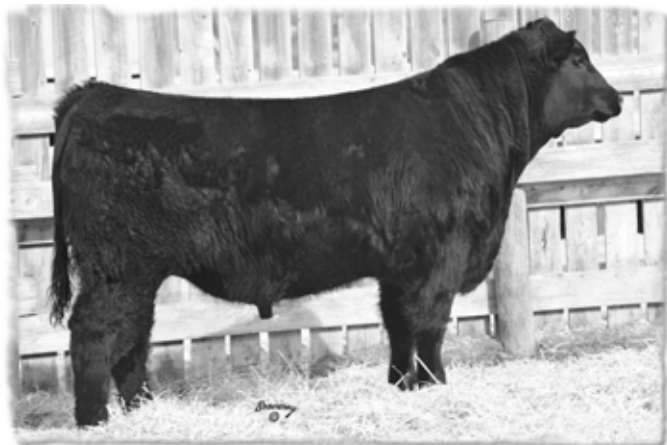
LOT 10 - CCL RACHIS 56X

BW: 91 lbs. Adj. 205D: 586 lbs. Adj. 365D: 1043 lbs. EPDs: BW: +3.5 35% WW: +39 25% YW: +85 17% Milk: +17 14% TM: +37