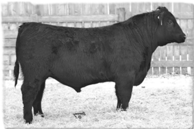
LOT 20 - CCL RACHIS 98X