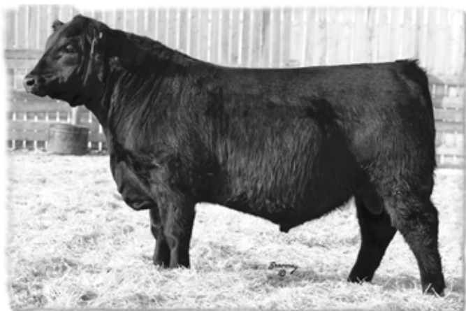
LOT 25 - CCL TOTAL 16X