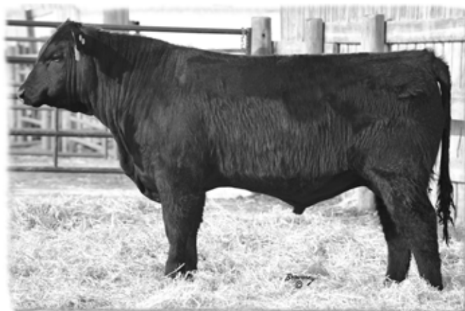
LOT 42 - CCL RIGHT TIME 133X