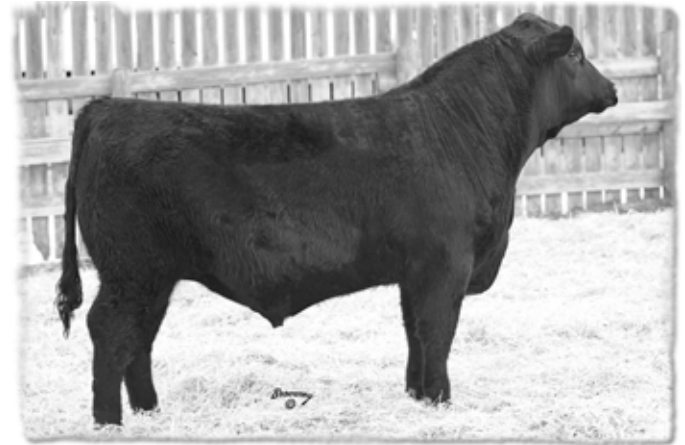
LOT 35 - CCL TRIGGER 13X