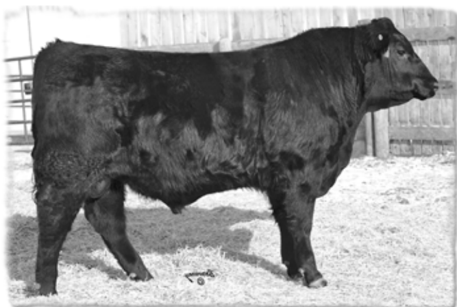
LOT 21 - HJD RACHIS 119X