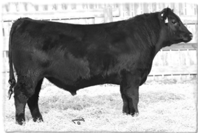
LOT 31 - KSC TOTAL 68X