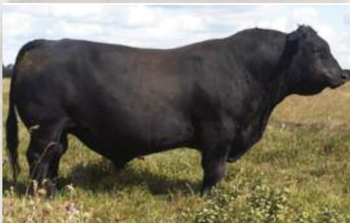
Chapman Rito Legacy 218U - Sire of Lot #64