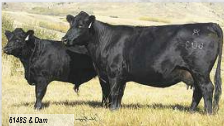
6148S & Dam