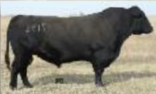
Mc CUMBER 536P EXT 7196 {Sitz JLS Emulation EXT 536P x Pine Creek Right Time 1147}