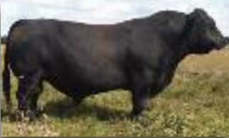
CHAPMAN RITO LEGACY 218U {Sinclair Rito Legacy 3R9 x N Bar Impact U1253}