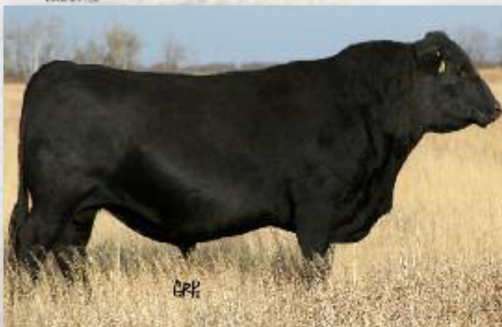
Lot #2 - 0505X - Forage-Raised Bull Sale 2012 after breeding season this summer/fall.