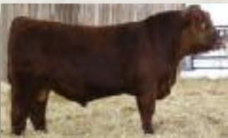
RED BAR-E-L GAMBLER 87X {Red Lazy MC Cowboy Cut 26U x Red Bar-E-L Approval 4L}