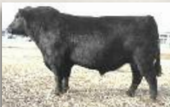
Sinclair Entrepreneur 8R101 (Sire)

There is no guesswork with this one. His dam has not missed. His sire, Entrepreneur, is the result of mating the standard for performance and longevity, Rito 707, with an N-Bar donor still in production at the age of 17.