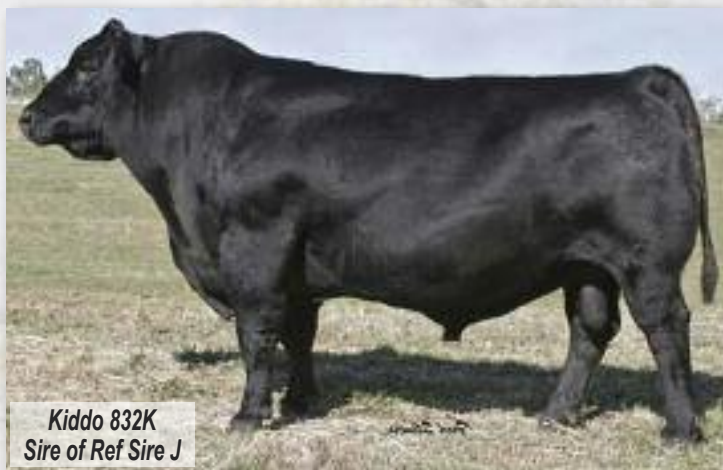
Kiddo 832K Sire of Ref Sire J