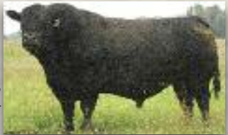
CROWFOOT JOKER 6172S {OCC Joker 620J x Tomwall GDAR Royce 964}