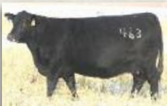
B Pride 463 of Mc Cumber (Dam)

His dam has been a consistent producer of pounds and performance while maintaining a spotless record for fertility and productivity. She has a WWR 6@112, YWR 6@108, IMF 6@110, REA @100 and her grand dam was still in production at the age of 18 in TX. B Pride 463 has that ideal wedge shaped look. She is a big bodied cow with plenty of thickness, sound feet and legs, and an udder that should last forever. She has maintained her Pathfinder status since she qualified after 3 calves and was flushed for the first time last spring in order to get more daughters of her into production.