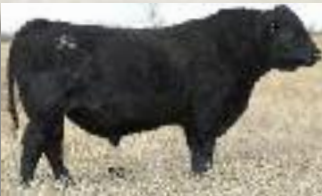
SINCLAIR RITO 9R7 {Rito Revolve 0R5 x Sinclair Net Present Value}