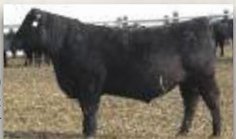
SINCLAIR X-PLUS 1XX20 {Sinclair Emulation XXP x N Bar Double Time D0116}