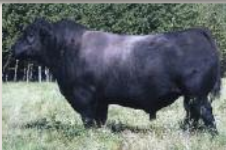
(right) O C C Legacy 839L - Sire of Ref Sire H