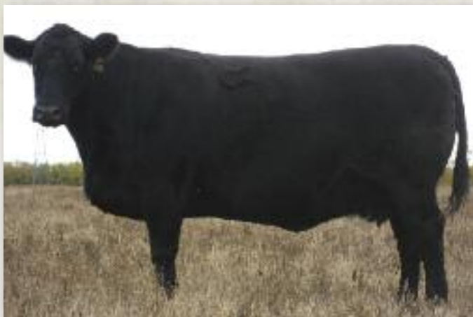
(above) Erica 8984 - Dam of Ref Sire H

Utilize sons of 026S on cows or heifers for their traditional Angus characteristics with built-in calving-ease, longevity, excellent disposition and strong maternal characteristics.