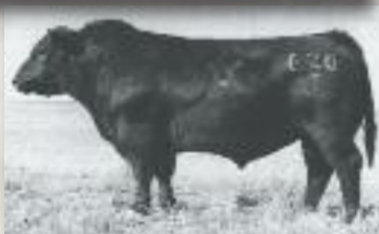
Joker 620J - Sire of 6172

Utilize Joker sons for their maternal potential, favorable carcass traits, and conversion efficiency - proven genetics for any grass-based outfit.