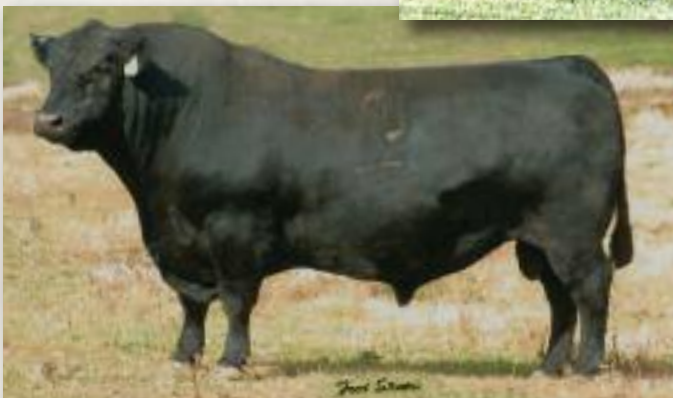
N Bar Shadow