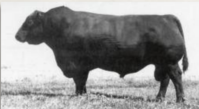
R R Rito 707 - Parental Grandsire to Rito 9R7