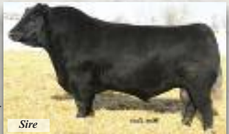
COLE CREEK CEDAR RIDGE 181 {Cole Creek Cedar Ridge 1V x HBR Encore 0544}