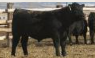
SINCLAIR EXQUISITE 1X51 {N Bar Emulation EXT x N Bar Emulation EXT}