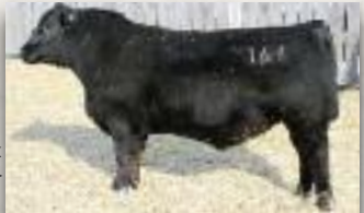
Mc CUMBER 8R101 RITO 161 {Sinclair Entrepreneur 8R101 x Pine Creek Right Time 1147}