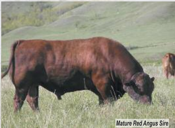
Mature Red Angus Sire

Although black is our predominant color, here are 5 solid Red Angus bulls that really stand down on all four corners. The Bar-E-L sired bulls have lots of testicle, hair, excellent disposition and have a real herd bull look. Not bad for 100% Forage-Developed, and out of true 1250 lb. dams.