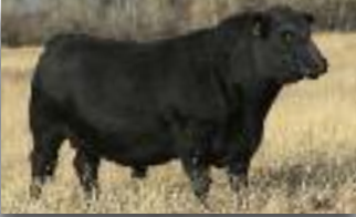
CHAPMAN MEMENTO 0505X {Sinclair Memento 8RL5 x OCC Joker 620J}