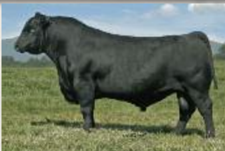
Rito Revolve OR5 - Sire of Ref Sire A

Utilize 9R7 sons to add performance, capacity and structural correctness.