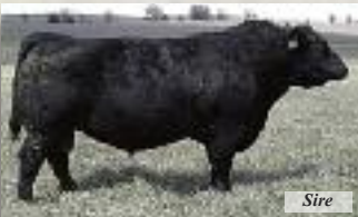
COLEMAN MISSING LINK 9267 {OCC Missing Link 830M x SAV 8180 Traveler 004}