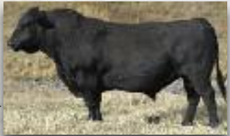
CHAPMAN EQUATION 8541U {Crowfoot Equation 5793R x Sitz Alliance 6595}