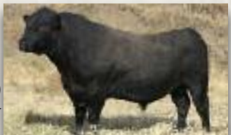
SINCLAIR IN TIME 9RT10 {Leachman Right Time x Basin Emulation 5953}