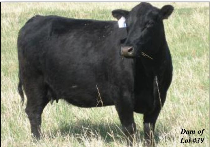
Dam of Lot #39