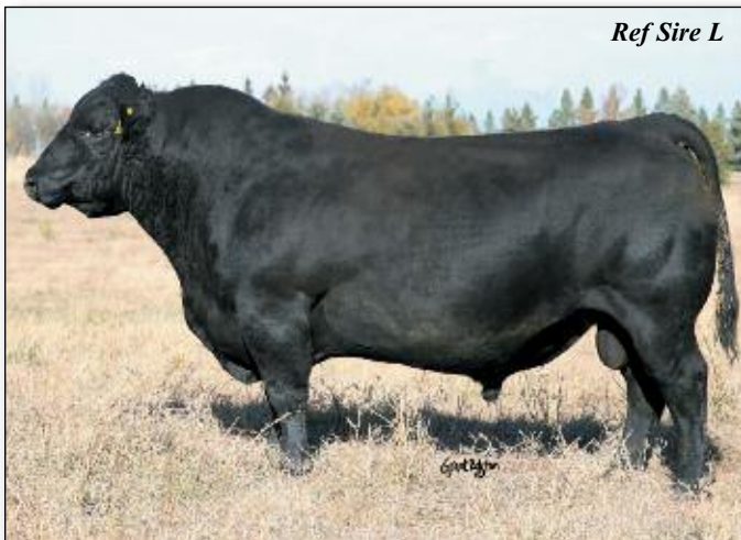
Ref Sire L