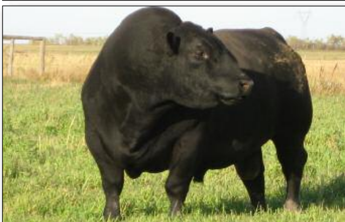
Crowfoot Joker 6172S - Service Sire to Cow Lots # 90 - #94

Exposed: July 4 - Sept. 4 to SINCLAIR HYDRO 90K6 (OCC Kidde 832K x N Bar Explosion)