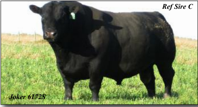
Ref Sire C