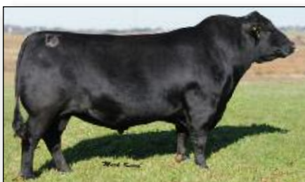
Ref Sire M

His sons selling will be a very useful calving ease and maternal tool while maintaining growth, moderating frame and promoting positive carcass traits.