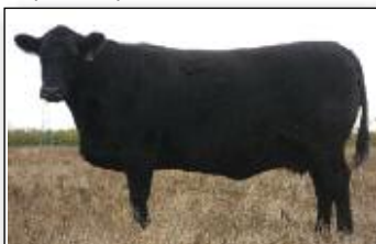
Dam of Legacy 026S

026S is a paternal brother to Crowfoot Equation 5793R who was purchased in-dam from Crowfoot Cattle Co in 2005. His donor dam, Pat Lady Erica 8984, is perhaps the best cow Crowfoot has sold to-date when considering the amount of sale features the CFCC prefix has produced for other breeders in a post-dispersal era. She has combined weaning and yearling ratios of 108 and 110 respectively and is extremely sound as a fourteen year old cow. Sons of 026S exhibit traditional Angus characteristics with built-in calving-ease and maternal characteristics.