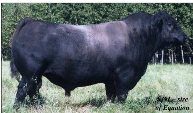
839L - sire of Equation