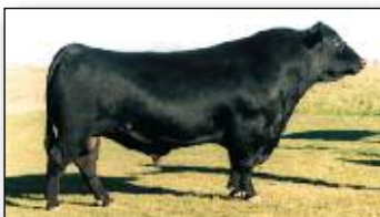
Nichols Extra - sire of Lot #53

As a rule, if we outsource genetics to use via AI, it is from a program similar to ours in order to maintain uniformity, consistency and predictability in our cattle, so not a lot of experience with Extra H6 as the following lot came in-dam, but H6 sired one extremely long-bodied performance bull here with excellent numbers across the board in all traits. His granddam 1828L produced a previous sale-topper to Wayne Chesney and will see ET work in 2011.