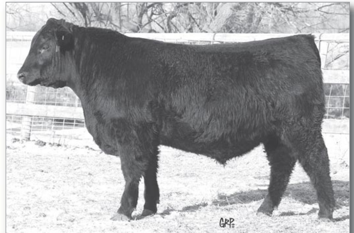
LOT 52 - BROOKMORE FINAL ANSWER 232Y