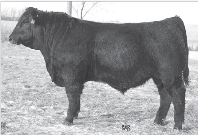
LOT 83 - BROOKMORE NETWORK 208Y