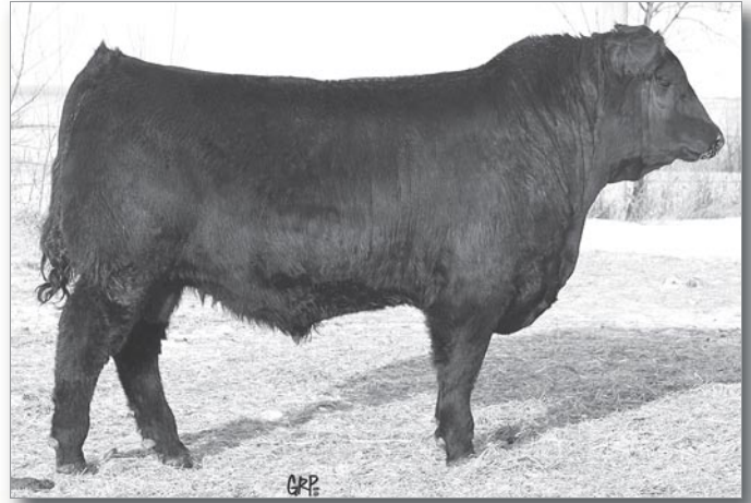
LOT 56 - BROOKMORE BISMARCK 18Y