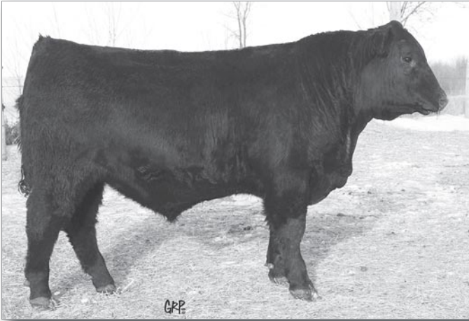
LOT 4 - BROOKMORE UPWARD 65Y