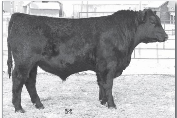
LOT 76 - BROOKMORE ABERDEEN 122Y