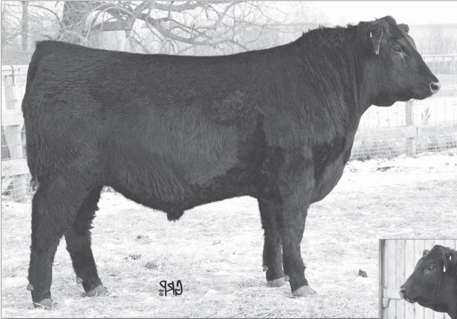
LOT 73 BROOKMORE ABERDEEN 8Y