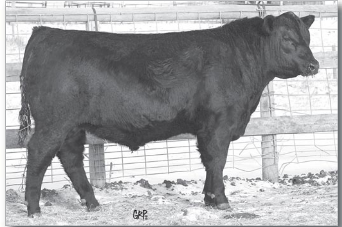
LOT 46 - BROOKMORE FINAL ANSWER 38Y