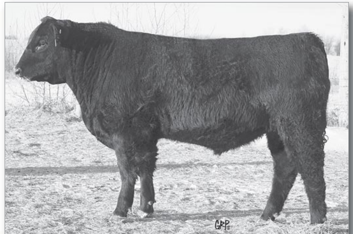
LOT 78 - BROOKMORE ABERDEEN 192Y