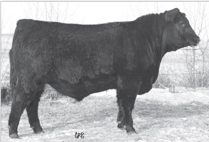
LOT 45 - BROOKMORE FINAL ANSWER 37Y