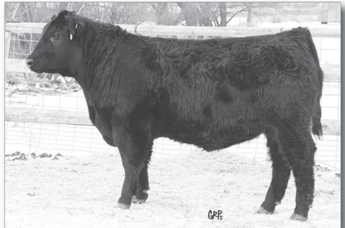
LOT 85 - BROOKMORE TOTAL 183Y