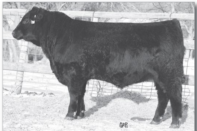
LOT 36 - BROOKMORE PIONEER 181Y