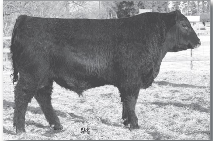
LOT 8 - BROOKMORE UPWARD 69Y