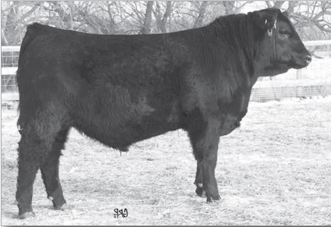
LOT 62 - BROOKMORE BISMARCK 91Y