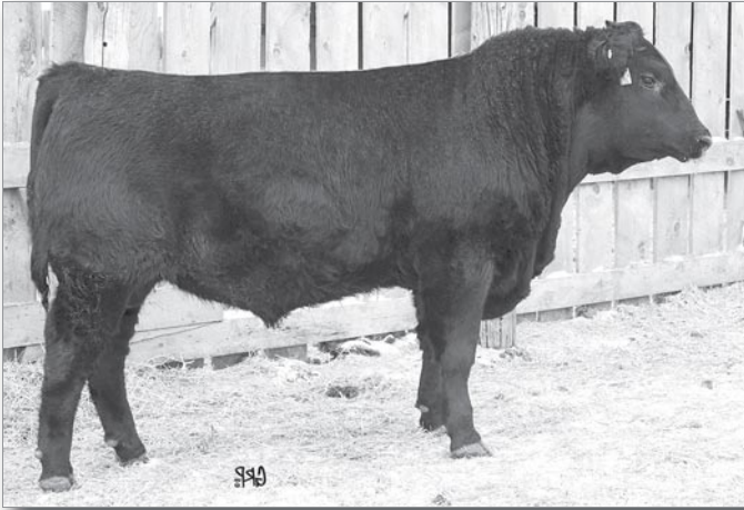
LOT 44 - BROOKMORE FINAL ANSWER 34Y