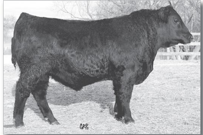
LOT 12 - BROOKMORE UPWARD 98Y