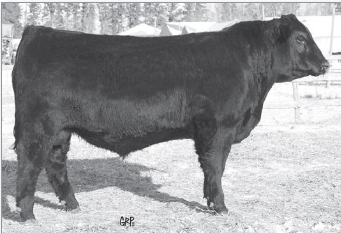
LOT 30 - BROOKMORE PIONEER 100Y