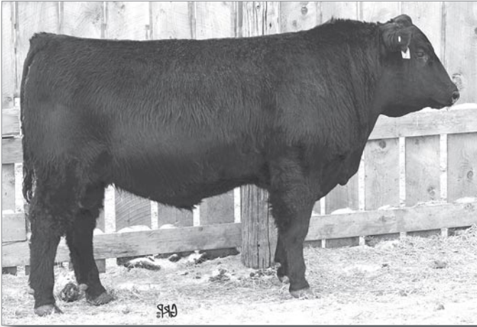
LOT 10 - BROOKMORE UPWARD 116Y