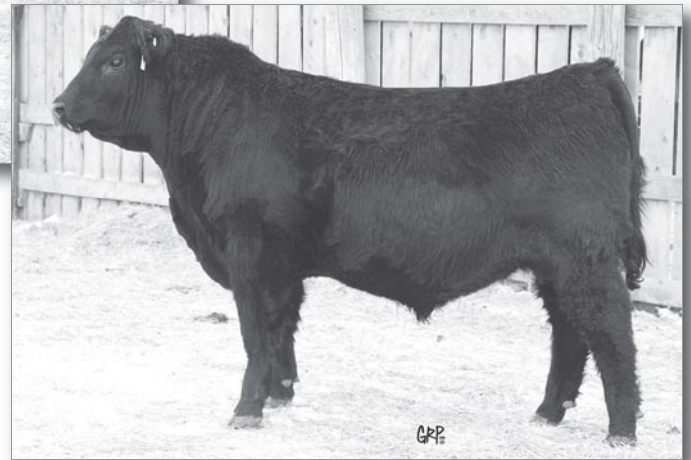
LOT 74 - BROOKMORE ABERDEEN 11Y