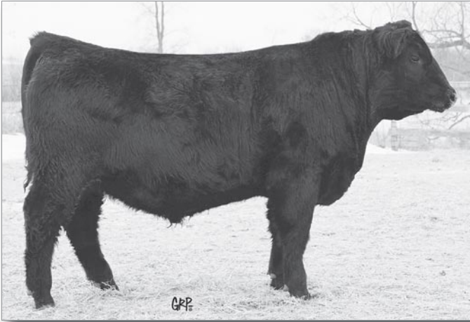
LOT 49 - BROOKMORE FINAL ANSWER 161Y