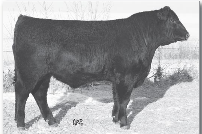
LOT 2 - BROOKMORE UPWARD 150Y