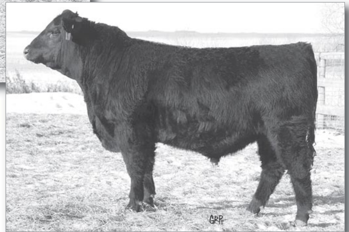
LOT 43 - BROOKMORE FINAL ANSWER 30Y