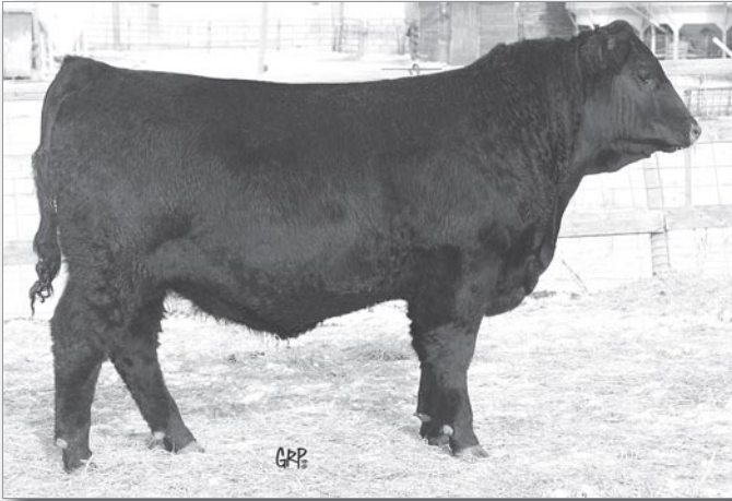
LOT 38 - BROOKMORE PIONEER 222Y