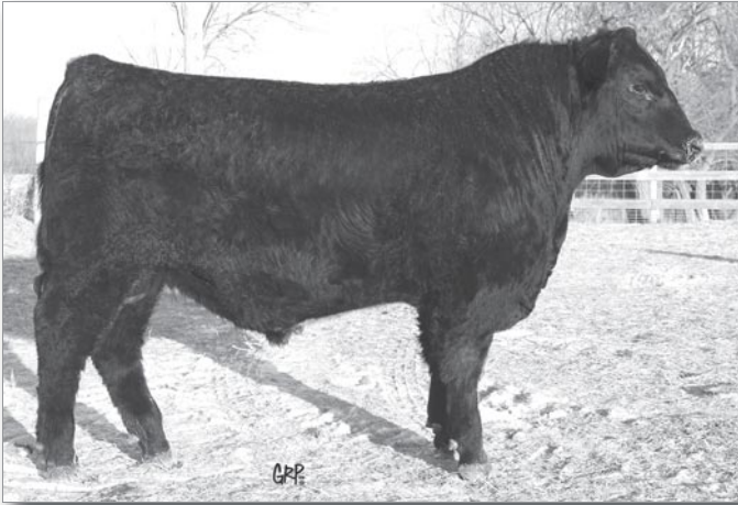
LOT 68 - BROOKMORE NEUTRON 239Y