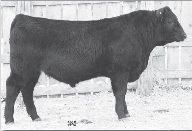
LOT 87 - BROOKMORE LEAD ON 237Y