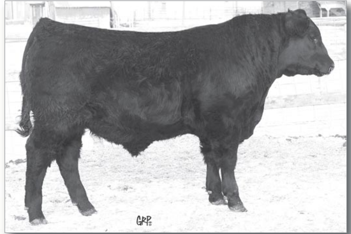
LOT 89 - BROOKMORE DENSITY 264Y