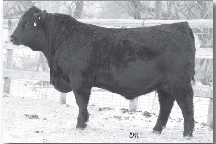
LOT 32 - BROOKMORE PIONEER 134Y