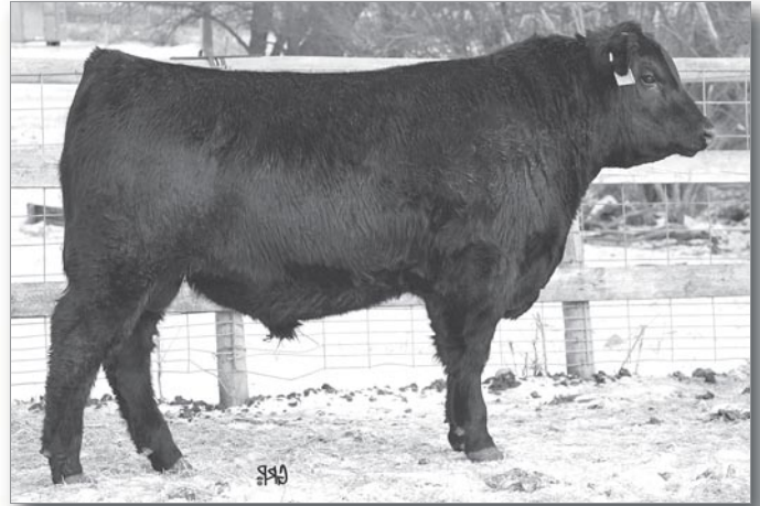
LOT 67 - BROOKMORE NEUTRON 219Y