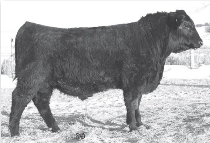
LOT 29 - BROOKMORE PIONEER 80Y