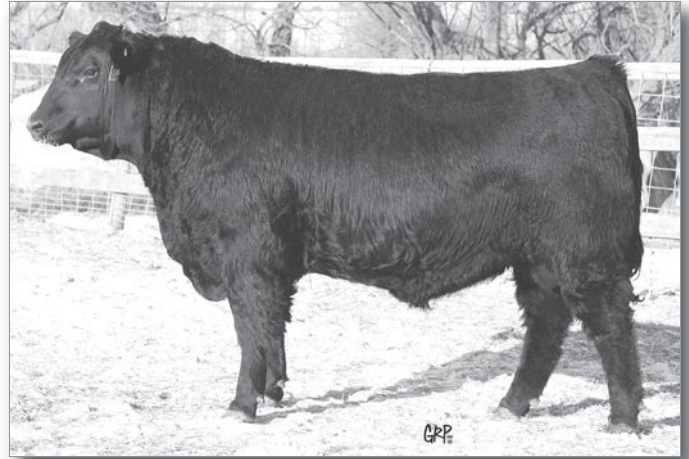
LOT 39 - BROOKMORE FINAL ANSWER 15Y