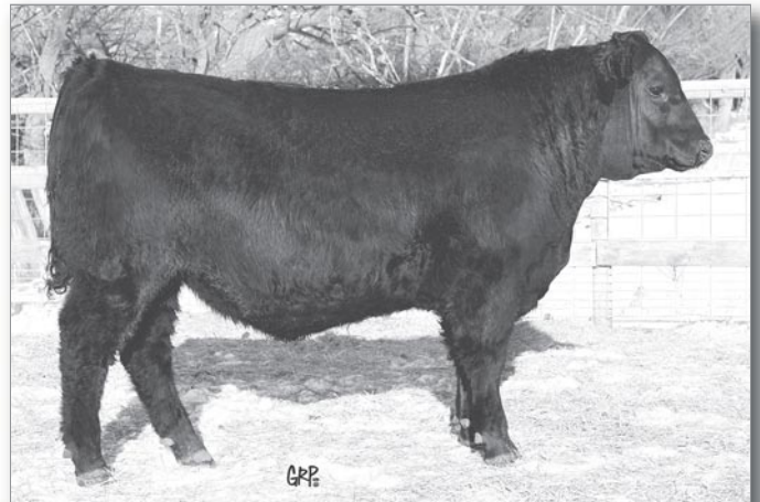
LOT 9 - BROOKMORE UPWARD 86Y