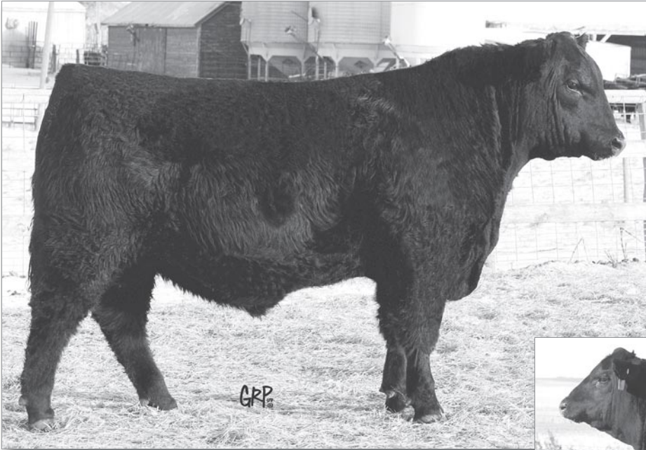
LOT 42 BROOKMORE FINAL ANSWER 28Y