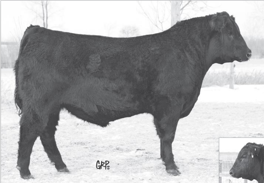
LOT 53 BROOKMORE BISMARCK 121Y