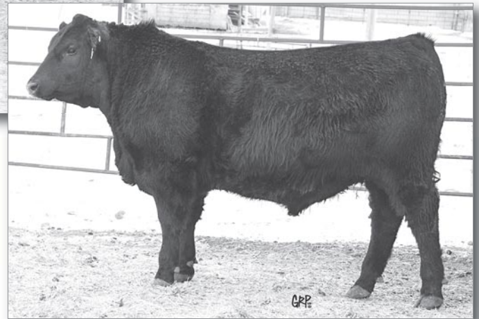
LOT 80 - BROOKMORE NETWORK 107Y