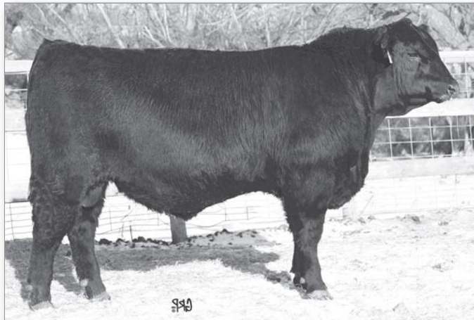
LOT 7 - BROOKMORE UPWARD 66Y