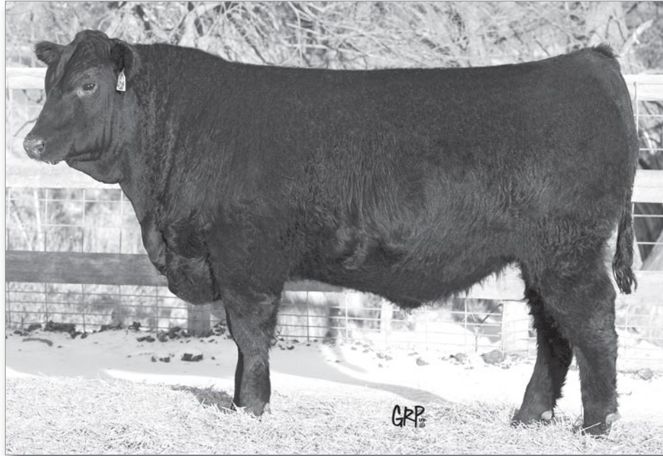
LOT 1 BROOKMORE UPWARD 40Y