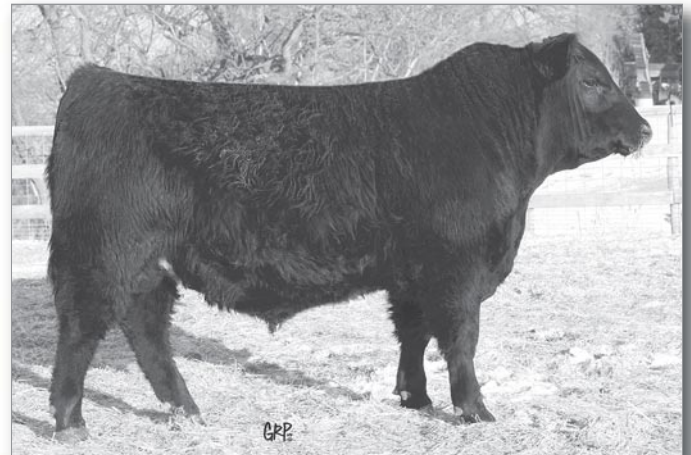
LOT 47 - BROOKMORE FINAL ANSWER 133Y