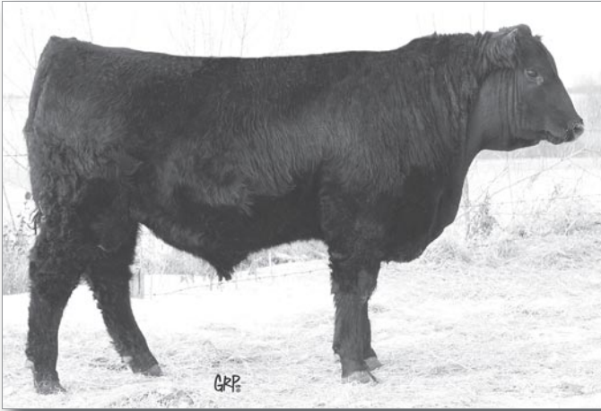
LOT 14 - BROOKMORE UPWARD 156Y