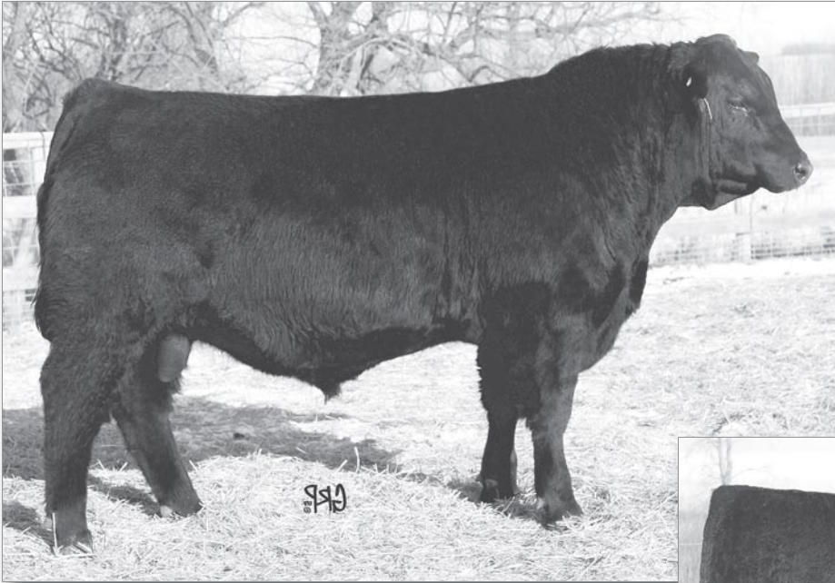
LOT 24 BROOKMORE PIONEER 58Y