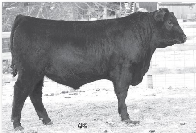
LOT 11 - BROOKMORE UPWARD 117Y