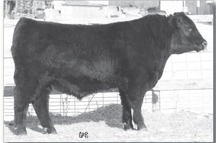
LOT 51 - BROOKMORE FINAL ANSWER 175Y