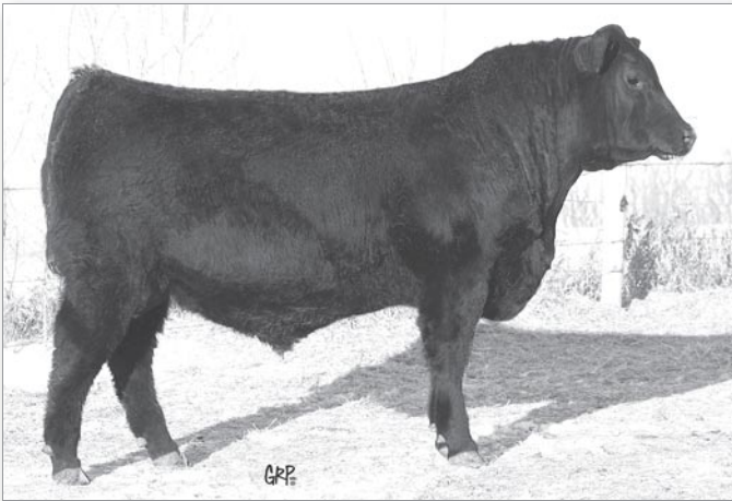
LOT 27 - BROOKMORE PIONEER 51Y