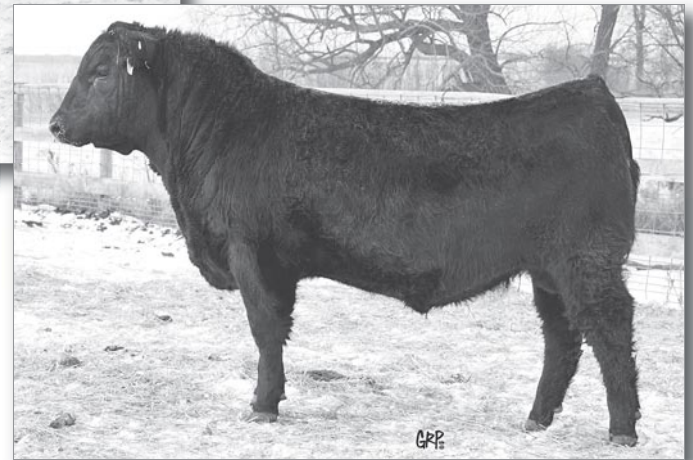
LOT 55 - BROOKMORE BISMARCK 14Y