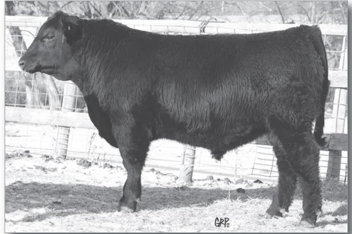
LOT 17 - BROOKMORE UPWARD 176Y