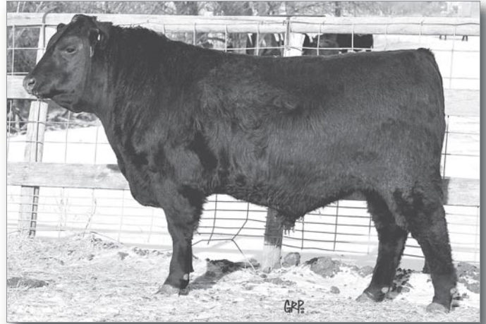
LOT 84 - BROOKMORE QUIET LAD 9Y