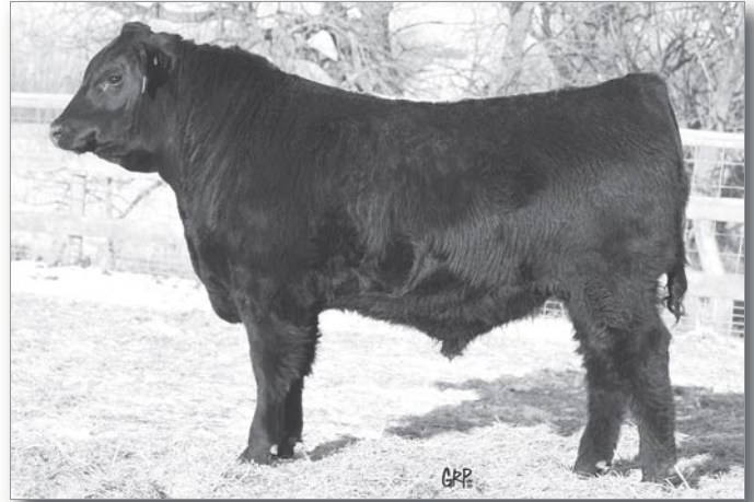
LOT 69 - BROOKMORE NEUTRON 242Y