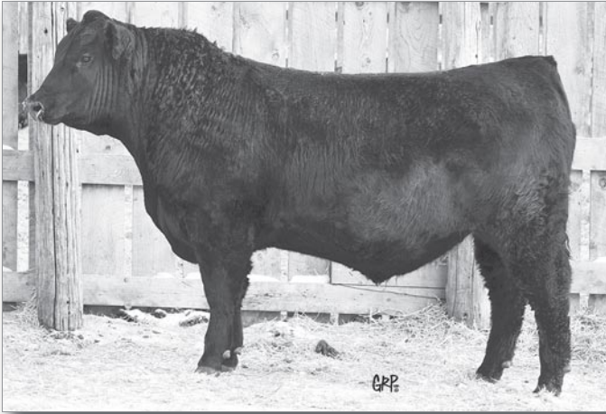
LOT 82 - BROOKMORE NETWORK 188Y