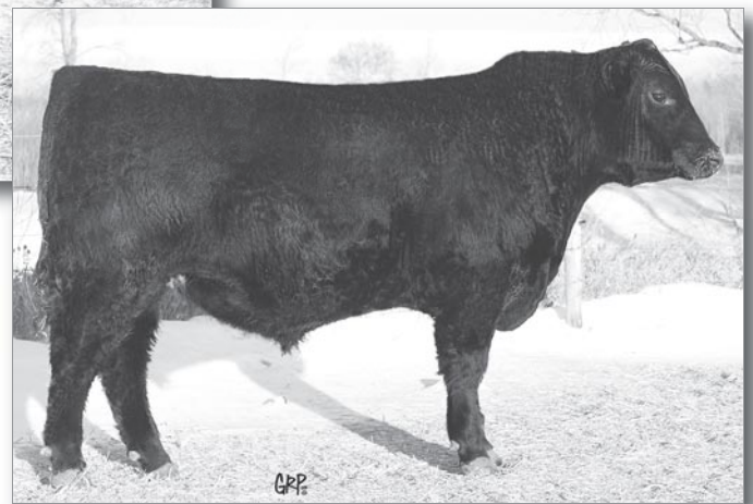
LOT 26 - BROOKMORE PIONEER 47Y