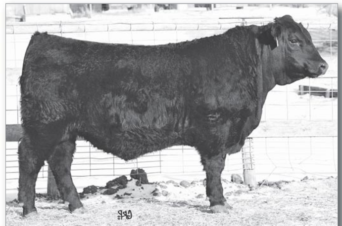
LOT 13 - BROOKMORE UPWARD 151Y