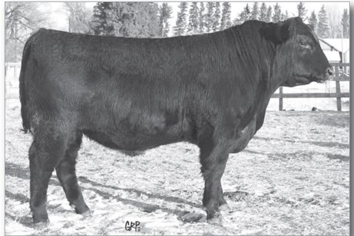
LOT 75 - BROOKMORE ABERDEEN 114Y