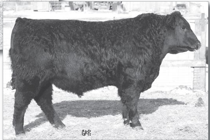
LOT 23 - BROOKMORE UPWARD 202Y