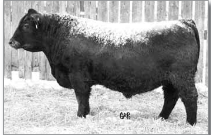
LOT 56 - BROOKMORE FREIGHTLINER 92X