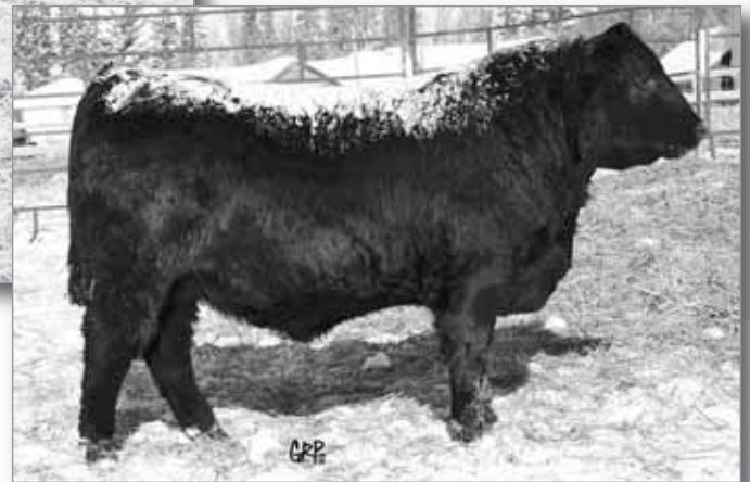
LOT 35 - BROOKMORE DENSITY 166X