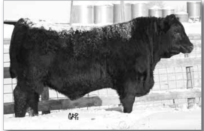
LOT 15 - BROOKMORE NETWORK 106X