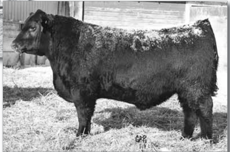
LOT 54 BROOKMORE PIONEER 238X