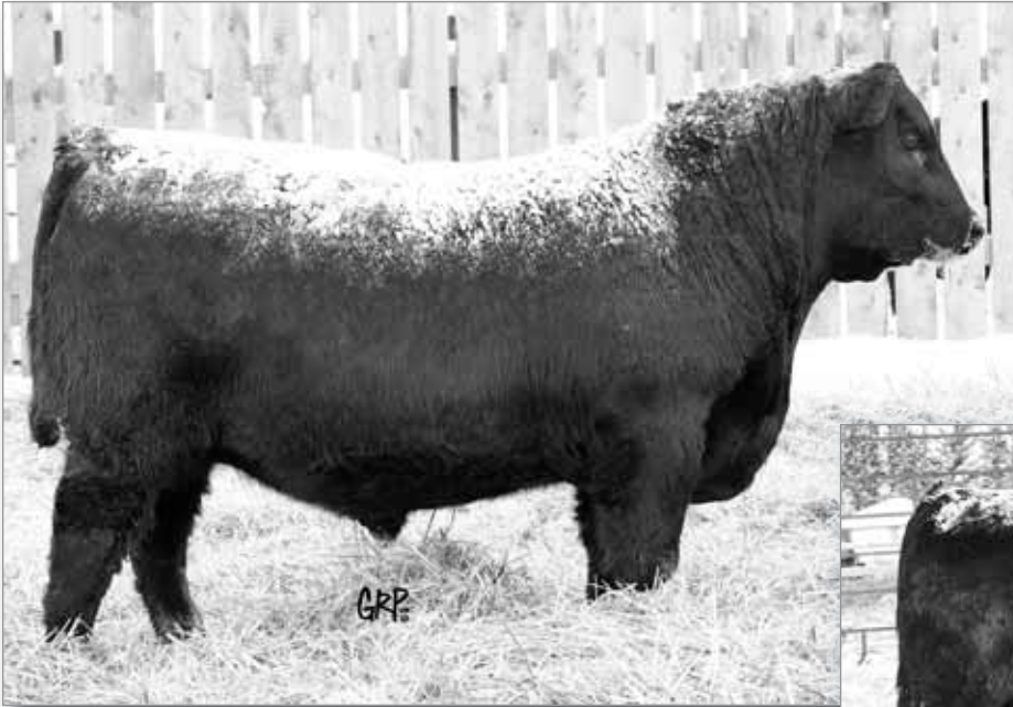
LOT 33 BROOKMORE DENSITY 60X