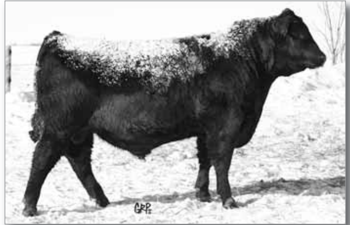
LOT 32 - BROOKMORE DENSITY 55X