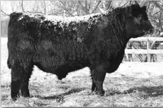
LOT 36 - BROOKMORE DENSITY 58X