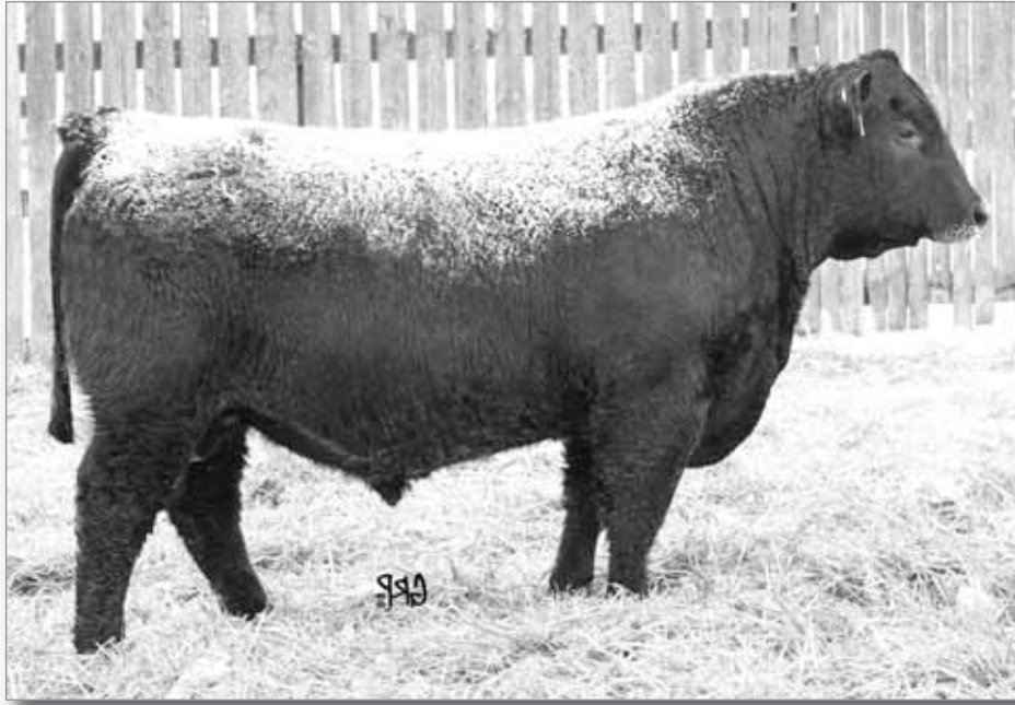
LOT 74 BROOKMORE HERITAGE 215X