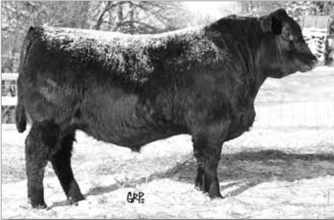
LOT 55 - BROOKMORE FREIGHTLINER 217X