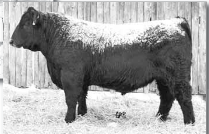
LOT 2 - BROOKMORE NETWORK 193X