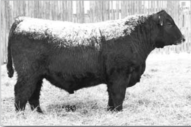
LOT 17 - BROOKMORE NETWORK 136X