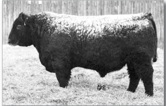
LOT 78 - BROOKMORE BOND 52X