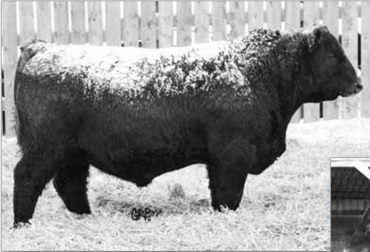
LOT 6 BROOKMORE NETWORK 53X