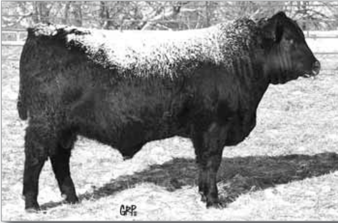
LOT 61 - BROOKMORE PENDLETON 41X