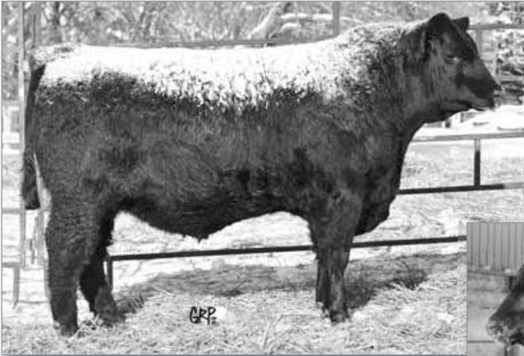
LOT 53 BROOKMORE PIONEER 161X