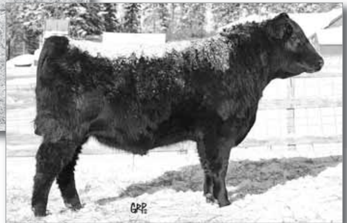
LOT 70 - BROOKMORE BISMARCK 49X