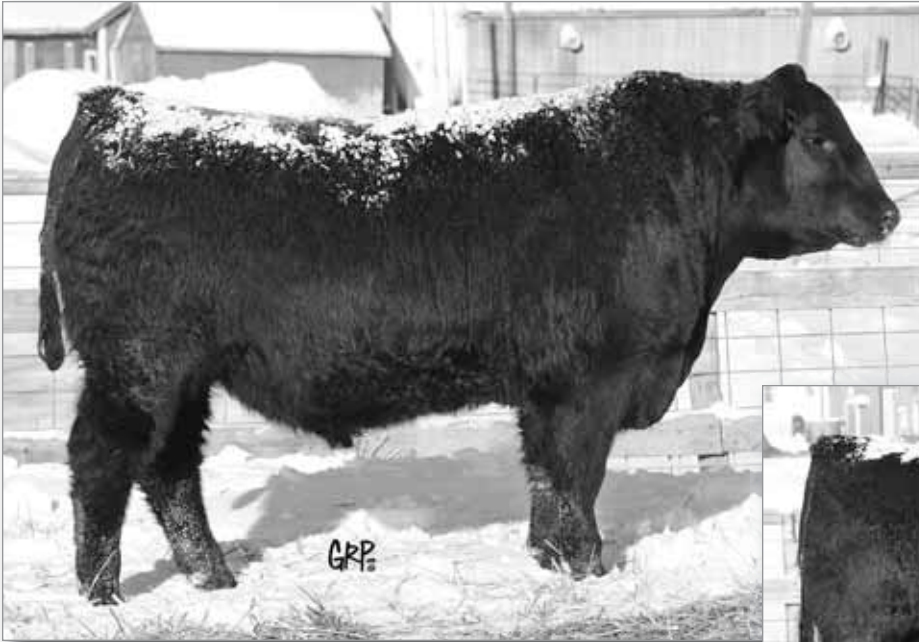
LOT 26 BROOKMORE FINAL ANSWER 56X