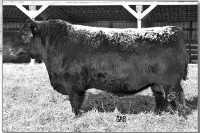
LOT 9 BROOKMORE NETWORK 72X