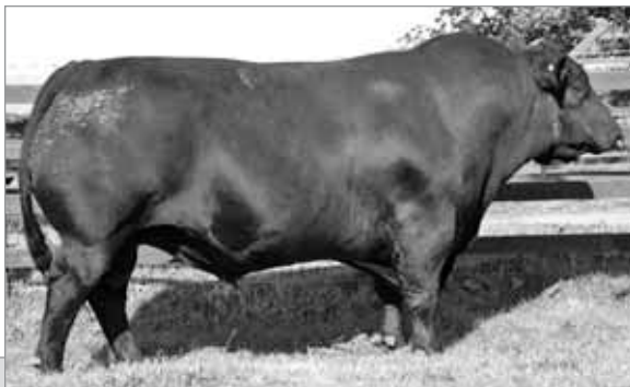
DUNLOUISE CORTACHY BOY D137