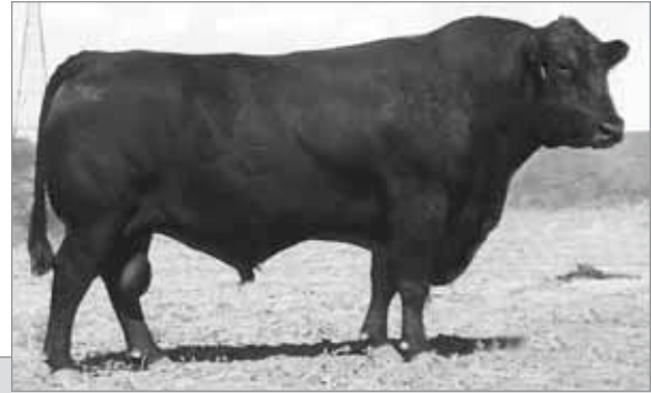
SITZ ALLIANCE 6595