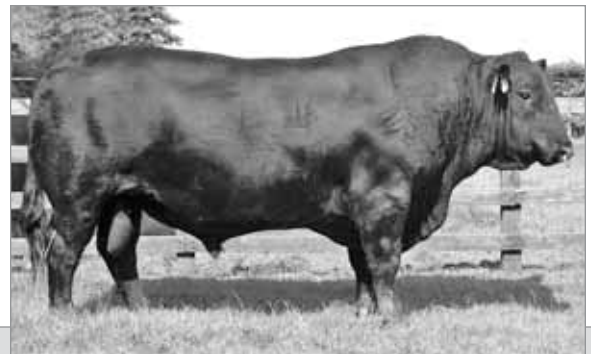
DUNLOUISE COMMANDER BOND