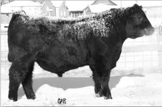
LOT 76 - BROOKMORE BOY 113X