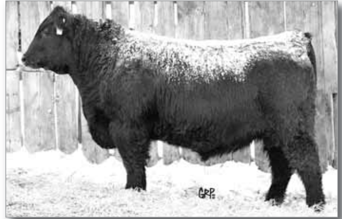
LOT 39 - BROOKMORE DENSITY 202X