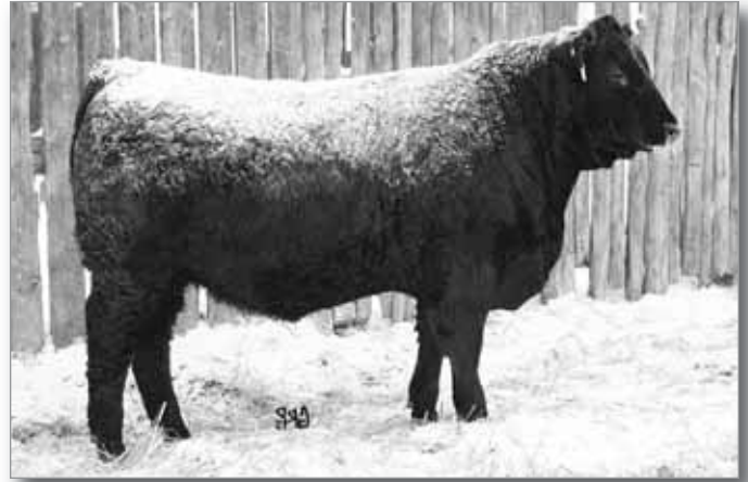
LOT 20 - BROOKMORE NETWORK 147X