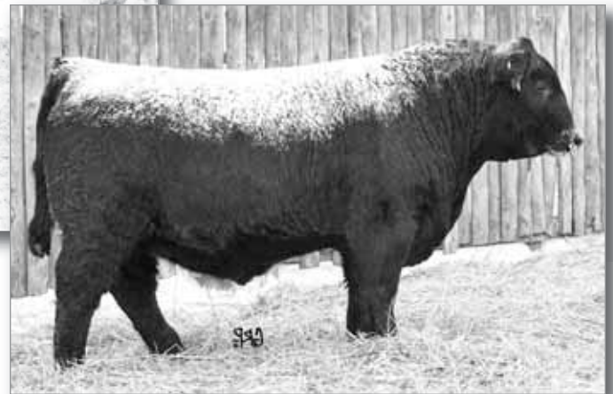
LOT 43 - BROOKMORE PIONEER 207X