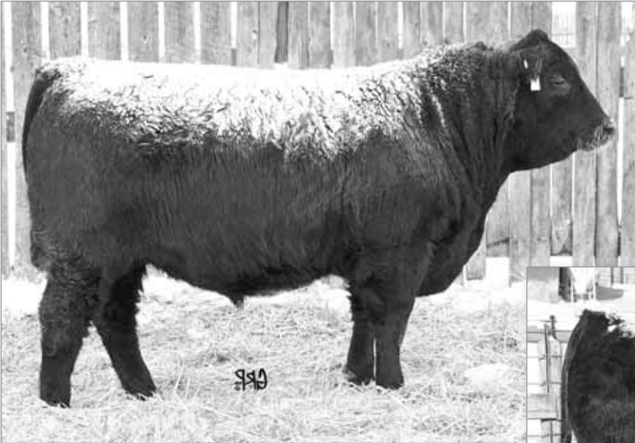
LOT 71 BROOKMORE DYNAMITE 95X