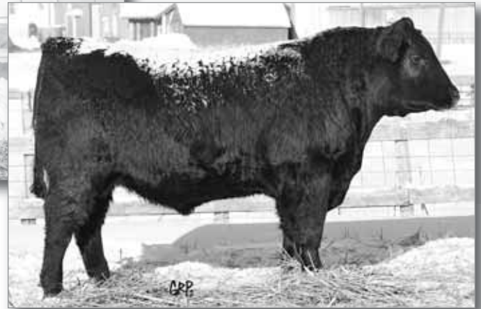
LOT 27 - BROOKMORE FINAL ANSWER 141X