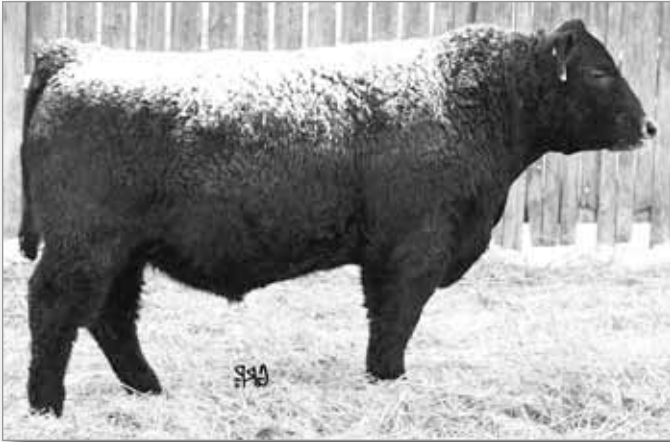
LOT 28 - BROOKMORE FINAL ANSWER 86X