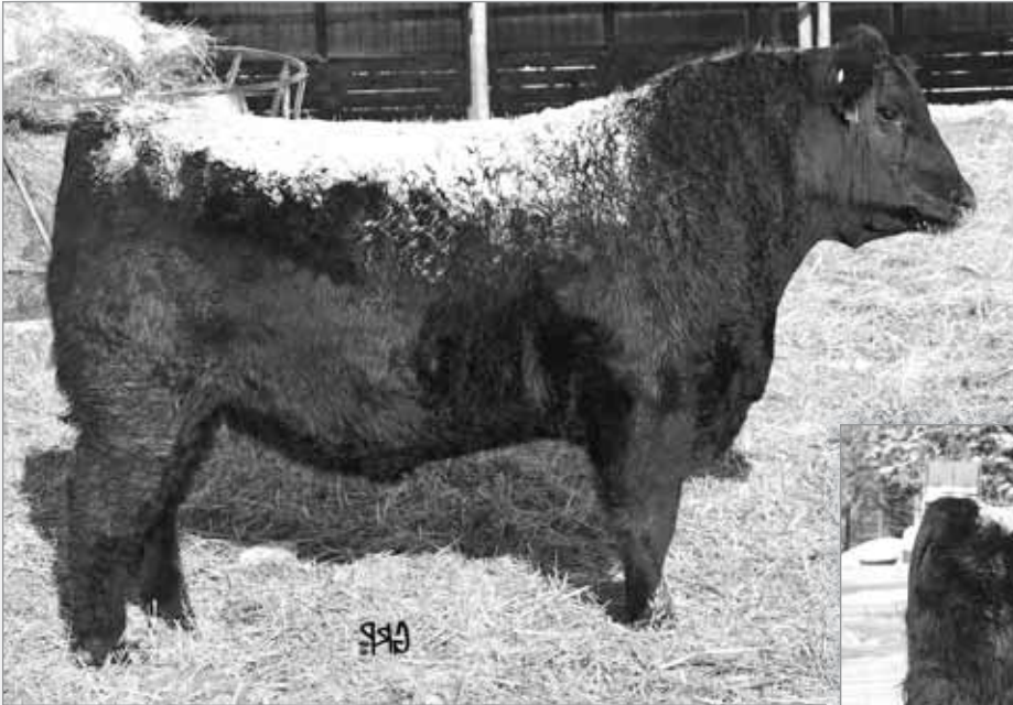
LOT 69 BROOKMORE BISMARCK 20X