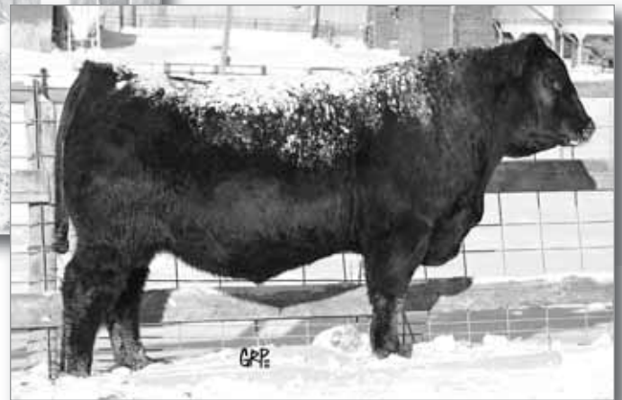
LOT 73 - BROOKMORE DYNAMITE 138X