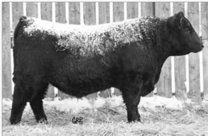
LOT 29 - BROOKMORE FINAL ANSWER 87X