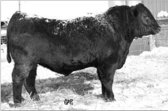
LOT 80 - BROOKMORE ALLIANCE 222X