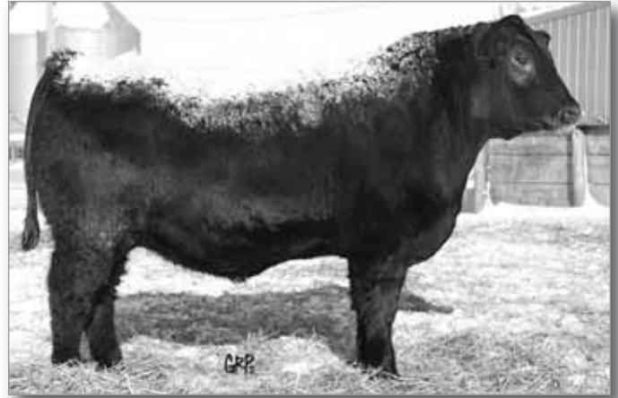
LOT 44 - BROOKMORE PIONEER 12X