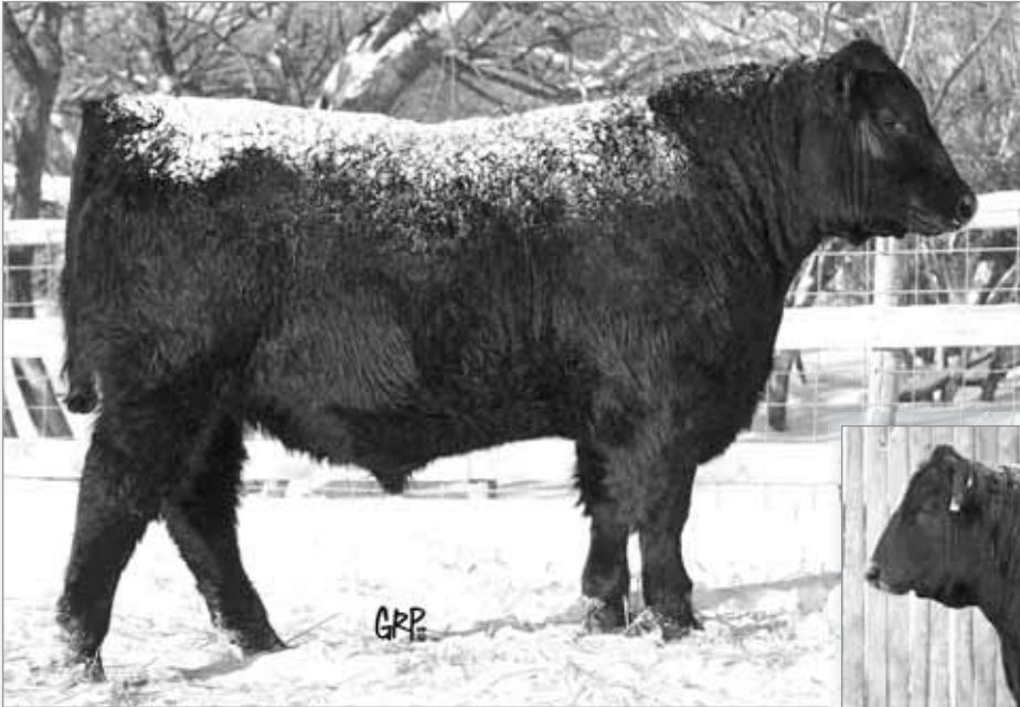
LOT 1 BROOKMORE NETWORK 110X