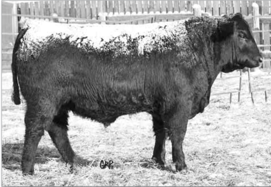
LOT 3 BROOKMORE NET WORTH 33X