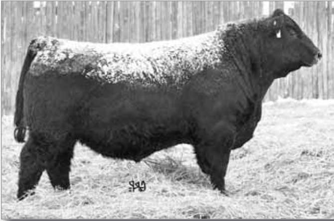
LOT 10 - BROOKMORE NETWORK 74X