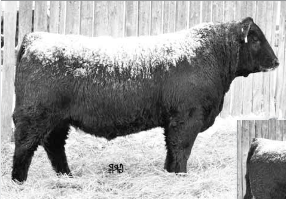
LOT 41 BROOKMORE PIONEER 22X