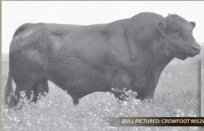
BULL PICTURED: CROWFOOT 9052W