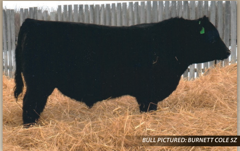
BULL PICTURED: BURNETT COLE 5Z

Cole Creek Cedar 46P sires calves that have a little extra body length while maintaining depth of rib and moderate birthweight. Burnett Cole 5Z – 46p son, was sold to Brian Wiens at our 2013 bull sale. We agreed to use 5z as clean up on our heifer pen and we have been very pleased with the results. Bulls are a solid group, and heifer calves are the top of the pen.