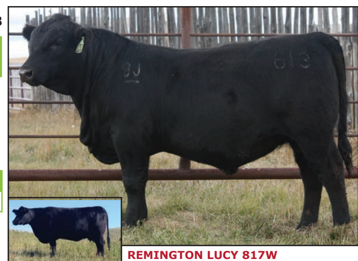
Dam of 13D & Wide World 302

A direct son out of our never miss calving ease donor cow and dam of our heifer bull Wide World 302! This guy is a little back of the rest of calves in weight because he spent a good portion of the summer on his mom at the embryo plant were we were collecting more embryos off his outstanding dam!