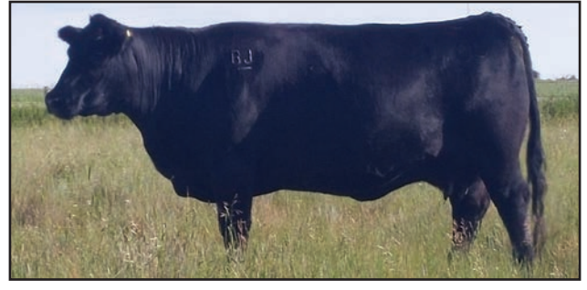
MERIT JILT 7091Dam to 8D,21D,23DAlso Dam to BJ's Bulldozer 418