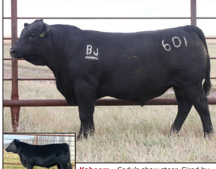
Kaboom - Cody's show steer, Sired by Wide World 302 out of a BWF first calf heifer, low birth, major grow!

This is one muscle bound calf that supports a super low BW. Past buyers that have used Wide World sons love the calving ease in them and many of those sons looked just like this guy at the same age!