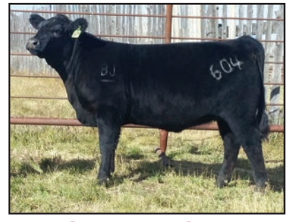
BJ'S 7091 Jilt 604 1 of 4 ET Full Sisters to Lots 28-30, Cody's show heifer!

sheer power is tough to over look! There dam Jilt 7091 has been the most consistent cow we have ever owned! She is also the sire of Bulldozer so you will get to see a big group of progeny all out of this great cow. This cow has raised more high selling herd bulls, more bull sale champion's than any cow we own! Tour of Duty is a bull that people from all breeds fell in love with as he is a bigger, more powerful bull with a foot that the breed needs more of today! The guess work is done I know these guys will do the job! If you need a new herd bull or need 3, you come and be the judge, buy one, 2 or buy them all... they are that close!