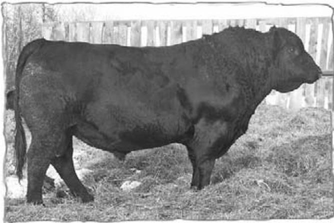
B.B.A.R. Legacy 4234

459 is a tremendous breeding bull, excellent feet and legs, unmatched width, depth and fleshing ability. Mature weight, 2360 lbs on straight forage.