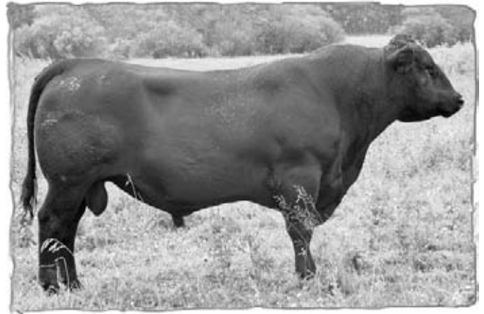
Nesset Lake Freightliner 17U

We flushed our old 76C cow hoping for more heifers and we retained this son feeling he will leave us some exceptional daughters in our herd.