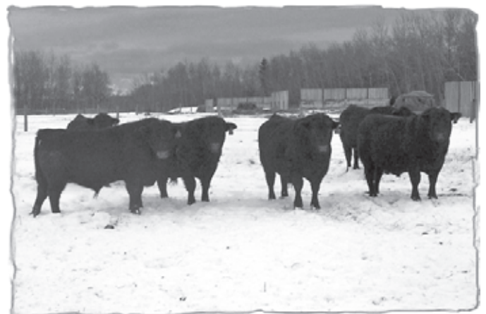
The bull pen