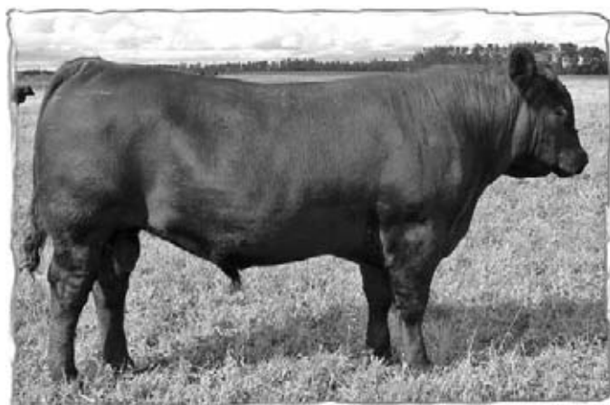
Nesset Lake Windy 20T

Purchased this bull because he was moderate framed, thick topped, massive rib and also for his phenotype. He is working well on our 2164 daughters.