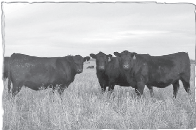
Flush sisters to Lot 4