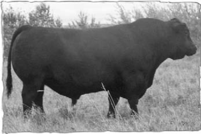
B.B.A.R. Eureka 459