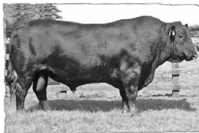
Dunlouise Commander Bond

Offers muscle, style and outcross pedigree.