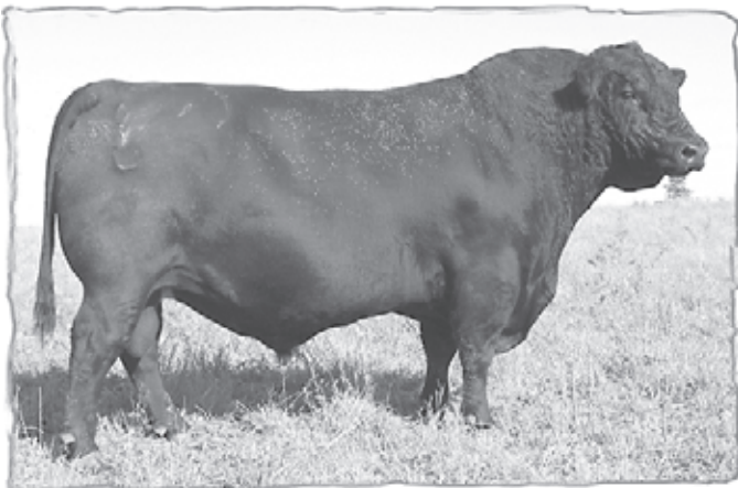
Sitz Alliance 83K