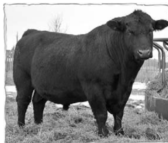
Lodge Total 15U