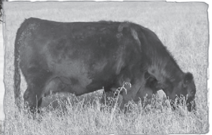
B.B.A.R. Miss Morrison 7133 - Dam of Lot 3