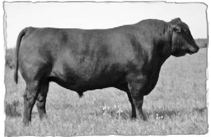
B.B.A.R. Legacy 767

Co-owned with Jeanott Farms, Whitewood, SK