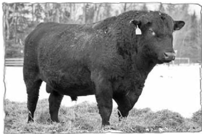
MVF Final Answer 24U

Purchased at the Black Harvest Sale for his extreme wide base and he carried his thickness all the way through. He still had a moderate birth weight of 80 lbs and he had a large ribeye of 15.37.