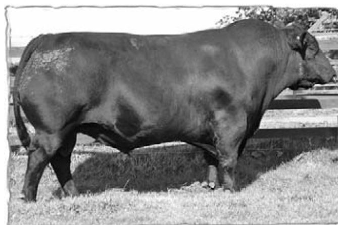
Dunlouise Cortachy Boy D137

A Scottish bull with moderate frame that will add muscle.