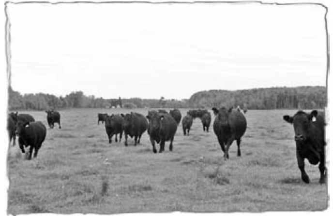
Nesset Lake pairs

14X and 15X are twins both raised by recip cow.