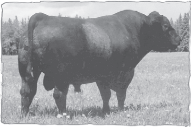
Johnston Nugget 370E