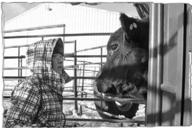
Just a quick trim