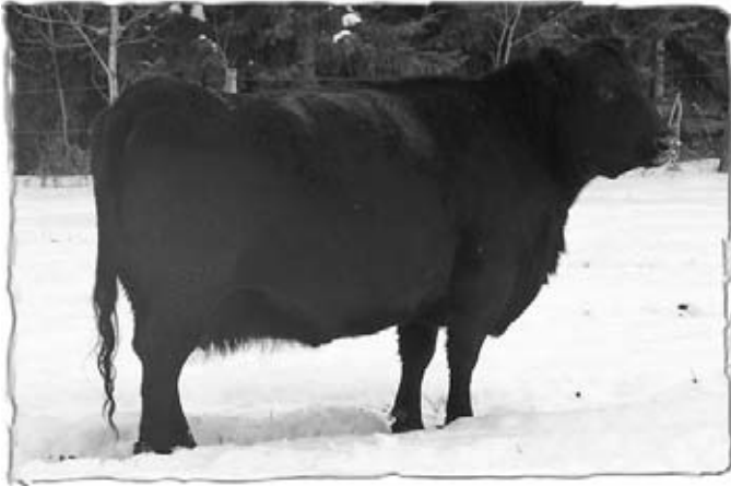
Stevenson Lady 8760 - Dam of Lots 84, 85 & 86