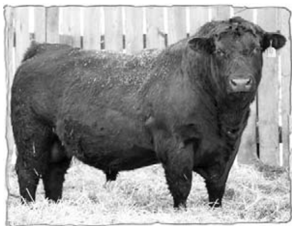
GBT Forte 861