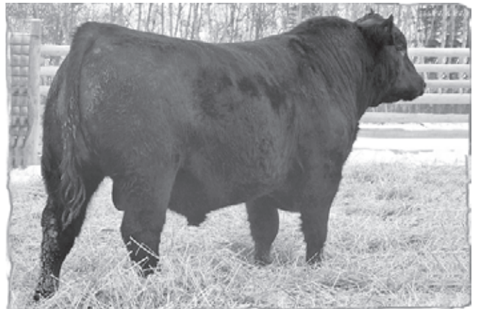
B.B.A.R Legacy 616