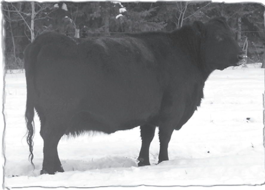
Lot 37 Stevenson Lady 8760