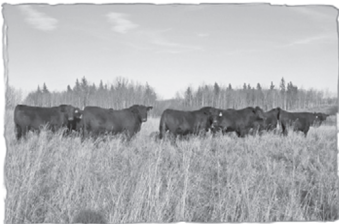
Bowerman bulls on pasture