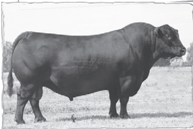
S A V Final Answer 0035

Nesset Lake Angus reserves the right to draw semen for in herd use from any of the bulls at purchasers convenience and sellers expense.