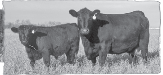
Dam of Lot 1 with 2011 bull calf at side