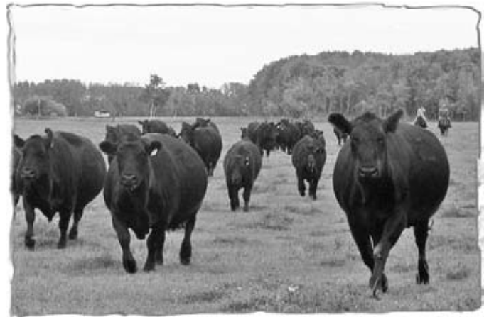
Bringing the pairs home