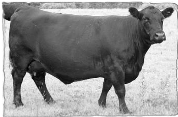
Nesset Lake Erica IDM 111M Dam of Lot 38 & 39, 40, 41 & 59