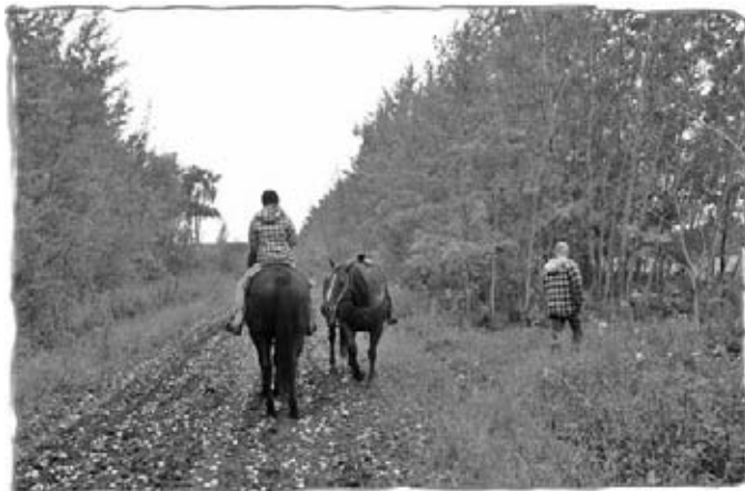
All in a day's work