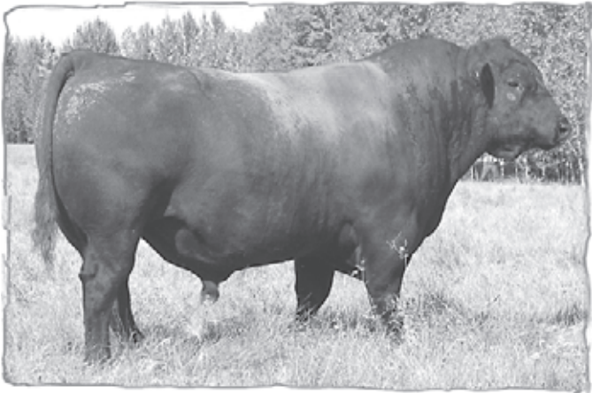
O C C Legacy 839L

Nugget bred natural service for 10 years. He is now deceased.