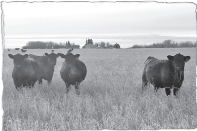
Group of four B.B.A.R Eureka 469 daughters