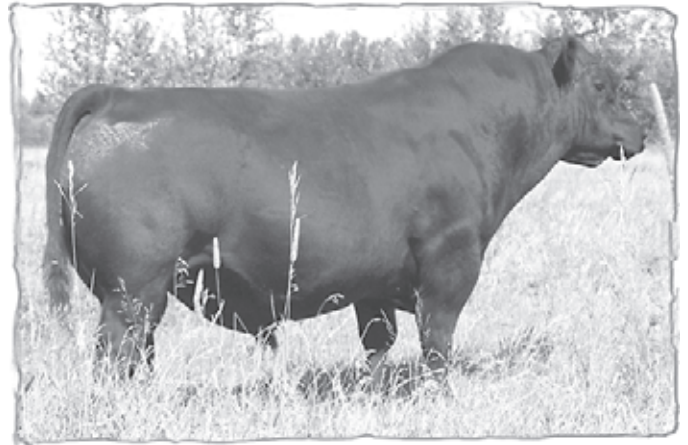
O C C Muscle Man 710M

Calving ease, muscle and fleshing ability. Daughters in production will be some of the most efficient cows there are. 1st calvers are weaning calves close to 70% of their own weight. Now deceased.