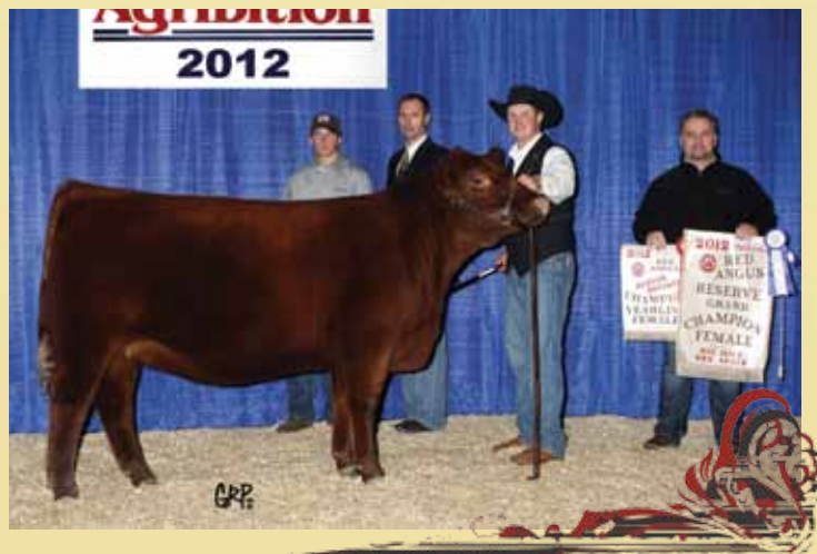
Full sister to Lot 77 - Red Blair's Faith 74Y

Here is a neat opportunity to buy a full sib to the Red Blair's Faith 74Y bred heifer that was Reserve Champion Female at Edmonton Farm Fair and Canadian Western Agribition. The 8L dam is one of those powerfully made, big boned hairy donors that changes a breeding program.