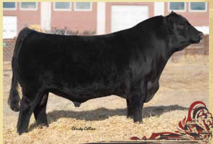
Sire of Lot 44 - CJ Prestige 25T