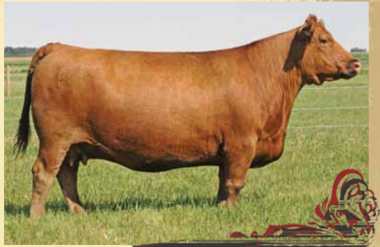
Dam of Lots 18 & 19 - Red Towaw Monique 2K

RED COLE MISTER "E" 9J RED PIE BOTEET 899 OSF RED NORTHLINE KING 305J RED KWS ROCKY PRINCESS 59J LMB JOHNY REB 091 RED BJR TIDY BEE 677-6186 RED RIBLONG SAWYER 22E RED L4 MONIQUE 522D