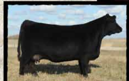
FATAL ATTRACTION - DAM