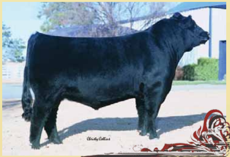
Sire of Lot 9 - EXAR Pit Boss 409

MICH Total Solution 1202z is a powerful, stout, son of the deceased EXAR Pit Boss 409. He is a big bodied, big hipped extremely hairy bull who excels in a combination of performance and phenotype. He is an embryo calf who has excelled since birth. His dam RR Envious Blackbird 4487 never misses and has progeny working at Harvest Angus, Triple L Angus, and Anderson Cattle Co. She has been in our embryo program and four daughters have been retained for our program. MICH Total Solution is the total package of performance, phenotype all tied together with a tremendous disposition that is second to none.