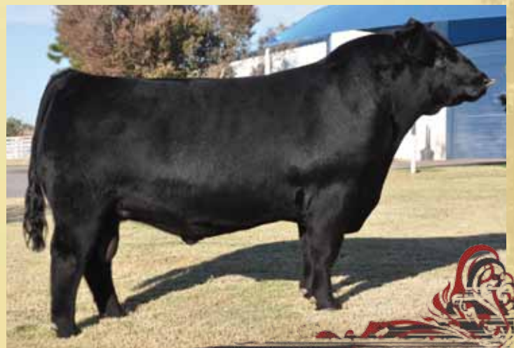
Sire of Lots 10, 11, 12, 13 & 14 - RC Wiley Post 9304B EXAR

1271Z has had many admirers from anyone who has seen him. He is as deep sided and stout as you would want, with a tremendous hip, loaded with bone and power. His dam is a beautiful 616 daughter out of the famous WK Winnie 7305 cow family. A maternal brother was a high seller in last year's sale selling to Brendale Acres and Johnson Livestock. MICH SC Wiley Post is truly a combination of power and performance while still maintaining a beautiful phenotype and presence about him. A true sale feature.