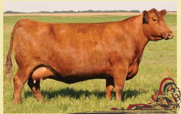
Dam of Lot 69 - Red Cockburn Ms Fanny 191M