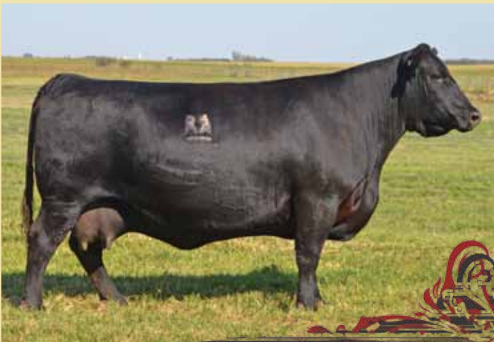
Dam of Lot 8 - Baby Black Pre Lucy 506S

318Z is the Old Post calf off the great 506S donor that sold in our 2012 Genetics in Motion female sale. If you want to add depth, maternal and milk to your program then get this calf bought.