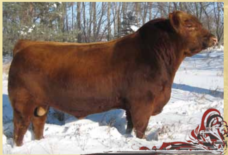
Sire of Lots 46, 48, 69, 70, 71, & 72 - Red Blair's Daytona 116U

330Y comes from the great Bella line and this mating with Uptown Girl and Daytona is a winner. The first calf off Uptown 19U was sold in our Genetics in Motion '11 sale to Shaneri Farms.