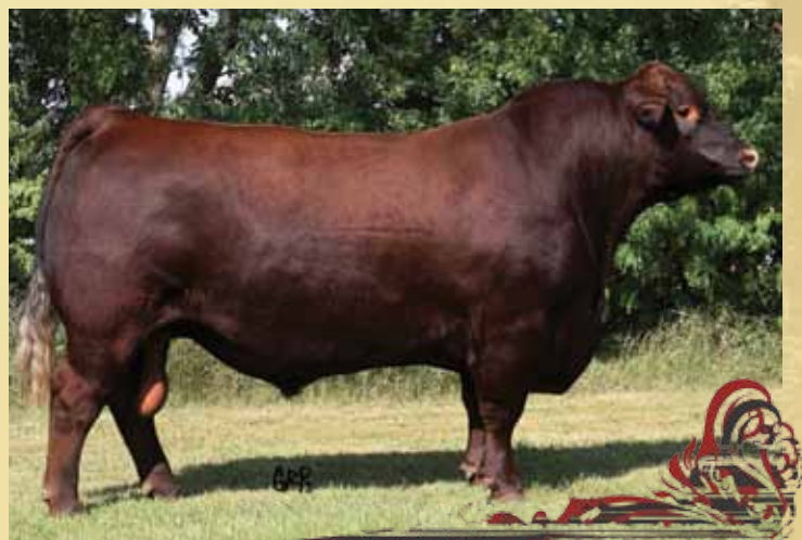
Sire of Lot 77 & 78 - Red Ter-Ron Reload 703T