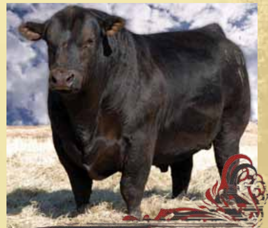
Sire of Lots 1, 2, 3, 6, 49, 50 - Duff New Generation 6107

Here is a very unique opportunity to buy from the gene pool that includes the great Tibbie 60M donor from MVF and Duff New Generation 6107. These three bulls are powerful and represent an outcross. If you need sires to take your program to a new level then sweep the ring here. Tibbie 60M progeny have sold to Westwood Land & Cattle, Dugdale Ag Co., Freyburn Farms, Torey Haggarty, Garth Soder, and Sundsbank Farms.