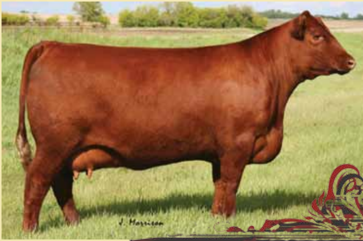
Dam of Lot 76 - Red Soo Line Annie 7249