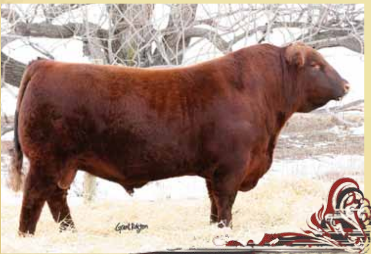
Maternal brother to Lot 73 - Red Ter-Ron Fully Loaded 540R

We were fortunate to use Cowboy Cut in our embryo program and the next two bulls show how powerful the Cowboy Cut genetics are. 31Y is long spined, big hipped and is also off the dam to Royal Bank Supreme Champion sire Red Ter-Ron Fully Loaded. You need to have a serious look here. The 240L dam might be one of the best Red Angus females I have seen. She is soft made, stout, moderate and hairy. Imagine what the offspring off this mating will look like.