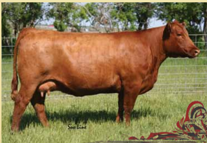
Dam of Lots 33 & 34 - Red Soo Line Countress 6409

These full sibs represent a unique mating that is no longer available in Canada. Hamley semen in Canada is off the market and 409S now resides at Wildcat Creek in Kansas. If you are looking for extremely cool phenotype and incredible muscle shape then mark these bulls. These full sibs are calving ease deluxe and will raise calves with that make you proud every single day.