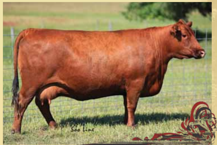
Dam of Lot 67 - Red JCC Sparkles 60S