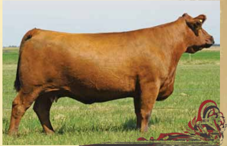
Dam of Lot 71 - Red T-K Princess 1R

The 94Y pedigree is chalked full of performance. The powerful big ribbed 1R dam is deceased now so this power pedigree can never be replicated. Check out the WW, YW, TM, REA and Carcass. If you are about raising lbs of beef then Daytona 94Y is for you.