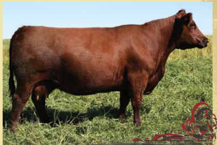
Dam of Lot 30 - Red JCC Elora 71P

95Y is another cherry red genetic package both top and bottom and is out of the Elora 71P cow we sold in our 2011 Genetics in Motion sale to Brad Chapell. I think sale day 95Y will catch your eye.