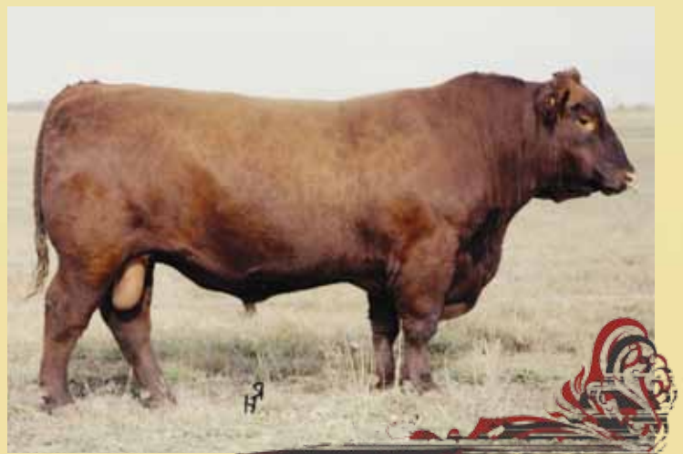
Full brother to the dam of Lot 74 - Red Ter-Ron Mambo 28K

71Y is another extremely powerful son of Cowboy Cut and off the full sister to Red Ter-Ron Mambo. Mambo has had a huge impact on our program and Mambo sons have made a lasting impact on the breed. Dusty 98J is a cornerstone donor at Ter-Ron Farms and we were fortunate to have access to her for our embryo program.