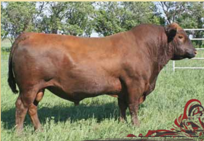
Sire of Lots 17, 18, 19, 20, 31 & 32 - Red Corner Creek Cash 2R

902Y is a off the great Bar E-L donor Marcie 50N that is now owned by Wildcat Creek Ranch in Kansas. Marcie 50N is the dam to the great Red Bar E-L Ribeye 103R that has 386 registered progeny. We were fortunate to buy these embryo's and know that 902Y will do great things. This mating may never be created again and has a great set of #'s to go with his cool phenotype.