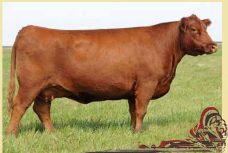
Dam of Lot 17 - Red Pipestone Golden 72K