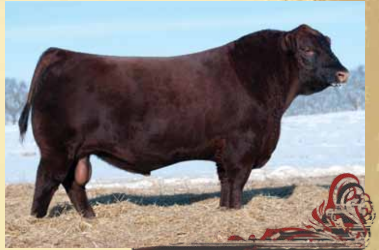
Sire of Lots 75 & 76 - Red Cockburn Ribeye 308U

202Y is the result of an in dam purchase from the SooLine Cattle Red Angus dispersal. This calving ease bull will work great for either heifers or cows. The Cockburn Ribeye sire now resides in Kansas at Wildcat Creek Ranch and I had the good fortune to see him this fall and he looks awesome. A serious heifer bull candidate here.