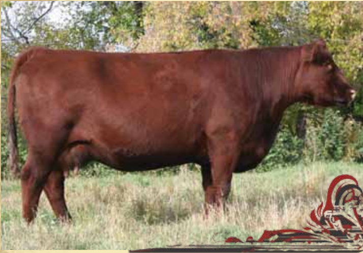
Dam of Lot 27 - Red Riverdale Dynamint 340L