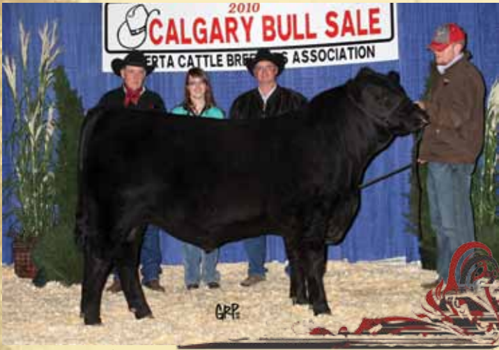
Sire of Lot 60, 61 & 62 - Belvin Wavelength 1'09