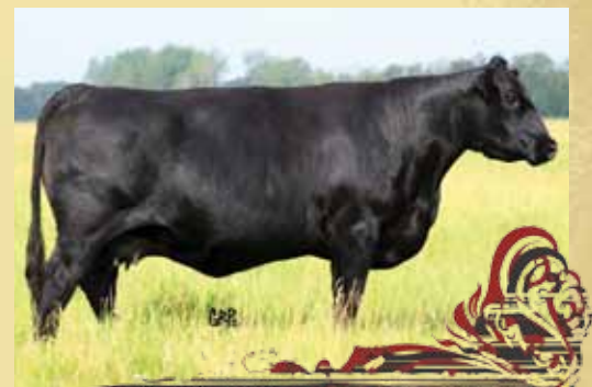
Dam of Lots 1, 2 & 3 - MVF Tibbie 60M