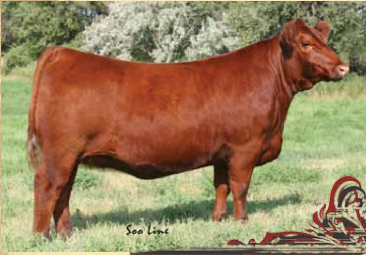
Maternal sister to Lot 35 - Red Soo Line Annie