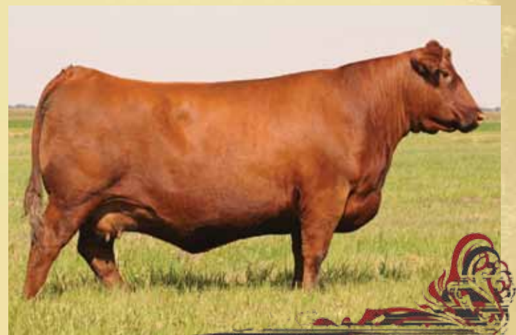
Dam of Lot 20 - Red Ter-Ron Jasmin 48R