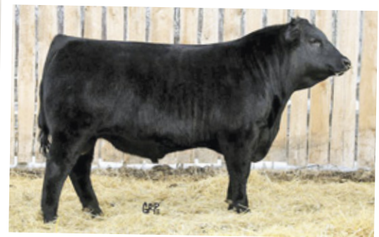
BELVIN ULTIMATUM 13'08

BW: +3.3 WW: +45 YW: +95 Milk: +21 TM: +44 YG: +50