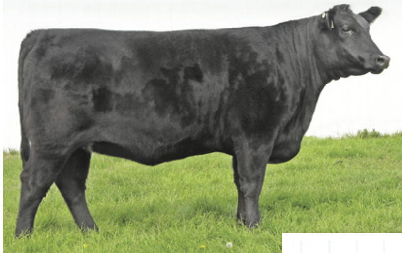
LOT 50 :: CHICO ERICA KAY 2W