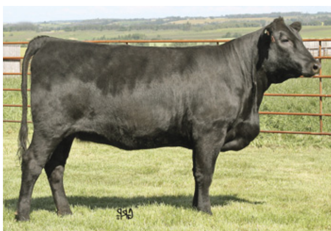
LOT 41 :: ERICA OF RANNOCH 79'09

Bred April 30 to Belvin Rebel 33'05, preg checked safe.