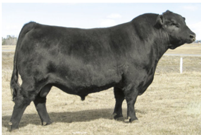
S A V PRODIGY 8101

BW: 85 lbs. Adj. 205D: 779 lbs. Adj. 365D: 1323 lbs. EPDs: BW: +3.0 34% WW: +48 24% YW: +107 23% Milk: +18 9% TM: +42 YG: +58 23%