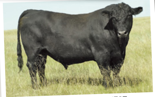
PAHL DARE 2 DREAM 172T