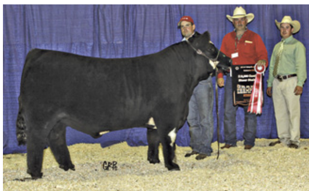
FAIRLAND CATTLE CO.

Reserve Grand Champion 2010 Calgary Stampede Steer Classic Champion Open Division at Calgary Stampede Reserve Grand Champion at Drayton Valley Reserve Grand Champion at Lloydminster Colonial Days Reserve Grand Champion at Carstairs & District 4-H Show