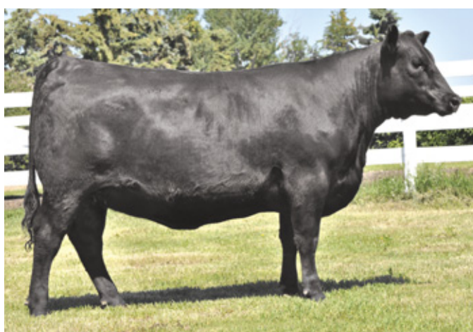
LOT 18 :: REMITALL F PRIDE 108W

Bred April 18 to Remitall H Rachis 21R, preg checked safe.