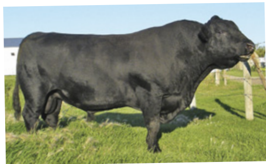
REMITALL STOCKADE 579S

BW: +4.2 WW: +38 YW: +77 Milk: +21 TM: +40 YG: +39