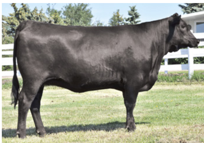
LOT 12 :: REMITALL F MISS PRIDE 9W

Bred April 26 to SAV Prodigy 8101, preg checked safe.