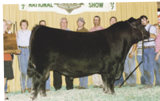
S A V MASTERPIECE 5289

BW: +4.3 WW: +63 YW: +107 Milk: +21 TM: +53 YG: +44