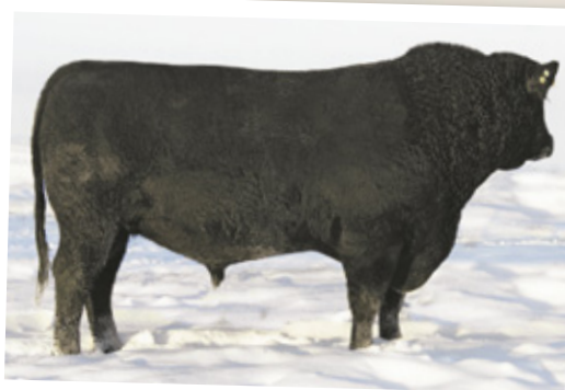
CHICO SOURCE 2100 51S

BW: +4.8 WW: +28 YW: +55 Milk: +17 TM: +31 YG: +27