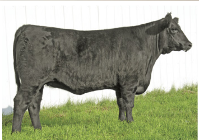
LOT 56 :: CHICO BELLEMERE 24W

Bred A.I. May 29 to Connealy Right Answer 746. Exposed June 13 to July 20 to Justamere 158R Eddy 321U. Ultrasounded Aug. 3 to the A.I. service.