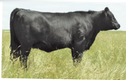
LOT 4 :: PAHL ROSEBUD 114W

All Pahl bred heifers were bred A.I. to HF Tiger 5T and then exposed to SSA 4R New Elixir 18W