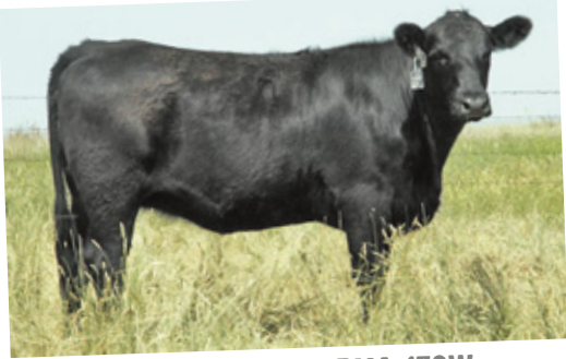
LOT 7 :: PAHL NORMA 176W

Arrive early & support STARS at our Toonie Bar - then stay over & enjoy the inaugural Olds Fall Classic