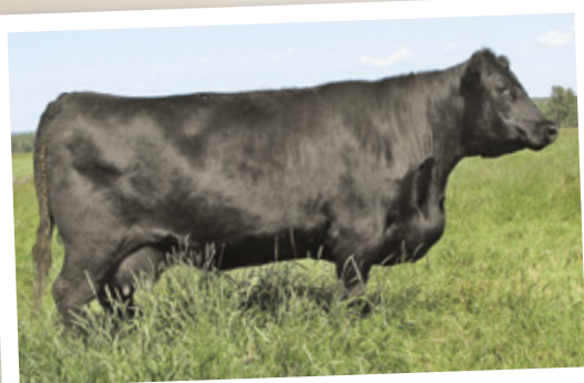
BELVIN GEORGINA 81'03

Dam of Belvin Rebel 33'05 - Pictured at 7 years of age