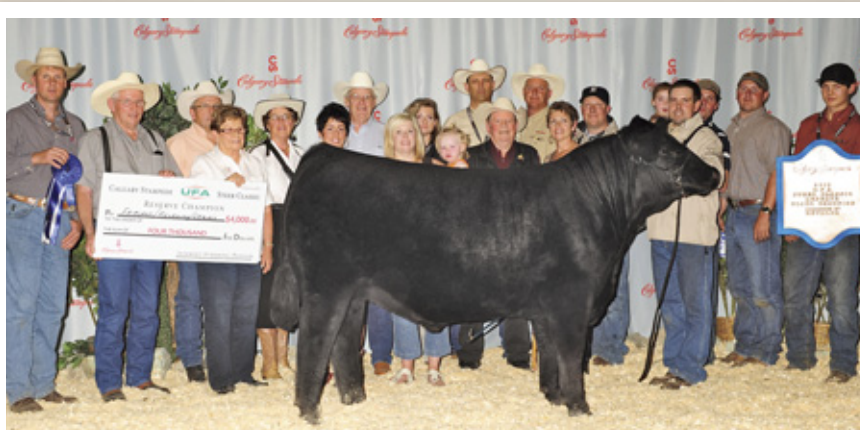
FAIRLAND CATTLE CO.

New for Black Magic 2010 is an offering of 12 elite show steers prospects from Fairland Cattle Co. with guest consignor Miller Ranching Ltd. These steers will be offered at various weights and sizes to accommodate all end target dates for 4-H and open show possibilities.