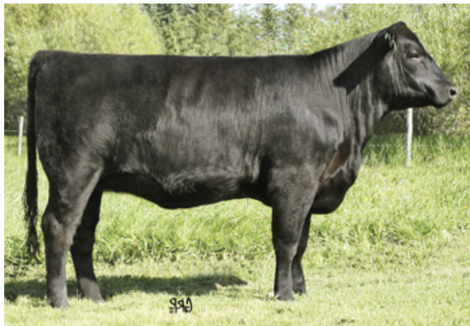
LOT 34 :: BELVIN DUCHESS 21'09