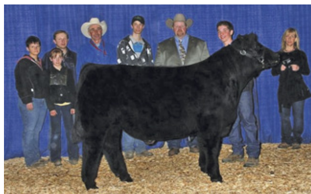
MILLER RANCHING LTD.

Grand Champion Prince Albert Exhibition Grand Champion Lloydminster Colonial Days Grand Champion Vermilion Fair Reserve at Acme Centennial Fair Reserve Champion Simmental Division Calgary Stampede