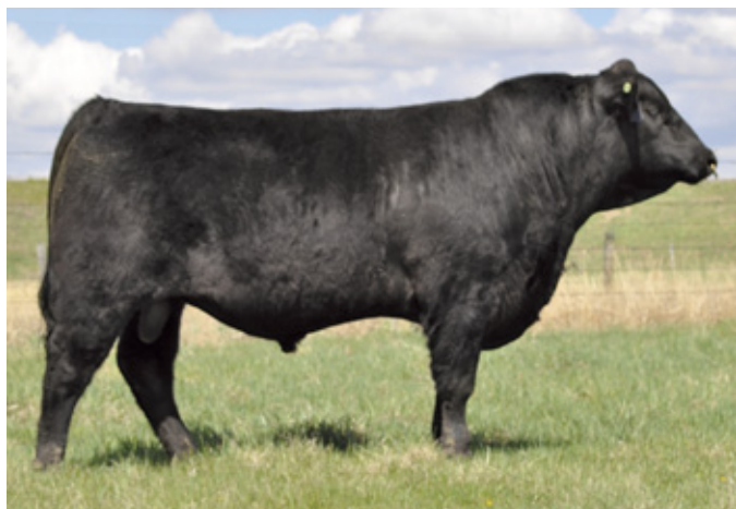
REMITALL WOLFMAN 4W :: LOT 19 SERVICE SIRE