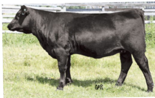
LOT 46 :: BELVIN RUBY 2'10

US EPDs: BW: +1.3 WW: +62 YW: +105 Milk: +28