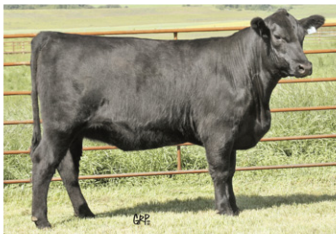
LOT 43 :: BELVIN GEORGINA 106'09

Bred April 24 to Belvin Navigator 31'03, preg checked safe.