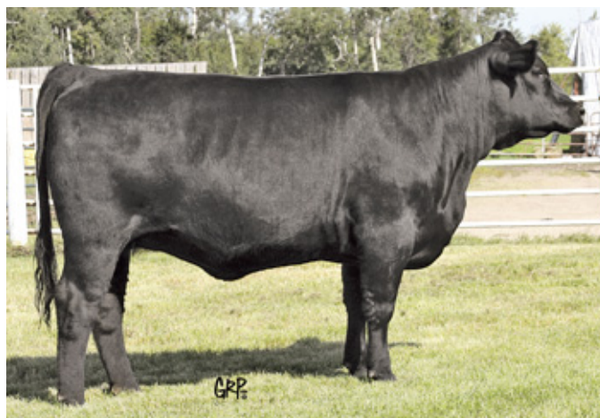
LOT 44 :: BELVIN BARONESS 108'09

Bred April 26 to Belvin Navigator 31'03, preg checked safe.