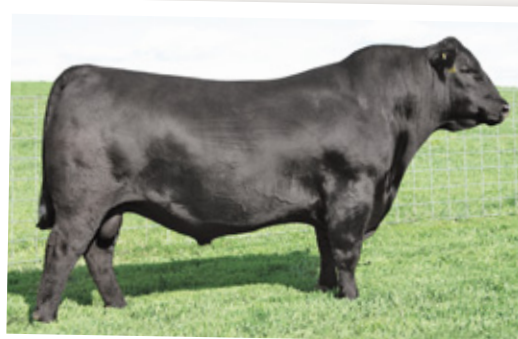
S A V BISMARCK 5682