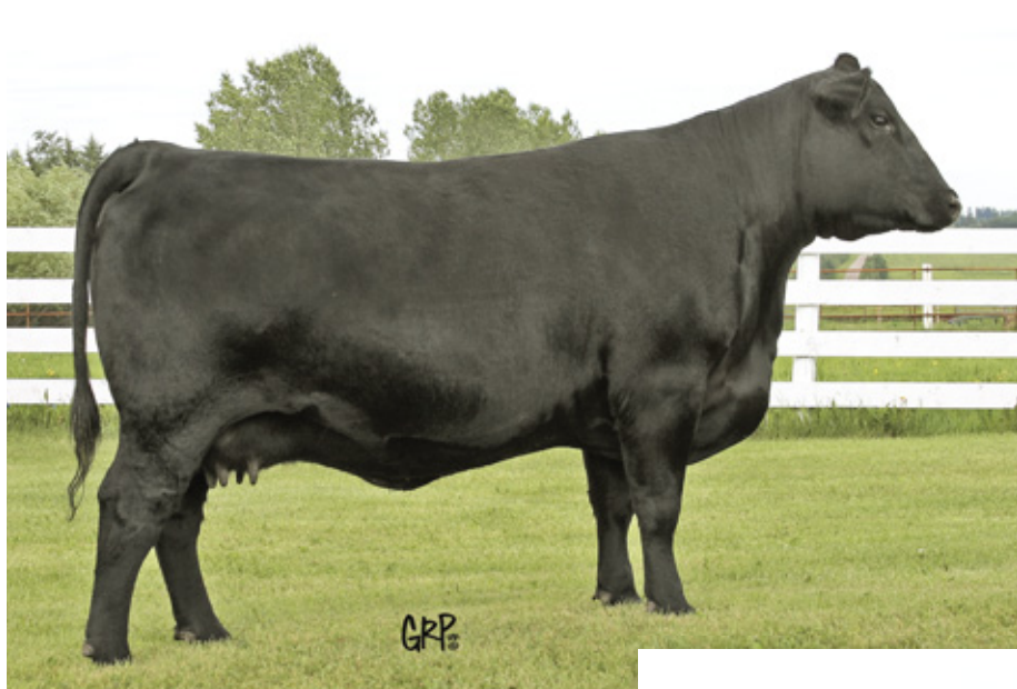
LOT 33 :: BELVIN GEORGINA 18'08