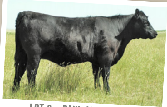
LOT 9 :: PAHL QUEEN 208W

Arrive early & support STARS at our Toonie Bar - then stay over & enjoy the inaugural Olds Fall Classic