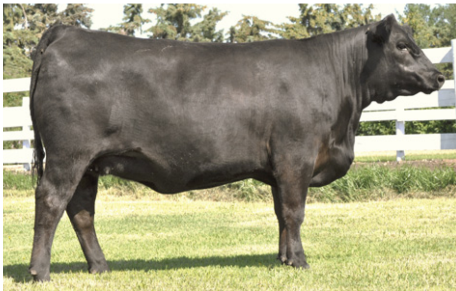
LOT 11 :: REMITALL F TIP TOP 16W