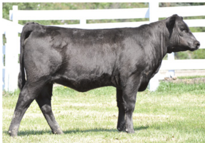
LOT 22 :: REMITALL F BEAUTY 4X

A very complete female out of a beautiful uddered first calf heifer. Her dam is very sound, easy doing female sired by the carcass bull, Western Frontier 419. 4X's sire, SAV Final Answer 0035 is producing some of the top females in the breed today. With her style and eye appeal 4X has all the makings to be a top show prospect and future brood cow.