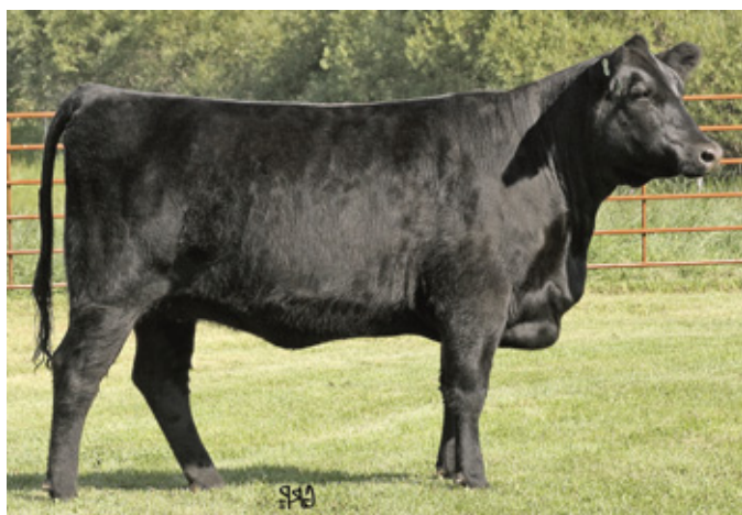
LOT 35 :: BELVIN GEORGINA 27'09

Bred May 12 to Belvin Wreckage 70'09, preg checked safe.