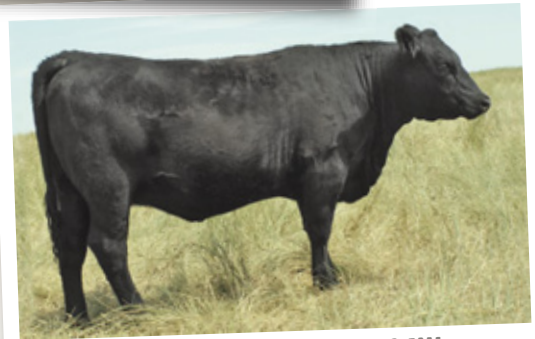
LOT 6 :: PAHL QUEEN 164W

All Pahl bred heifers were bred A.I. to HF Tiger 5T and then exposed to SSA 4R New Elixir 18W