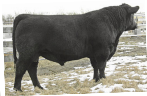
MVF NET WORTH 113T

US EPDs: BW: -.6 WW: +62 YW: +131 Milk: +21