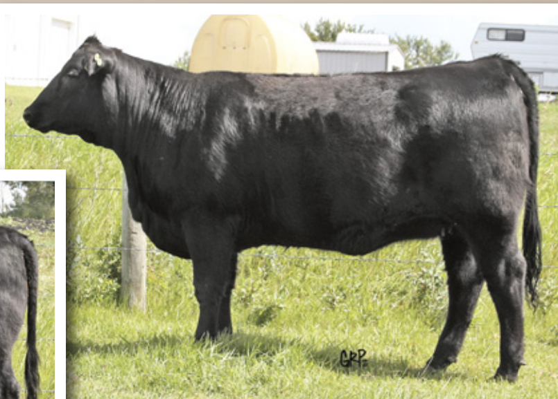
LOT 32 :: LORENZ FAIRLASS 41W