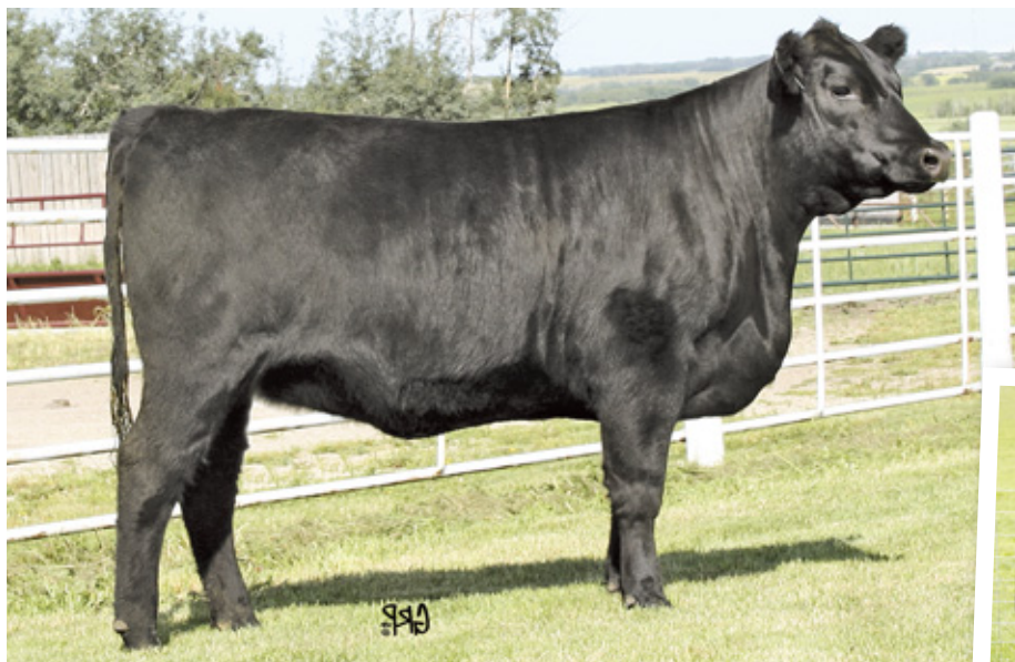
LOT 45 :: BELVIN GEORGINA 126'09