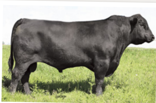
BELVIN REBEL 33'05

BW: -0.2 WW: +34 YW: +88 Milk: +19 TM: +36 YG: +54