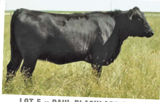
LOT 5 :: PAHL BLACKLASS 133W