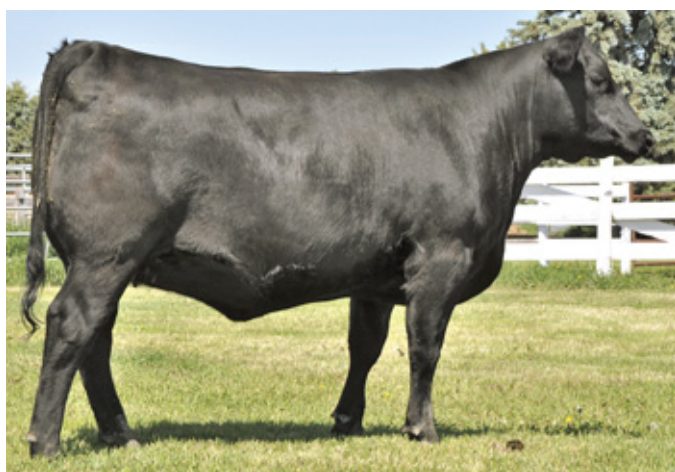
LOT 20 :: REMITALL F RUBY 111W

Bred April 17 to Remitall F Wolfman 4W, preg checked safe.