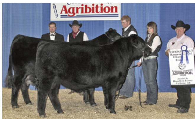
COUL WARLORD 12'09 :: LOT 36 SERVICE SIRE

BW: -0.1 WW: +55 YW: +101 Milk: +23 TM: +51 YG: +46