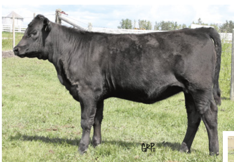
LOT 25 :: LORENZ FAIRLASS 10X