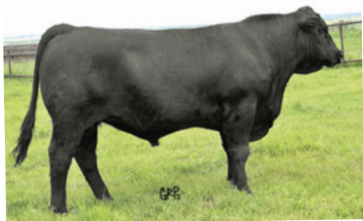
BELVIN REBEL 118'09

BW: -0.2 WW: +34 YW: +88 Milk: +19 TM: +36 YG: +54