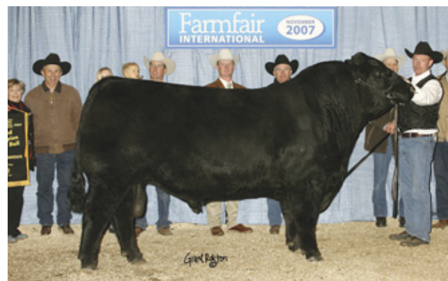
REMITALL H RACHIS 21R

Bred May 3 to SAV Final Answer 0035, preg checked safe.