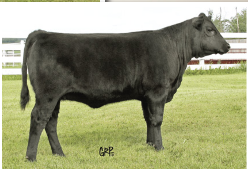
LOT 33A :: BELVIN GEORGINA 18'10