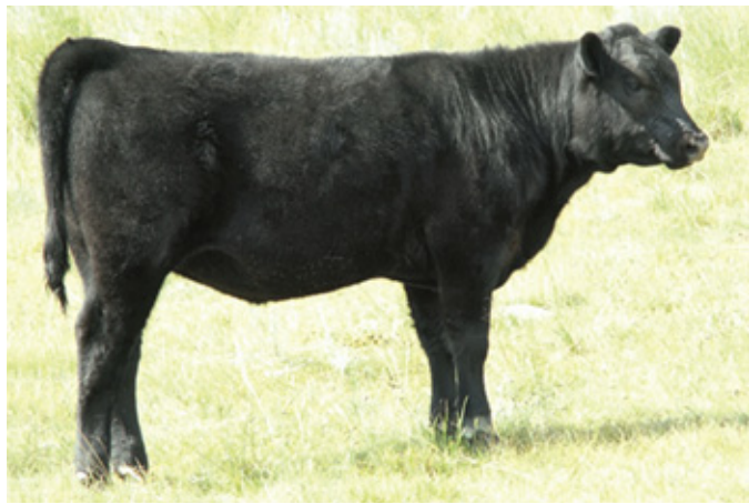
LOT 1 :: PAHL BLACKCLASS 114X