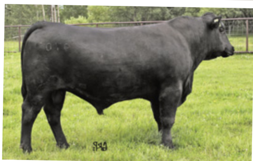
BELVIN WRECKAGE 70'09

The Belvin bred heifers were preg checked on Aug. 4/10