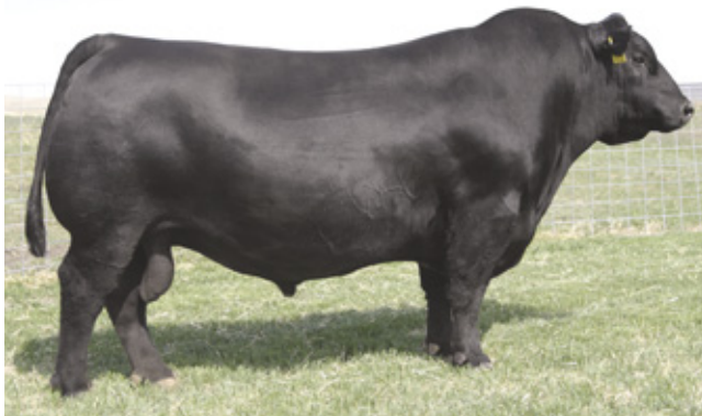
S A V NET WORTH 4200

I can't say enough about the Premium cattle. Both Crossfire and Greenstone both have an awesome set of daughters, tight little udders and all milk their hearts out.