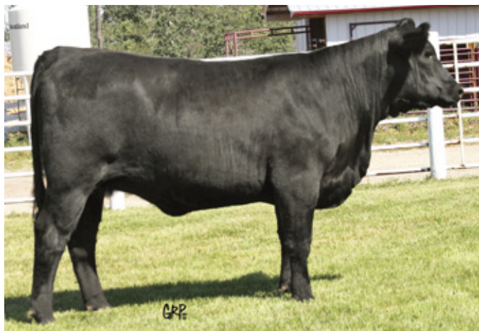
LOT 39 :: BELVIN TIPTOP 060'09