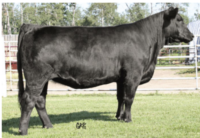
LOT 40 :: BELVIN BLACKLASS 74'09

Bred May 23 to Belvin Rebel 118'09, preg checked safe.