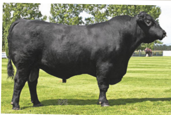
GH CANADIAN RASCAL 54R

BW: +3.0 WW: +40 YW: +83 Milk: +33 TM: +53 YG: +43