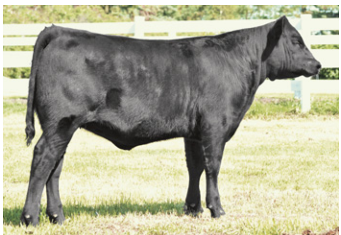
LOT 10A :: REMITALL F TIBBIE 14X

A beautiful patterned SAV Final Answer 0035 heifer calf with a genetic package that will deliver loads of future. One of the most exciting young females we can offer. Choosing between these two females will be no easy decision. This pair will be a part of the Remitall Farms fall show team.