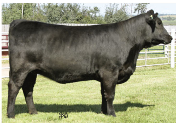
LOT 36 :: BELVIN LADY BLOSSOM 29'09

Bred May 11 to Belvin Wreckage 70'09, preg checked safe.