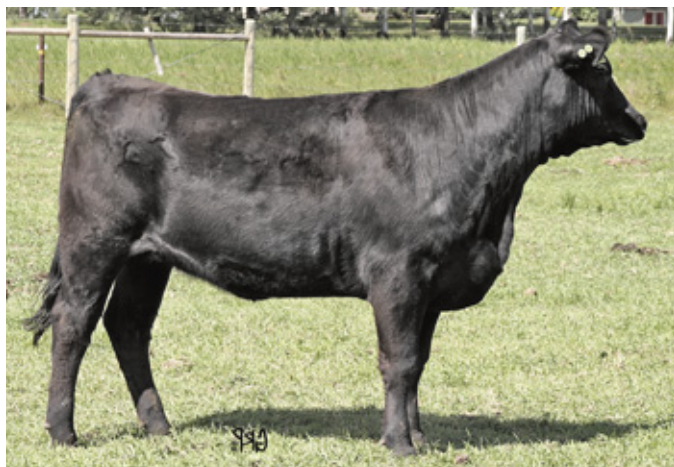
LOT 28 :: LORENZ CAROLINE 4W