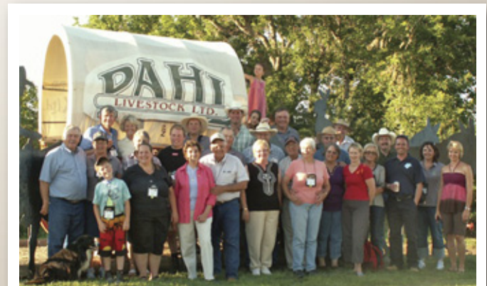
WORLD ANGUS FORUM TOUR AT PAHL LIVESTOCK

W C C ZAF HOOSIER HEARTLAND NHC AMF GEIS ERICA 283'97 SUMMITCREST HI FLYER 3B18 NHF AMF KLUZAK TIBBIE 25E