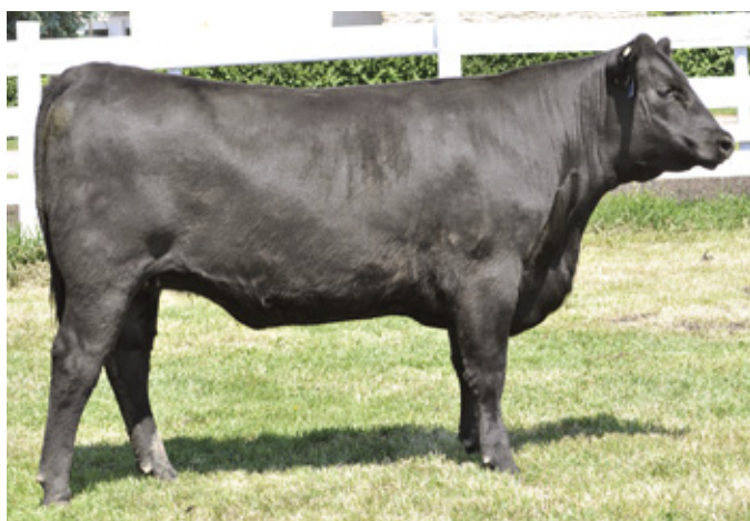
LOT 15 :: REMITALL F QUEEN 19W

Bred April 28 to SAV Prodigy 8101, preg checked safe.