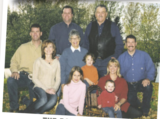
THE PAHL FAMILIES