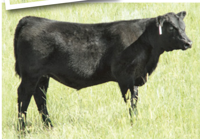
DONATION HEIFER - PAHL MISS MAGIC 144X

$25,000+ raised from BLACK Magic heifers to date!