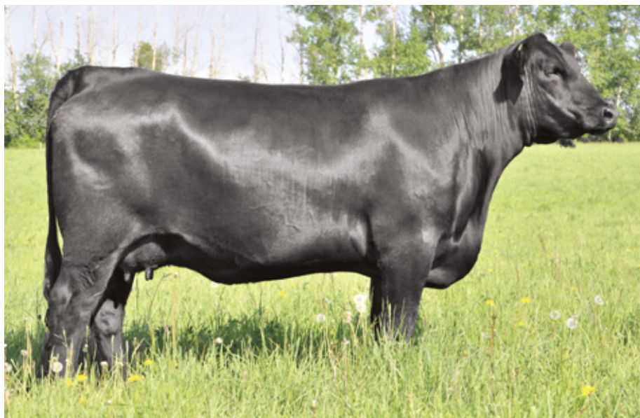
LOT 10 :: REMITALL TIBBIE 516U