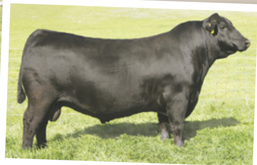
S A V PIONEER 7301

Belvin Ruby 2'10 is sired by Belvin Navigator 31'03, a herdsire owned with Raven Ridge Angus in Manitoba, who combines calving ease and performance. The dam of Ruby 2'10 goes back to a female purchased from Kenbert Acres. She is sired by Belvin Spitfire 109'06, who was the Calgary Bull Sale Champion and high seller in 2007, where he was purchased by Kenbert Acres for $11,500. Ruby 2'10 is a powerful, long bodied heifer calf.