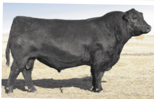
GDAR GAME DAY 449