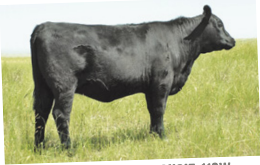
LOT 3 :: PAHL MISS SUSIE 110W