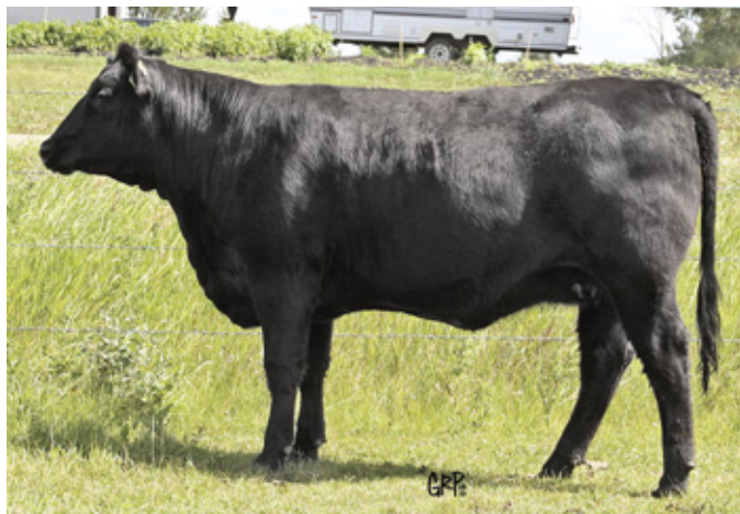
LOT 31 :: LORENZ CAROLINE 39W

BLACK MAGIC SCHEDULE 5 pm - Cattle viewing, hors d'oeuvres & STARS 'Toonie Bar' 7 pm - Sale starts with Junior Donation Heifer followed by the Black Magic Sale Lots, Special Art Print & Steers