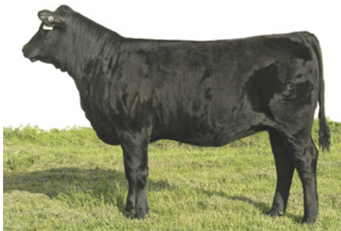
LOT 59 :: CHICO ERICA KAY 41X

A very strong topped heifer that will develop into a great brood cow. Her show career could be a long one if you wish with the Erica Kay cow family to back her up. Take a look at Lots 50 and 58 if you want a sneak peak into her future.