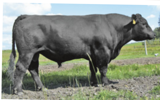
GEIS KODIAK 73'07

BW: +4.2 WW: +38 YW: +77 Milk: +21 TM: +40 YG: +39