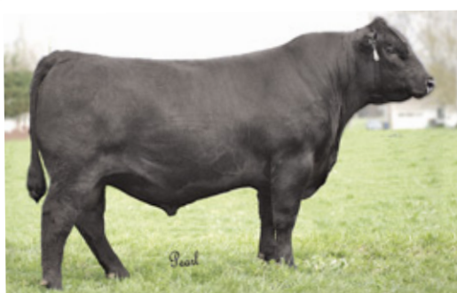
CONNEALY RIGHT ANSWER 746