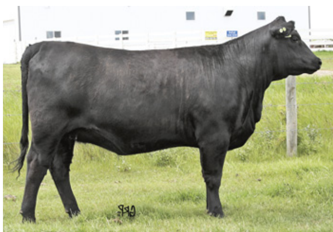
LOT 30 :: LORENZ FAIRLASS 20W

Exposed to Lorenz Paradigm 13U May 11/10-July 03/10.