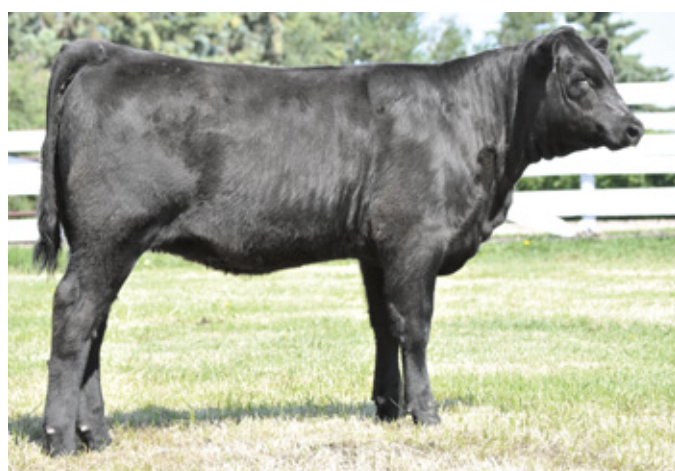
LOT 24 :: REMITALL F MARLENE 50X

The Prodigy 8101 calves here at Remitall are pretty exciting and Marlene 50X is no exception. With loads of eye appeal and so complete in her makeup, she has all the makings of a great show heifer with a bright future. The dam is a super milking cow sired by the many times champion, EXAR Master 253. Remitall has a maternal yearling sister to Marlene 50X retained in our herd that is truly going to make an outstanding cow.