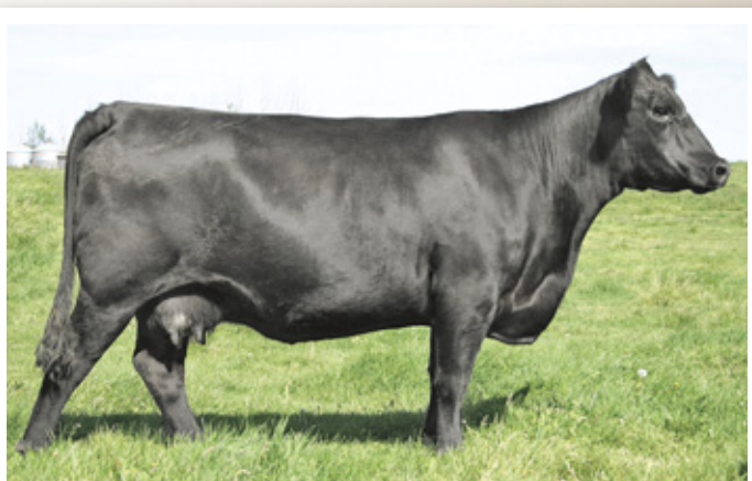
REMITALL TIBBIE ENTENSE 162L :: DAM OF LOT 10

Bred April 28 and May 22 to SAV Prodigy 8101. Preg checked safe to May 22 breeding.