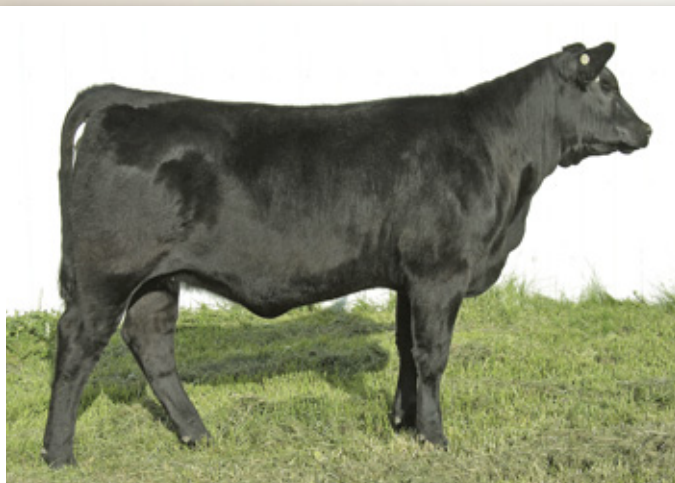
LOT 58 :: CHICO ERICA KAY 13X

These three heifer calves are from the very top of our 2010 calf crop. They were pictured after only their second trip through the chute - one time to trim them up some and the next day to clean 'em up and snap these shots. They and their mothers were brought home from our rough hill pasture on July 26 and still hadn't had any grain on picture day. We are very pleased with the job their mothers are doing, their easy-doing genetics and the exceptional quality of each of these young females. Think what they will look like fitted for the show ring!