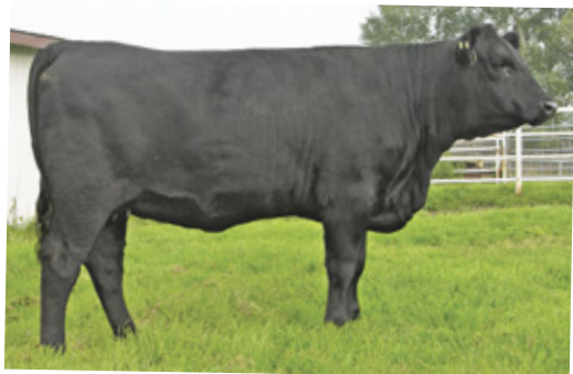
LOT 54 - CHICO LUCY 22W