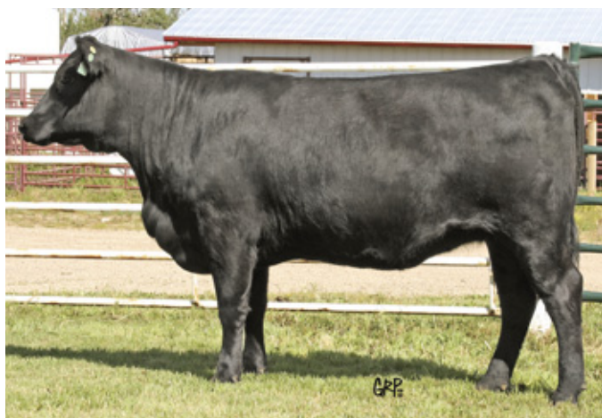
LOT 37 :: BELVIN GEORGINA 45'09

Bred May 21 to Belvin Rebel 118'09, preg checked safe.