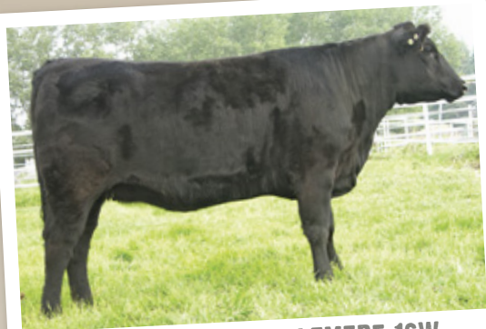
LOT 52 - CHICO BELLEMERE 16W