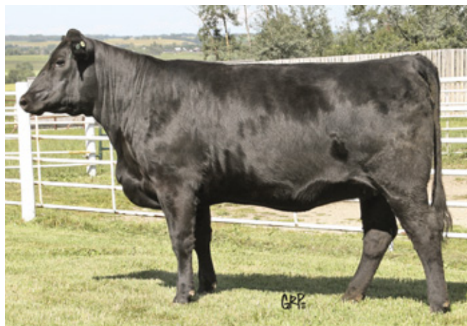
LOT 42 :: BELVIN LADY BLOSSOM 105'09

Bred June 7 to Belvin Wreckage 70'09, preg checked safe.