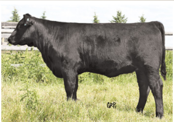
LOT 49 :: BELVIN LADY BLOSSOM 33'10

The sire of Belvin Lady Blossom 33'10, Belvin Utah 11'08, is a calving ease bull with a -0.2 BW EPD, who was retained for use on heifers before being sold to East & West Ranching at Medicine Hat. He is sired by Rebel, and out of a Belvin Nighthawk daughter. The dam of this heifer calf, Lady Blossom 70'08 is a maternal sister to Belvin Rio Grande 53'05, the 2006 Calgary Bull Sale Champion. A maternal sister to 70'08 sold through the Black Magic in 2005 and went on to be a donor cow at Remitall.