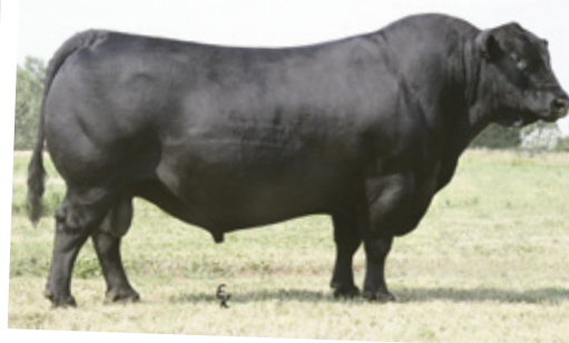
S A V FINAL ANSWER

Bred May 15 to SAV Prodigy 8101, preg checked safe.