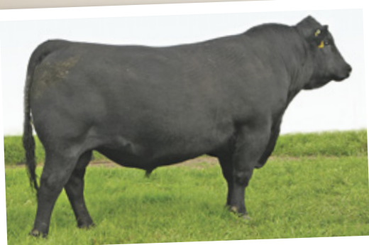
JUSTAMERE 158R EDDY 321U

MALE IMP 746T 1547517 NHF AMF JANUARY 13 2007