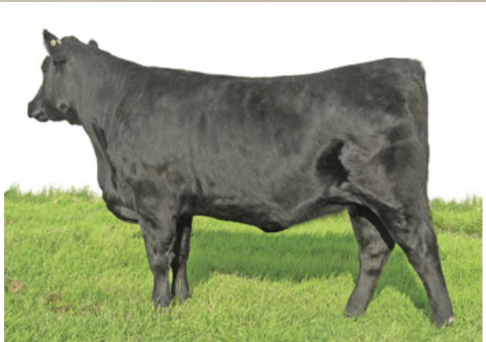
LOT 55 :: CHICO BELLEMERE 23W

Bred A.I. May 22 to Connealy Right Answer 746. Exposed June 8 to July 20 to Justamere 158R Eddy 321U. Ultrasounded Aug. 3 to the A.I. service.