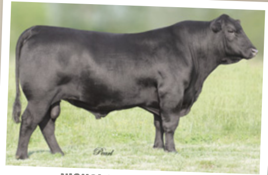
NICHOLS QUIET LAD T9

US EPDs: BW: -.6 WW: +62 YW: +131 Milk: +21