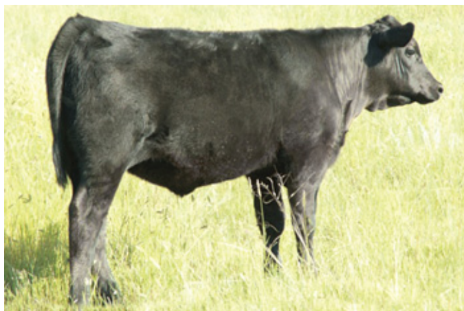
LOT 2 :: PAHL HEATHER MAX 175X