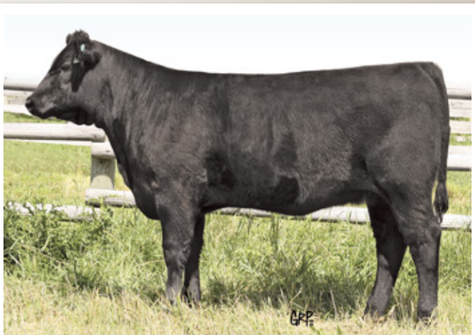
LOT 48 :: BELVIN MARYLEE 13'10

Belvin Marylee 13'10 is from a very productive cow family. Her grandam and great grandam were longtime producers. She is sired by Rebel, who has established himself as a leading calving ease sire, ranking in the top 8% of the breed for BW, while still exhibiting strong growth, ranking in the top 20% for YW and top 2% for YG.