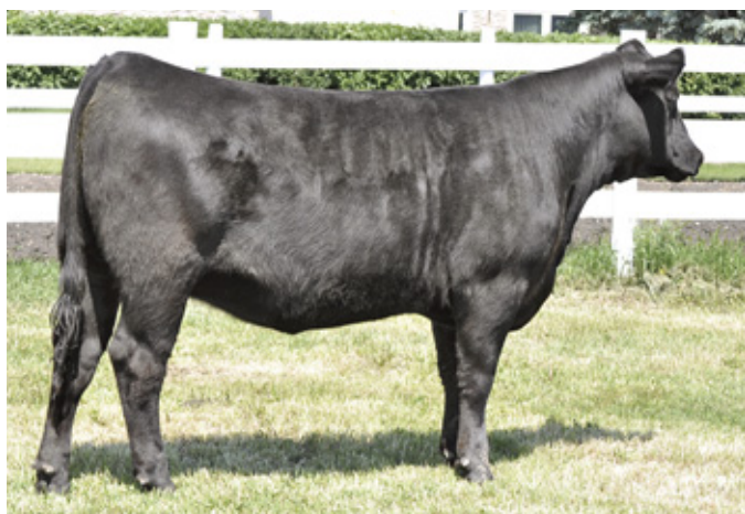
LOT 14 :: REMITALL F KEEPSAKE 18W

Bred May 5 to SAV Final Answer 0035, preg checked safe.