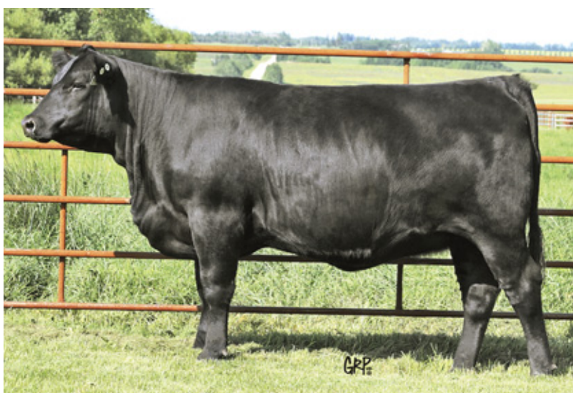
LOT 38 :: BELVIN DUCHESS 49'09

Dam of Belvin Rebel 33'05 - Pictured at 7 years of age