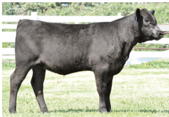
LOT 23 :: REMITALL F LENLOCK 37X

Juniors take a look!!! What a sensational show heifer prospect! Very fancy, smooth shouldered with lots of hip and natural muscle. Her sire, LLB Free Wheeler 268S, was a 2008 Agribition Reserve Champion Bull and Mature Champion Bull at the World Angus Forum. Combining Free Wheeler 268S with the SAV Density daughters has yielded great results here at Remitall.