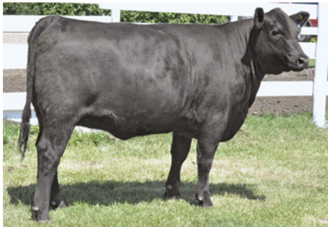
LOT 13 :: REMITALL F EVERA 10W