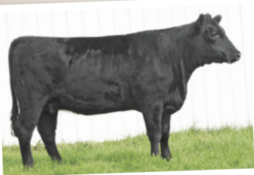
LOT 53 - CHICO ERICA KAY 20W

BW: +4.8 WW: +28 YW: +55 Milk: +17 TM: +31 YG: +27