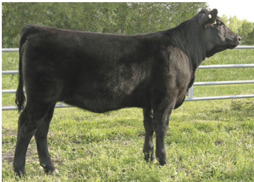
LOT 57 :: CHICO MISS QUALITY 9X