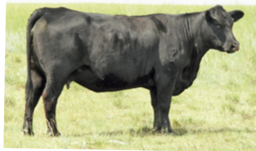
PAHL BLACKCLASS 140U :: DAM OF LOT 1

BW: +4.7 WW: +59 YW: +112 Milk: +29 TM: +59 YG: +54