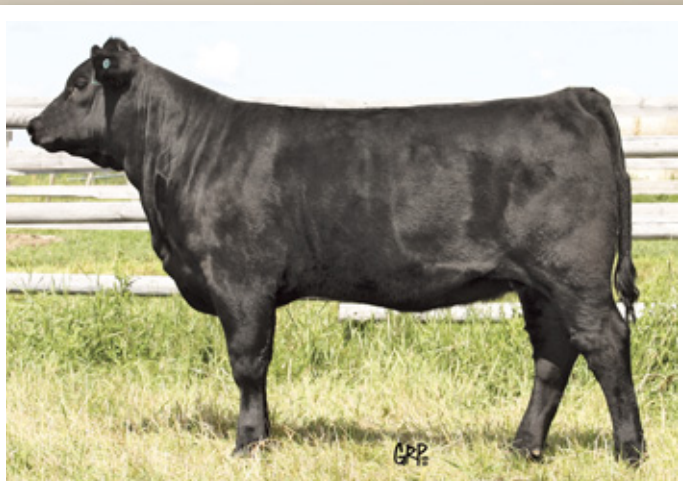
LOT 47 :: BELVIN ERICA 10'10