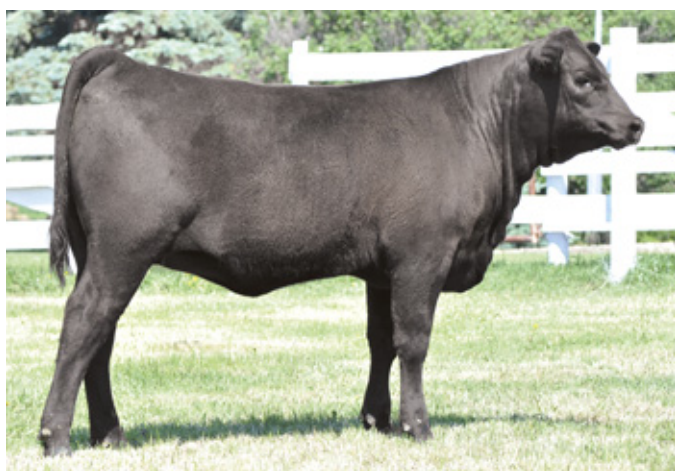
LOT 21 :: REMITALL F ERICA KAY 3X

Bred April 25 and May 15 to SAV Prodigy 8101. Preg checked safe to May 15 breeding.