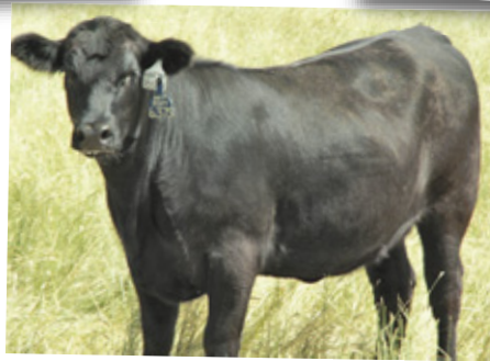
LOT 8 :: PAHL 25E TIBBIE 186W