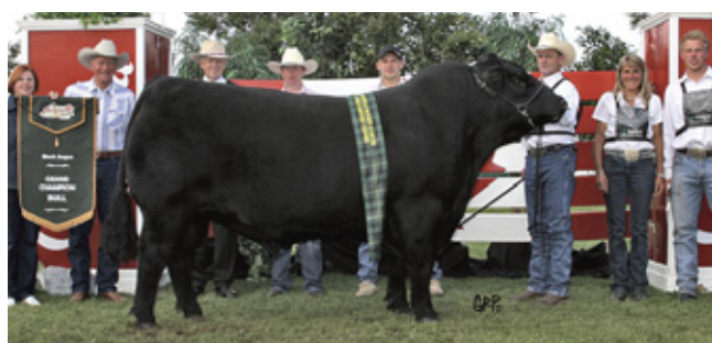
HF TIGER 5T :: GRAND CHAMPION BULL 2009 WAF

HF Tiger 5T was the Grand Champion Bull at the World Angus Forum & Supreme Champion at both Farmfair and Agribition 2009.