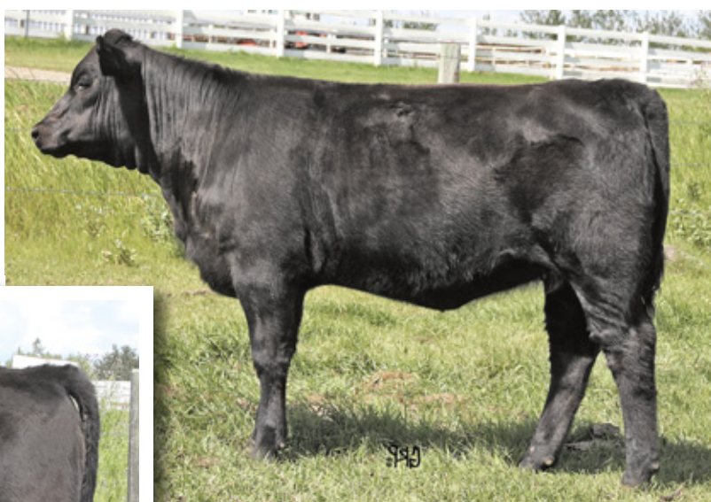
LOT 26 :: LORENZ CAROLINE 14X