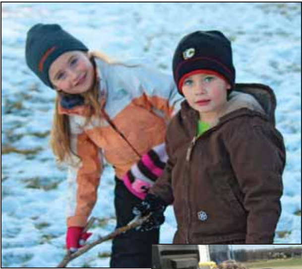
The Next Generation