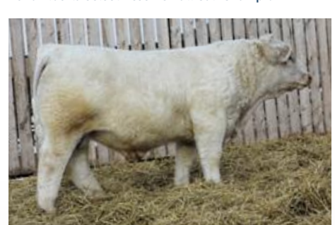
CML HEISMAN 413B

If the buyer wishes to have this bull shown in 2017, we would like to keep him and have him in our 2017 show string. Please feel free to call for details.