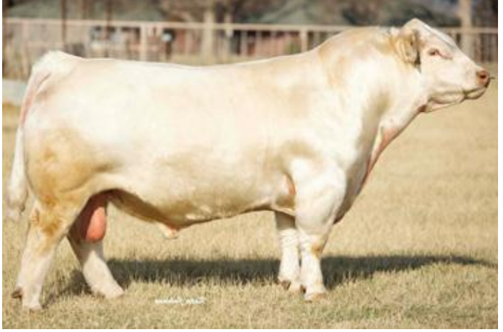
CML DIABLO 2X, Sire of Lot 28