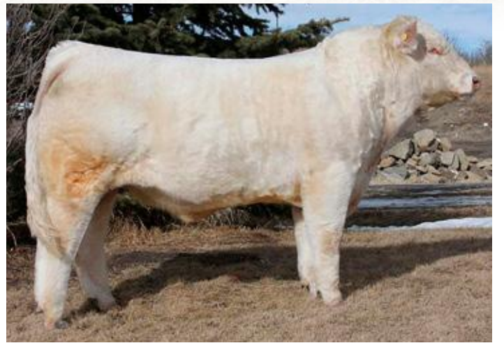
ACES WILD 1Z, Sire of Lot 26 & 27

We used Aces Wild on some of our yearling heifers sired by Pastor and are very pleased with the results. The dam of this bull is a full sister to CML Touchdown 414B, CML Heisman 413B and CML Exacta 514C, all high sellers in our last 2 sales.