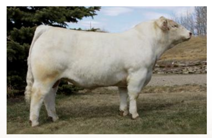
CML GUNSLINGER 410B 7 sons sell in the sale

When people see CML Stubby 666D the most common used word is TANK. This bull is a TANK. He is very moderate framed but you cannot put any more thickness, depth and guts in a bull than you will find in CML Stubby 666D. When you finish admiring Stubby for his tremendous thickness, easy fleshing ability and quiet disposition, and you look at his pedigree, you will find that his dam is the two time Agribition Champion and 2015 RBC Agribition Supreme Champion Female PZC TR Desirae 012. His sire is CML Gunslinger 410D who was the $30,000 son of Gerrard Pastor out of the legendary Target Pld Ginny 40P who sold to Wells Charolais, SD, in our 2015 sale.