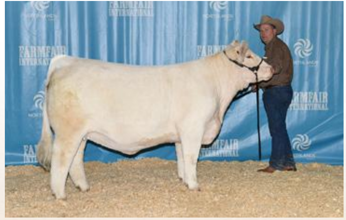
CML DESIRAE 558C 2016 Olds Fall Classic Reserve Champion Female 2016 Farmfair Reserve Junior Champion Female