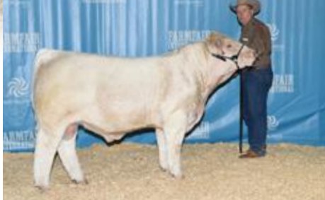
CML ENVY 626D, 2016 Farmfair Bull Calf Champion & 2016 Alberta Select Reserve Bull Calf Champion

1 2016 FARMFAIR BULL CALF CHAMPION & 2016 ALBERTA SELECT RESERVE BULL CALF CHAMPION