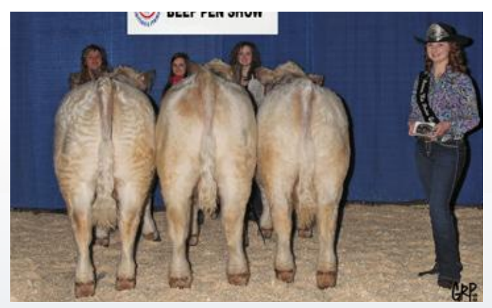
2014 MEDICINE HAT PEN SHOW, RESERVE CHAMPION PEN OF BULLS All sons of Pastor