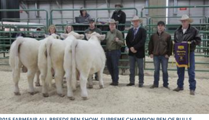
2015 FARMFAIR ALL BREEDS PEN SHOW, SUPREME CHAMPION PEN OF BULLS 3 full brothers sired by Pastor out of CML Wilma 3S

The first offspring from Pastor were the highlight bulls in our 2015 and 2016 bull sales. We would like to thank the breeders that selected his offspring for their breeding programs. We are very excited to see what you think of the third calf crop sired by Pastor, the high selling Charolais bull in Canada in 2013. When we first saw Pastor as a yearling, we were impressed with his performance, tremendous hair coat and his highly productive mother. We purchased him to give us more performance in our program and he has definitely done that! The Pastor calves have more hair than any other sire we have used. The consistency in his calves is impressive as you will see when you go through the pens on sale day. We feel that Pastor has passed the final test of being a great breeding bull as you will see the results in this sale of the first of his daughters have produced some of the feature lots in this years sale. They have beautiful udders and lots of milk and will make up the foundation of our herd heading forward.