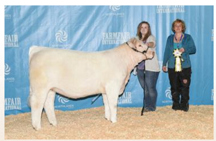
CML DESIRAE 659D, Full Sister to Lot 2 2016 Farmfair Legends of the Fall Charolais Heifer Calf Champion 2016 Farmfair Heifer Calf Champion

It was indeed an honor to have Desirae and her 2015 heifer calf sired by CML Distinction 318A selected as the RBC Supreme Champion Female of the 2015 Agribition Show. This daughter of CML Diablo 2X is just beginning to show the Charolais breed what she is capable of producing. Her first calf sired by Gerrard Pastor 35Z is a standout in our 2 year old heifer pen. CML Desirae 558C, the 2015 heifer calf sired by CML Distinction 318A that was at her side this past fall was admired by cattlemen from all different breeds.